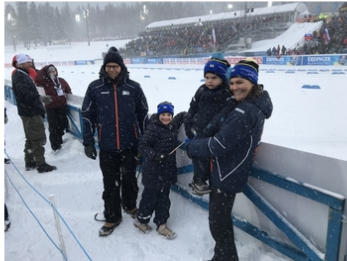
The Royal Family