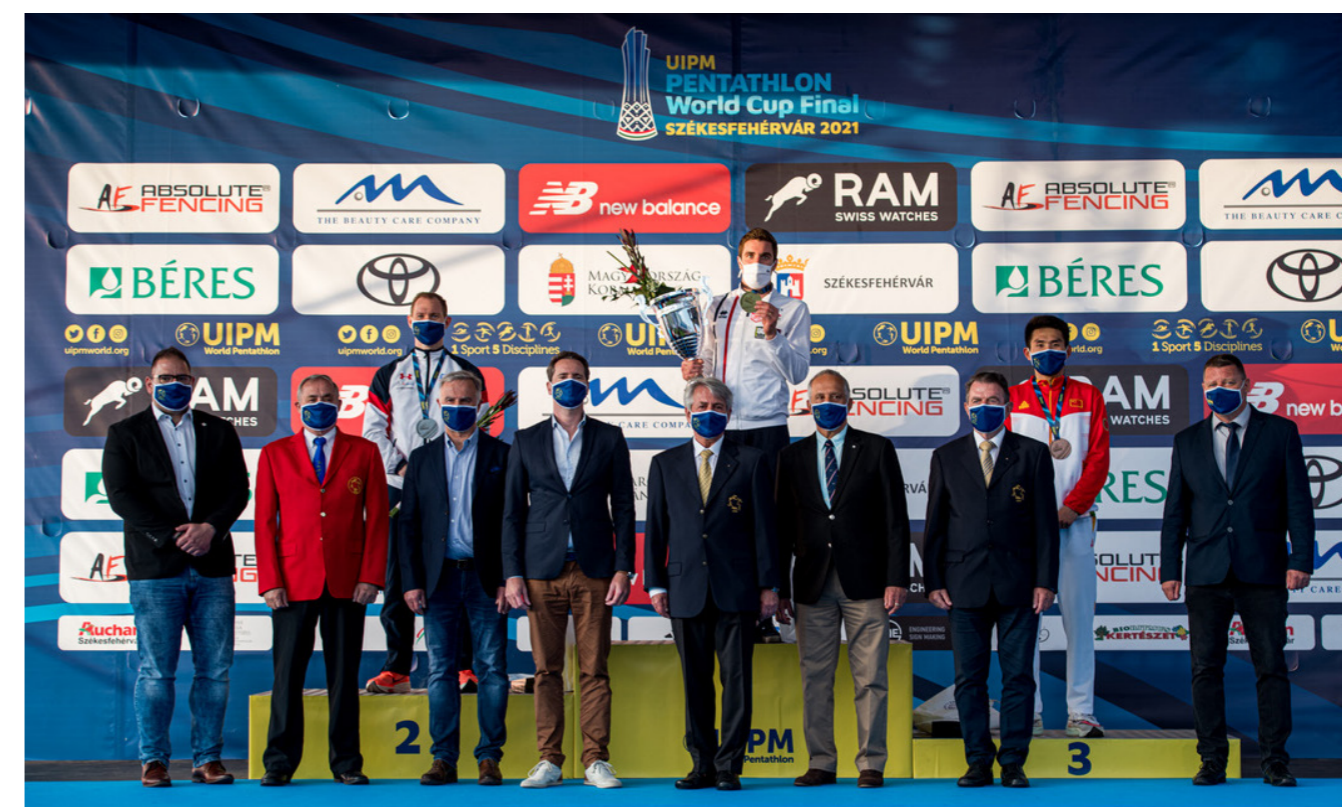
Men's Individual podium at the UIPM 2021 Pentathlon World Cup Final in Szekesfehevar (HUN)