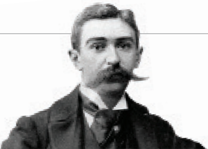
Baron Pierre de Coubertin

“The Modern Pentathlon event would test a man’s moral qualities as much as his physical resources and skills, producing thereby the ideal, complete athlete.”