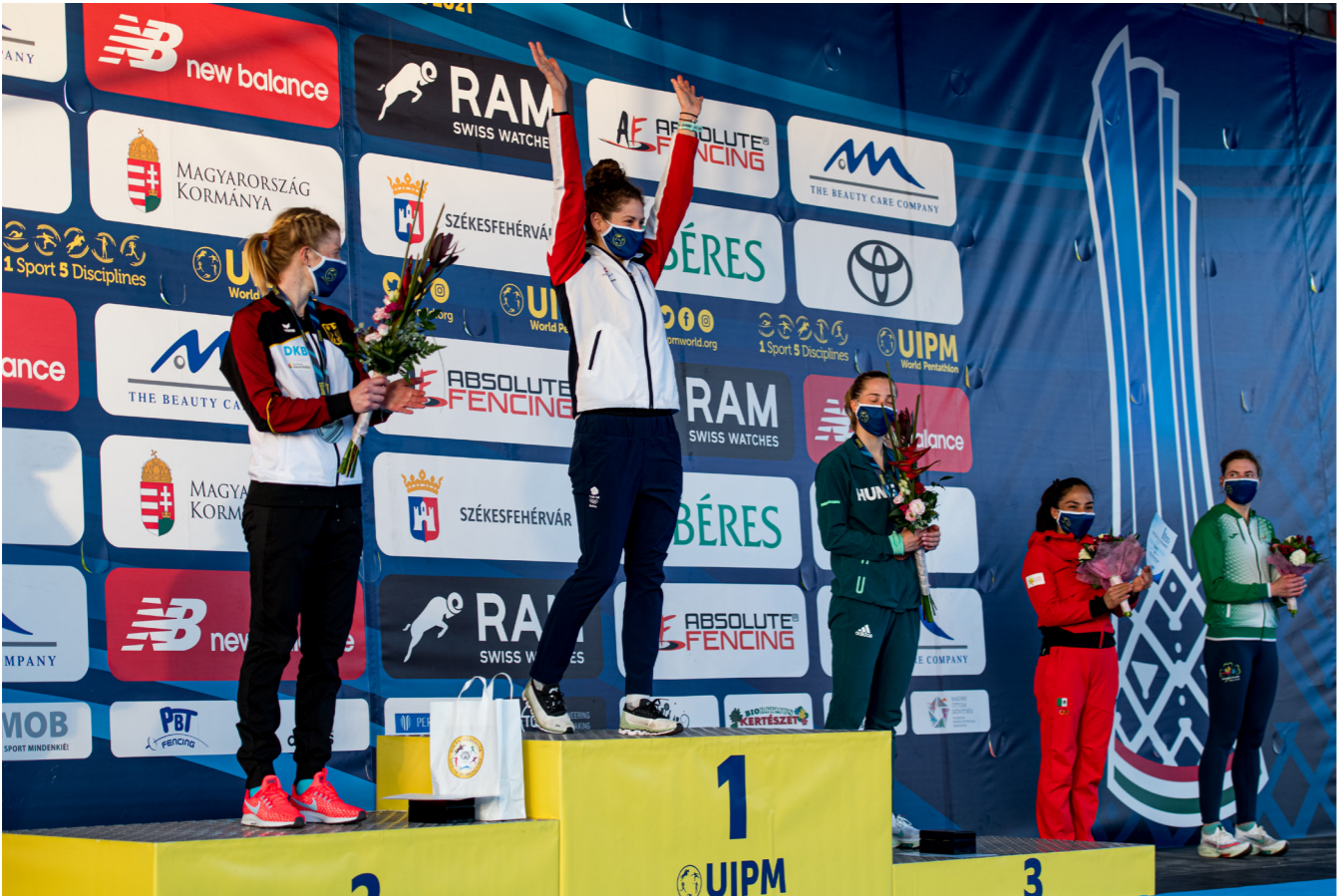
Gold medalist Kate French (GBR) stands atop the podium at the end of the Women's Final