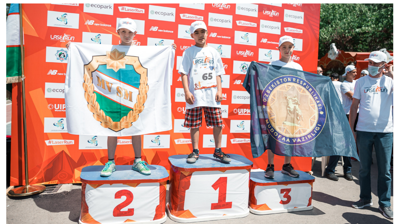
Youth athletes stand proudly on the podium during the first GLRCT in Tashkent (UZB)

Just a few weeks after the graduation of 11 coaches at Level 1 of the UIPM Coaching Certification Programme