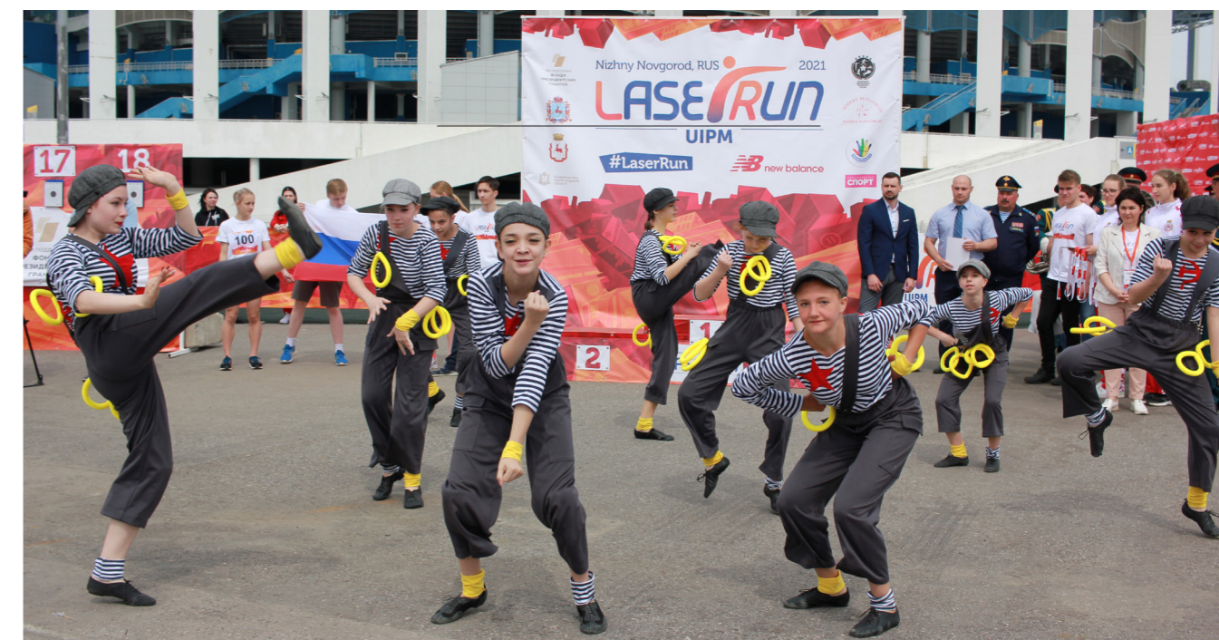
A cultural display by dancers lights up the latest GLRCT in Nizhny Novgorod (RUS)

The GLRCT was held six weeks before one of the highlights of the 2021 season, the European Modern Pentathlon Championships, which will be held at the Nizhny Novgorod Stadium from July 4-12. The schedule will include Laser Run finals involving the five strongest athletes from each age category from the event on May 23.