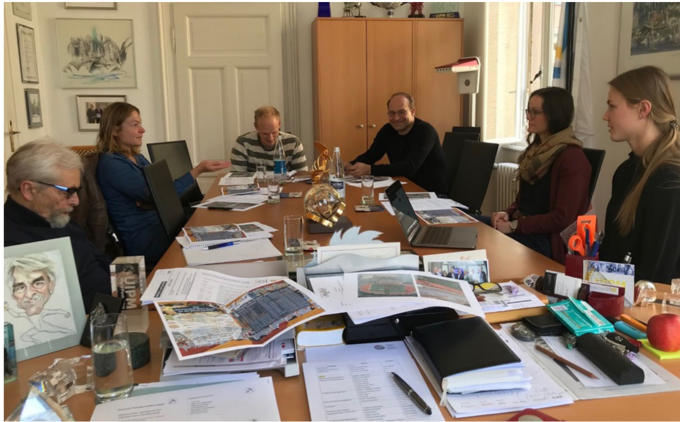
A kick-off meeting with the organising team of the UIPM 2021 Global Laser Run City Tour to be held in Darmstadt (GER) in September