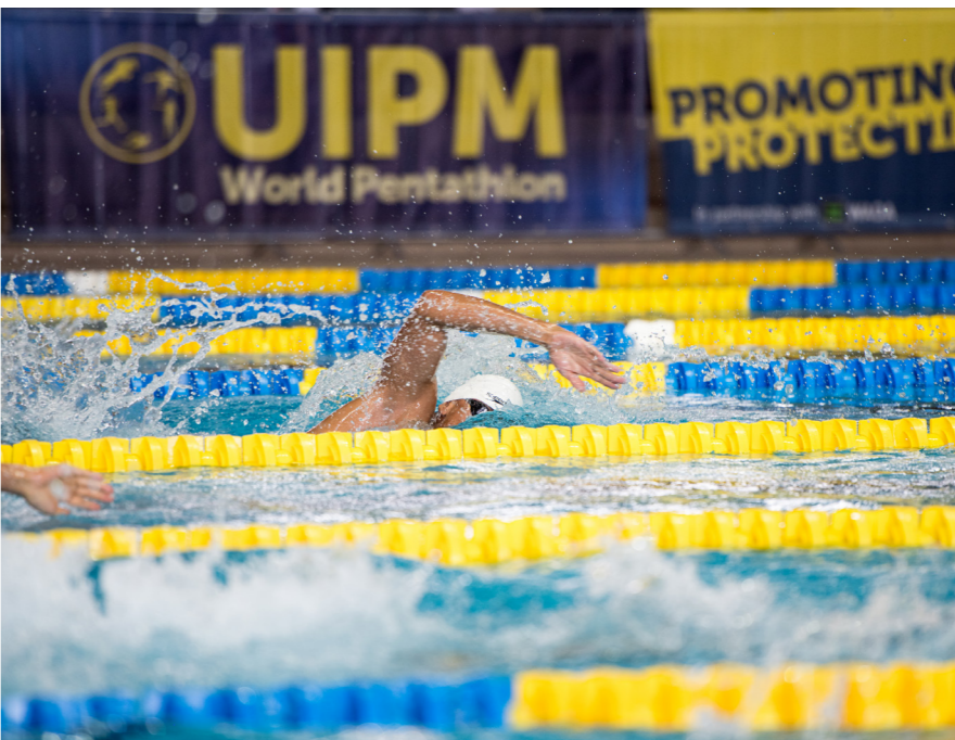
Action from the Swimming pool as the Men's Final gets under way

On the evidence of this competition, he is focused on erasing both of those memories and creating a new career-