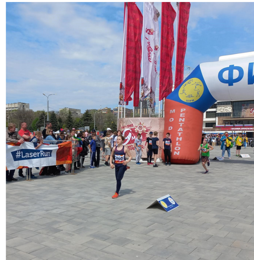
Action from the GLRCT in Rostov-on-Don (RUS)

More than 250 athletes gathered on Workers' Day (May 1) in the main theatre square of Rostov-on-Don for the