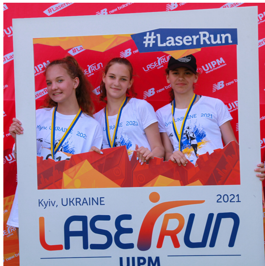
Three female participants pose for a #LaserRun selfie after competing in the latest Global Laser Run City Tour in Kiev (UKR)