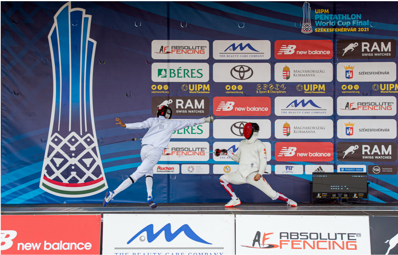
Action from the Fencing Bonus Round as the world's leading male pentathletes compete for additional points

They started only 1sec apart and Prades (FRA) had a healthy lead going into the final shoot, but he froze and spent