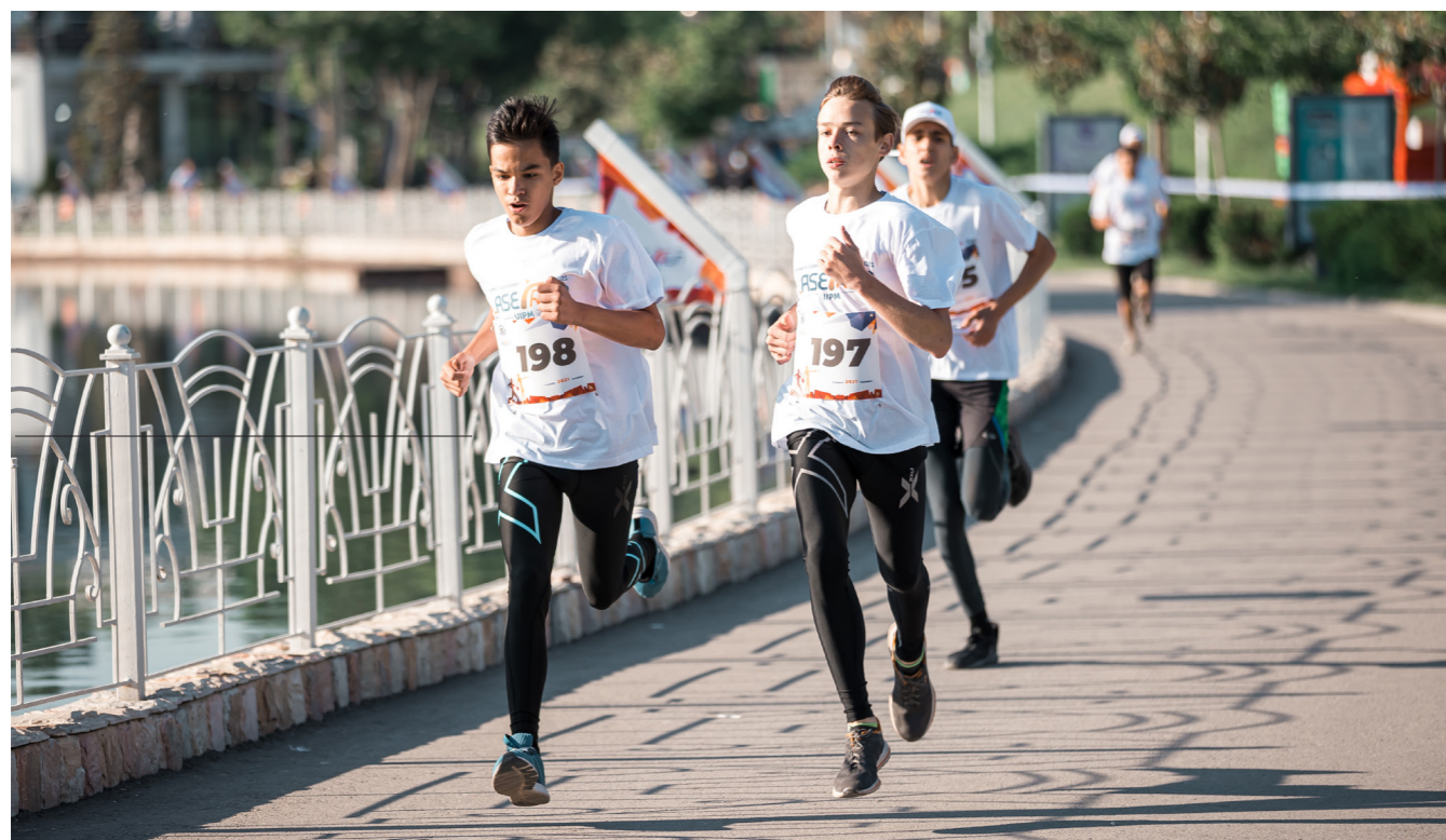
Youth athletes compete fiercely for medals in the Central Ecopark of Tashkent (UZB)

(CCP), on May 15, the Central Ecopark of Tashkent named after Zahiriddin Babur hosted more than 350 people for a Global Laser Run City Tour.