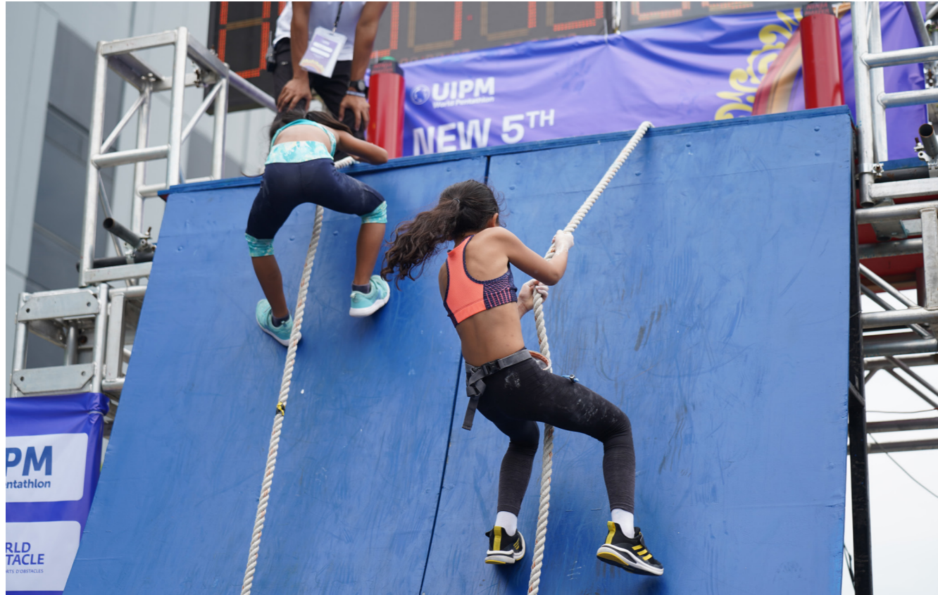
Two female youth athletes push themselves to finish the course strongly on the final obstacle, the warped wall