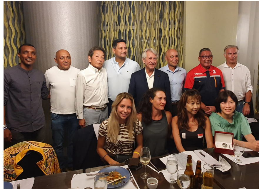
The UIPM President hosts a farewell dinner with fellow officials, stakeholders and athletes who helped to make Test Event II such a success