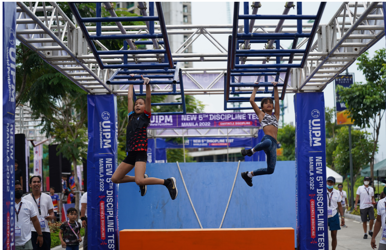
Two young female athletes race on the bespoke Obstacle Discipline course set up in Manila (PHI) for New Pentathlon Discipline Test Event II