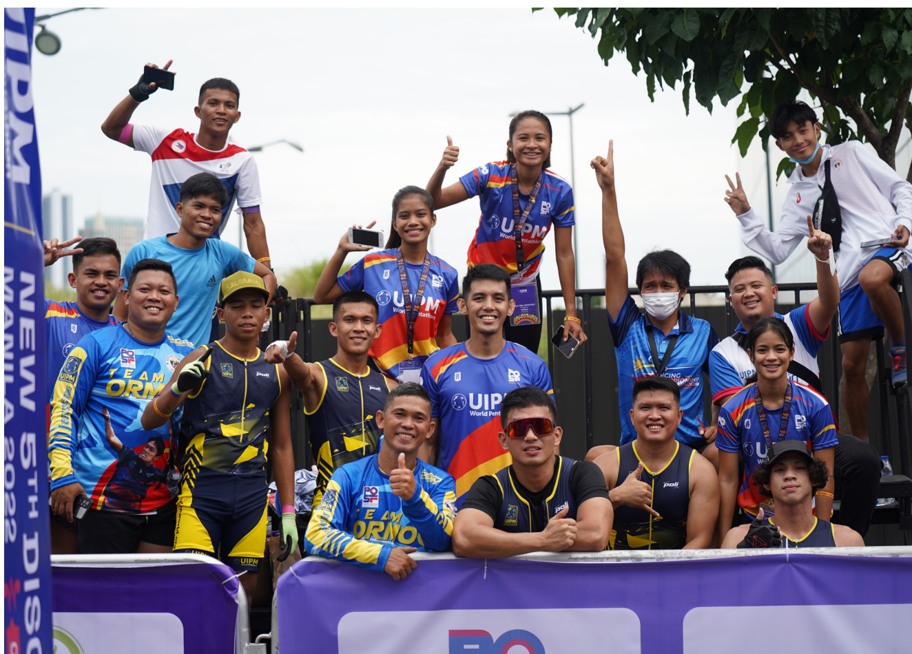
Happy participants in Manila (PHI) show their enjoyment of the new Obstacle Discipline proposed for integration with Modern Pentathlon after Paris 2024