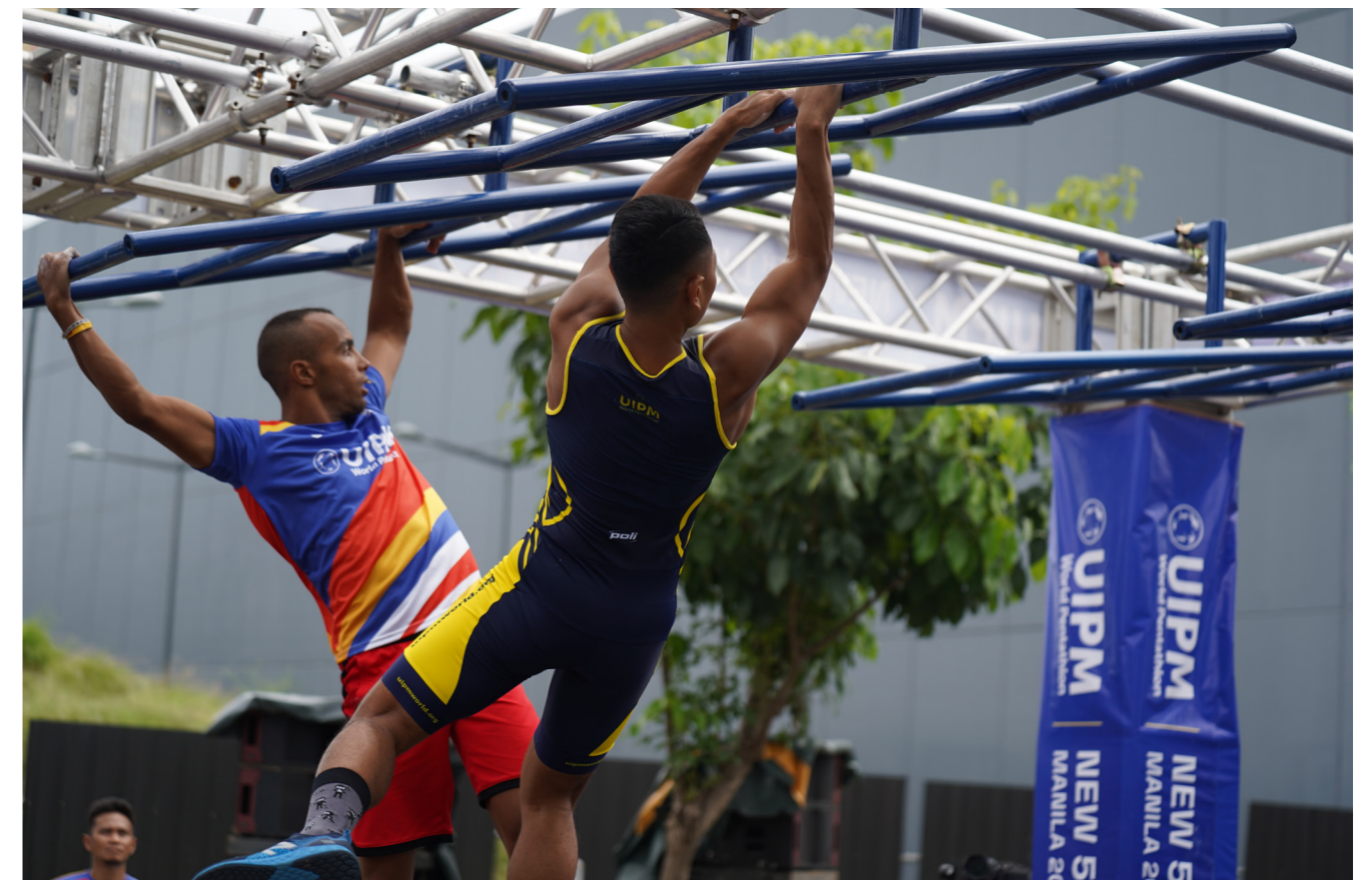
After a practice day, male and female athletes of all ages had opportunities to race on a bespoke course comprised of 10 obstacles

"We are very happy with the direction of this testing phase for Obstacle Discipline and we look forward now to the next Test Event in Italy, created especially for our youth athletes so that all generations of stakeholders can have experience of this concept and tell us their views. We are refining our vision for this new discipline based on what athletes and coaches are telling us after each competition.