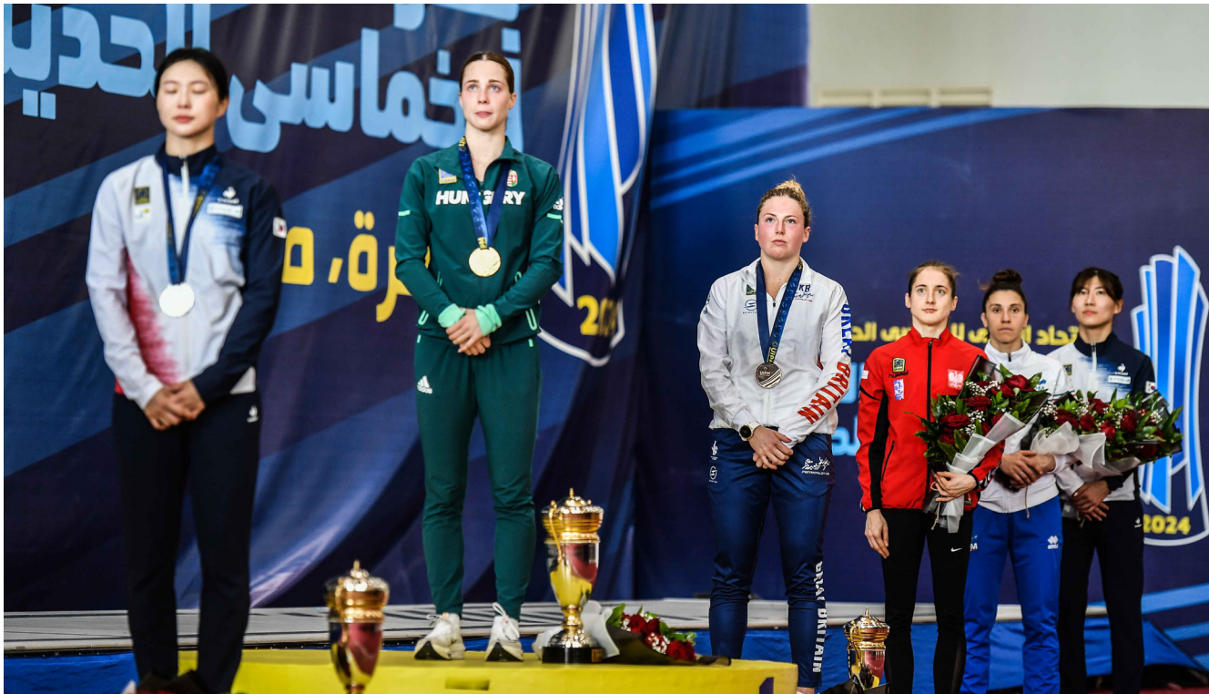
Prize money for the athletes who perform best at major UIPM events increased with immediate effect ahead of UIPM 2024 Pentathlon World Cup Cairo

During its meeting on March 7, the UIPM Executive Board agreed to sanction an almost 20% increase in prize money for athletes competing in UIPM competitions with immediate effect.