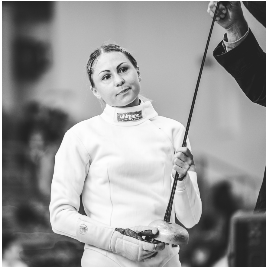
Laura Asadauskaite (LTU) is on track to make history by competing at a fifth Olympics at Paris 2024

This, after all, is an Olympic year, which is an Asadauskaite kinda year. So of course, not the time for distractions. Paris 2024 looms over the entire world of elite Pentathlon yet you sense it looms