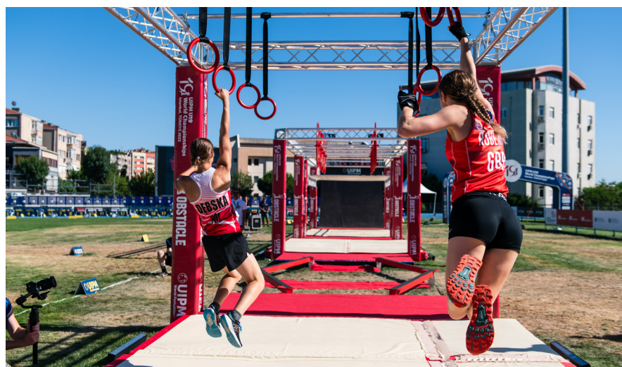
Obstacle discipline was added to the UIPM Statutes and Competition Rules in November 2022.

The OLR World Tour will not only offer new entry points to UIPM Sports