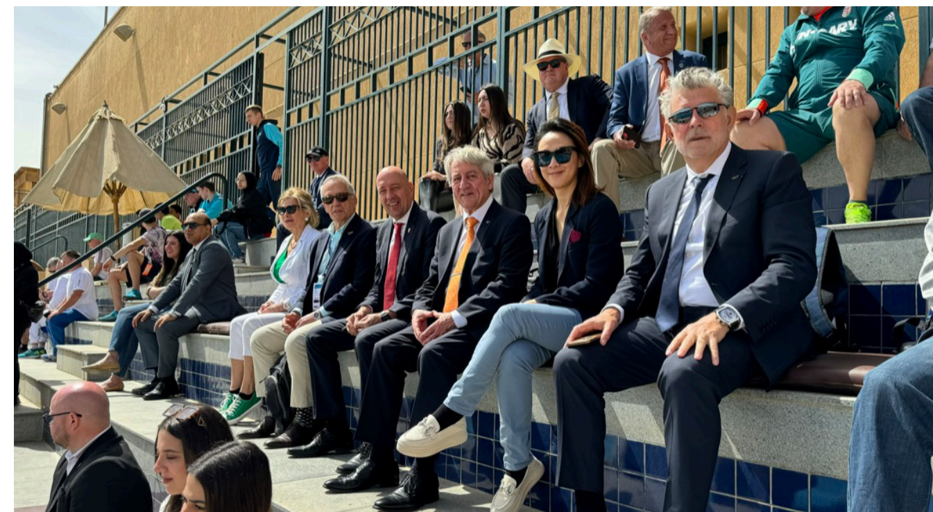
UIPM EB members watch the opening event of the season, UIPM 2024 Pentathlon World Cup Cairo, where 45 nations were represented.