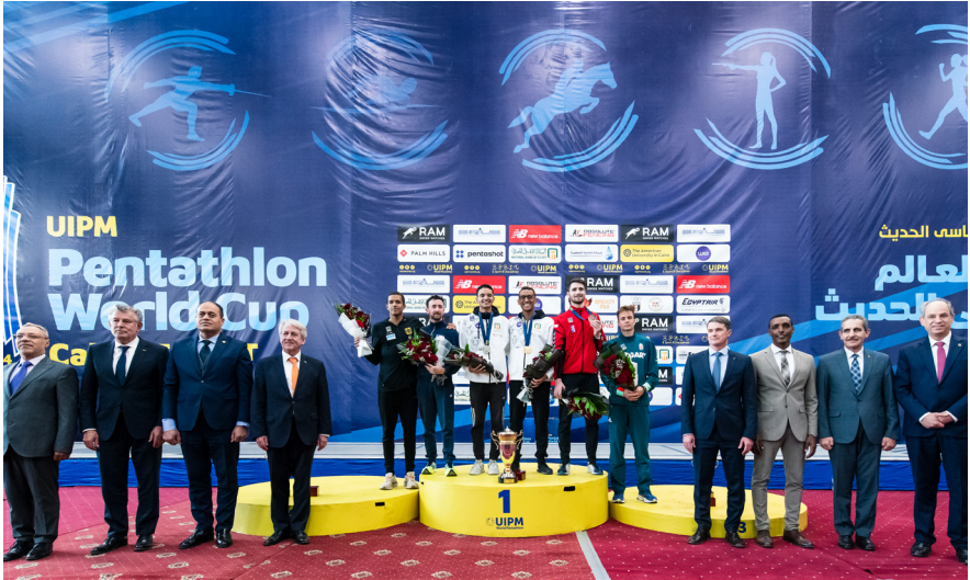
The extended podium from the Men's Final after UIPM 2024 World Cup Cairo.