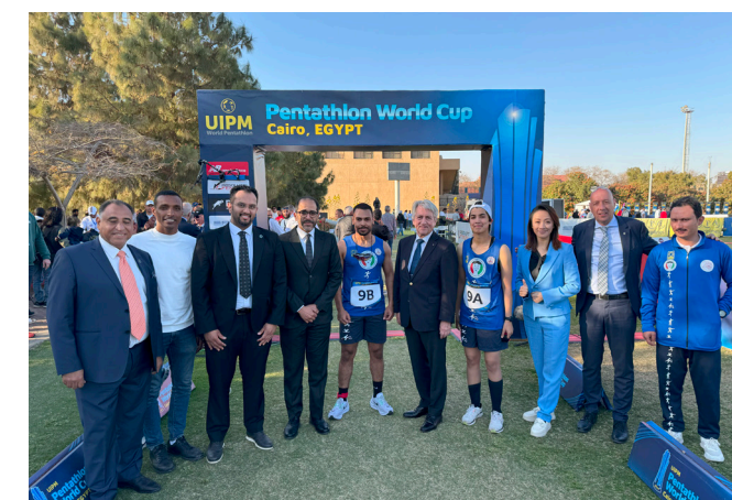
UIPM leadership welcomes the Mixed Relay team from the newly-installed Kuwait Modern Pentathlon Federation.