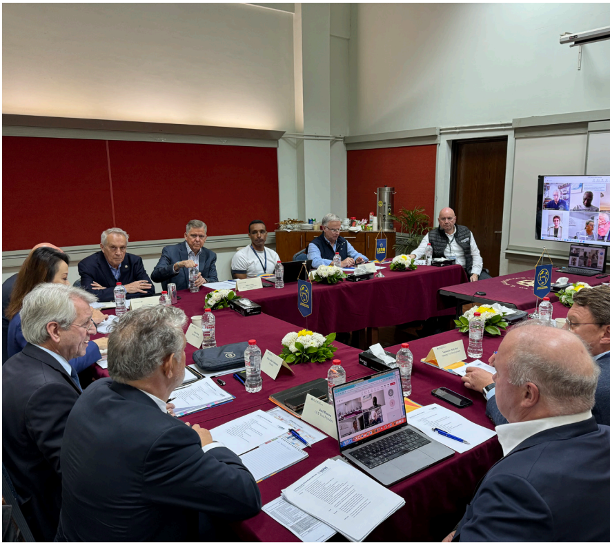
The UIPM Executive Board met in a hybrid format with so many members present in Cairo (EGY)