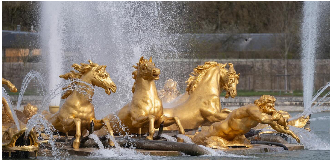
The Sun God sculpture at the Palace of Versailles has been given a refresh ahead of Paris 2024 events this summer.