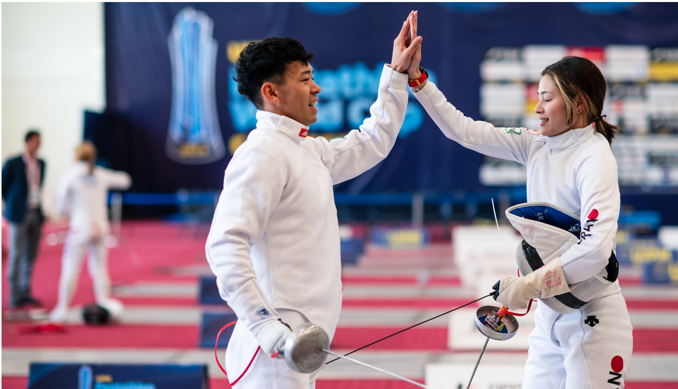
Teammates from Japan enjoy a victory during the Fencing discipline as the Mixed Relay brings the curtain down on UIPM 2024 Pentathlon World Cup Cairo.