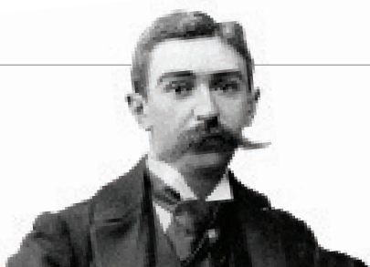
Baron Pierre de Coubertin

The latest UIPM World Rankings, World Cup Rankings and Olympic Games Rankings are all available at www.pentathlon.org