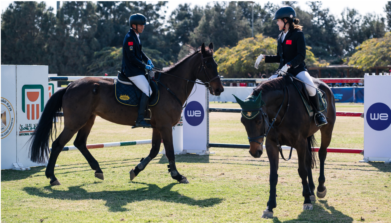
The Mixed Relay team from China get to grips with their respective horses ahead of the Riding round during the Mixed Relay.

It was a similar story for the host nation but Malak Ismail and Mohamed Elgendy of Egypt left themselves with too much to do and finished 4th.