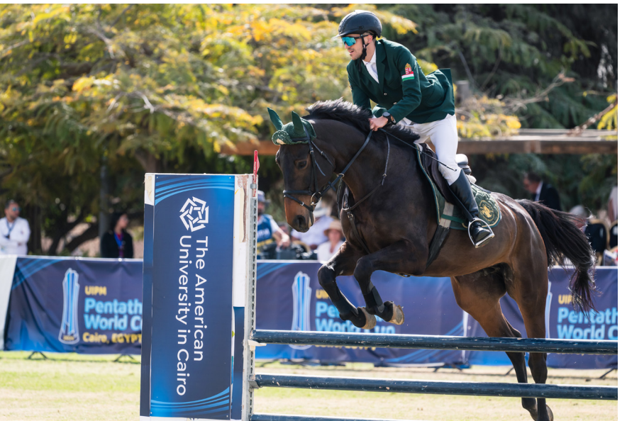
The Men's Final on Super Saturday got underway with some assured Riding performances.