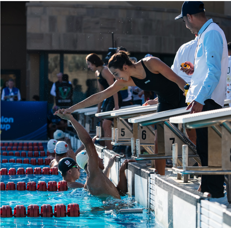
Action from the Mixed Relay Swimming discipline at 2024 Pentathlon World Cup Cairo.

The big move in Swimming paid off for Korea (Seong/Seo) as they made their way through the pack with the day's best Laser Run time of 2:01.05. This enabled them to secure the bronze that was the best they could have expected