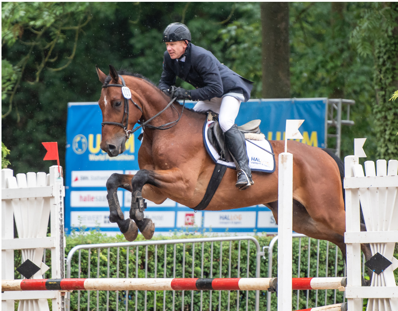
The 2024 edition of the UIPM Masters World Championships will be held in Gyomro (HUN) and will be the last to feature the Riding discipline.

and we always need to give them as much support as possible. I hope this increase in prize money sends a clear message that athletes have the full support of the EB and the movement, and we are happy that the Board voted unanimously for this increase in prize money."