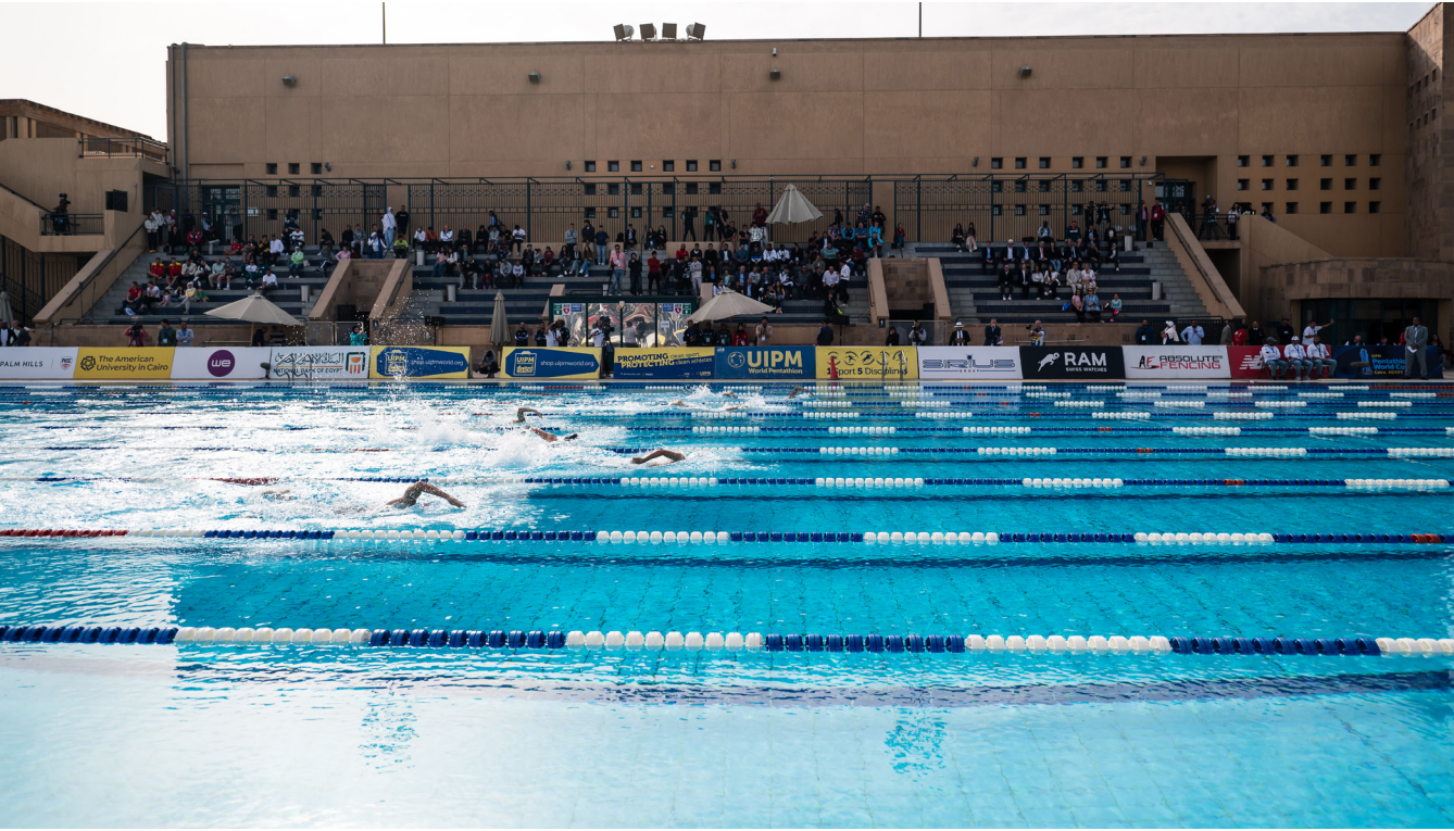
There was plenty to cheer for fans of the host nation as Egyptian athletes proved their pool prowess in the Swimming round of the Men's Final.

The two-time winner used all his experience to stay calm, especially at the shooting range where his last three visits all lasted less than 8sec. An exceptional mastery of the technical and mental aspects of laser shooting allowed him to set off on the final lap