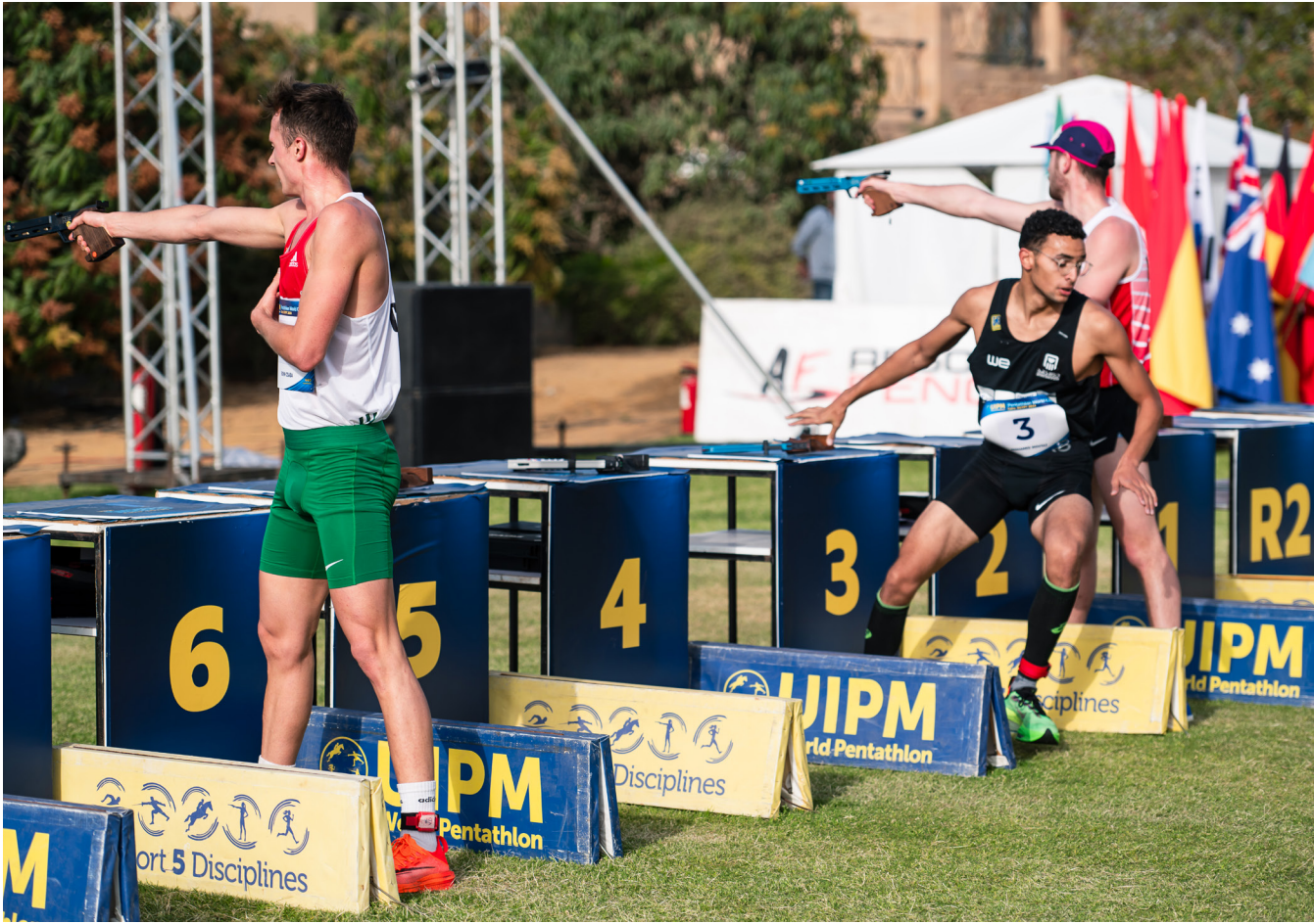
Action from the Shooting range as the Laser Run was the scene of many exciting duels in the Men's Final at UIPM 2024 Pentathlon World Cup Cairo.

with a 56sec cushion that proved to be just enough.