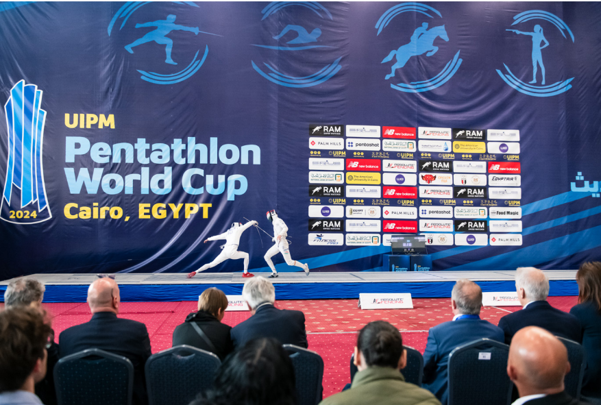
Spectators watch the Fencing Bonus Round during the Men's Final in Cairo.