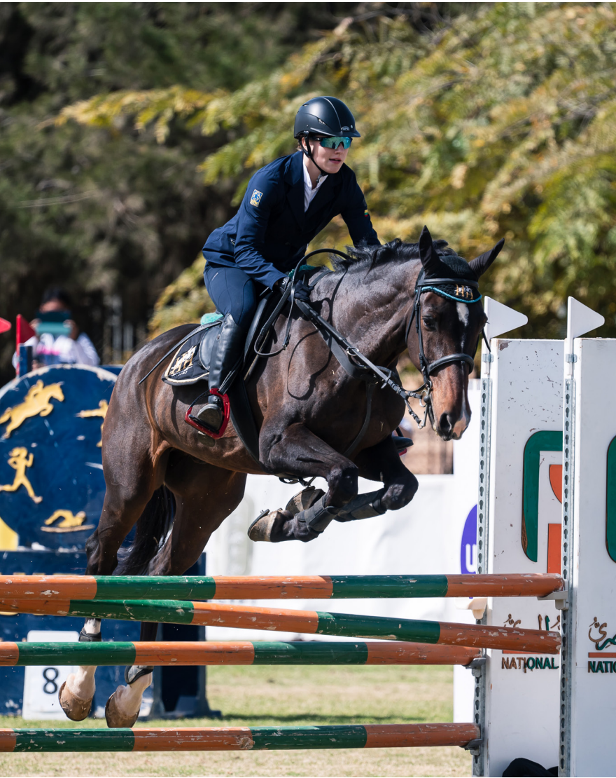
Most of the podium favourites made it safely around the opening Riding event of the year in Cairo.

"I was feeling a little bit more confident in the last shoot, and I focused on that because I knew it was going to be a hard last lap. I'm so pleased to win the first World Cup of the season here in Egypt for a third time."