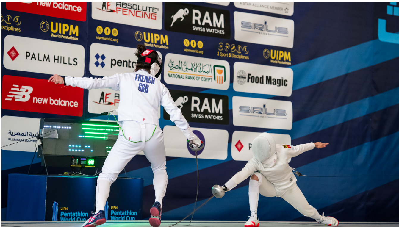
There was congestion in the pack during an all-action Fencing round during the Women's Final at UIPM 2024 Pentathlon World Cup Cairo.