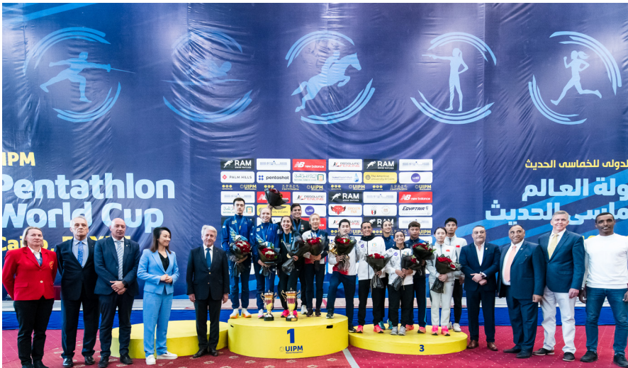
Prize money was introduced for those who finish in places 7-10 at individual World Cup events.