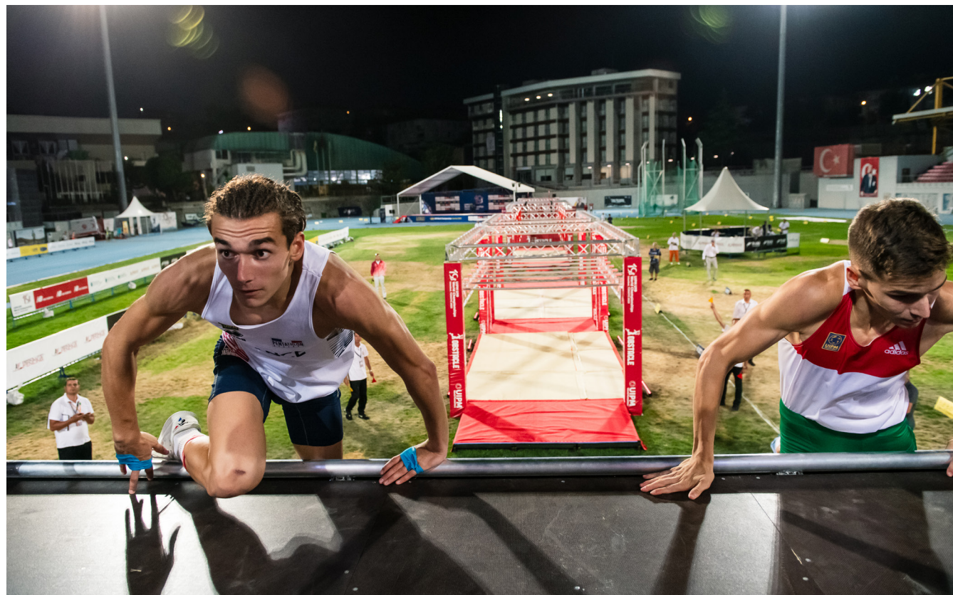
The Obstacle Laser Run Tour (OLR) follows UIPM's successful Global Laser Run City Tour and the Biathlon-Triathlon National Tour initiatives.