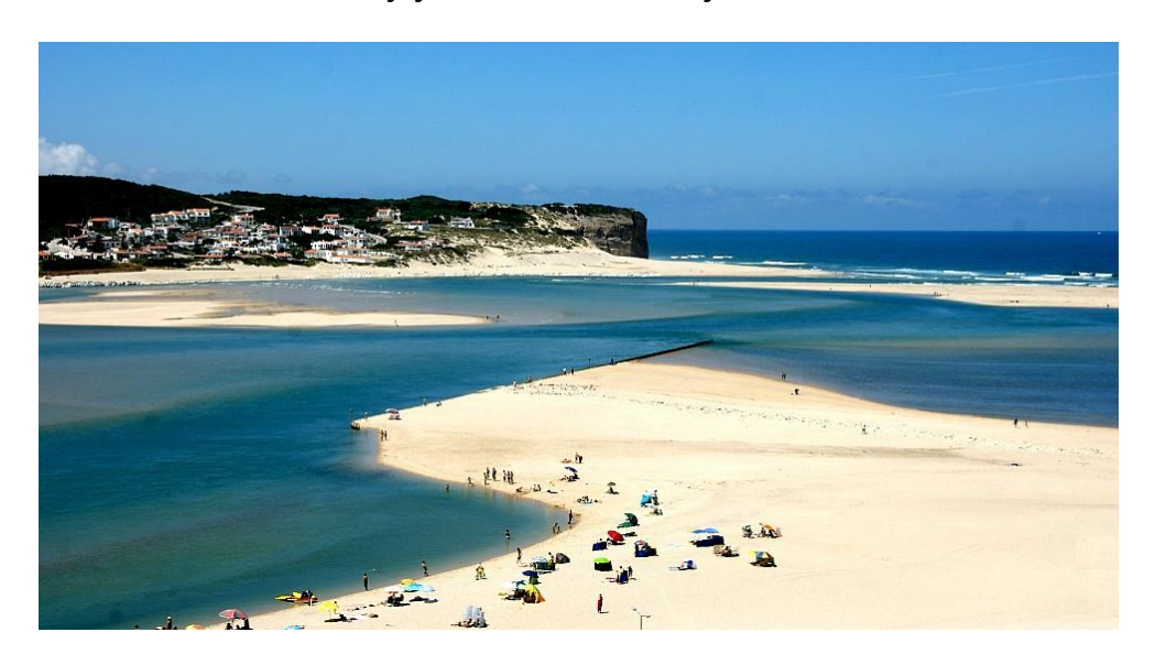
Beautiful beaches are another option on a rest day