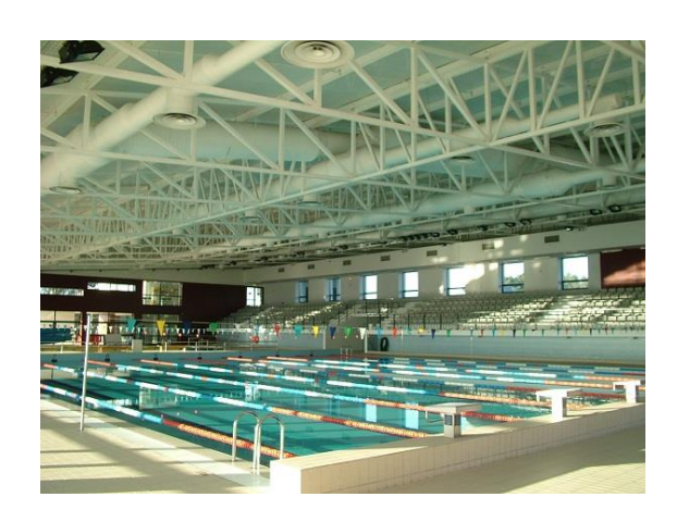
25m indoor pool