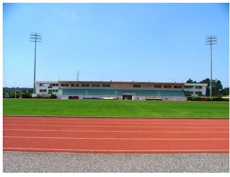
Synthetic Track + Range