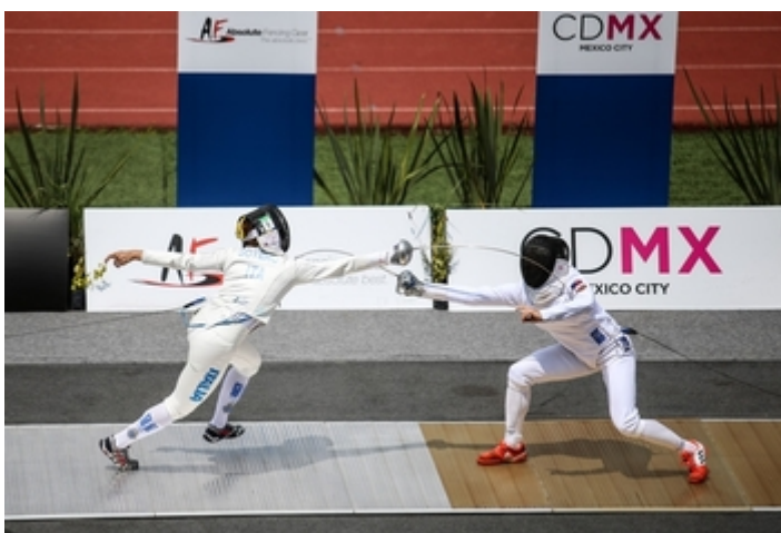
Oteiza (FRA) became European champion this