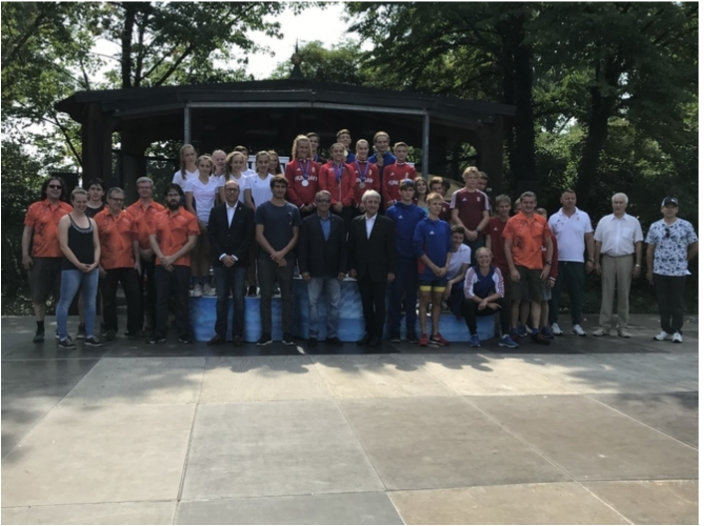
A group photograph of the competitors, officials, volunteers and VIPs at the end of the New Tetrathlon test in Weiden (GER).