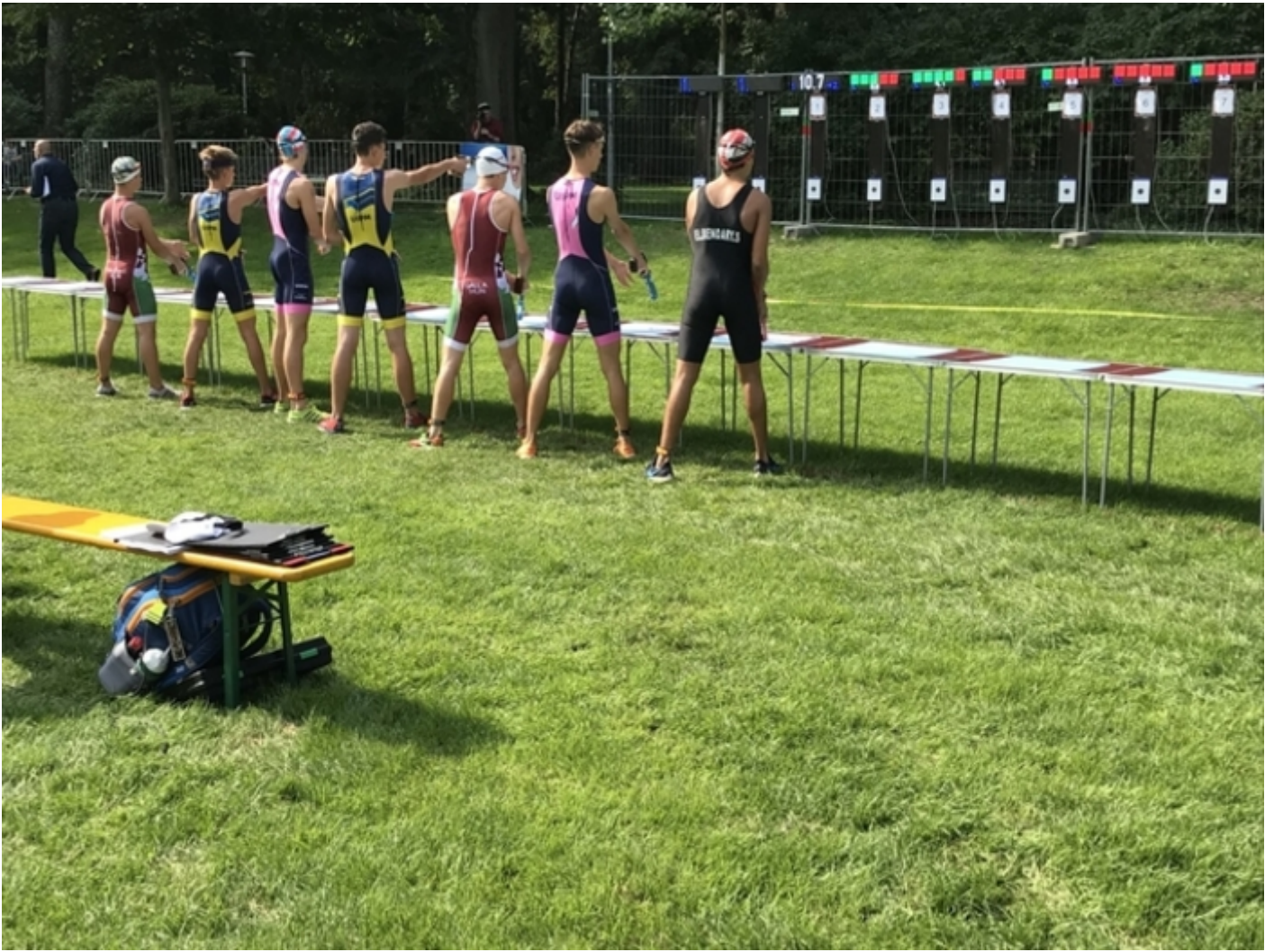
Action from the Swimming and Shooting stages of the New Tetrathlon test event in Weiden (GER)