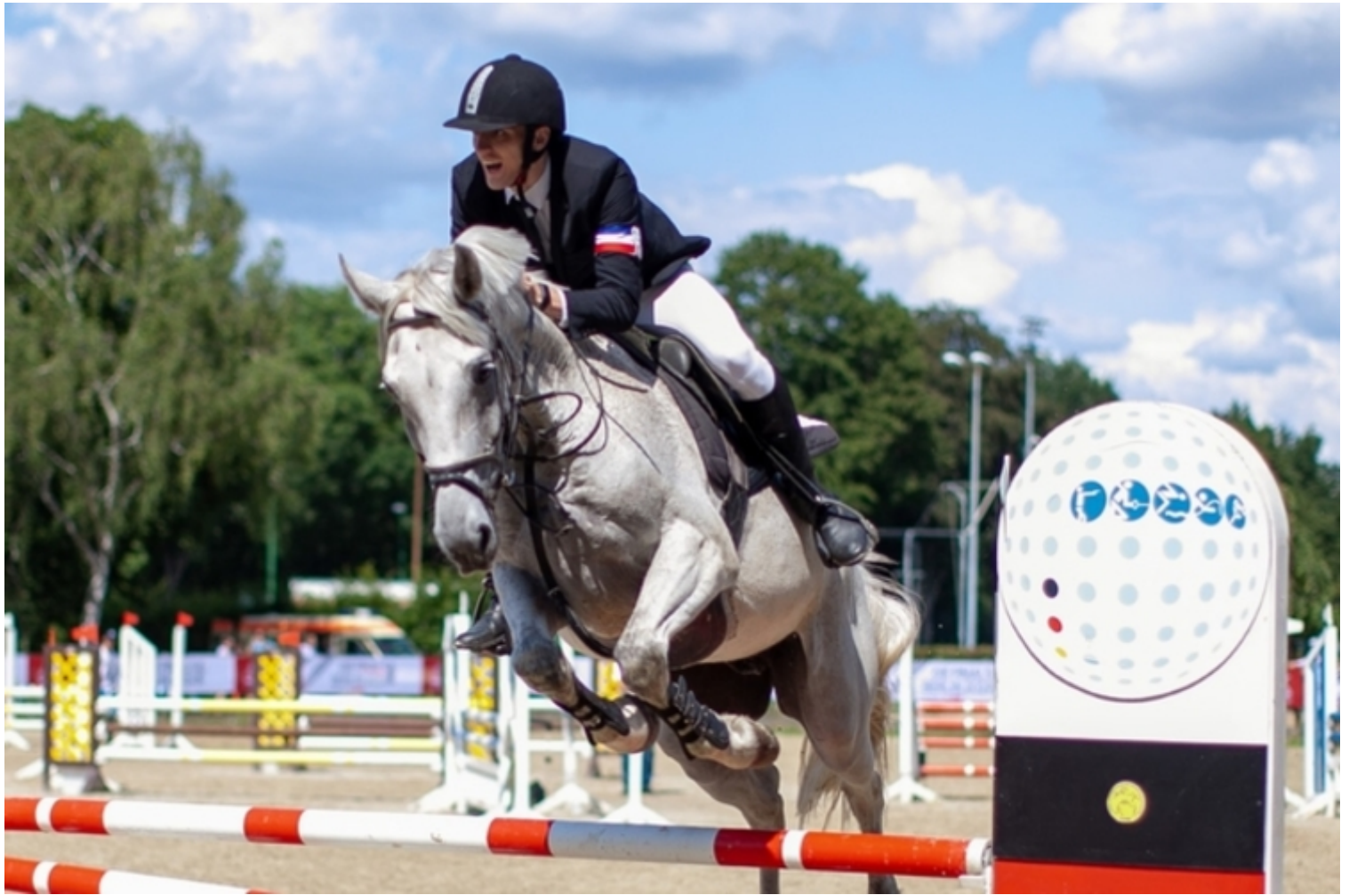
A rider clears an obstacle during the Pentathlon event at “Die Finals” in Berlin (GER)