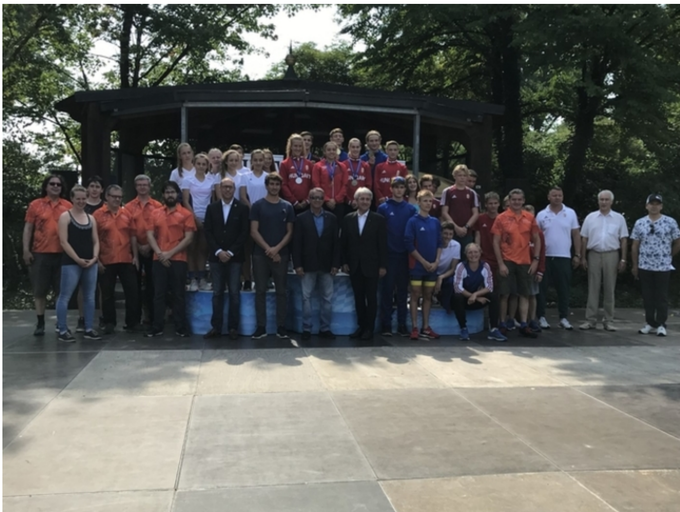
A group photograph of the competitors, officials, volunteers and VIPs at the end of the New Tetrathlon test in Weiden (GER).