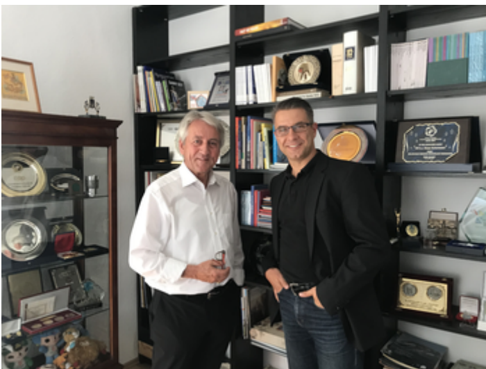
2.) 16.08.2019, Darmstadt, GER