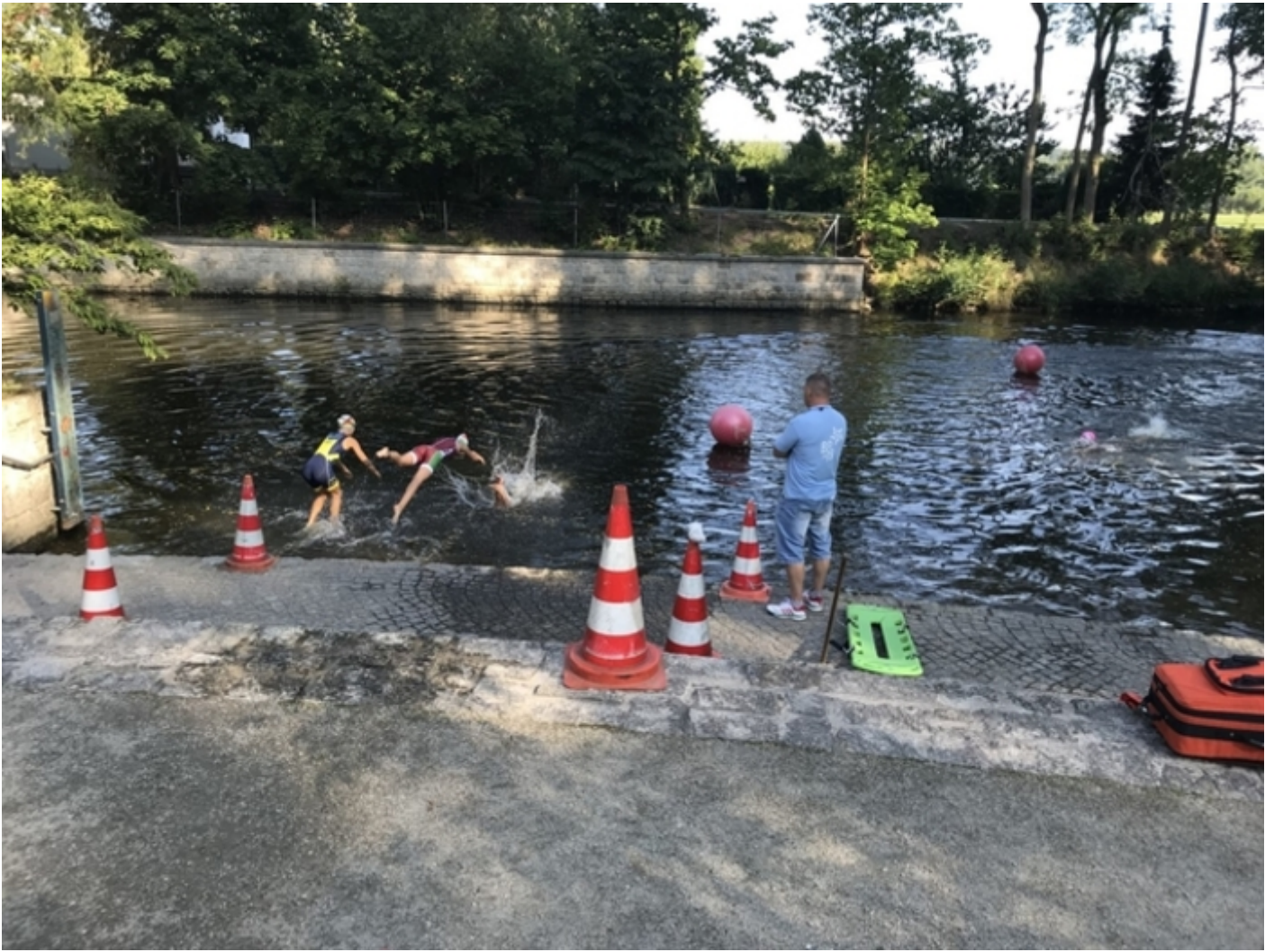
Athletes compete in Fencing (left) and manage the transition from Swimming to Running during the New Tetrathlon test in Weiden (GER)