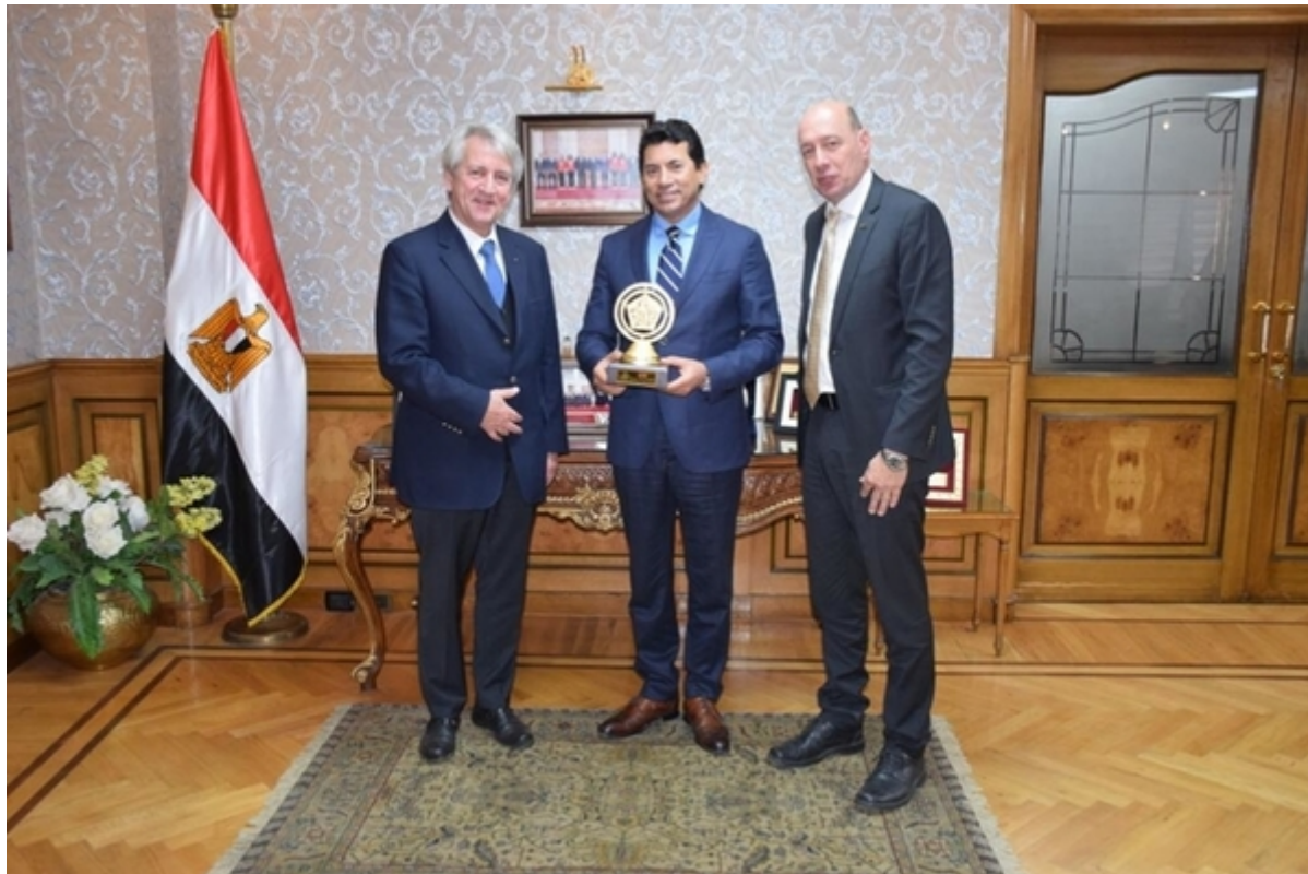
The UIPM and EMPF Presidents with Dr Ashraf Sobhy, the Minister of Youth & Sports