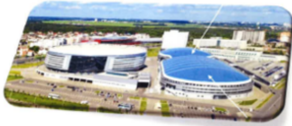
Fencing Ranking Round