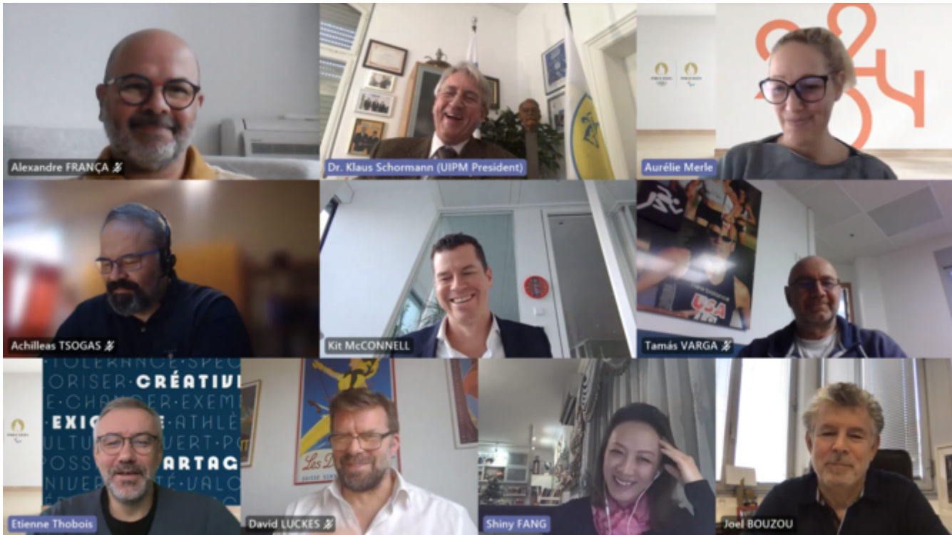
Meeting with Paris 2024 and the International Olympic Committee