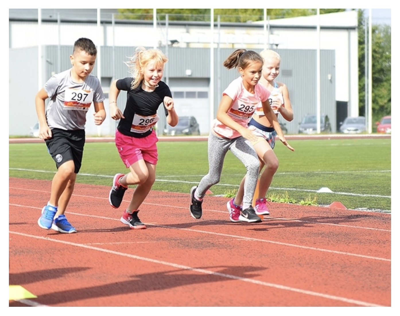
Riga (LAT) opens doors to Baltic neighbours

After successful GLRCTs in 2018 and 2019, Latvia got back on track with a successful event on August 15 that gave young athletes, active pentathletes and Masters the opportunity to test their running-shooting skils.