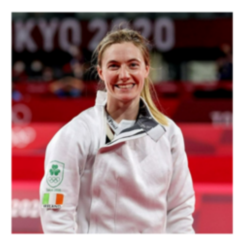
Natalya Coyle World Cup / World Championships Medallist