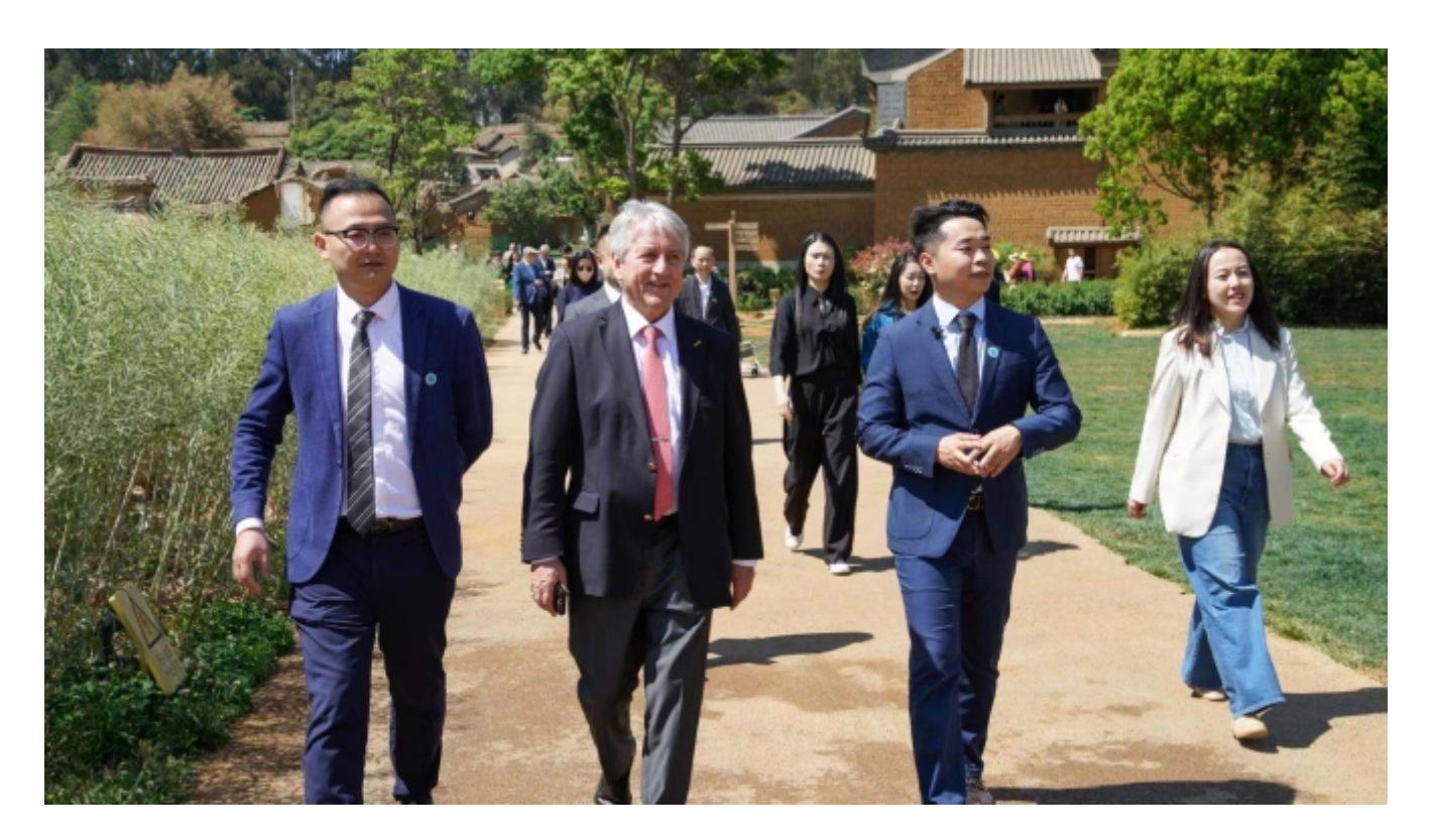
The APDC, which will become a central hub for Modern Pentathlon training and competition in the Asia-Pacific region, forms part of a $6bn government expansion plan for the city of Kunming, and President Dr Schormann inspected large-scale artists' impressions of the urban development.