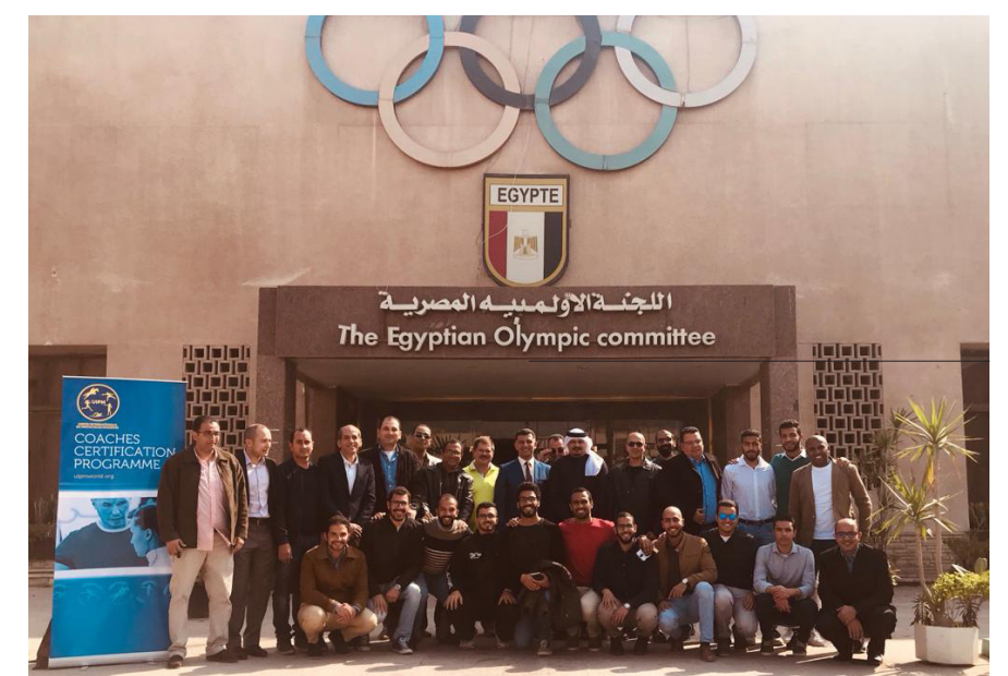
Coaches from four countries attended a CCP Level 2 coaching course in Cairo (EGY)