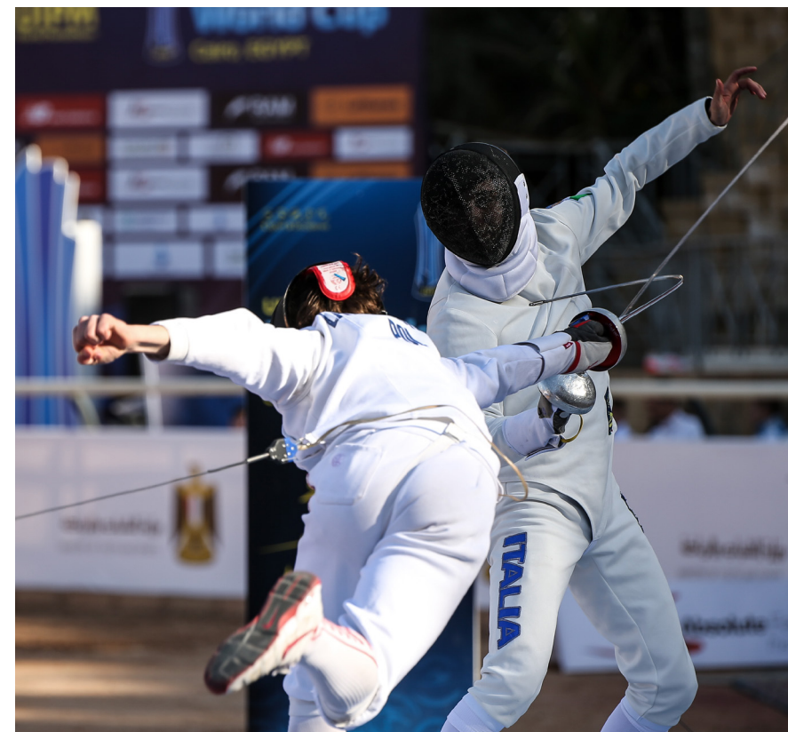
A dramatic lunge scores a hit during the Fencing Bonus Round

"To finish second was awesome. The Egyptian guy was first and everyone was cheering for him and that helped me, because I knew I wasn't going to catch him and I was able to focus on