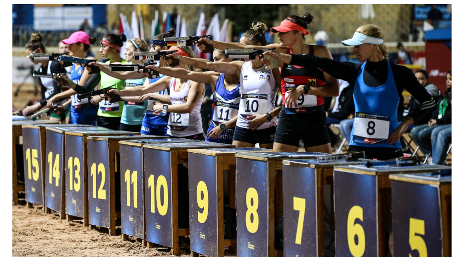
Fierce competition at the range during an exciting Laser Run