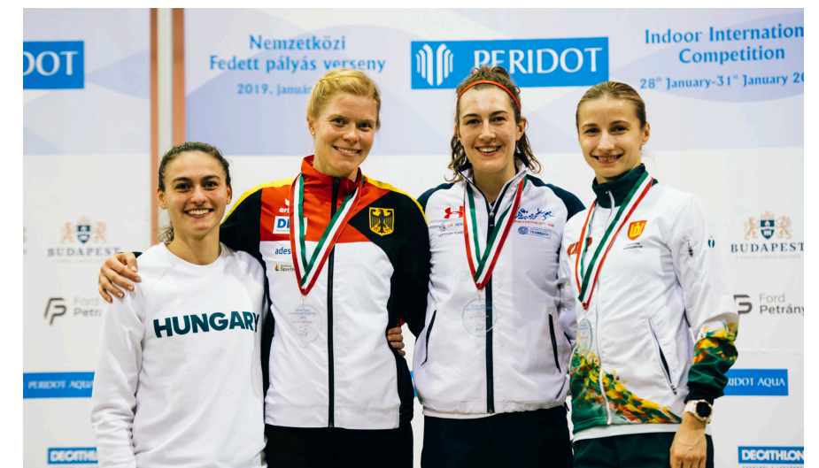
The Women's Individual and (below) Men's Individual podiums at the Budapest Indoor International