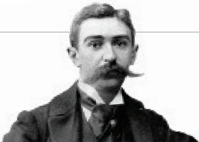
Baron Pierre de Coubertin

"The Modern Pentathlon event would test a man's moral qualities as much as his physical resources and skills, producing thereby the ideal, complete athlete."