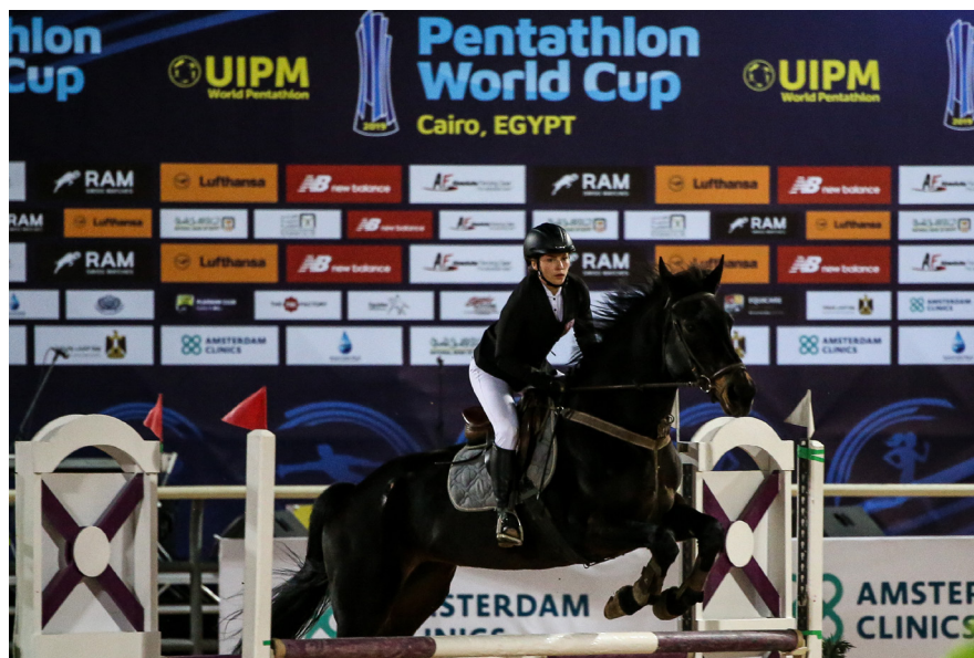
Action from the Riding disciplines of the Mixed Relay at Pentathlon World Cup Cairo