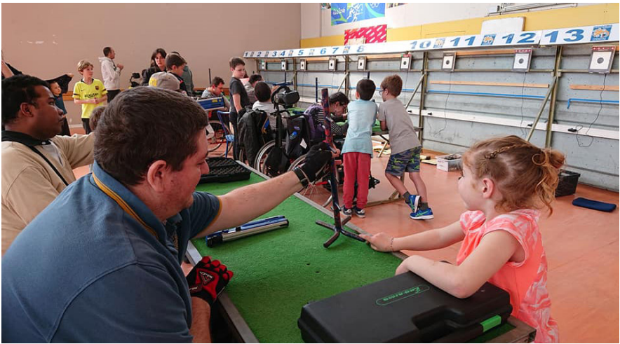
Wheelchair athletes savour the chance to participate in Para Laser Run in France

over France , including the Para Laser Run initiation of the Catalan pentathlon society PMPC 66, who arranged for wheelchair athletes to participate in the sport.