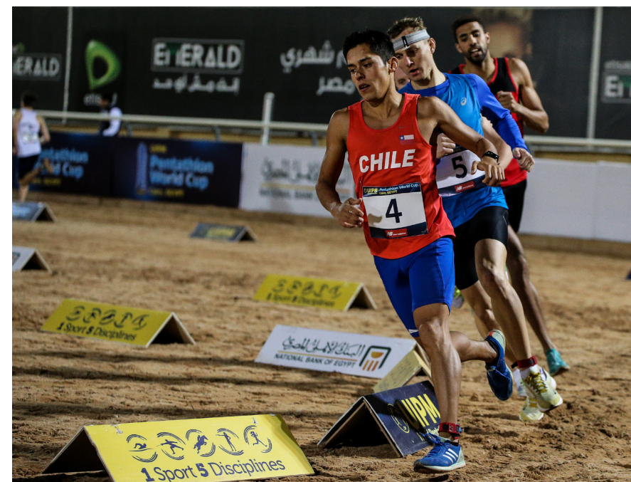
The chasing pack keep up the pressure during the Laser Run at the Platinum Sports Club

myself. It's good to know we are on the right path. I managed to beat some of the top guys today."