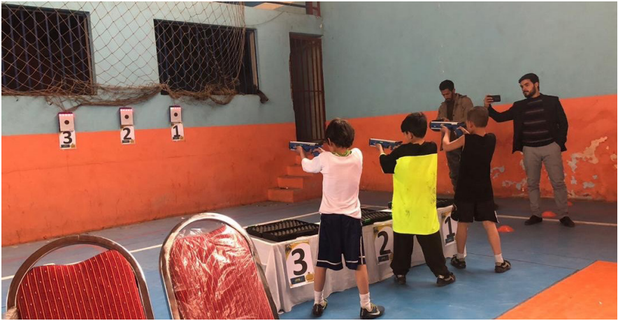
Young male athletes hone their laser shooting in Kabul (AFG)