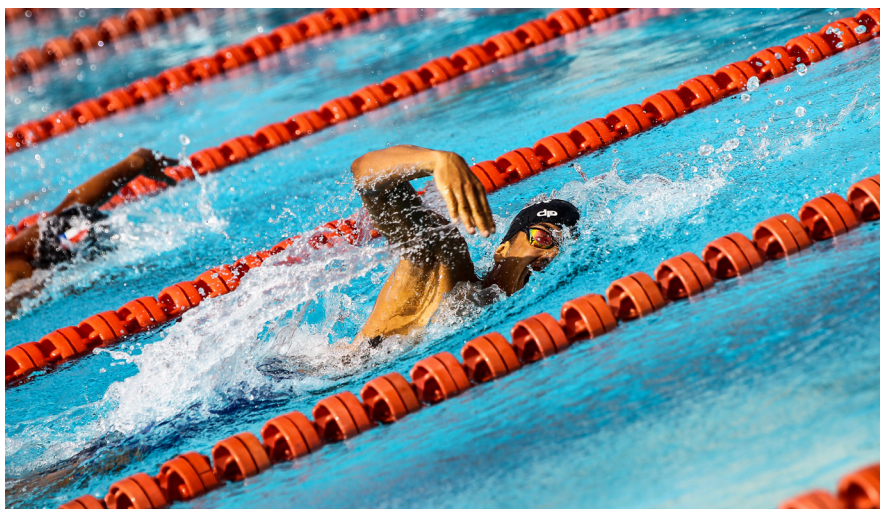
Action from the Swimming pool during the Men's Individual Final