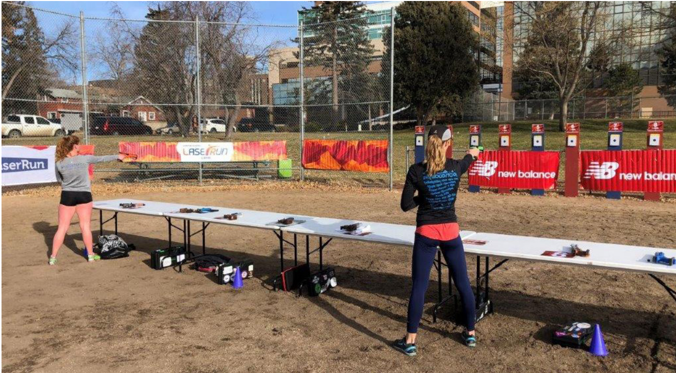
Athletes show their laser shooting prowess in Colorado Springs (USA) and at one of four GLRCT events in Argentina (below)

The success of the venture confirmed the nationwide interest in UIPM’s most popular development sport following events earlier in 2019 in Davis, California and Hunt, Texas.