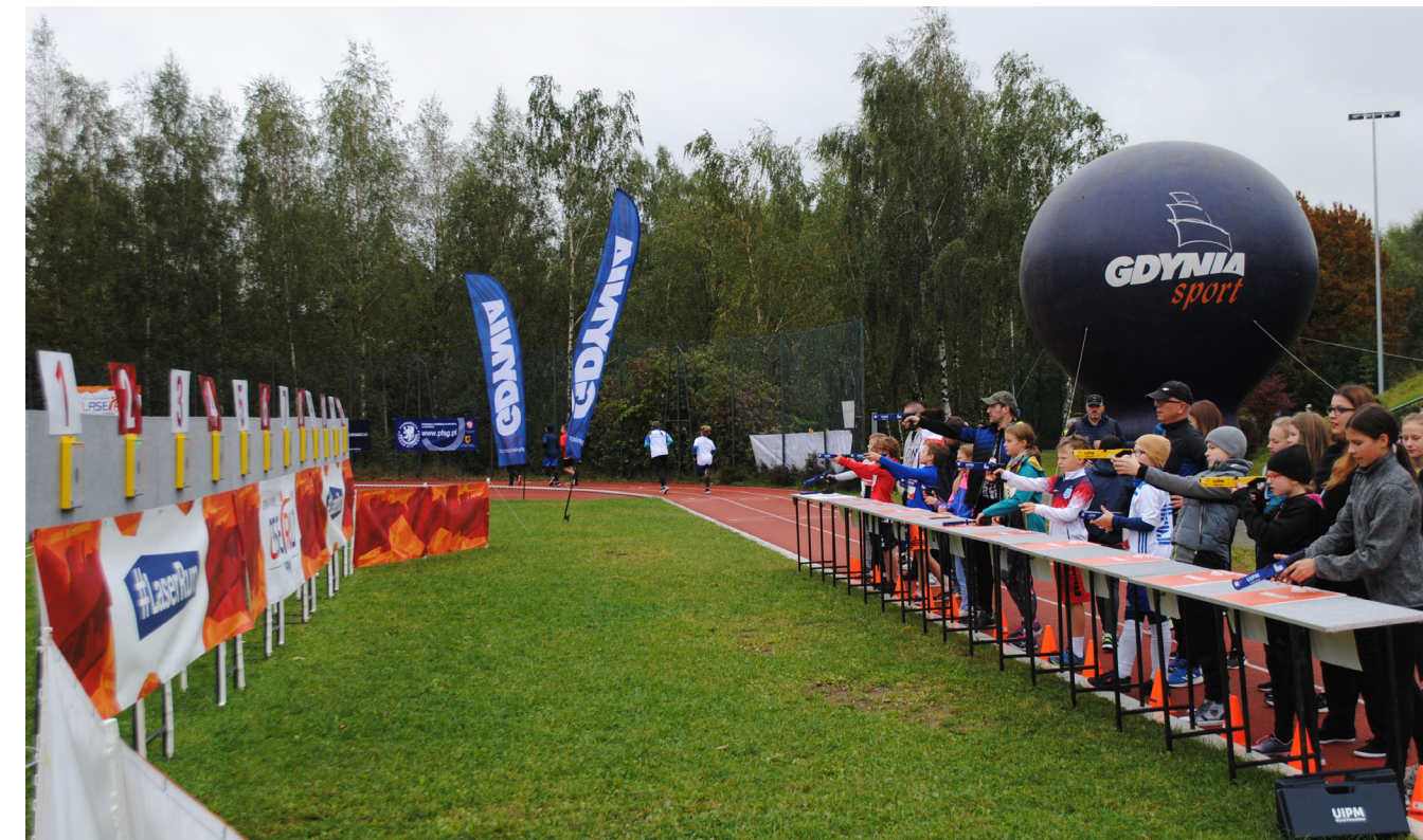
Action from the shooting range in Gdynia (POL) as a family poses for a social media postcard (below)