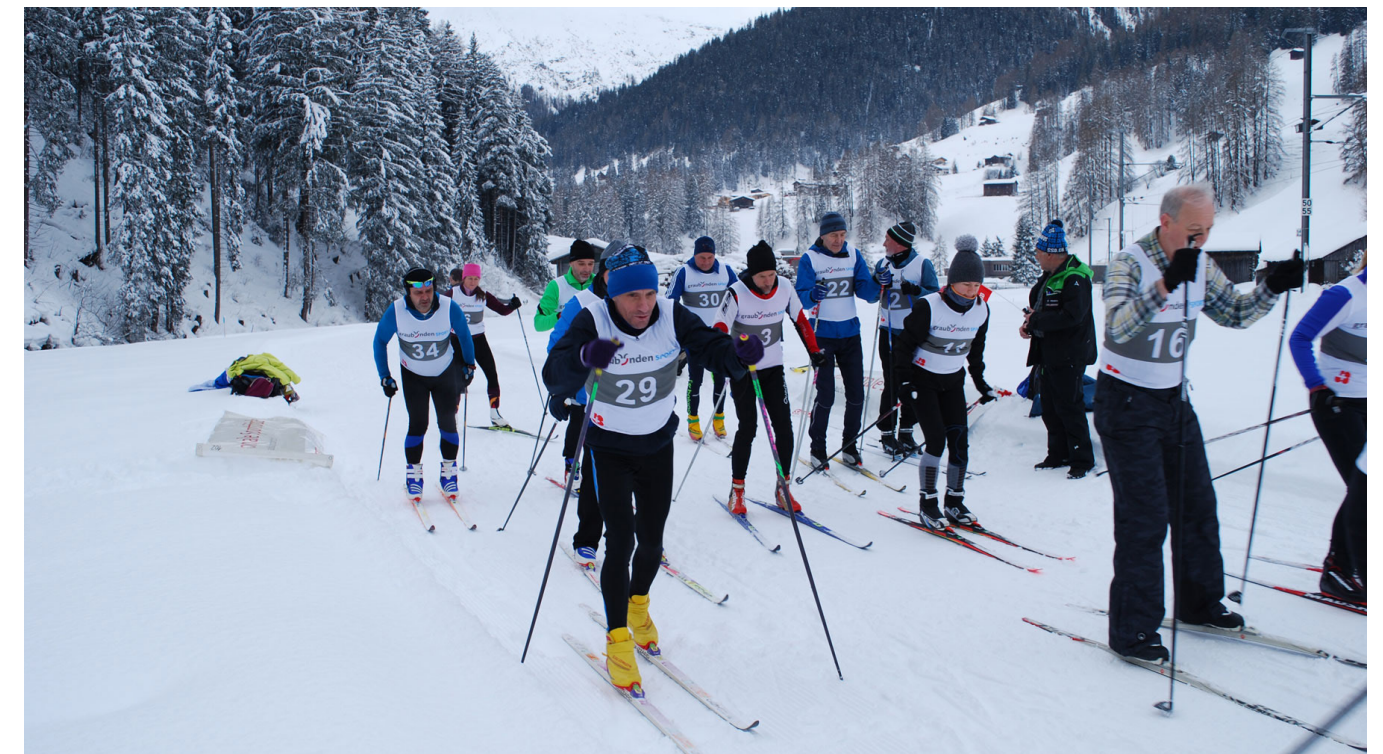
Hardy Masters competitors gather at the start line of the Winter Pentathlon 2020 in Davos (SUI)

Even in winter, the movement never steps exploring new and better ways to provide athletes with the most challenging tests of body and mind, and it was in this spirit that a new form of