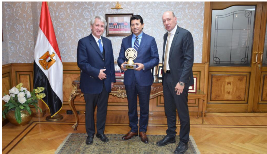
The UIPM and EMPF Presidents with Dr Ashraf Sobhy, the Minister of Youth & Sports

They also spoke about the Coronavirus outbreak and possible implications for the qualification process for the Olympic Summer Games Tokyo 2020. They declared to think positively and to provide the best possible support for athletes and NFs, based on a strong sense of confidence that Tokyo 2020 will be big success for the Olympic movement.