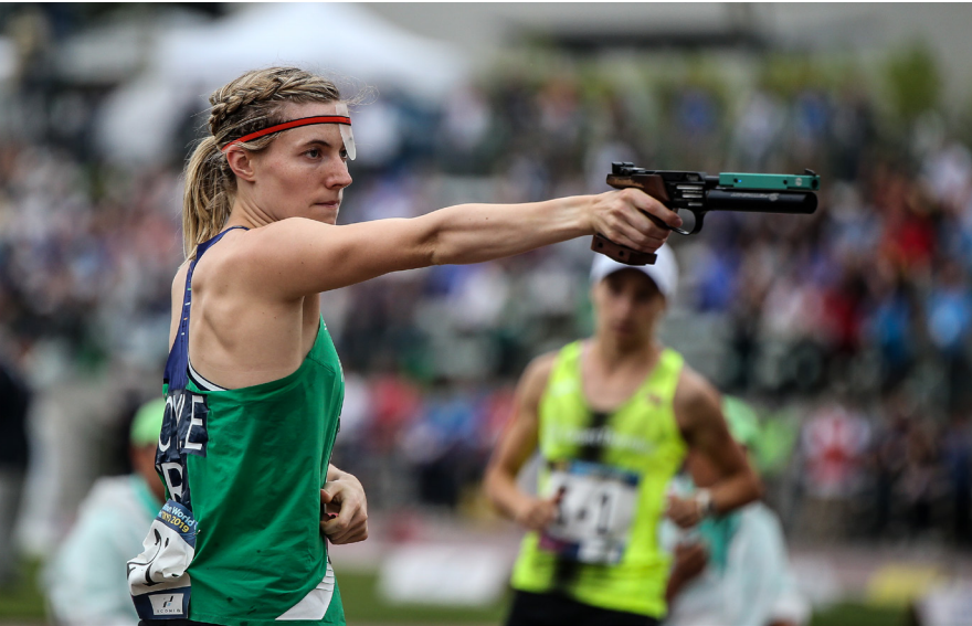
Two-time Olympian Natalya Coyle (IRL) has proved to be a steely competitor on the world stage

A: Even though this will be my third Games, it’s the first time I’ve qualified so far out. So this time I’ve been able to plan my season and not have to worry about being on top form so early in the year.