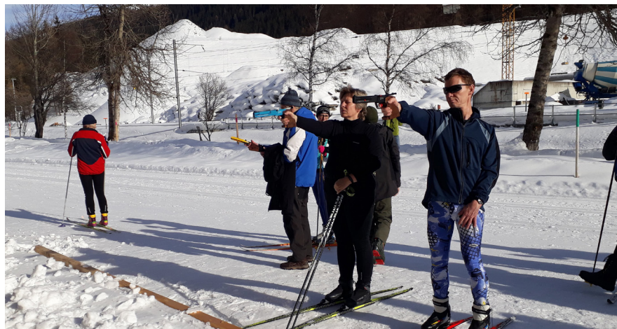
Pioneers trying out Laser Run on cross-country skis for the first time in Davos (SUI)

by the President or Secretary General of a National Federation that is a full member of UIPM.