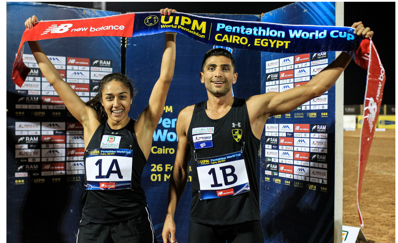
Egypt duo Haydy Morsy and Eslam Hamad celebrate their victory in the Mixed Relay at UIPM 2020 Pentathlon World Cup Cairo