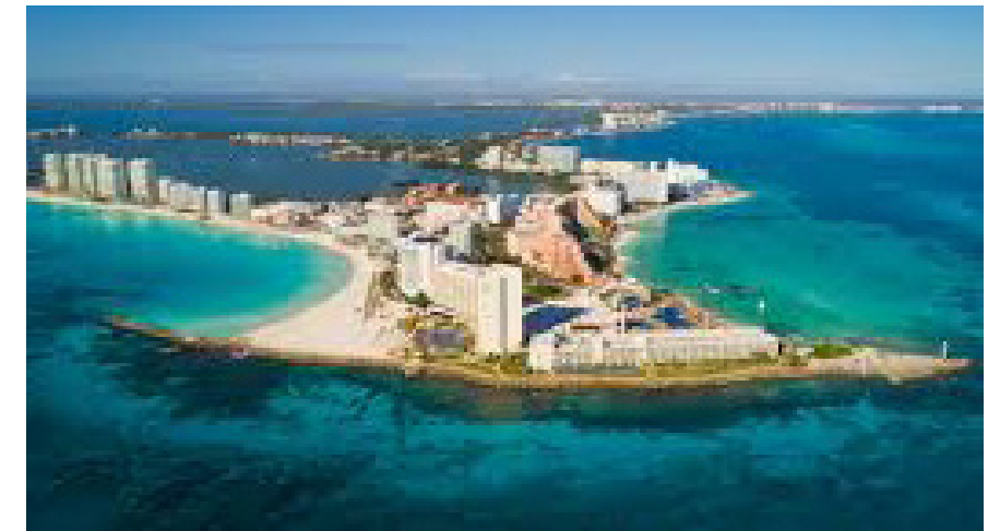
Cancun (MEX) will host the UIPM 2020 Pentathlon World Championships

said: "The past few weeks have been a difficult time for all involved in international sport, and our movement is no exception. We are very sorry that the Coronavirus outbreak has caused so much disruption and left us with no choice but to move our flagship annual competition away from China.