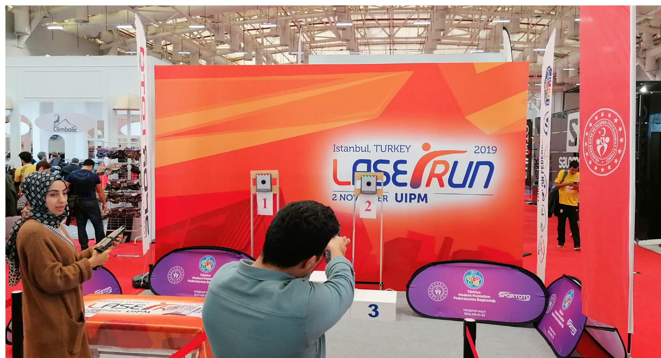
Men and women try their hand at laser shooting during the GLRCT at the Istanbul Marathon sporting festival

Across the four days of the Istanbul Marathon sporting festival, thousands of people attended a booth run by the Turkish Modern Pentathlon Federation (TMPF), learning about the UIPM Sports movement and trying laser shooting.