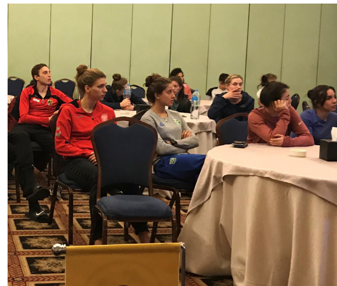
Pentathletes from various nations attend a special UIPM briefing in Cairo