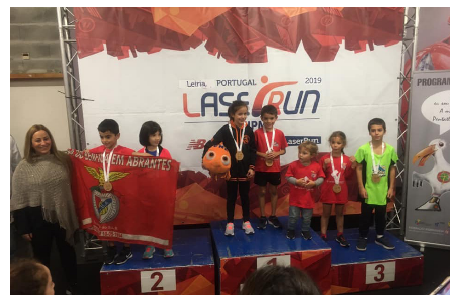
Action from the shooting range and happy faces on the podium in Leiria (POR)