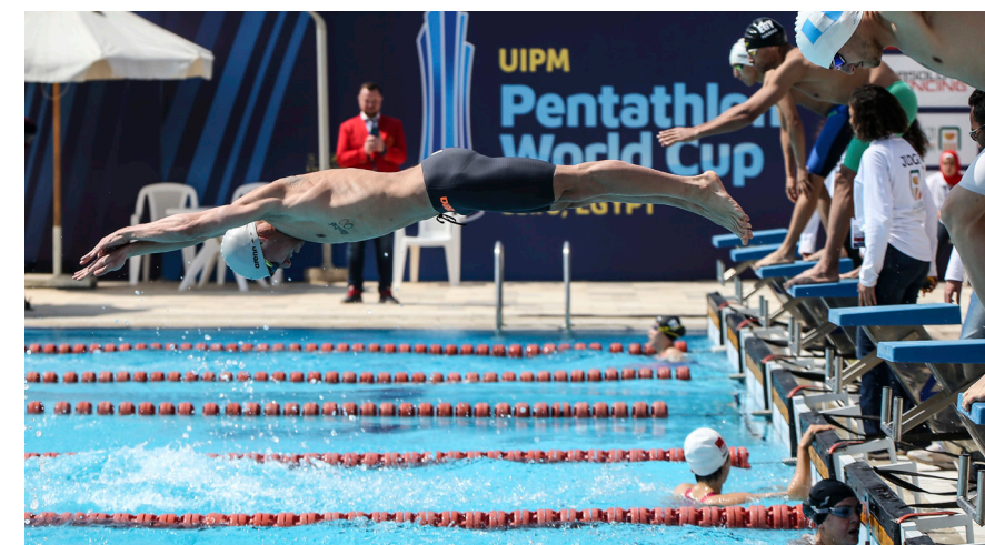
The Mixed Relay kicks off with Swimming