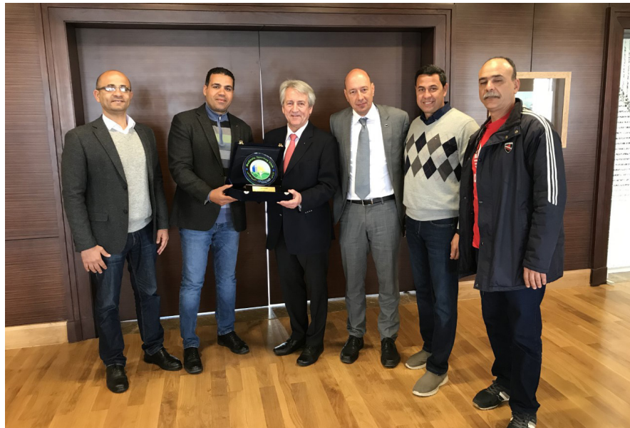
The UIPM and EMPF Presidents meet representatives of the Madinaty Club in Cairo (EGY)

They talked about sport in Egypt and the country's potential to act as a centre for sports development for African sports based on expert knowledge and a variety of excellent training and competition facilities.