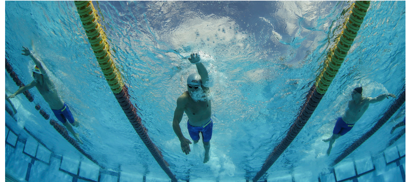
Three competitors in the Men's Final demonstrate their Swimming technique

"I'm a little bit sad about my Riding performance, but finally I've won again and it feels great! My last World Cup victory was in 2014 in Kecskemet in my home country, and that's a very, very long to wait – six years."