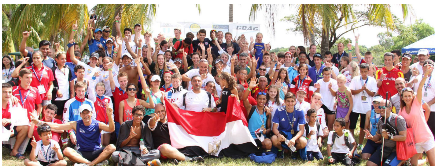
GROUP PHOTO OF THE PARTICIPANTS IN THE BIATHLE / TRIATHLE WORLD CHAMPIONSHIP 2014 IN GUATEMALA

You can find all results @ www.pentathlon.org