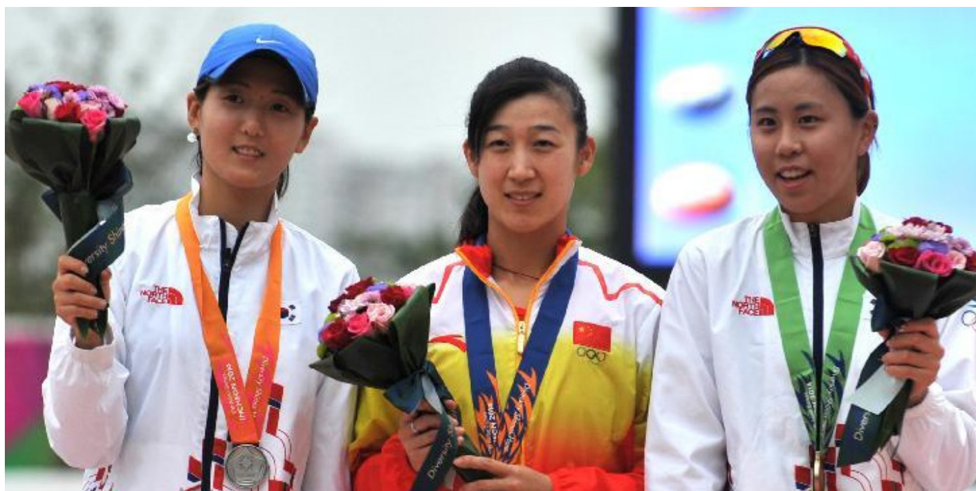
PODIUM OF THE WOMEN'S INDIVIDUAL COMPETITION

Korea still leads the all-time medal table with 19 medals, including 7 golds, although China are not far behind with 15 including 6 golds.