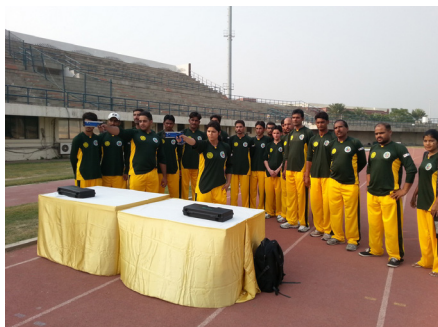
PAKISTAN TRAINING CAMP

Mersin, Turkey 24 January - 15 February 2015