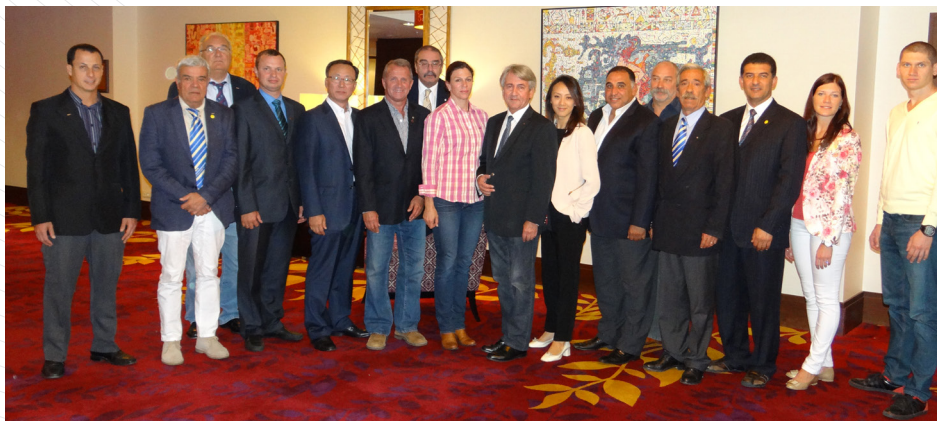
JOINT MEETING WITH THE TECHNICAL AND COACHES COMMITTEES IN WARSAW, POLAND

Olympic and Commonwealth Games Committees within Oceania and further afield will ensure New Zealand remains at the forefront of all that is good and true within the Olympic movement for many years to come.