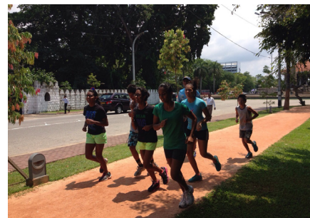
SRI LANKA TRAINING CAMP