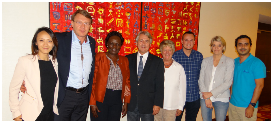
SPORTS FOR ALL COMMISSION MEETING IN WARSAW, POLAND