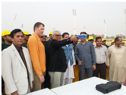
PAKISTAN TRAINING CAMP