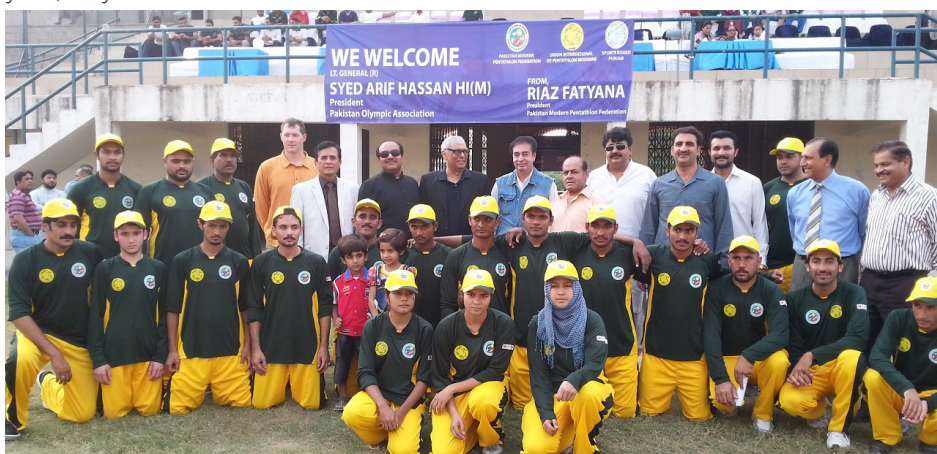
PAKISTAN STAGES FIRST NATIONAL CHAMPIONSHIPS IN PUNJABI CAPITAL