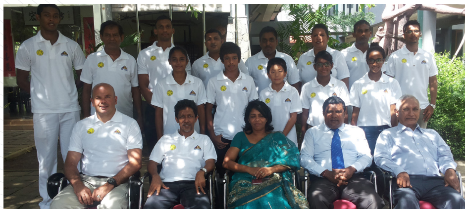
SRI LANKA TRAINING CAMP