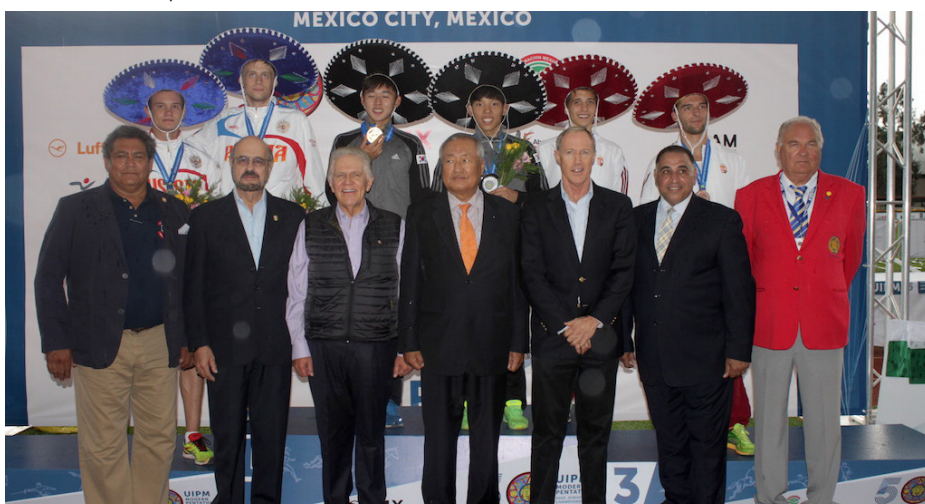
PODIUM OF THE MEN'S RELAY EVENT