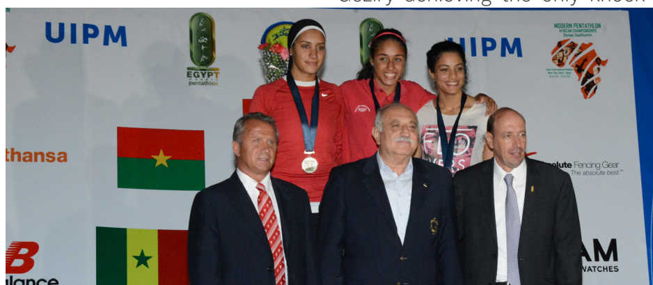
PODIUM OF THE 2015 AFRICAN CHAMPIONSHIPS WOMEN'S COMPETITION