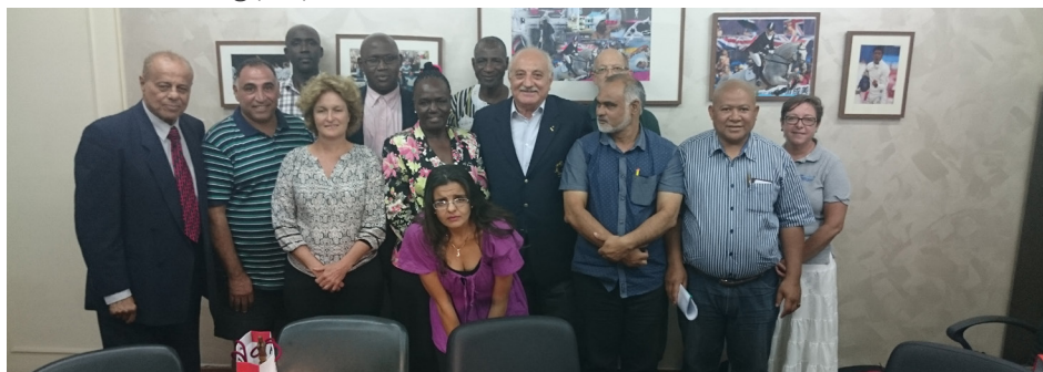
THE AFRICAN CONFEDERATION MEETING TOOK PLACE IN CAIRO DURING THE 2015 AFRICAN CHAMPIONSHIPS

The CAPM President briefed the nations present on development activities, including the distribution of fencing equipment, that had taken place in the past year and requested all CAPM members to send a statement of their plans for developing the sport in their own nations so that the different needs could be identified and addressed.