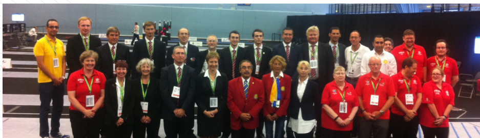
18 INTERNATIONAL JUDGES RENEWED THEIR LICENSES IN THE SEMINAR THAT TOOK PLACE IN BATH (GBR)

The current CAPM members were encouraged to share their different experiences and expertise with each other and also to look at neighbouring nations for support and mutual cooperation.