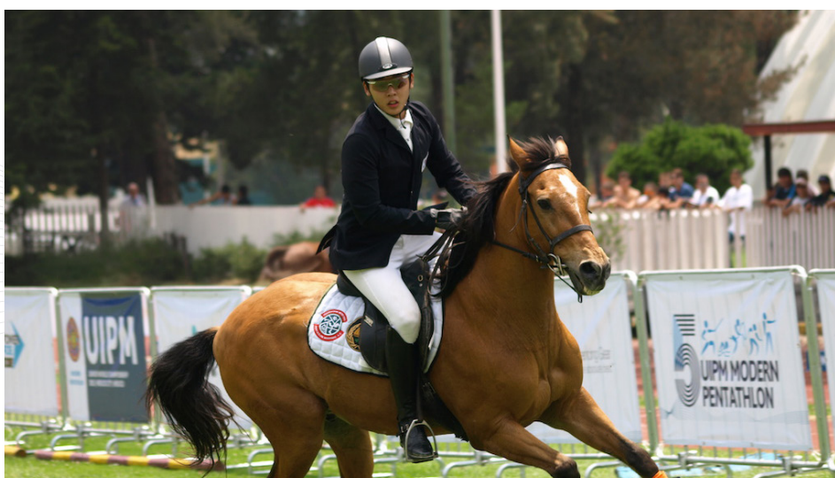
A RIDER KEEPS HER MOUNT IN CHECK AT THE MEXICAN OLYMPIC COMMITTEE VENUE