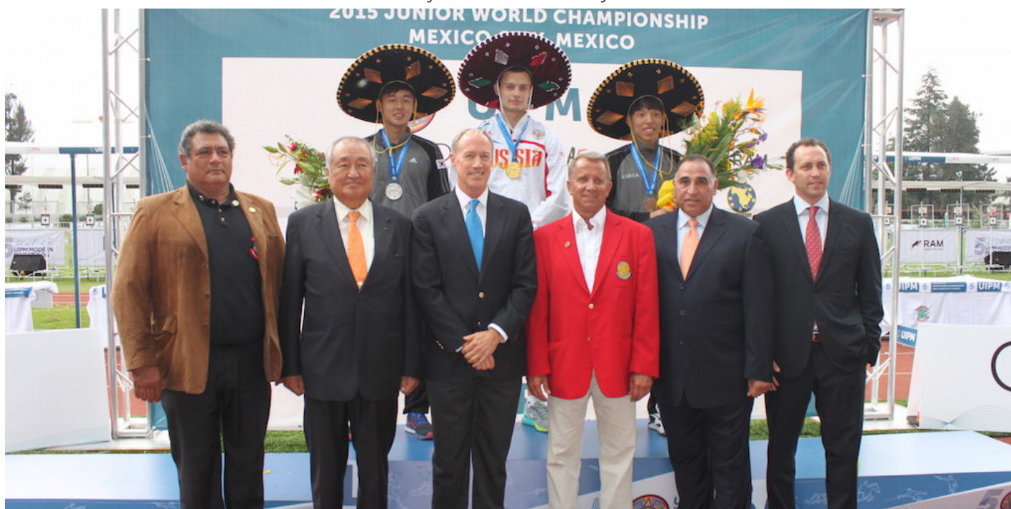
PODIUM OF THE MEN'S INDIVIDUAL EVENT