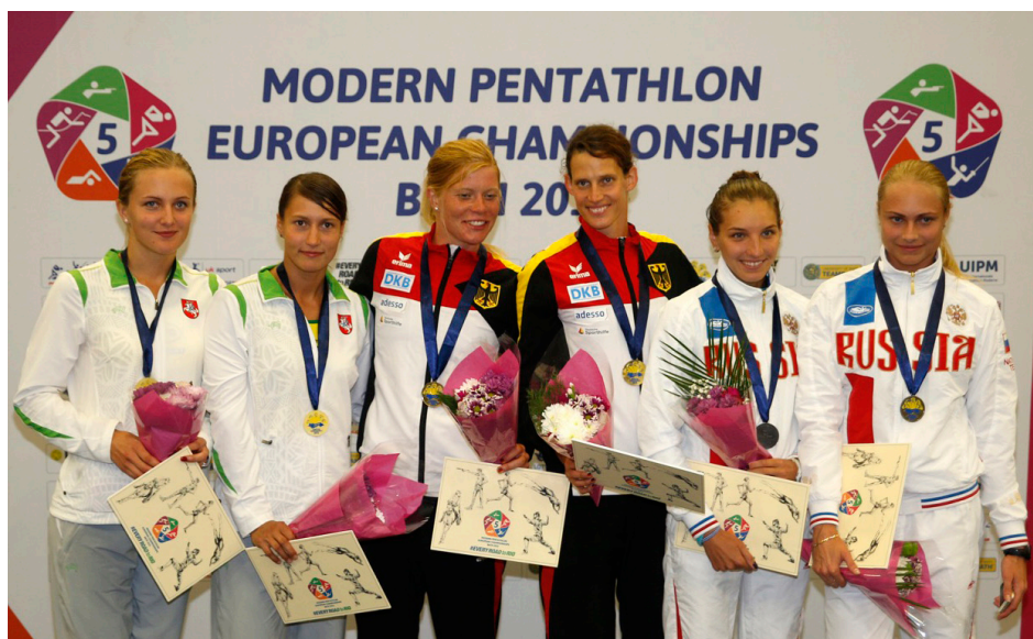
2015 EUROPEAN CHAMPIONSHIPS WOMEN'S RELAY PODIUM

Schoneborn (GER) said: "We both knew we were strong in the run/shoot so we were con-