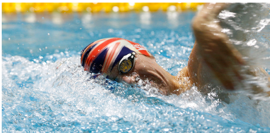
THE BRITISH AUDIENCE HAD THE OPPORTUNITY TO SEE SOME FANTASTIC PENTATHLON ACTION