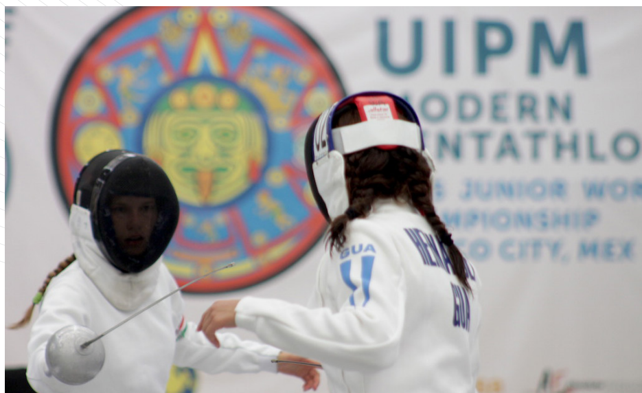
THE FENCING BONUS ROUND BROUGHT DRAMA AND TENSION TO THE EVENT

in the Fencing where they won 27 matches to take first place in the event and in the overall classification.