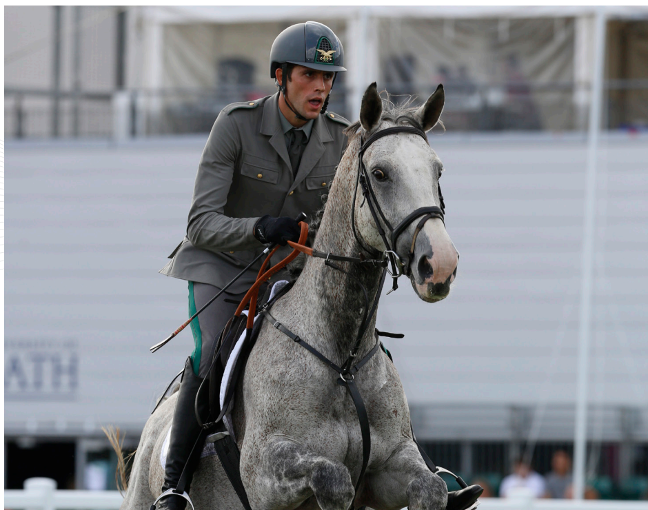
THE RIDING EVENT WAS ONE OF MANY FANTASTIC SUCCESSES DURING THE EUROPEAN CHAMPIONSHIPS