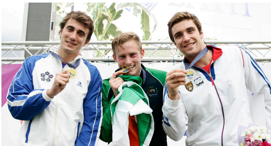
2015 SENIOR EUROPEAN CHAMPIONSHIPS MEN'S INDIVIDUAL COMPETITION PODIUM

"I have a spot for the Olympic Games but I am not nominated yet because that our coaches will decide next year," he said.