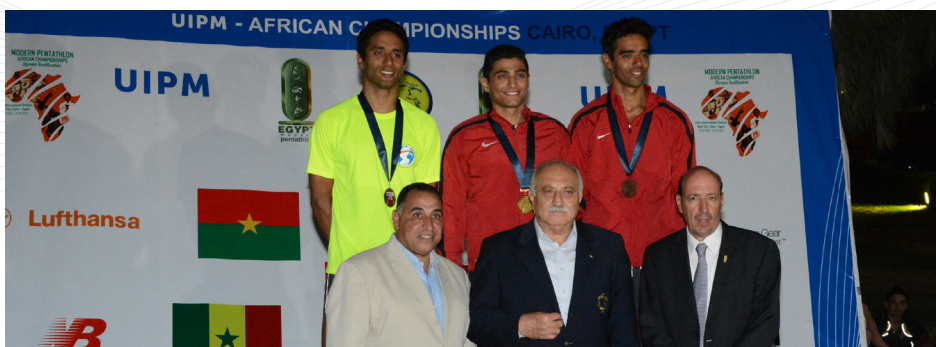
PODIUM OF THE 2015 AFRICAN CHAMPIONSHIPS MEN'S COMPETITION

With the championships starting in the afternoon to benefit from cooler conditions, the Swimming came first and it was no surprise that Amro El Geziry, the current Olympic world record holder, took control of the pool to win in a time of 1:55.5, nearly 6 seconds faster