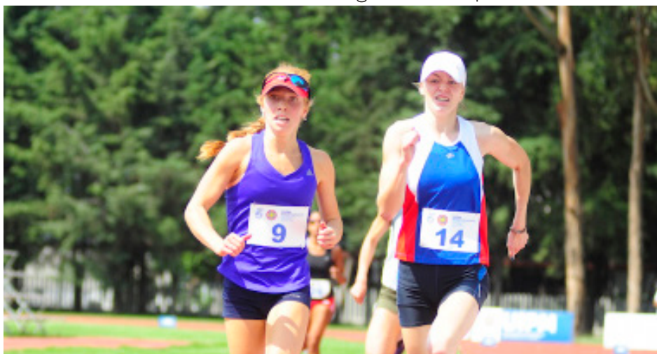
THE EXCITING LAST METERS OF THE WOMEN'S INDIVIDUAL EVENT WHERE FRANCESCA SUMMERS (GBR) GOT THE GOLD

The British athlete started the last lap in first position just followed by Batashova (RUS) and Tognetti (ITA) but a fantastic comeback from Sofia Serkina almost matched what Summers (GBR) had achieved. Serkina (RUS) came from 14th position and overtook Batashova (RUS) and Tognetti (ITA) to fight for first place.