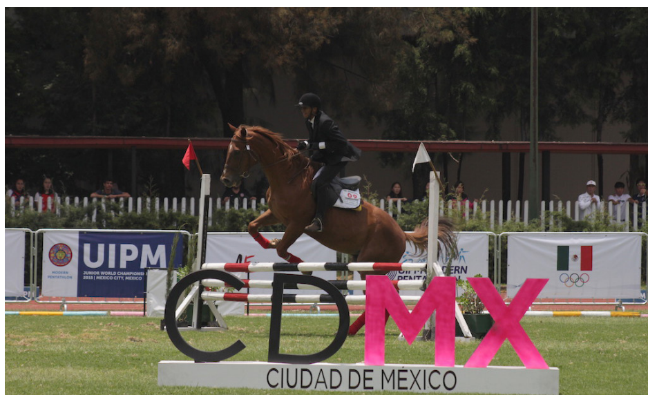
THE RIDING EVENT PROVIDED A THRILLING SPECTACLE FOR THE AUDIENCE IN MEXICO CITY