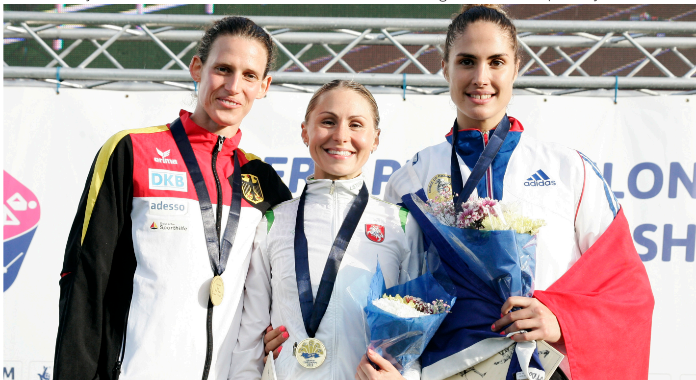
2015 SENIOR EUROPEAN CHAMPIONSHIPS WOMEN'S INDIVIDUAL COMPETITION PODIUM