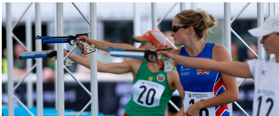
ATHLETES TAKE AIM DURING A THRILLING COMBINED EVENT IN BATH