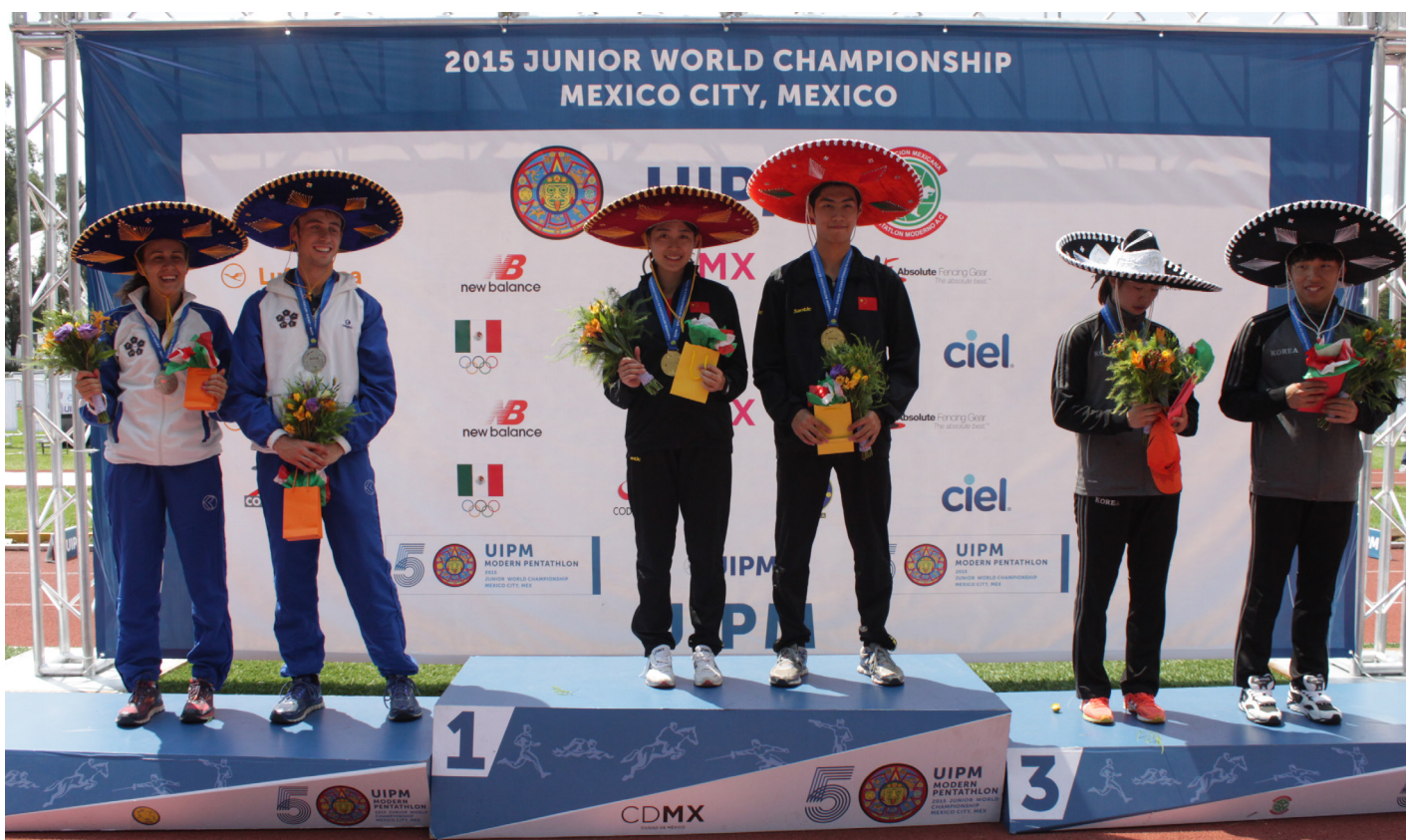
PODIUM OF THE MIXED-RELAY EVENT

"This shows that we have a great future generation of pentathletes. Also, some of them are already qualified for the Rio 2016 Olympic Games."