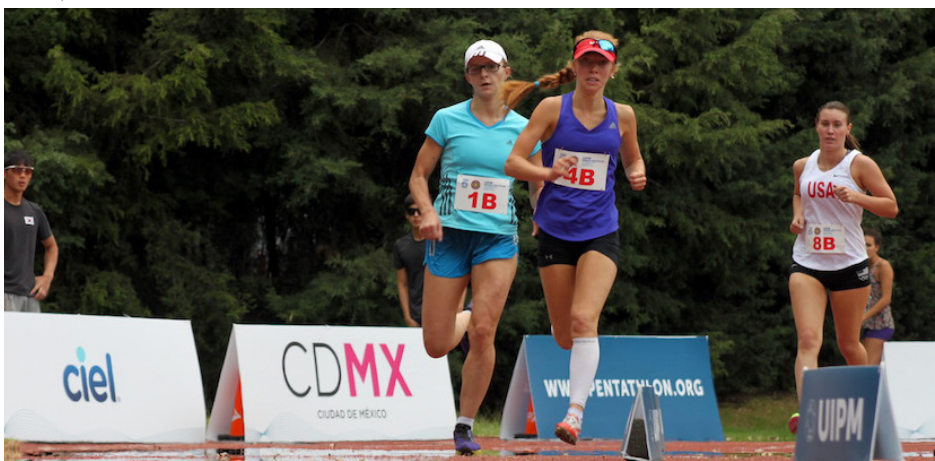
AN EXCITING WOMEN'S RELAY SAW RUSSIA AND GREAT BRITAIN COMPETE FOR GOLD IN THE FINAL METERS

Li/Zhong (CHN) took top slot in the Riding to move them to fourth in the overall competition, but they were still a con-