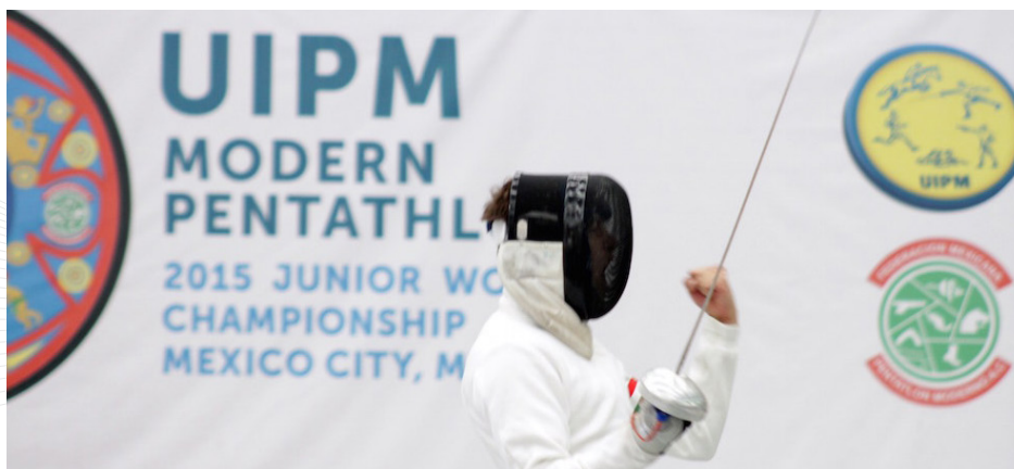
THE WINNER OF A BOUT SHOWS HIS EMOTION DURING THE FENCING BONUS ROUND