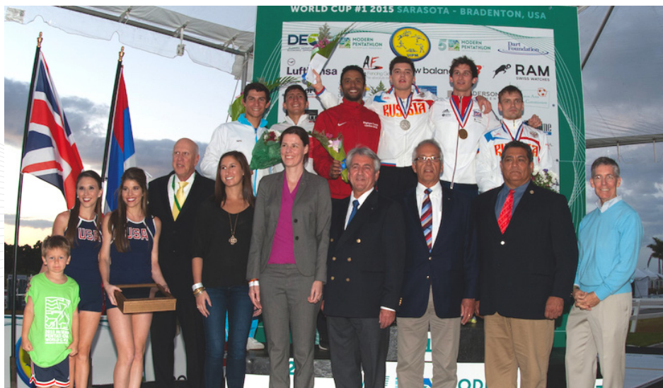
THE MALE COMPETITION PODIUM OF THE UIPM 2015 WORLD CUP #1

The Egyptian stayed in pole position through the fencing bonus round and the riding stage, but El Geziry incurred three faults and that provided encouragement for the chasing pack.