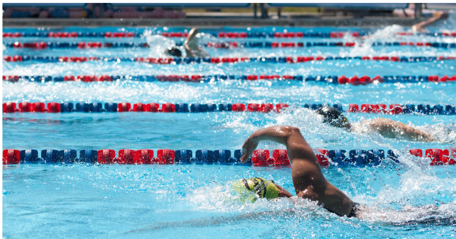
THE SWIMMING AND FENCING DISCIPLINES TOOK PLACE AT THE SELBY AQUATIC CENTER

"I have to say a huge thank you to the Modern Pentathlon Association of the United States and the