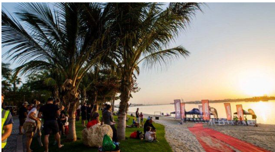
THE FIRST STAGE OF THE WORLD TOUR TOOK PLACE IN DUBAI

Managing Director of Super Sports commented: "The added bonus with this event is that the top 5 UAE local or UAE resident finishers in each age group for all junior and adult categories will be invited to represent the UAE as an International Team against the world's best when the XV UIPM Biathle World Championships takes place in Georgia in September 2015"