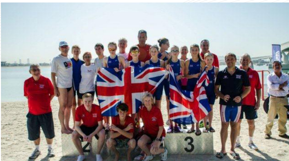
2015 BIATHLE WORLD TOUR PODIUM