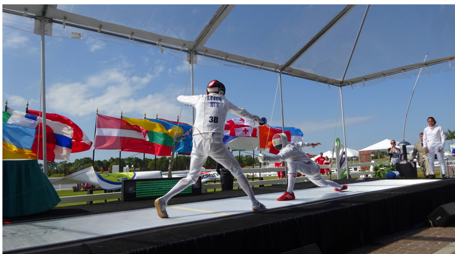
THE AUDIENCE ENJOYED THE DRAMA OF THE FENCING BONUS ROUND

Russia were crowned champions ahead of Ireland and Canada, who had begun the Combined Event in fourth.