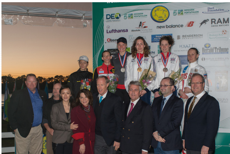
WOMEN'S COMPETITION PODIUM