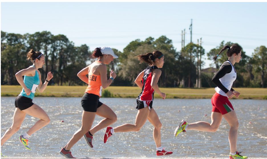
SARASOTA'S NATHAN BENDERSON PARK WAS THE MAIN VENUE OF THE UIPM 2015 WORLD CUP #1