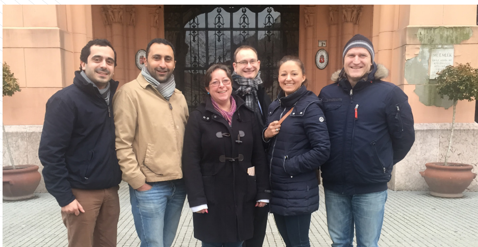
UIPM STAFF VISITED THE WORLD CUP #3 (ROME, ITALY) AND WORLD CUP #4 (KECSKHEMET, HUNGARY) ORGANISERS