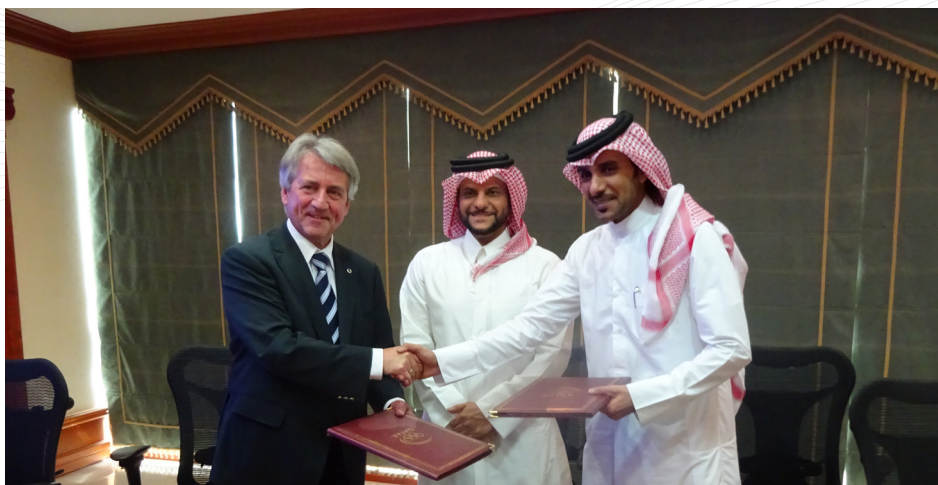
THE AGREEMENT WAS SIGNED BETWEEN UIPM PRESIDENT AND THE QATAR OLYMPIC COMMITTEE AND QATAR MODERN PENTATHLON FEDERATION

"Doha has become a true global sports hub thanks to its hosting of