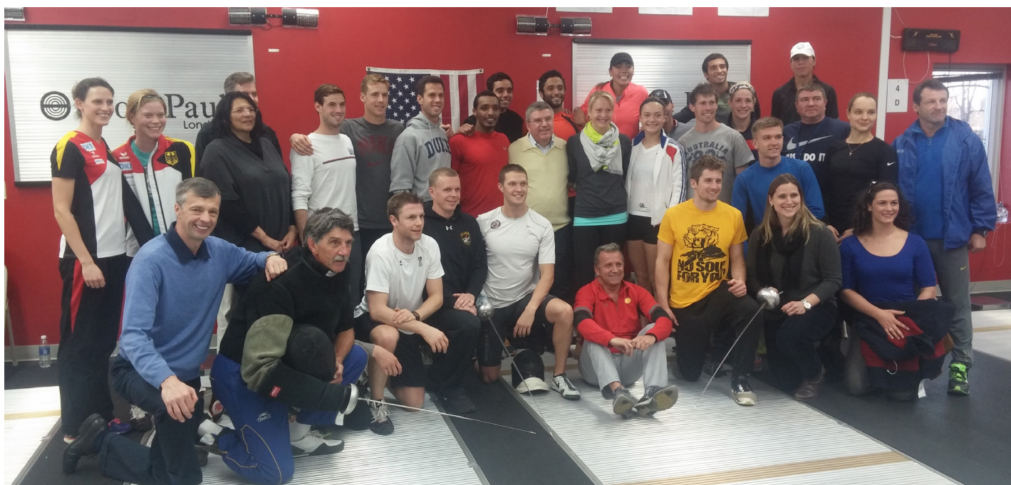
IOC PRESIDENT, DR. THOMAS BACH WITH PENTATHLETES DURING HIS VISIT TO THE US TRAINING CENTER