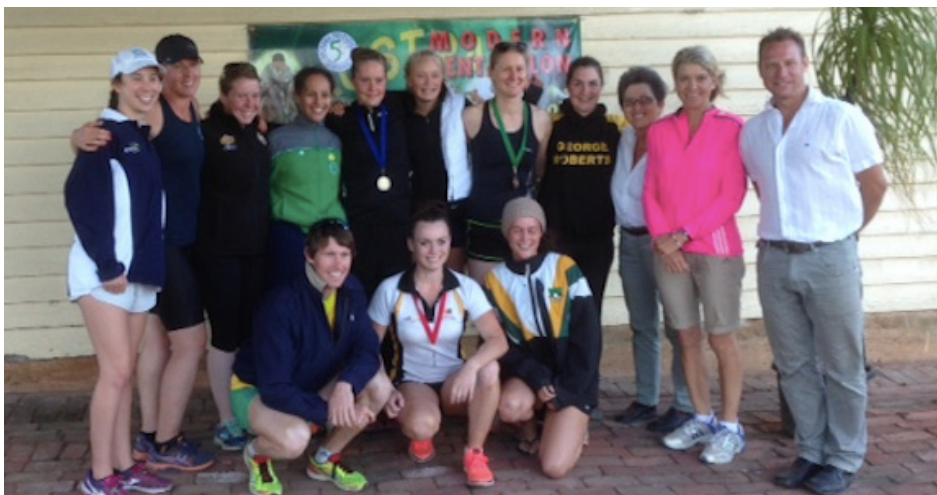
MELBOURNE HOSTED THE #2 AUSTRALIAN TEAM SELECTION TRIAL

At Millfield School in GBR, Kate French, the 2014 World Championships Mixed Relay silver medallist, topped the table once more at the second of three Pentathlon GB national ranking events.