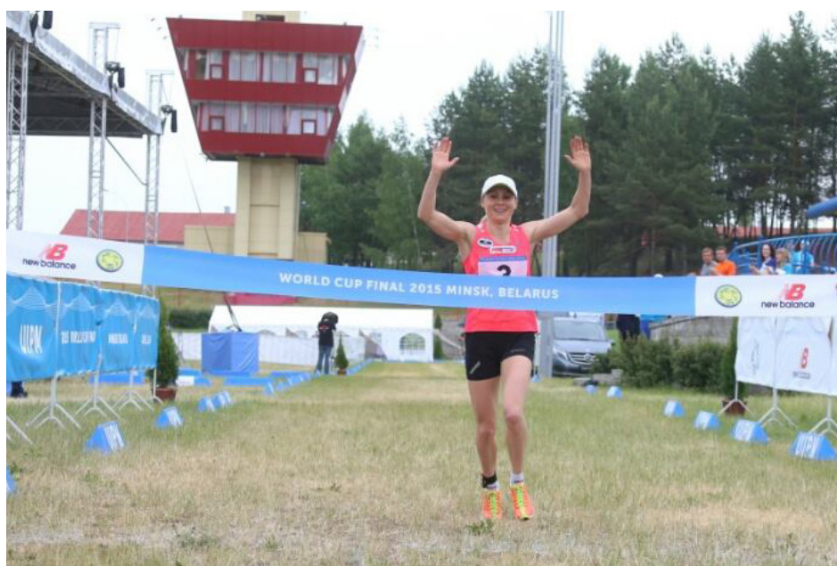
LAURA ASADAUSKAITE (LTU) WAS THE WINNER OF THE UIPM 2015 WORLD CUP FINAL WOMEN'S INDIVIDUAL COMPETITION

She said: "I am very happy today, it is a great day. My Fencing and Swimming were very good although in the Riding I made one small mistake. I didn't feel 100% in the Combined Event, but I am very happy to win and to know I am going to Rio next summer.