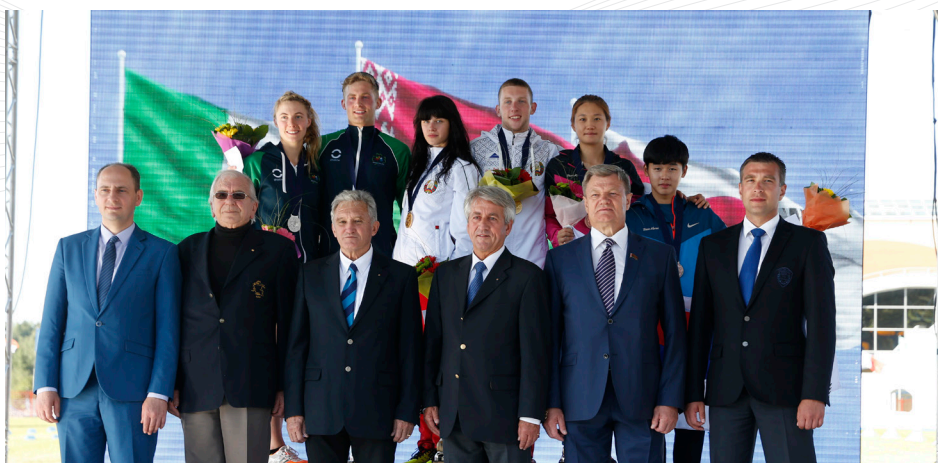
PODIUM OF THE UIPM 2015 WORLD CUP FINAL MIX RELAY COMPETITION