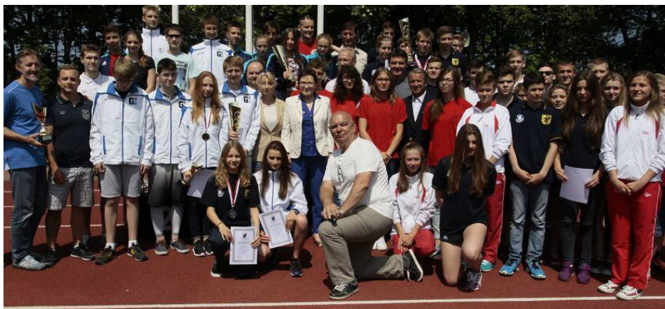
PRIME MINISTER OF POLAND AND POLISH MINISTER OF SPORT WITH YOUNG PENTATHLETES

Registration for the conference closes on July 20, and with places filling up fast delegates are encouraged to apply for a place as soon as possible.