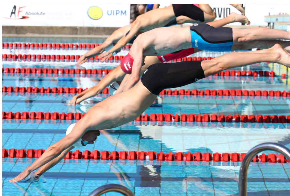
THE OLYMPIC PARK SWIMMING POOL HOSTED A FANTASTIC AND THRILLING SWIMMING COMPETITION

Home advantage was crucial – as it was the Men’s Relay on the Opening Day - as the 2008 Olympic Champion came out on top in the