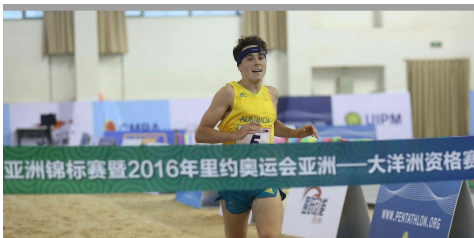
MAX EXPOSITO WON THE MEN'S INDIVIDUAL COMPETITION IN BEIJING

The 6 men who achieved qualification places are: Asia – Woongtae Jun (KOR), Dongii Lee (KOR), Haihang Su (CHN), Zhongrong Cao (CHN), Woojin Hwang (KOR); Oceania – Max Esposito (AUS). As National Olympic Committees are only allowed to enter 2 athletes per gender, this means through the rules of the qualification system a place for Tomoya Miguchi of Japan is guaranteed.