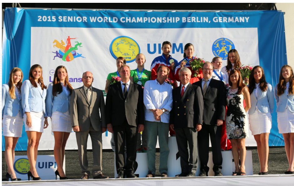
UIPM 2015 SENIOR WORLD CHAMPIONSHIPS WOMEN'S TEAM RELAY COMPETITION PODIUM