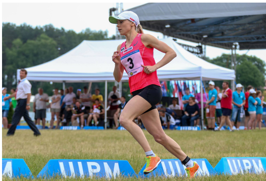
LAURA ASADAUSKAITE (LTU) LEADS THE WAY DURING THE COMBINED EVENT OF THE WOMEN'S INDIVIDUAL FINAL

"We now look forward to the World Championships and we wish to extend a huge thank you to the Local Organising Committee, the National Federation, the Government and the people of Minsk and Belarus for what has been a wonderful Finals."