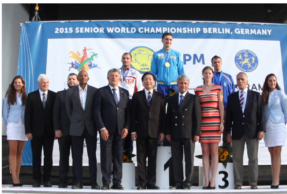
PAVLO TYMOSHCHENKO (UKR) TOPPED THE PODIUM AFTER THE MEN'S INDIVIDUAL FINAL

The three athletes not only claimed their medals but earned automatic qualification for Rio 2016 with their podium finishes.