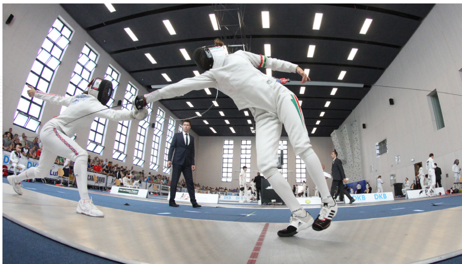
THE FENCING WAS PLAYED OUT IN FRONT OF A CAPTIVATED AUDIENCE IN BERLIN'S STUNNING OLYMPIC VENUE

"With the support of the home crowd it made it a lot easier to go all out and give 110 per cent. On the last lap I knew I was going to take it individually, but I knew we were also going for a Team Medal