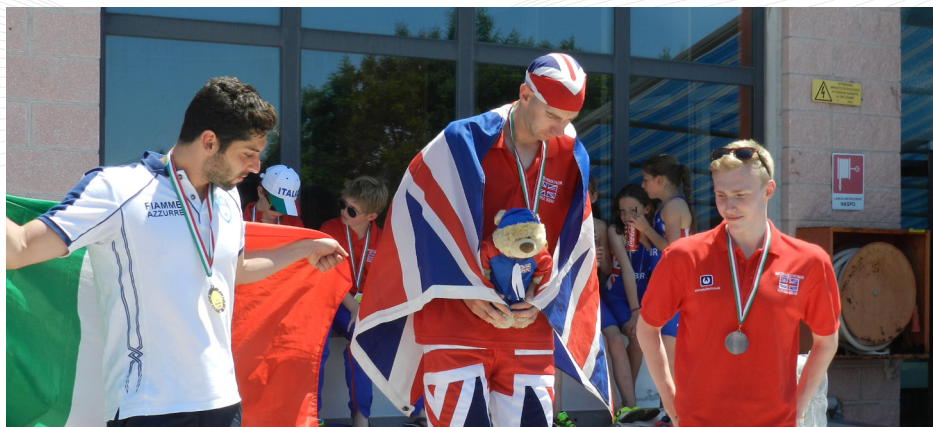
BIATHLE / TRIATHLE WORLD TOUR #2 WAS HELD IN CASCINA, ITALY

Member of FISU Family since May 2014, the UIPM has followed the indication of the FISU Executive Committee in establishing a trial event of