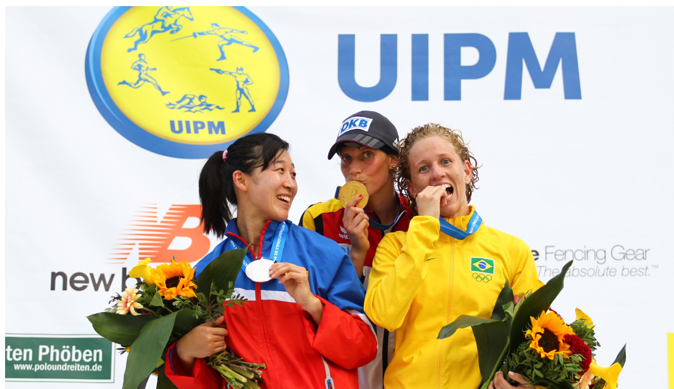
QIAN CHEN (SILVER), LENA SCHONEBORN (GOLD) AND YANE MARQUES (BRONZE) CELEBRATE ON THE PODIUM AT THE UIPM SENIOR WORLD CHAMPIONSHIPS

First the World, now for the Olympics . . .