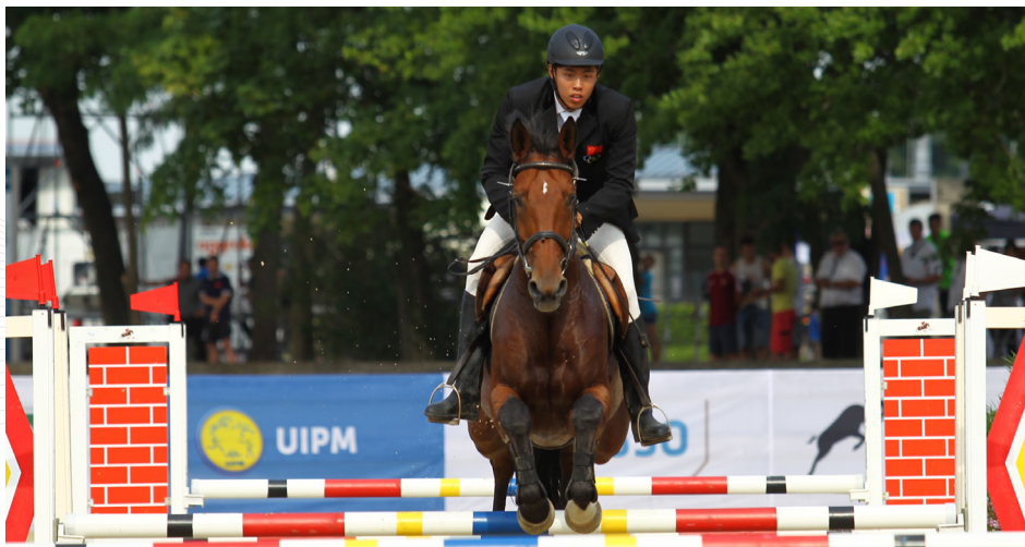
THE RIDING EVENT CREATED DRAMATIC MOMENTS FOR THE SPECTATORS IN BERLIN'S OLYMPIAPARK

Russia remained in 3rd place but had to share their position with Germany who gained four more points after a solid riding performance. Lithuania crept up the lea-