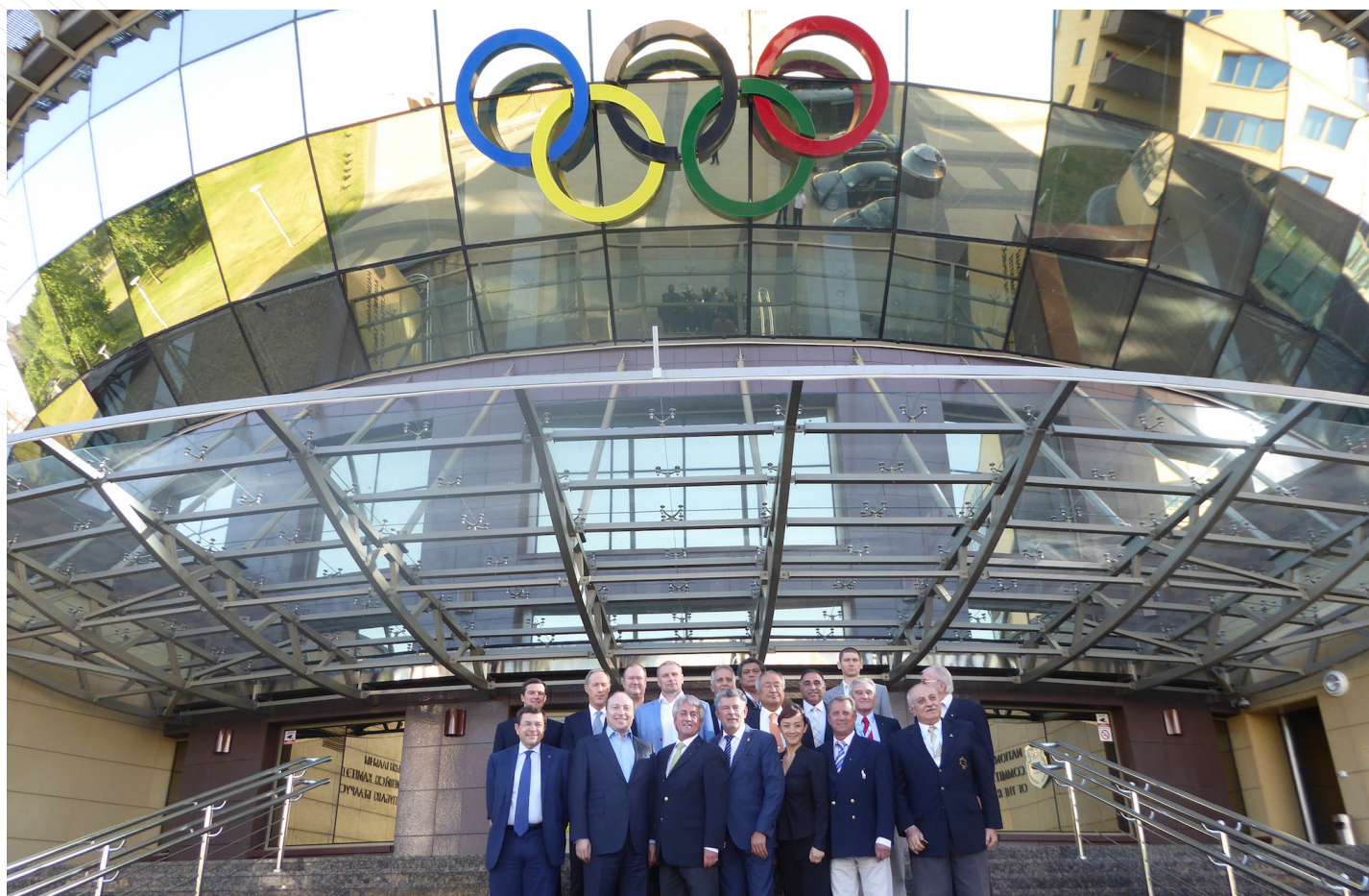
UIPM EXECUTIVE BOARD MEMBERS IN MINSK, BELARUS

ports were also received from the Chairs of UIPM Committees and Continental Confederation Presidents. A highlight of the meeting was the report from Media regarding the vastly improved figures on social media platforms in relation to those of the preceding year.