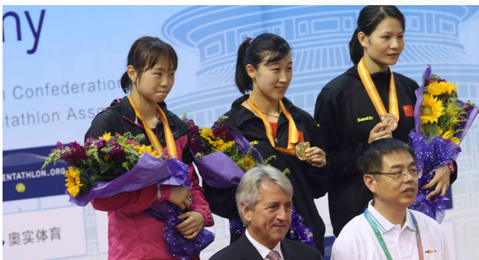
PODIUM OF THE 2015 ASIA / OCEANIA CHAMPIONSHIPS WOMEN'S COMPETITION

China's Qian Chen completed a golden double at the Asian & Oceania Championships when she was crowned Women's Individual champion which guarantees her place at next summer's Olympic Games in Rio. The World PWR Ranking #4, 2014 World Championships Silver Medallist and Asian Games Gold Medallist Chen (CHN) showed her class to take the gold medal in the first day of the Championships – the first Olympic Qualification event for Pentathletes which will guarantee 12 athletes (six female, six male) their place in the wonderful city next summer.