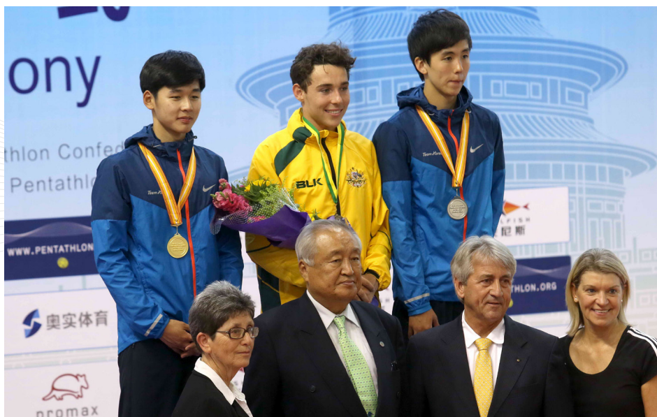
2015 ASIA / OCEANIA CHAMPIONSHIPS MEN'S INDIVIDUAL COMPETITION PODIUM