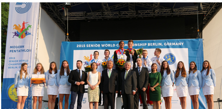
PODIUM OF THE UIPM 2015 SENIOR WORLD CHAMPIONSHIPS MEN'S TEAM RELAY COMPETITION

Dogue (GER) topped the podium in the Men's Team Relay to begin a week of top-class Modern Pentathlon action at Berlin's Olympia-Park.