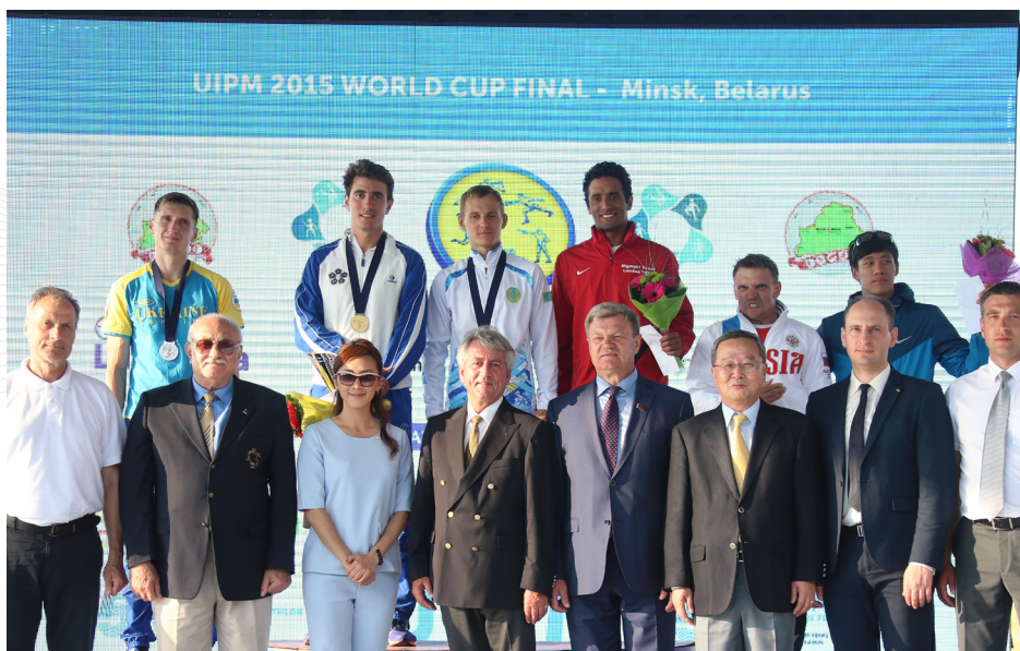
UIPM 2015 WORLD CUP FINAL MEN'S INDIVIDUAL COMPETITION PODIUM

"The fact that the winner today was Belarus will give us a big push and attraction for the weekend event.