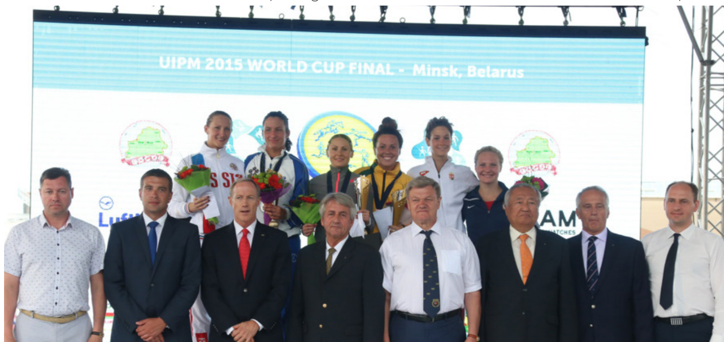
THE 2015 WORLD CUP FINAL PODIUM AT THE END OF THE WOMEN'S INDIVIDUAL EVENT

Next up was a visit to the Riding Arena where Clouvel (FRA) had another outstanding display with a clear round to take first place –