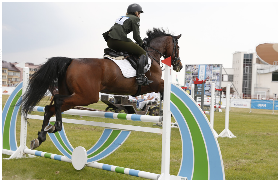
THE BEAUTIFUL CITY OF MINSK PLAYED HOST TO A CAPTIVATING RIDING COMPETITION DURING THE 2015 UIPM WORLD CUP FINAL

After another day of breathtaking competition, UIPM President Dr Klaus Schormann said: "The Men's World Cup Final was so dramatic at