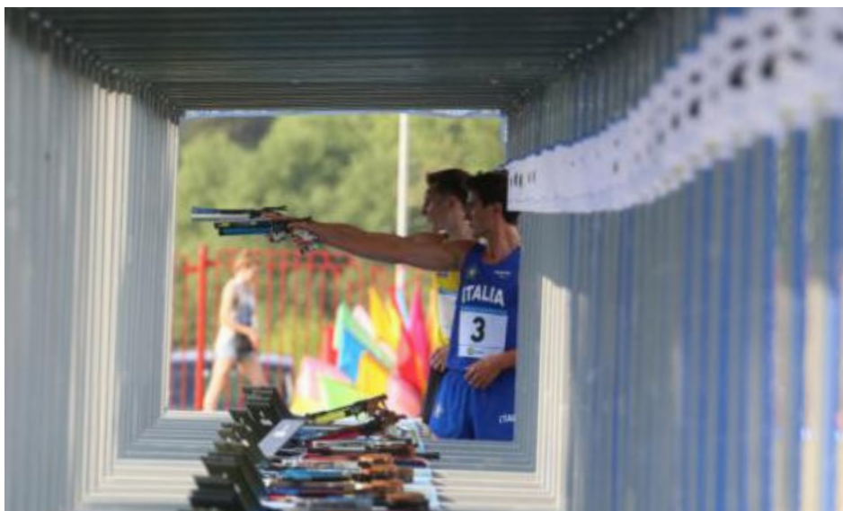
AN EXCITING COMBINED EVENT SAW ITALY'S RICCARDO DE LUCA TAKING FIRST PLACE IN THE MEN'S INDIVIDUAL COMPETITION

But after a day of thrilling and dramatic competition on the field, it was the surprise package of