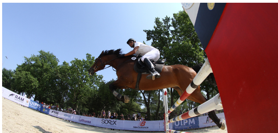
A PENTATHLETE CLEARS A FENCE UNDER PERFECT BLUE SKIES AT BERLIN'S OLYMPIAPARK

"Thank you again to the athletes, some of whom have competed in four big finals so they have shown real mental and physical strength to do this. We can see that drama, excitement, tolerance and sporting friendship have been a big part of these World Championships and for that we thank all involved."