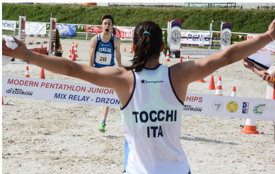
THE FIRST JOINT EVENT BETWEEN UIPM AND FISU WILL HAPPEN IN MEXICO JUST BEFORE THE UIPM 2015 JUNIOR WORLD CHAMPIONSHIPS

With this in mind, the UIPM has drafted a detailed strategic plan, specifically oriented to University Sports, which is currently being implemented in partnership with its member national federations. This plan envisions to actively promote and help implement Modern Pentathlon, and its sub-sport programmes, at universities worldwide, sharing the UIPM's know-how and technologies with key people on site. Other actions planned include informational material presenting the sport for FISU member associations, and educational material on sport and especially the combined event for interested universities and their students/athletes.