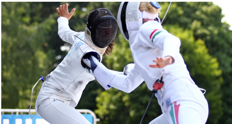
TWO COMBATANTS THRILL THE CROWD ON THE FENCING PISTE AT THE 55TH SENIOR WORLD CHAMPIONSHIPS