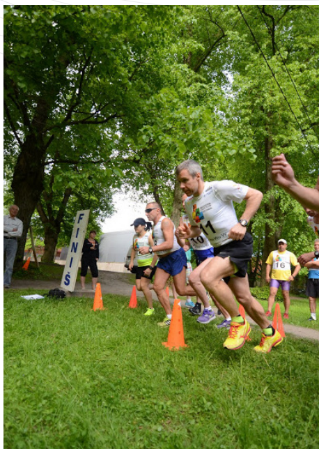
TARTU (EST) HOSTED THE LATEST MASTERS EVENT

The 37th Tartu Masters tournament and European Masters Cup stage was held on June 5-7 in Tartu. There were 29 participants from eight countries; 14 in pentathlon and 15 in tetrathlon.