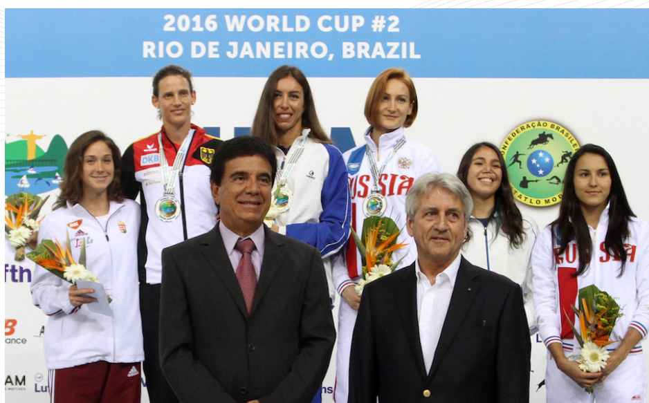
THE WOMEN'S FINAL PODIUM

"We will deliver a great pentathlon stadium, knowing that only the swimming is outside of this stadium, so this Test Event was