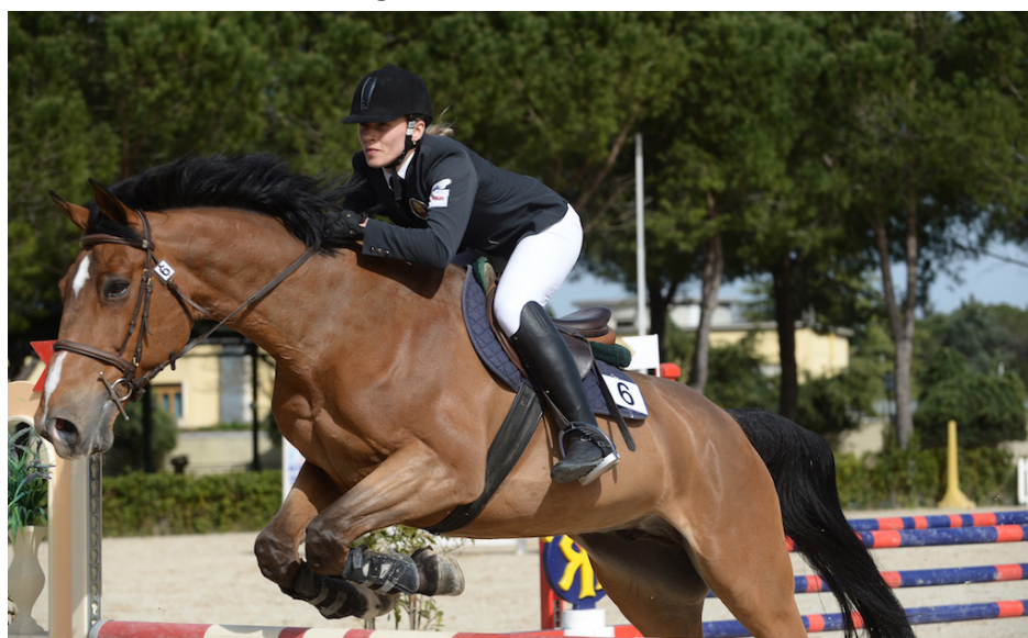
ITALY WON PRAISE FOR HOSTING ANOTHER WORLD-CLASS COMPETITION AT THE END OF WORLD CUP #3

"But the most important part was to have our Olympic champions