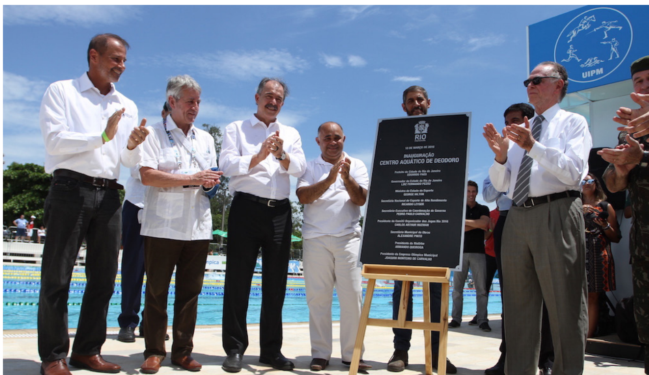
RIO'S DEODORO AQUATIC CENTER, THE SWIMMING VENUE FOR THE OLYMPIC GAMES IN AUGUST, WAS INAUGURATED DURING WORLD CUP #2