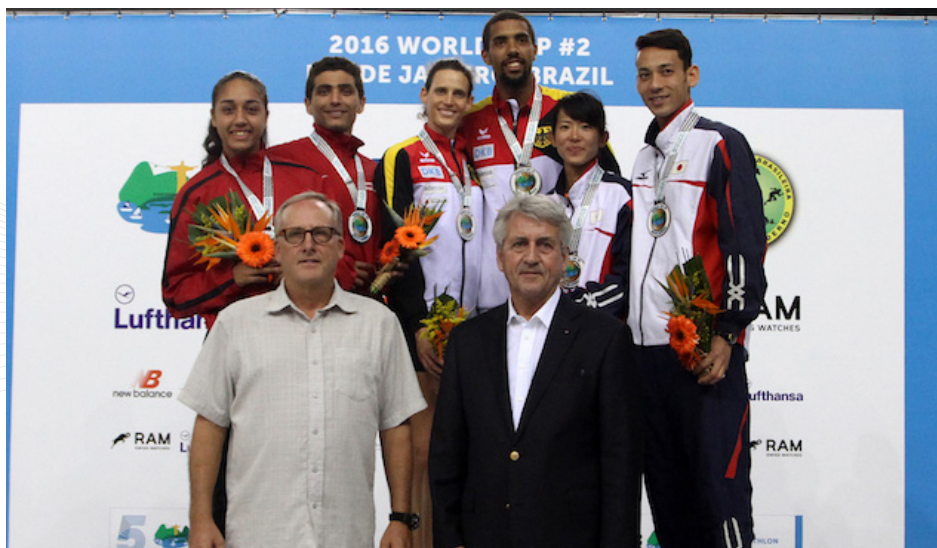
THE MIXED RELAY PODIUM

The German duo certainly had fun from the start of the day, as they created a 25-point lead over the rest of the field in the opening two