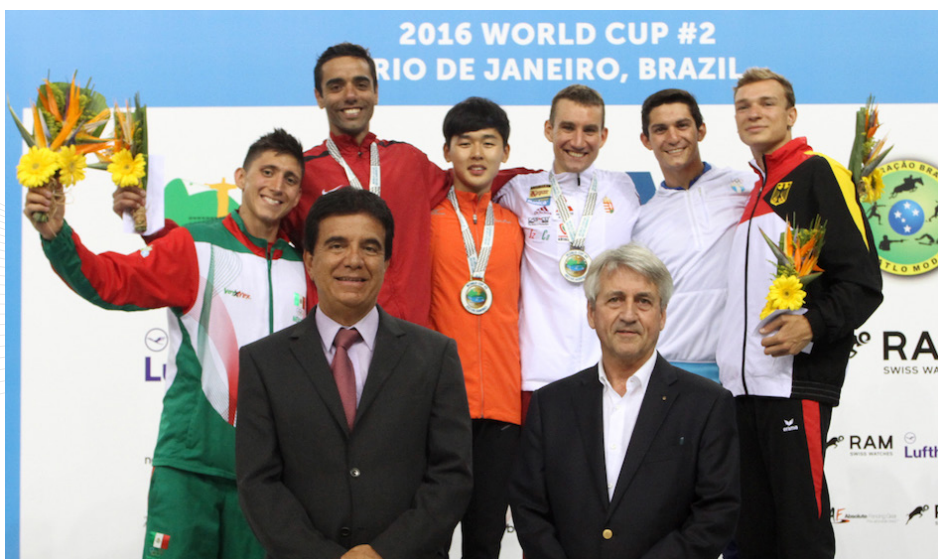
PODIUM OF THE MEN'S INDIVIDUAL EVENT

His emergence has been so convincing that he is now perhaps Asia's best chance of an Olympic medal when the world's best Modern Pentathletes return to Rio de