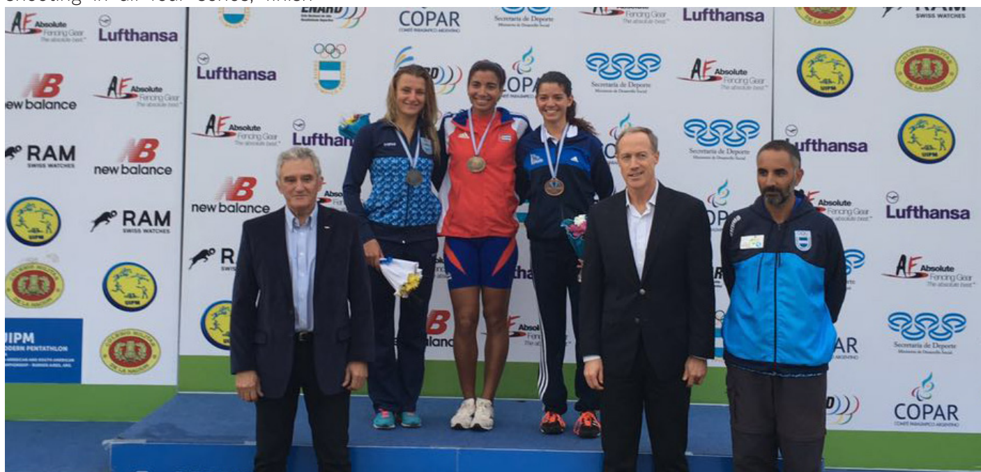
THE AWARD CEREMONY OF THE WOMEN'S INDIVIDUAL COMPETITION

The South American Senior and Junior Championship also took place simultaneously with the Pan American event.