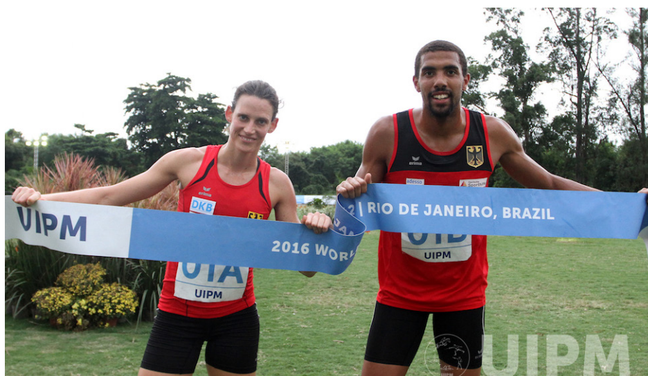
THE GERMAN TEAM AFTER WINNING THE MIXED-RELAY COMPETITION

"This was again a good presentation of our wishes to the IOC ahead of the 2016 Olympic Games."