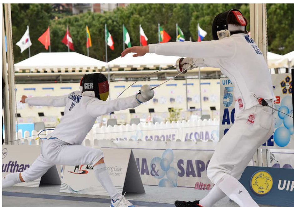
THE FENCING BONUS ROUND SHOWCASED FANTASTIC MOMENTS TO THE ITALIAN AUDIENCE

"This competition shows, with a German finishing in fifth place and a Czech athlete finishing third, how close they started and the drama we had on show for the spectators here today.