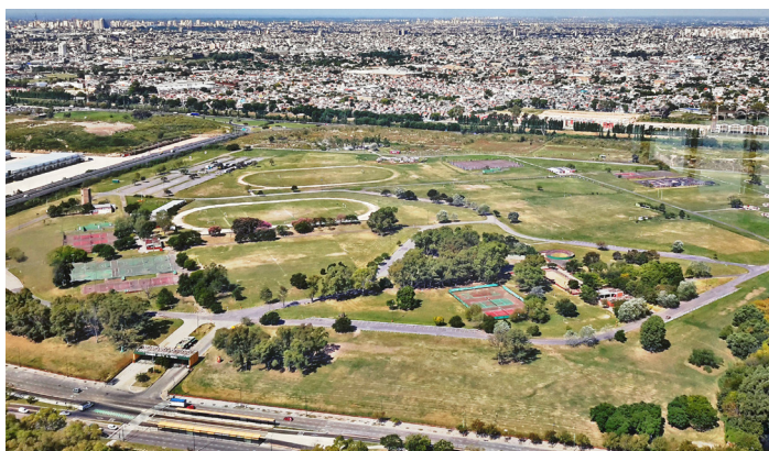
THE MAIN AREA FOR THE SUMMER YOUTH OLYMPIC GAMES 2018 FOR OLYMPIC VILLAGE AND DIFFERENT SPORTS, INCLUDING MODERN PENTATHLON.