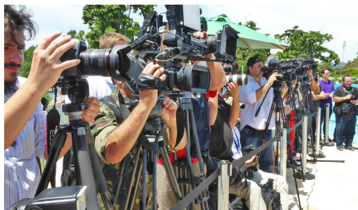
THE UIPM 2016 WORLD CUP #2 GOT THE ATTENTION OF HUNDREDS OF LOCAL AND INTERNATIONAL MEDIA NETWORKS

The Olympic Test Event was incorporated into World Cup II in Rio de Janeiro. On March 9 the Organizing Committee of Rio 2016 held the opening ceremony of the official Olympic summer pool for Modern Pentathlon in Deodoro under the Chair of Rio 2016 President Carlos Arthur Nuzman (NOC President and IOC Honorary Member) in the presence of Aloizio Mercadante, Minister for Education, George Hilton General, Minister of Sports, and Joaquim Monteiro, President of the Municipal Olympic Company.