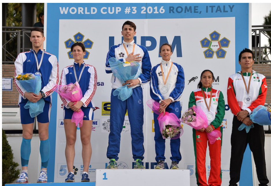
THE MIXED RELAY PODIUM