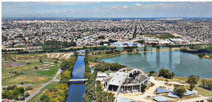
A GENERAL VIEW OF THE VENUES WHERE THE YOUTH OLYMPIC GAMES 2018 WILL BE HELD