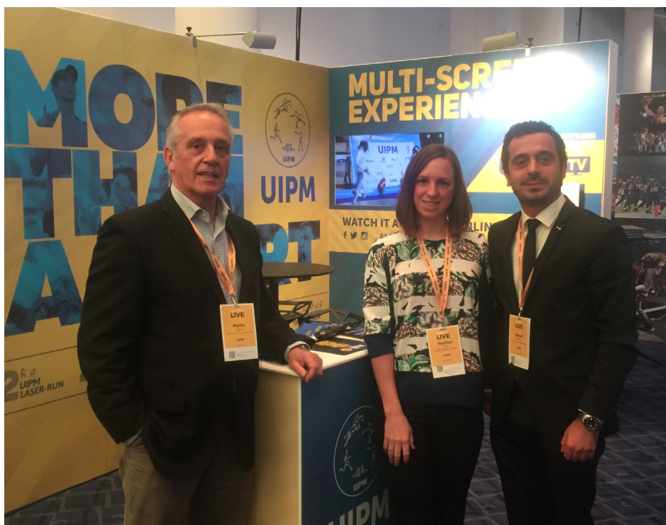
THE UIPM STAND AT THE 2016 SPORTSPRO LIVE

He was a highly respected and admired figure in our sport, not only in Egypt which has become a true Modern Pentathlon stronghold, but also worldwide. He will be greatly missed by the global Modern Pentathlon family.