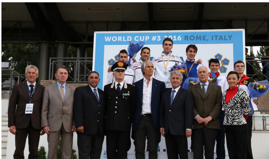
PODIUM OF THE MEN'S INDIVIDUAL EVENT

top spot despite having started the Combined Event in ninth place, albeit that only 17 seconds separated him from pack leader Amro El Geziry (EGY) – the winner of gold at World Cup #1 in Cairo in February.