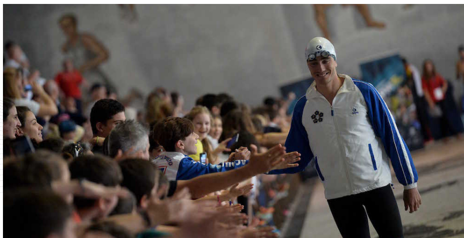
A YOUNG AND VIBRANT CROWD ENGAGED WITH SOME OF THE BEST PENTATHLETES IN THE WORLD IN ROME

Guo (CHN) then secured maximum extra points by coming out on top in the Fencing Bonus Round, defeating Han (CHN) in the final bout.