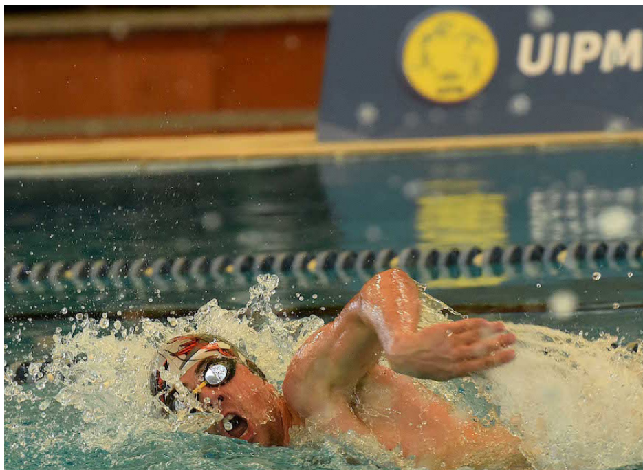
THE MIXED RELAY BROUGHT WORLD CUP #3 TO A DRAMATIC CLOSE

Stay tuned to the main UIPM site pentathlon.org for news and visit our new dedicated TV site uipmtv.org for highlights and live coverage of future events.