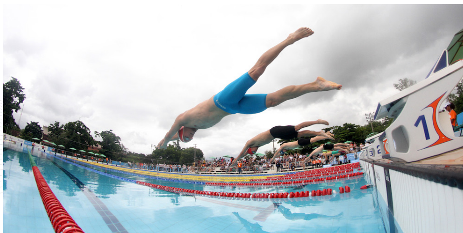
THE DAY OF THE FINALS STARTED WITH THE SWIMMING DISCIPLINE, AS IT WILL DURING THE OLYMPIC GAMES

And so it proved, as Guo (CHN) and El Geziry (EGY) exchanged the lead in the early stages before the race developed into a four-