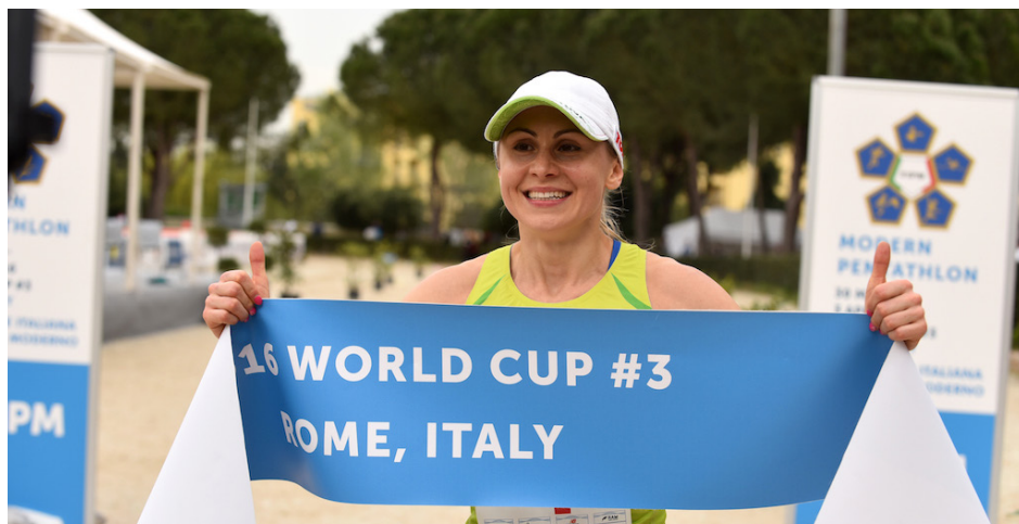
LAURA ASADAUSKAITE (LTU) AFTER WINNING THE UIPM 2016 WORLD CUP #3