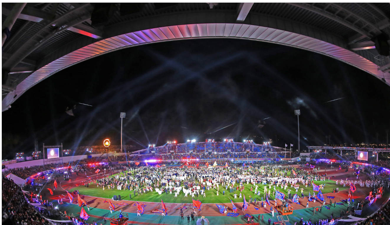
MUNGYEONG (KOR) HOSTED THE 6TH WORLD MILITARY GAMES WHICH FEATURED A MODERN PENTATHLON EVENT