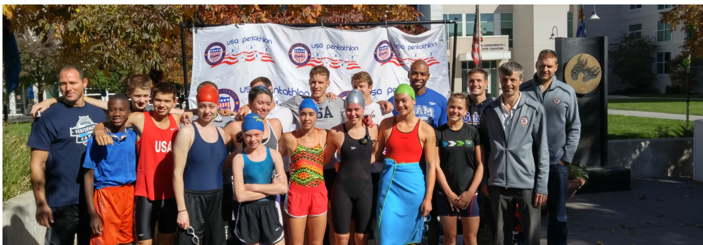
SOME OF THE PARTICIPANTS OF THE US BIATHLE NATIONAL CHAMPIONSHIPS

anti-doping organizations could advance initiatives on a global level by utilizing the collective knowledge of Anti-Doping Organizations and researchers worldwide.