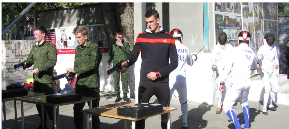
LESSON OF PHYSICAL CULTURE AT THE MILITARY SCHOOL IN ROSTOV, RUSSIA