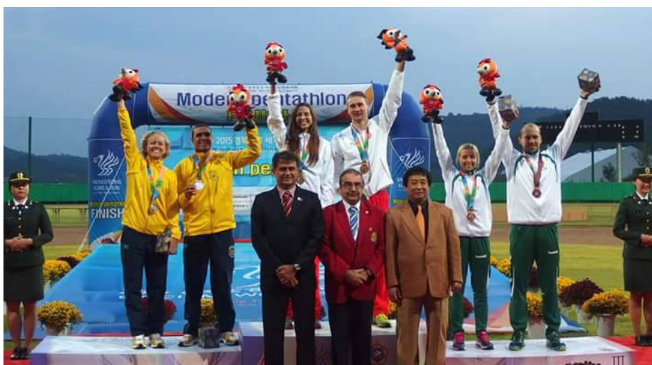
POLAND WON THE MIXED-RELAY COMPETITION FOLLOWED BY BRAZIL AND LITHUANIA

Brazil won the silver medal and Lithuania the bronze medal, outrunning Italy by only one second.