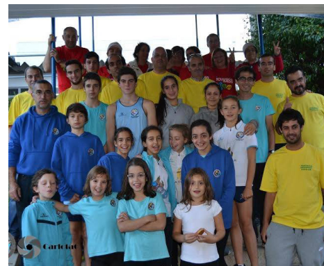
SOME OF THE PARTICIPANTS OF THE PORTUGUESE NATIONAL CLUBS CHAMPIONSHIPS

With the participation of more than 90 athletes from 10 clubs, the city of Covilhã in the interior of Portugal held the National Clubs Championships 2015.