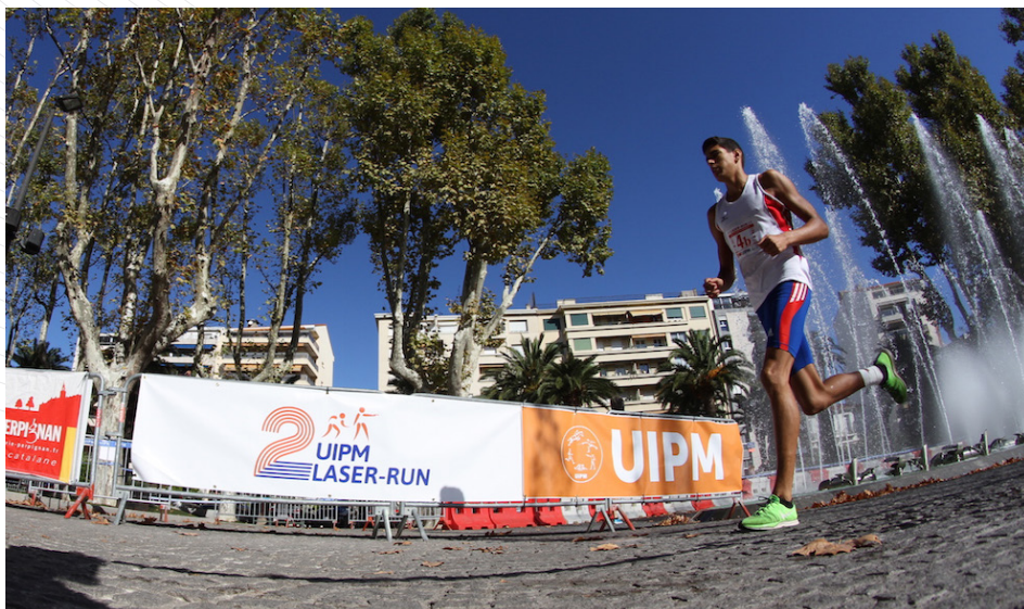
A MALE COMPETITOR PASSES THE FOUNTAIN AT THE PALAIS DES CONGRES

also concentration and dealing with stress.