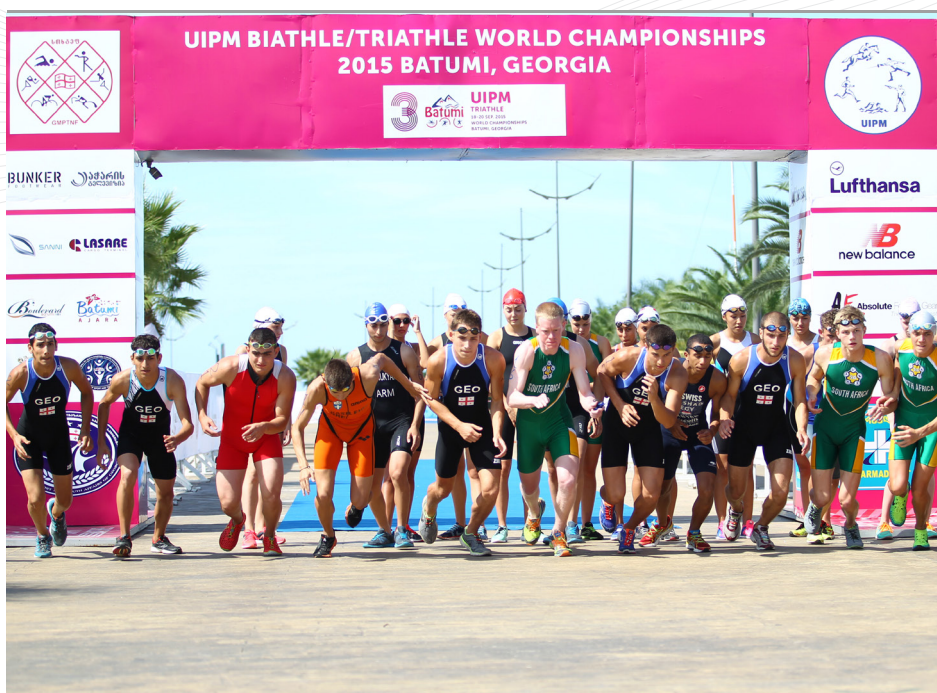
BATUMI, GEORGIA WAS THE HOST OF THE UIPM 2015 BIATHLE/ TRIATHLE WORLD CHAMPIONSHIPS

Egypt once again dominated the headlines on day two as they dominated the Triathle Boys and Girls competition encompassing