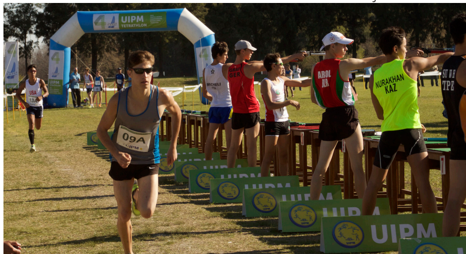
THE COMBINED EVENT BROUGHT THRILLING MOMENTS TO THE CROWD IN BUENOS AIRES

Korea, who had taken both silver and bronze in the Men's individual event, finally showed their class to finish first in the combined in 10.21, but Russia were close behind in second and it was enough to seal gold ahead of the Czechs, Egyptians and the unlucky Koreans, who were pipped to bronze.