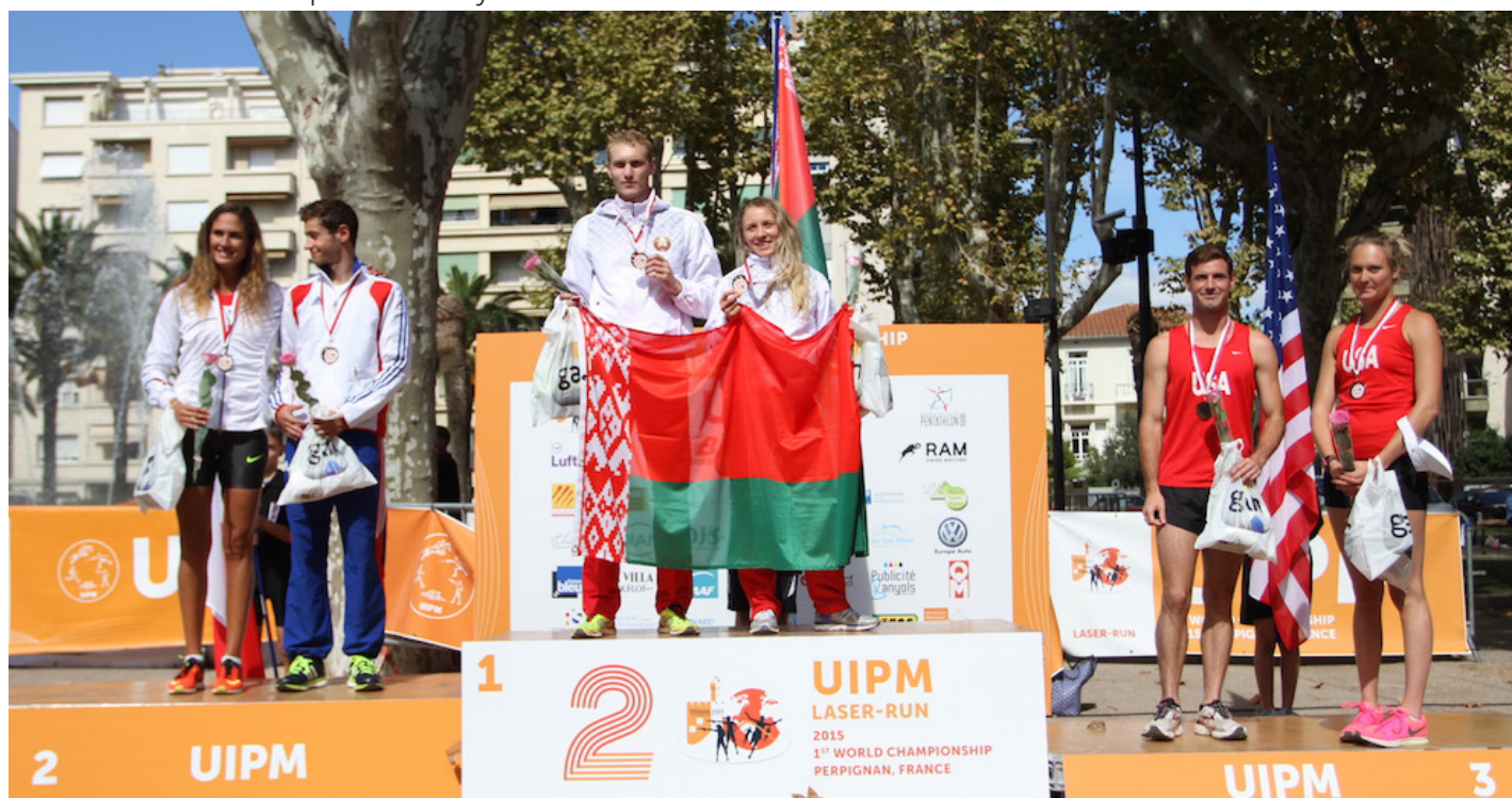
PODIUM OF THE SENIOR MIXED-RELAY EVENT