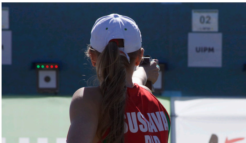
SOME OF THE MOST PROMINENT ATHLETES OF OUR SPORT COMPETED IN ARGENTINA