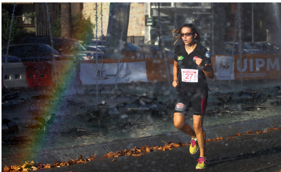
THE INTRODUCTION OF LASER-RUN PRESENTED A GRIPPING SPECTACLE FOR SPECTATORS IN PERPIGNAN