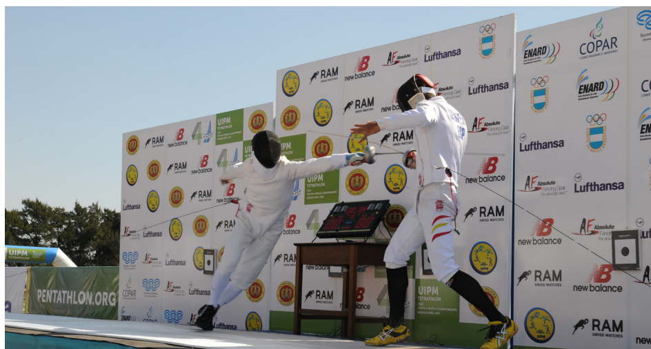
BUENOS AIRES DEMONSTRATED A HIGH DEGREE OF HOSTING PROWESS AHEAD OF THE 2018 YOUTH OLYMPIC GAMES