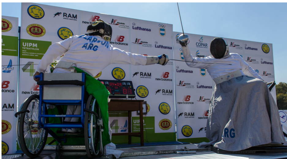
PARA-FENCING EVENT IN BUENOS AIRES, ARGENTINA

UIPM will continue to strive to develop the Para-Pentathlon movement with the aim of introducing the sport in time for the 2024 Paralympic Games.