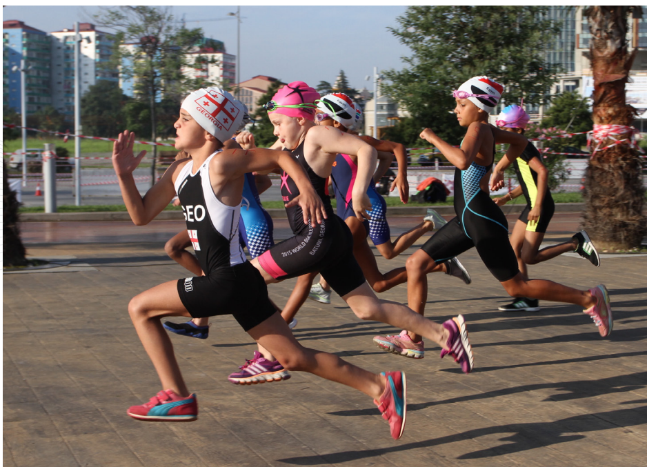
AN EVENT FOR ALL THE AGES IN THE STREETS OF BATUMI

"I am sure next year in Florida we will double the participants and