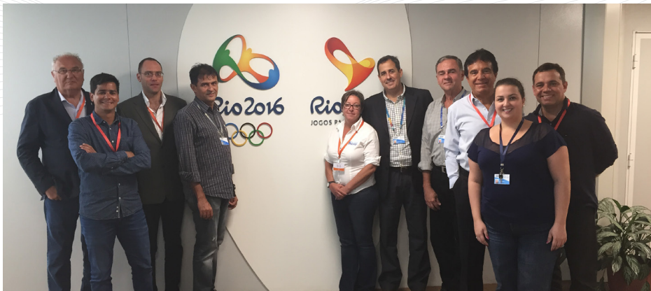
UIPM REPRESENTATIVES WITH RIO 2016 MODERN PENTATHLON ORGANISERS DURING THE SITE VISIT

The 4 days of meetings and venue visits were highly successful for both UIPM and the Organising Committee, resulting in the near finalisation of all the venue plans, including the location of the Fencing Bonus Round on the Field of Play as well as agreement of a shorter competition timetable. There was an update on all activities by Rio 2016, including the sourcing of the horses for both the Test Event