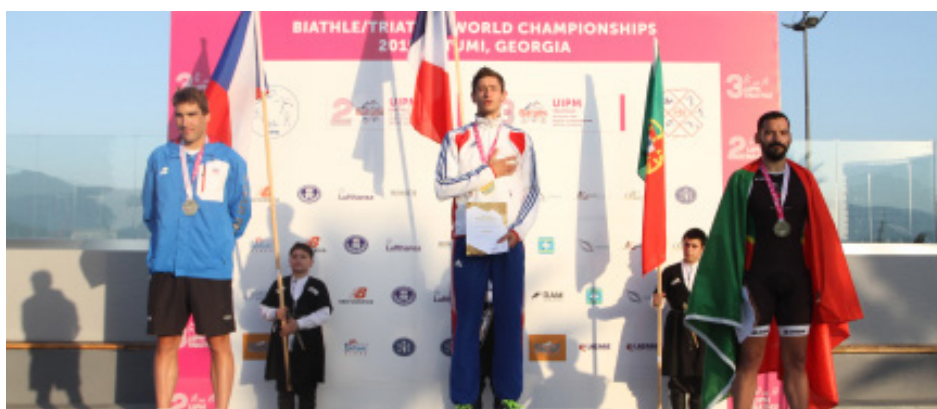
PODIUM OF THE BIATHLE SENIOR MEN'S COMPETITION