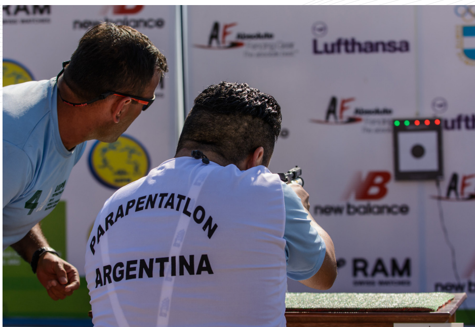
FOR THE FIRST TIME THE ATHLETES HAD THE OPPORTUNITY TO COMPETE IN A PARA-COMBINED EVENT