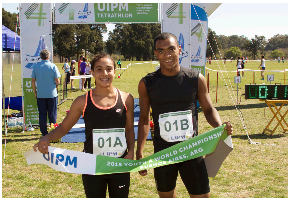
THE MIXED-RELAY EVENT WINNERS

A spirited challenge from both rivals in the Combined event looked like it may knock the Germans off top spot when the British team finished first in 12.19 with the Russians just a second back. However Germany held firm to take fifth place in the Combined and the gold medal. Britain took silver and Russia bronze.