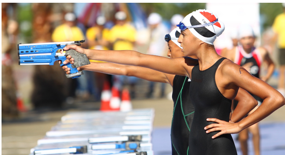
FEMALE ATHLETES SHOW THEIR SHOOTING PROWESS IN BATUMI