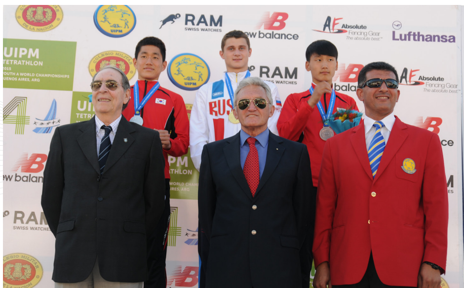
PODIUM OF THE MEN'S INDIVIDUAL FINAL