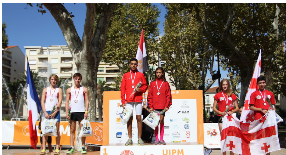
YOUTH B MIXED-RELAY EVENT PODIUM

"I'm sure we will have a lot of new athletes. Parents can enjoy it with their kids and it can help to develop citizenship within sport. At the same time it is fun, it is good for education, it is about physical exercise but