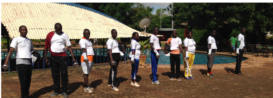
BURKINA FASO DEVELOPMENT CAMP

Athletes from six nations - Benin, Burkina Faso, Ivory Coast, Mali, Niger and Togo - took part and many of them travelled by bus for as long as 30-35 hours to be involved.