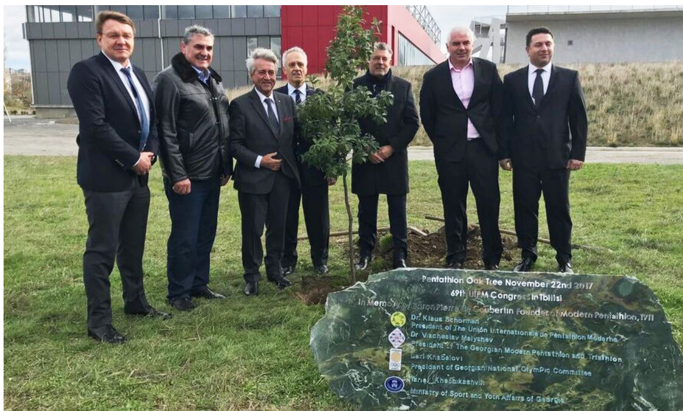
The oak-tree planting ceremony outside Olympic Park in Tbilisi (GEO) on the eve of the 2017 UIPM Congress