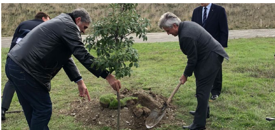
The oak-tree planting ceremony outside the Olympic Park