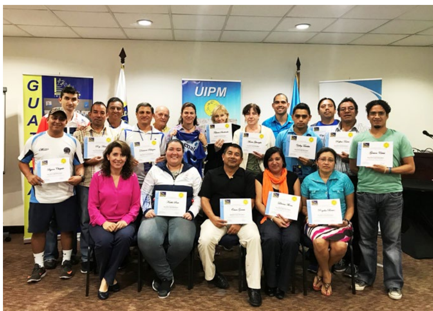
Delegates at the Level 2 UIPM Coaches Certification Course with their certificates