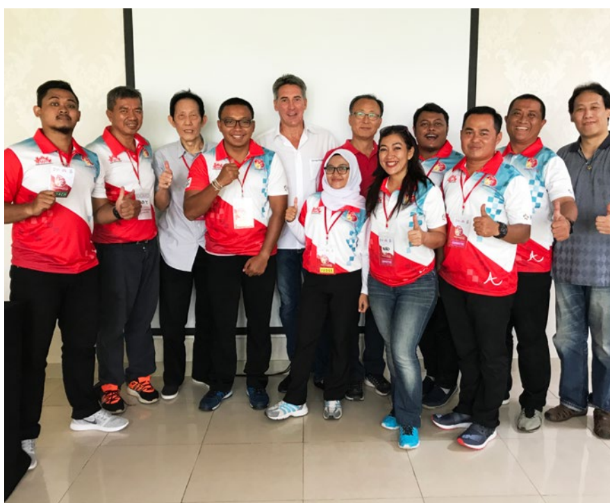
UIPM technical officials in Jakarta (IND) give the thumbs-up for the Judges Certification Programme