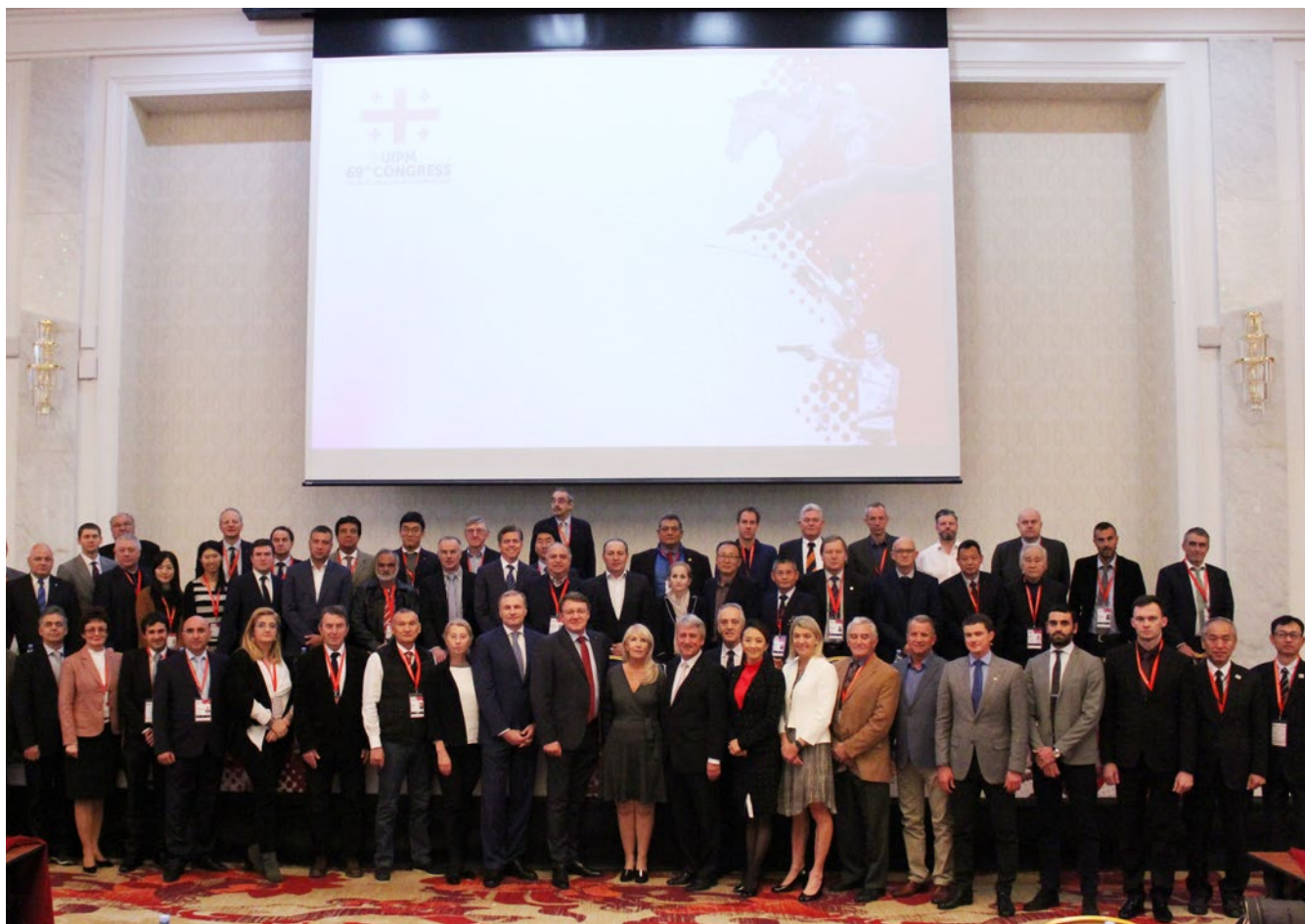
Delegates at the 2017 UIPM Congress

Away from the competition circuit, Congress voted for the creation of Modern Pentathlon Coubertin Day, which will take place annually with National Federations taking part in