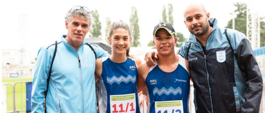
The young pentathletes of Argentina are excited at the chance to compete in Buenos Aires

In the first Newsletter of 2018 we will bring you news of the African qualifier in Lagos (NIG) taking place on December 7, 2017.