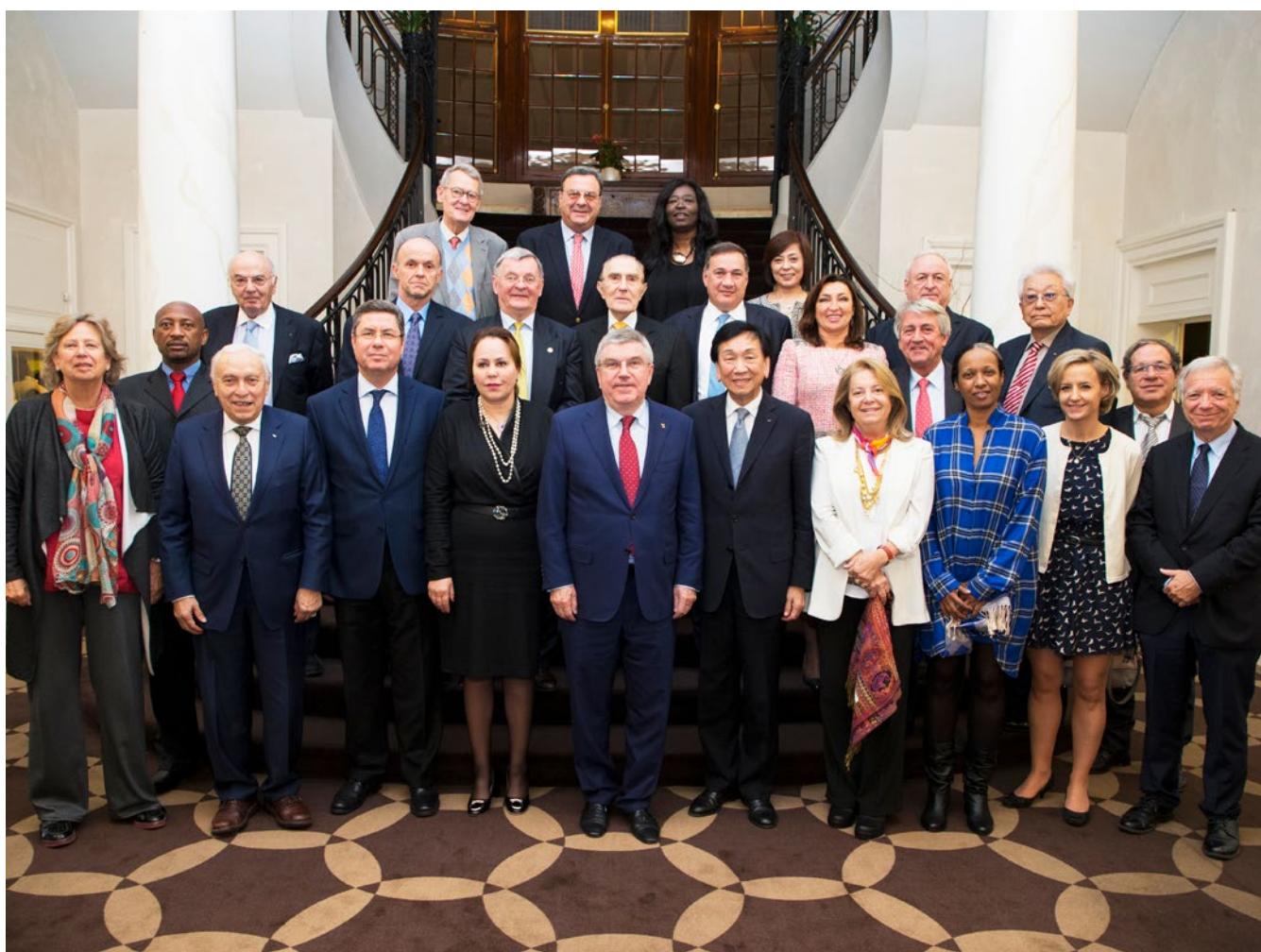
Members of the IOC Commission for Culture and Olympic Heritage

Also on November 8 the UIPM President and Secretary General met