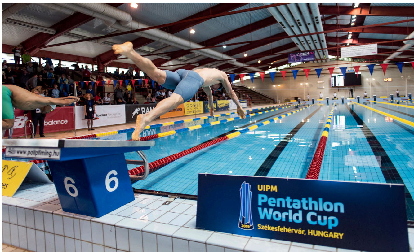
Men's Final action from the Swimming pool