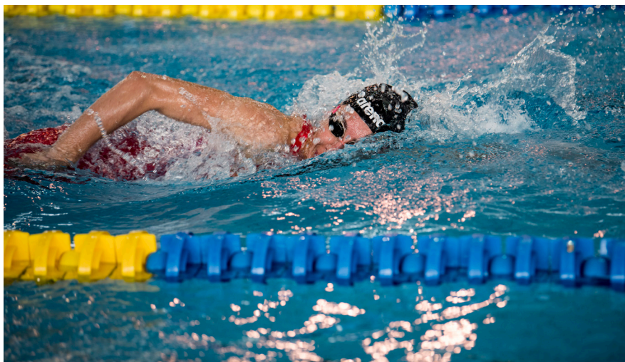
Action from the Swimming pool

perfect, and in the Laser Run I had 33sec but I knew that Ilke is a very good runner and she came hard.