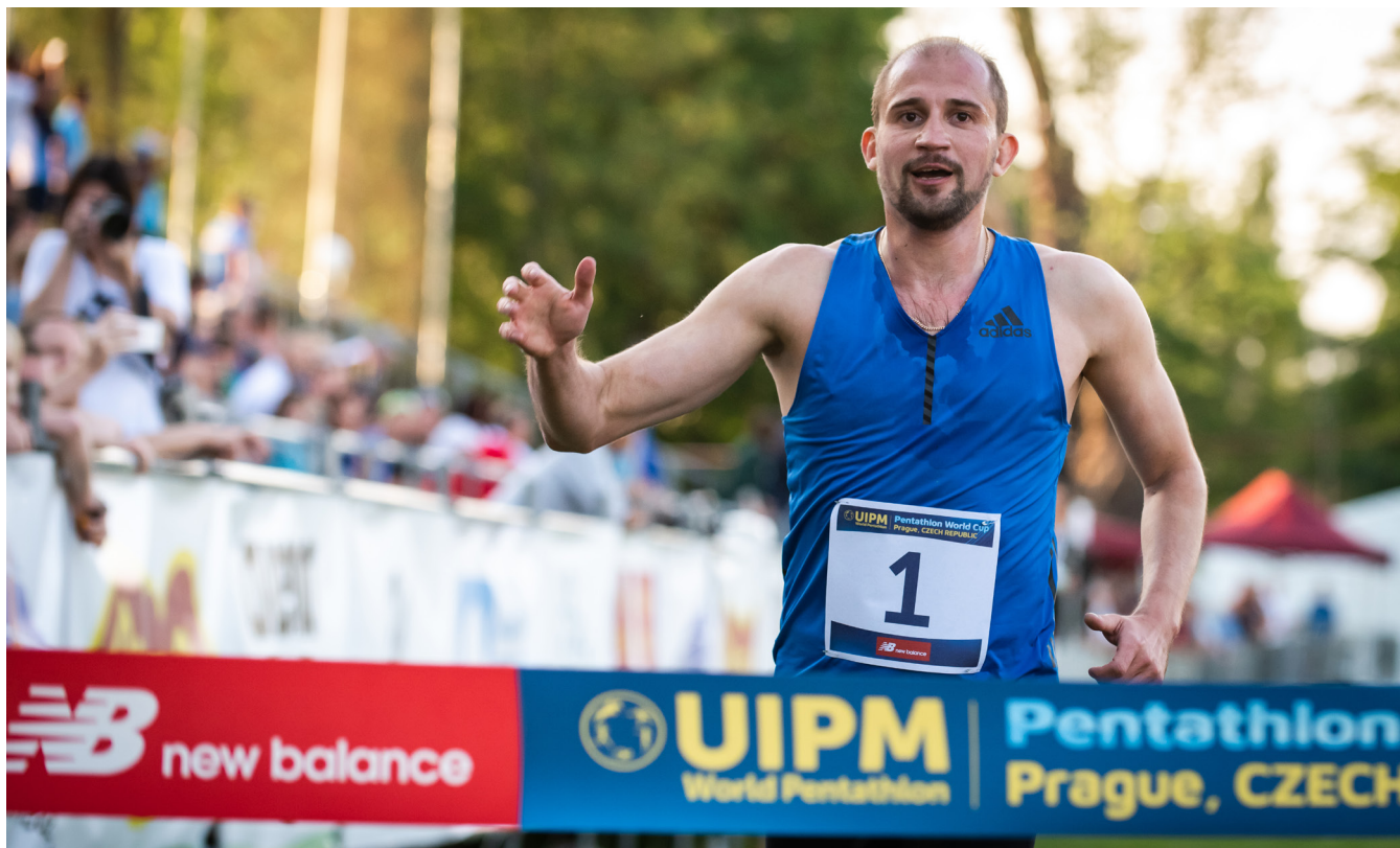
... but neither of them could stop the Olympic champion Alexander Lesun (RUS) from taking the tape and winning gold

There were perfect scores of 300 for Rio 2016 Olympic silver medallist Pavlo Tymoshchenko of Ukraine and Sebastian Stasiak of Poland, while another eight athletes incurred only minor time penalties, with Martin Bilko (CZE) delighting the crowd with a score of 299.