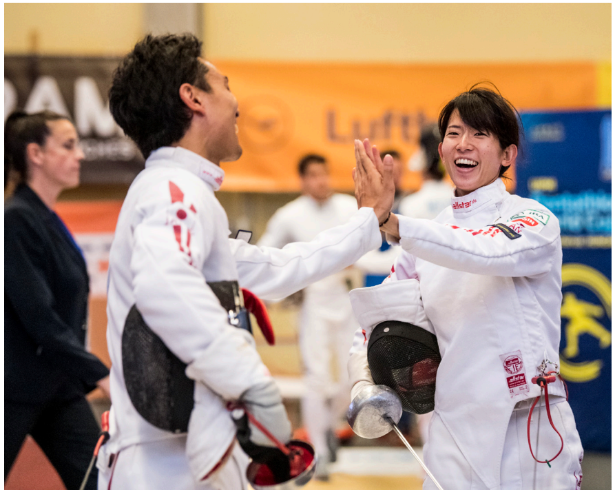
A high five for China (Bian/Han) during the Fencing Ranking Round

Day so this is a present for my mother."