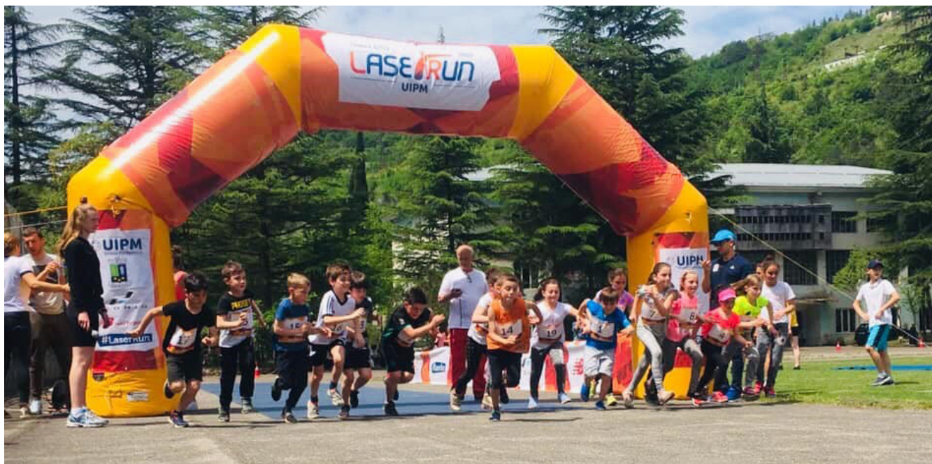
Boys and girls set off in unison at the start line