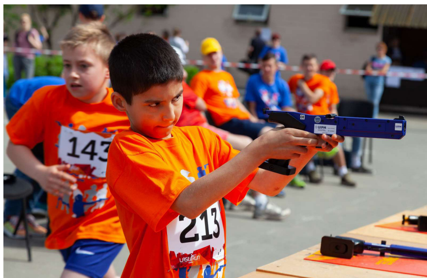
Steely focus from a junior athlete in Kiev (UKR)