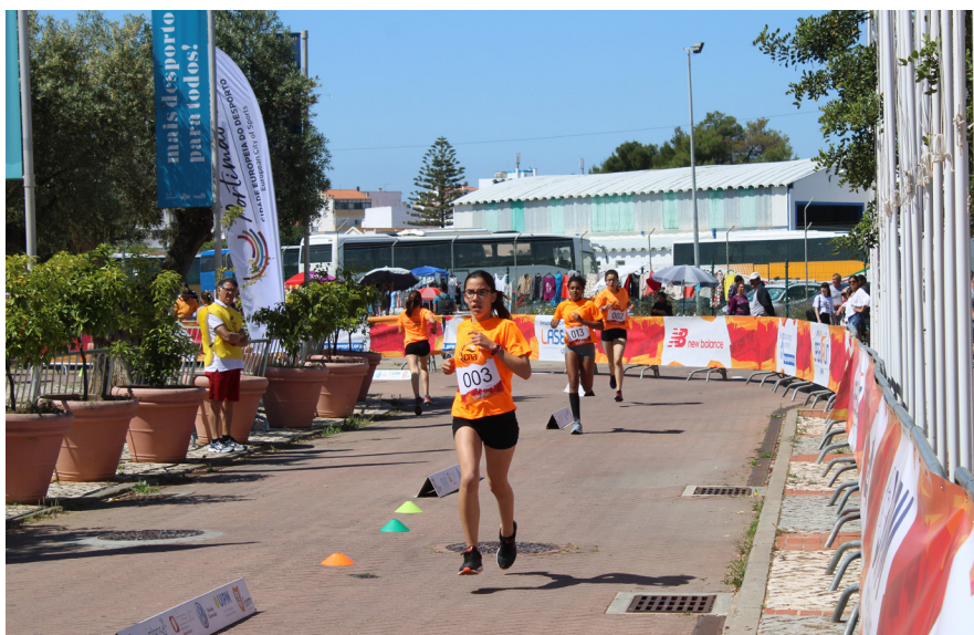
Urban sports in the sunshine in Portimao (POR)

A spokesperson for the local organising committee said: "This was a very successful instalment of the UIPM Global Laser Run City Tour and it was wonderful to see so many athletes of different ages and backgrounds taking part. Parents of young athletes took