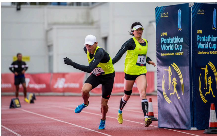
Handover time for the Chinese duo