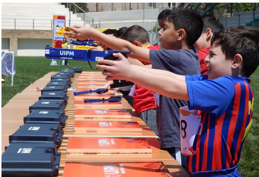
Deep concentration on the range in Yerevan (ARM)

coaching academy in the country where he had grown up flourished.