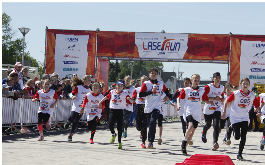
Mass participation in Nizhny Novgorod (RUS)

"Such competitions motivate young generations for further regular training and active lifestyles. The combination of running and shooting tests an