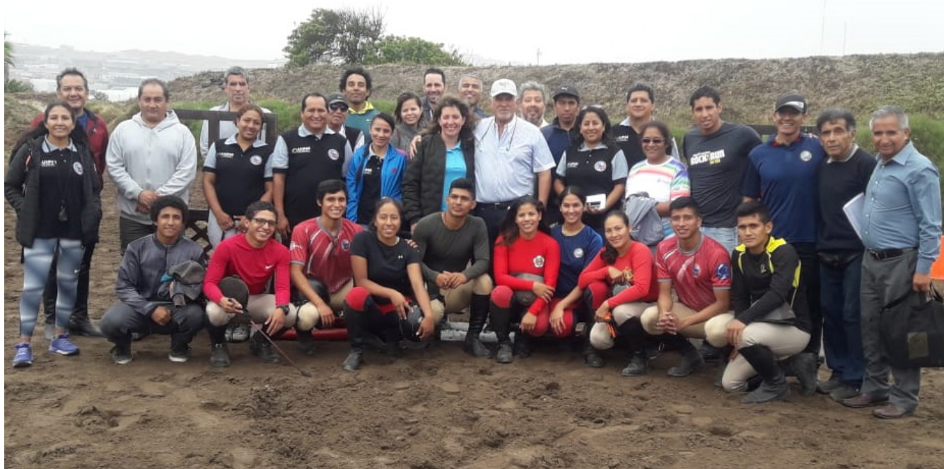
All smiles from the participants in the JCP Level 1 course in Lima (PER)

"I'm sure the commitment and dedication of this group will help to ensure a fantastic spectacle for pentathlon in July and we are all very much looking forward to it."