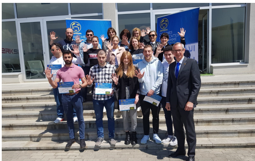
High fives all round in Tbilisi (GEO)