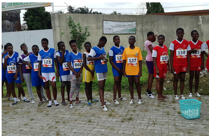
Boys and girls wait for their turn to give Laser Run a try

The GLRCT in Abidjan (CIV) provided one of the visual highlights of the 2018 season, a photograph of a mass group of young participants beaming with joy after their first Laser Run.