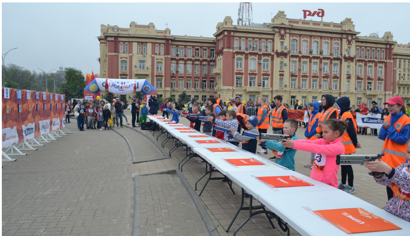
Action from the shooting range in Rostov-on-Don (RUS)

from Rostov-on-Don, Novocherkassk, Shakhty, Taganrog, Belaya Kalitva and other cities of the Rostov region, as well as Krasnodar and Chelyabinsk.