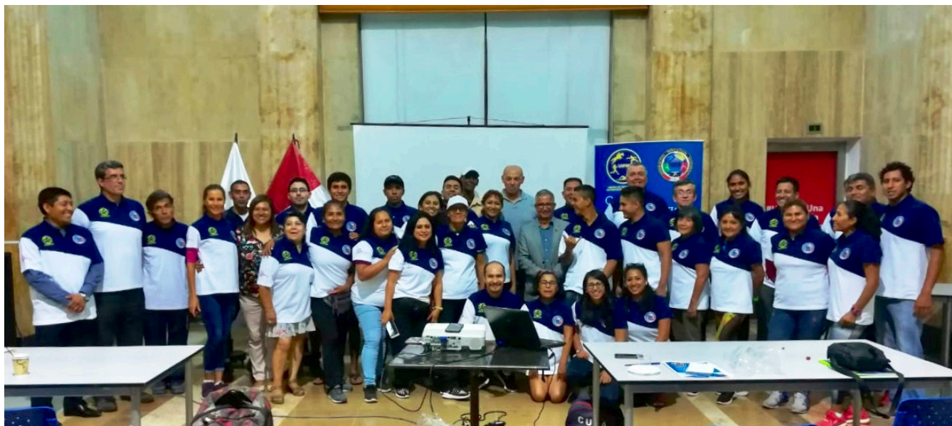
Dozens of coaches enjoy their CCP course in Lima (PER) ahead of the 2019 Pan American Games

the ladder of Coaching Certification Programme (CCP).