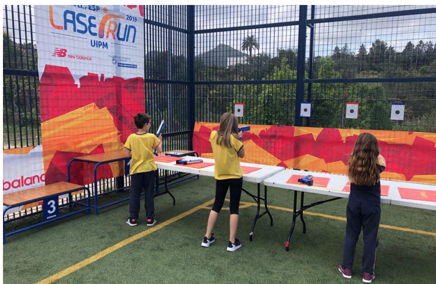
Boys and girls competing side by side in Sant Boi de Llobregat (ESP)

and girls from Fundacio Llor School competed in UIPM's fastest-growing development competition, the Global Laser Run City Tour – hosted for the second time in the city.