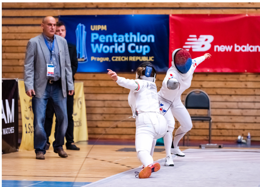
Action from the Fencing Ranking Round