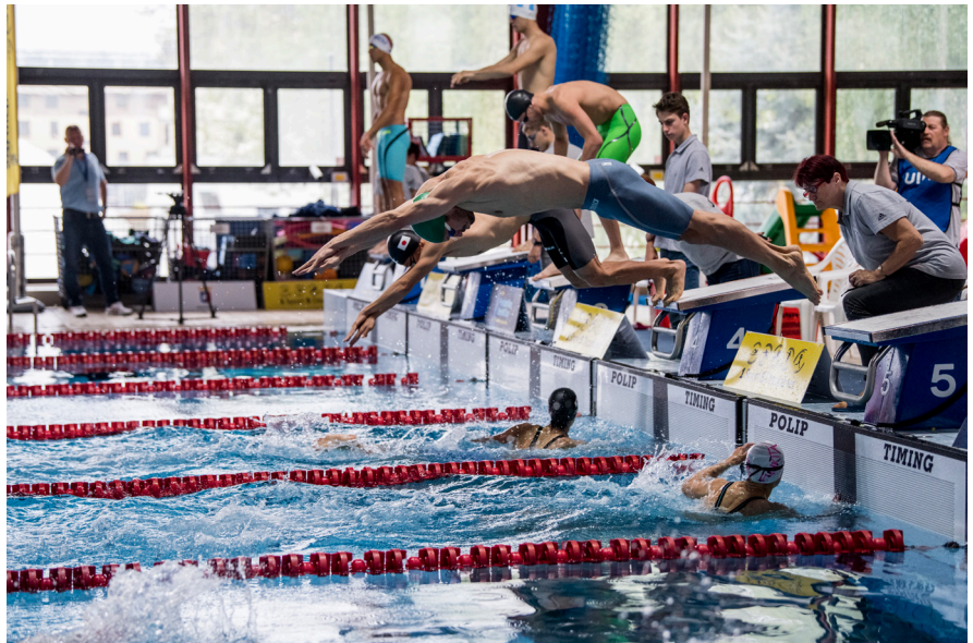
Action from the Swimming pool as the men take over from their female team-mates