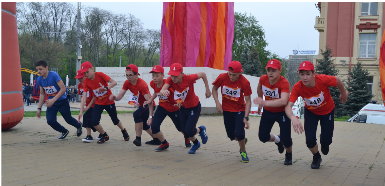
Action from the start line as junior male athletes embark on their race in Rostov-on-Don (RUS)

For the third year in a row, the city hosted UIPM's most progressive and popular development circuit on May 1, where more than 250 participants came