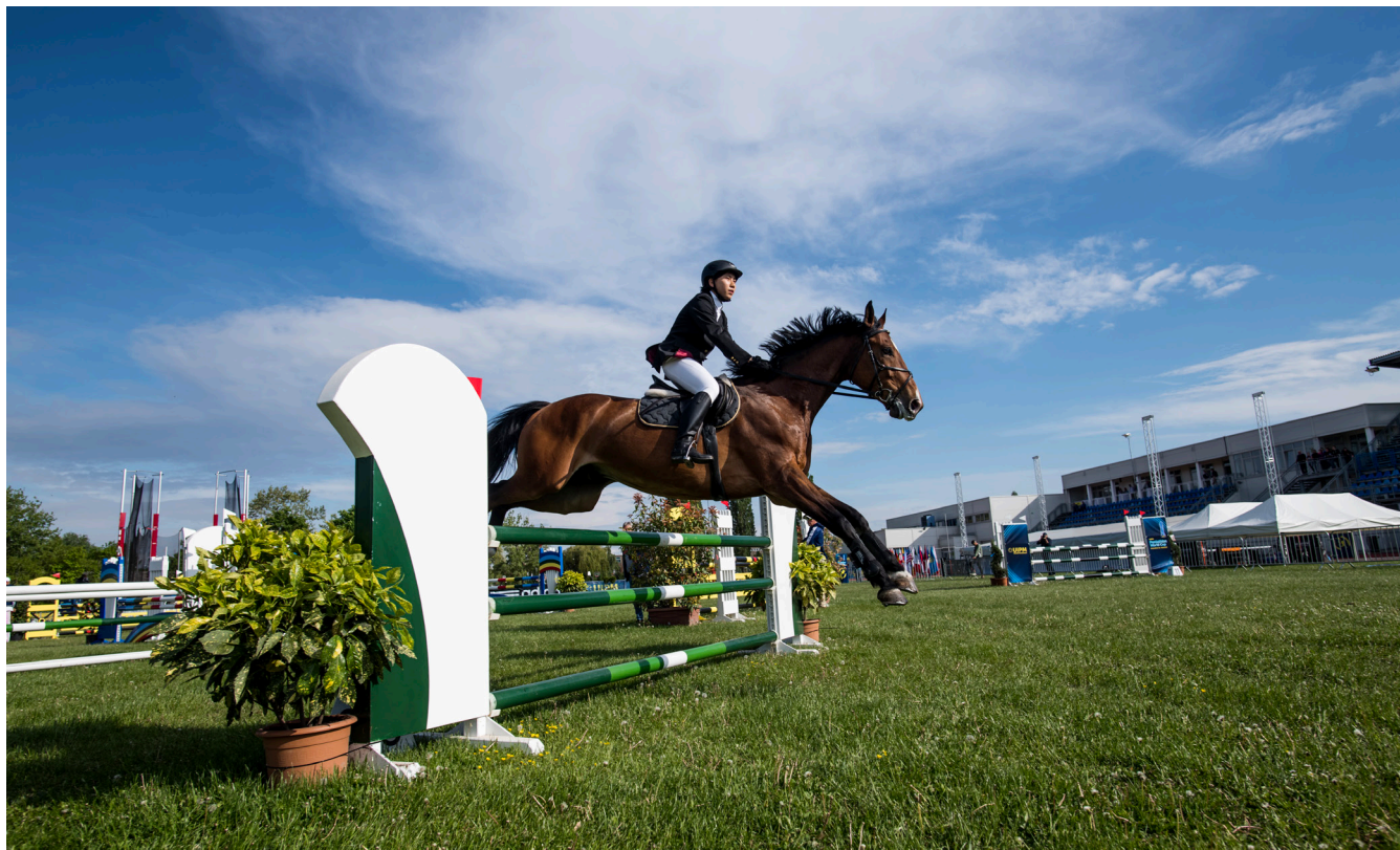
A successful clearance during the Riding under blue skies in Hungary