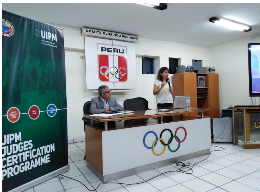
It's presentation time during the JCP course in Lima (PER)

The pentathlon takes place in the opening days of the Games (July 27-30), with 32 athletes of each gender competing in individual and relay events. Five places at Tokyo 2020 will be on offer to female athletes and five