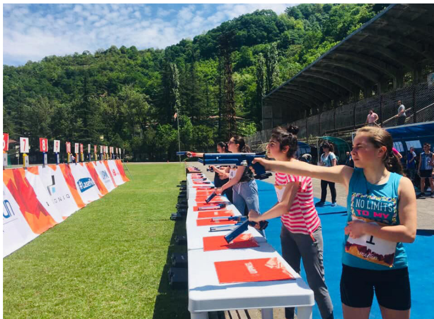
FC Chiatura's stadium becomes a Laser Run venue for a day