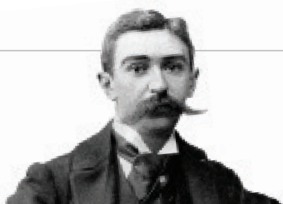
Baron Pierre de Coubertin

"The Modern Pentathlon event would test a man's moral qualities as much as his physical resources and skills, producing thereby the ideal, complete athlete."