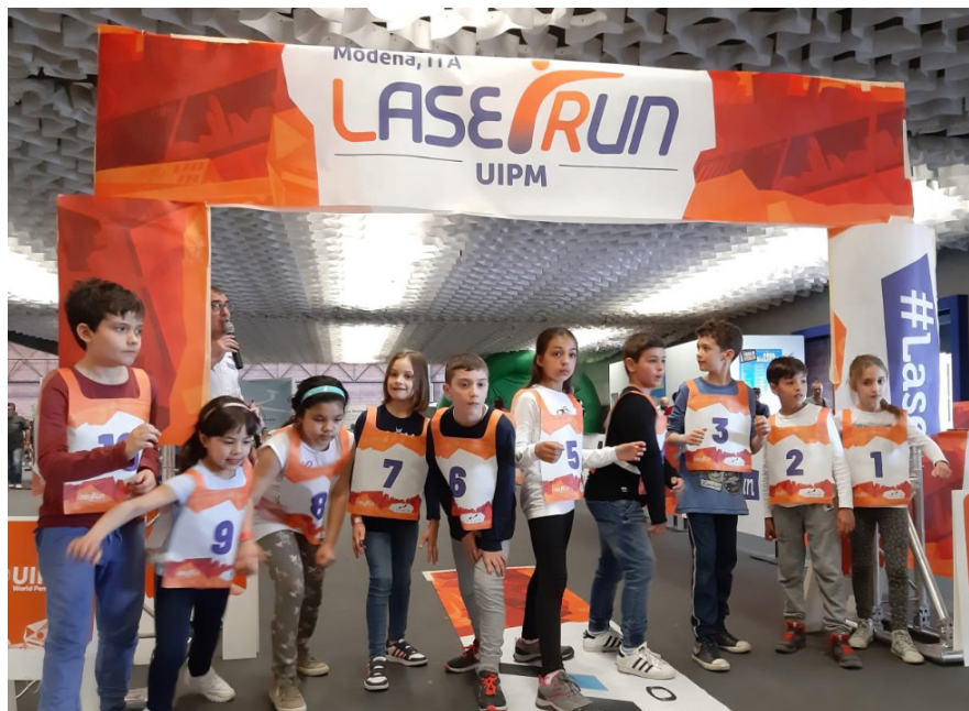
Kids prepare to race at the International Trade Fair in Modena (ITA)

A spokesperson for the local organising committee said: "Many people of all ages, but above all children and young people, ventured into the Laser Run, experiencing the adrenaline of the race and the precision of the shooting