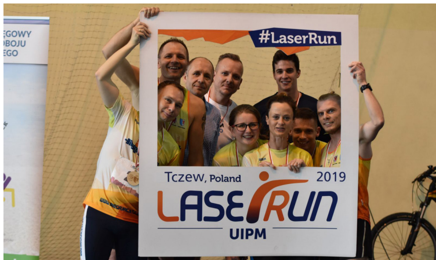
Time for a selfie in the indoor event in Tczew (POL)

Entertainment and barbecue food were provided and the judging of the competition was exemplary, with all