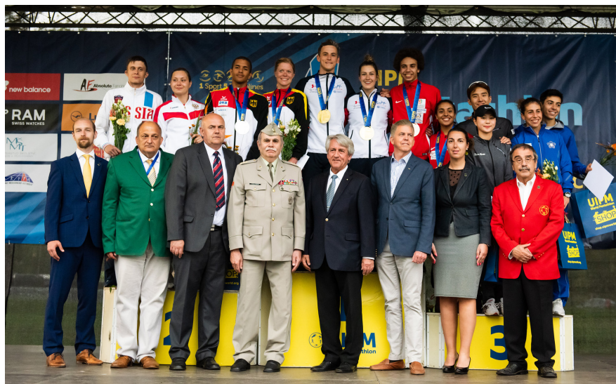
The Mixed Relay podium at UIPM 2019 Pentathlon World Cup Prague