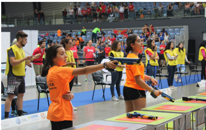
Two female juniors work on their laser shooting technique in Portimao (POR)