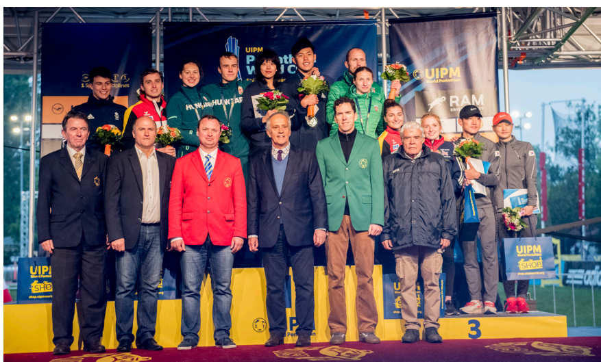
Mixed Relay podium