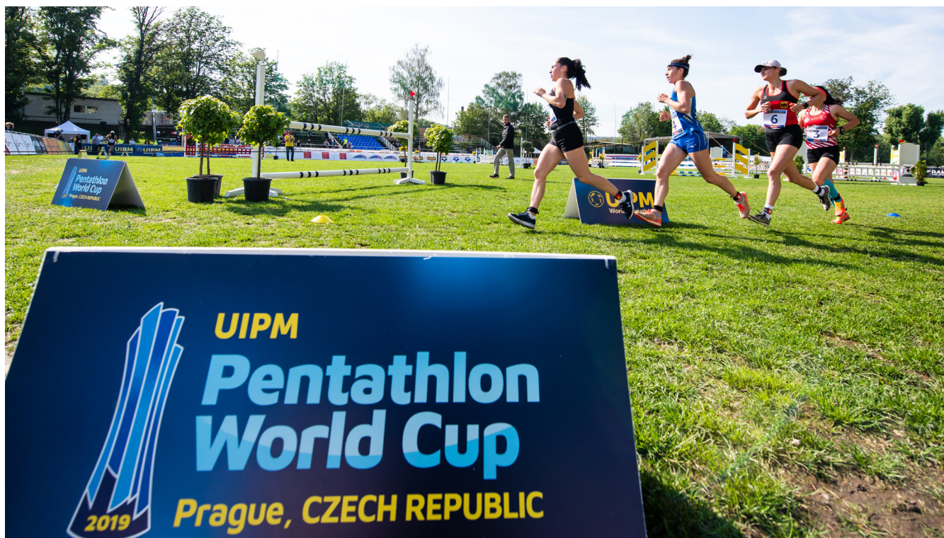
A tight group of athletes run in a pack in Prague (CZE)

The British woman scored 24V/11D in the Ranking Round, the same score as Langrehr (GER), and edged the final encounter in the Bonus Round to add two points to her overall score.