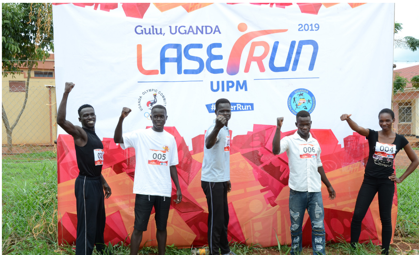
Victory salutes and thumbs up from the senior athletes who participated in Gulu (UGA), who also helped junior athletes with their laser shooting (below)