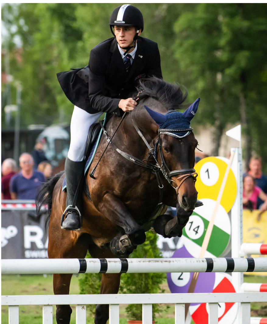
Action from the Riding competition

point lead in the opening discipline. Korea (Kim/Kim) were the next-fastest after winning the final heat in 1:55.65 from Great Britain (Muir/Curry, 1:55.80).