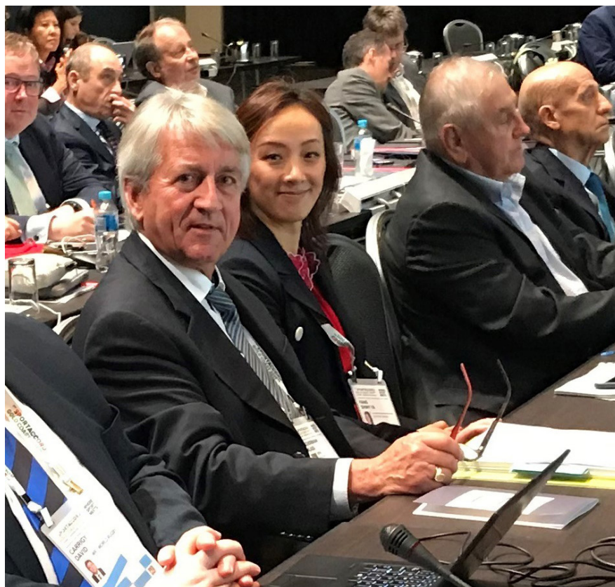
The UIPM President and Secretary General during the ASOIF General Assembly in Gold Coast (AUS)