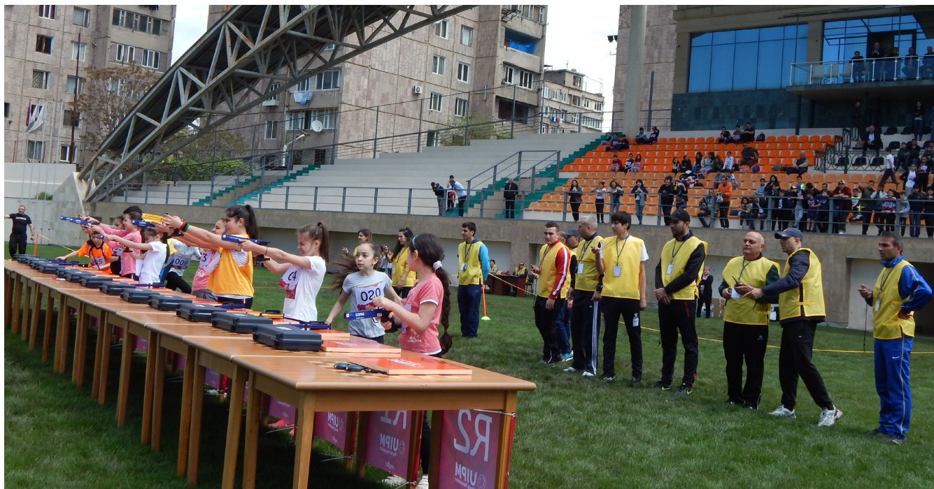
Young athletes dash to the range in Yerevan (ARM)

To ensure people from communities across the country are able to get their first taste of Laser Run during the events, the Modern Pentathlon Federation of Belarus has undertaken various promotional activities.