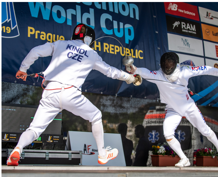
The Fencing Bonus Round resulted in some dramatic moments

(RUS) said: "I fought hard today in my participation in the competition and I am satisfied with the venue, the horses and the course – everything. But I think I can work harder for future success. I'm looking forward to the European Championships, the World Cup Final and World Championships, and I want to congratulate the Russian team as we have come back to the medals."