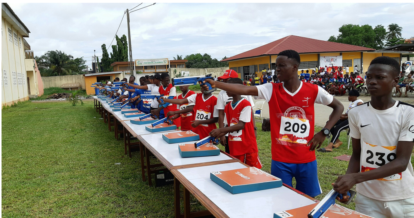
Time for a reload in Abidjan (CIV) as athletes look to get their five shots

technical officials qualified to judge at national level in Pentathlon.