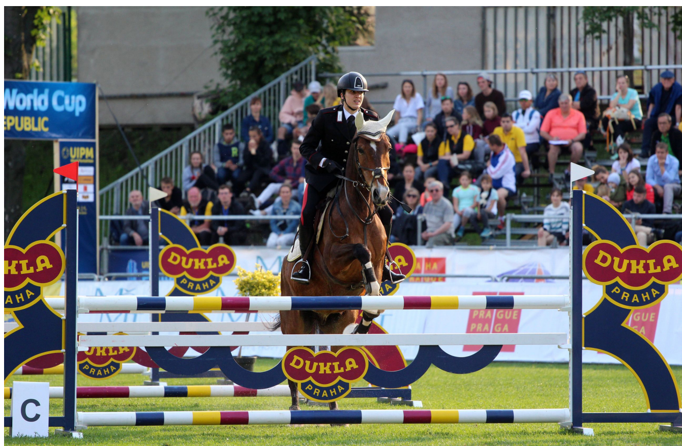
Spectators watch an exciting Riding competition from the stands

With so many of the world's top 10 in attendance for this final chance to earn a trip to Tokyo next month, it was no surprise to see fierce competition on the Fencing piste, and French (GBR) emerged on top but only by a narrow margin.