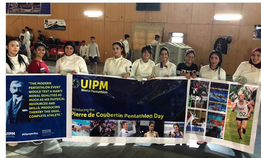
Coubertin's message is displayed on banners (above) as young athletes are awarded medals