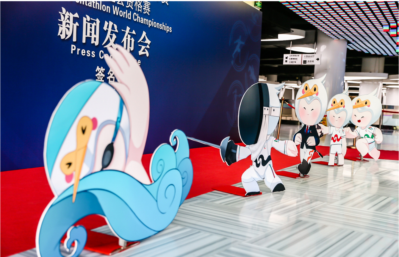
Statuettes representing the five disciplines of Modern Pentathlon are on show in Beijing (CHN)