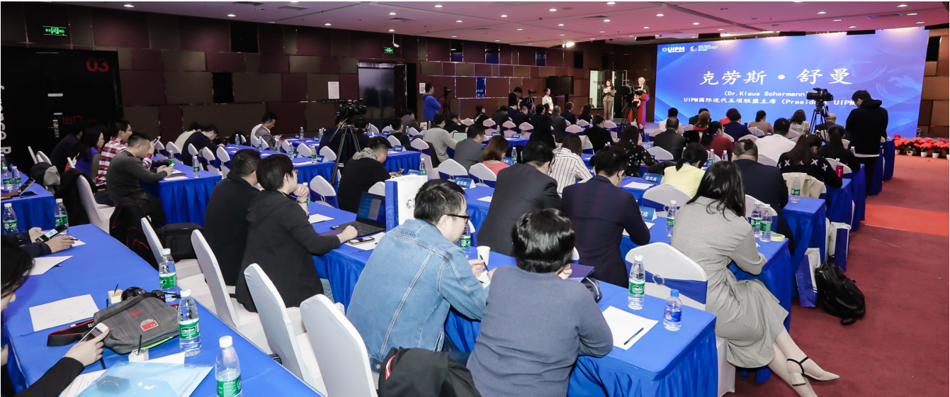
Journalists at the press conference in Beijing (CHN)

the 'Bird's Nest' Olympic Stadium in the capital city of Beijing.