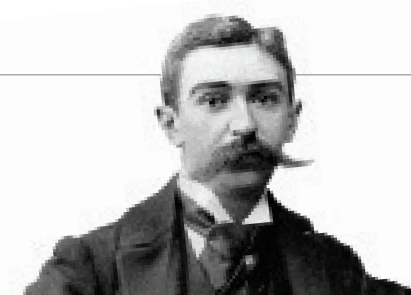
Baron Pierre de Coubertin

! The full New Balance World Rankings are available at www.pentathlon.org