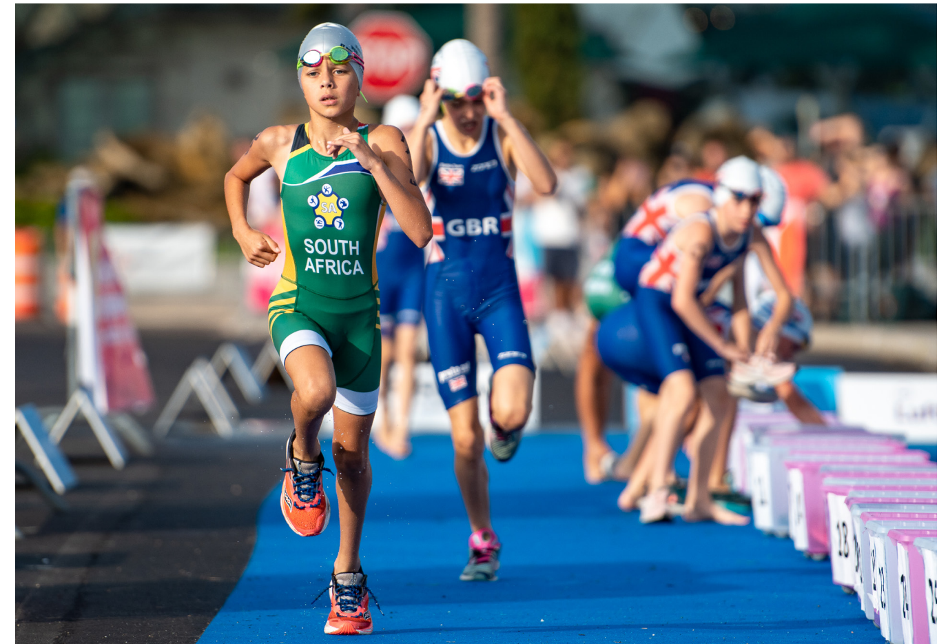
A South African youth strides out in front after a transition from Swimming to Running (above), while a Great Britain athlete emerges from the water (right)

countries took part across Biathlon (Run-Swim-Run) and Triathlon (Swim-Run-Shoot) from October 24-27.