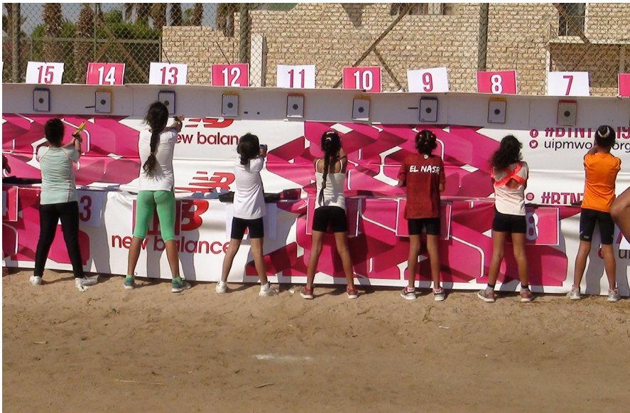
Youth athletes hone their shooting skills on the range in Hurghada (EGY)

excellent development programmes in place, and Hurghada will once again be a focal point in 2020 when it hosts the UIPM Youth World Championships (U19/U17).”