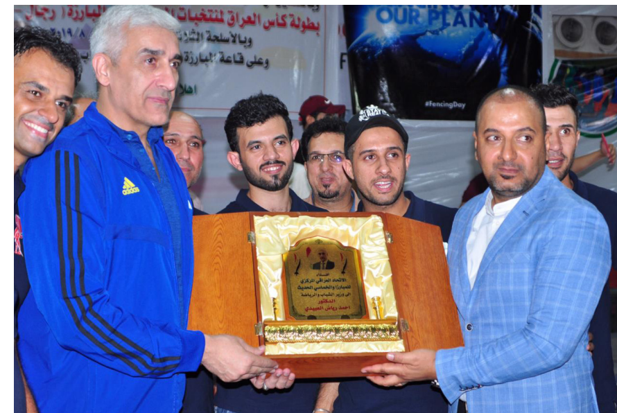
A special presentation to mark the historic celebration of Pierre de Coubertin Pentathlon Day in Iraq