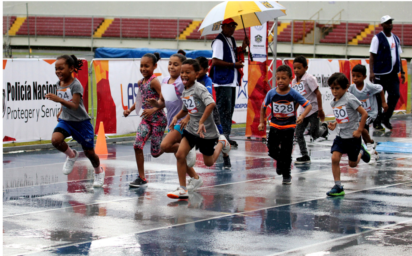
It may be raining but these youth athletes don't seem to mind as they burst from the start line in Panama City (PAN)