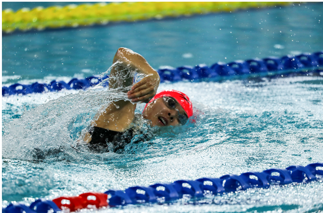
Action from the Swimming pool in Wuhan (CHN) during the 7th CISM World Military Games