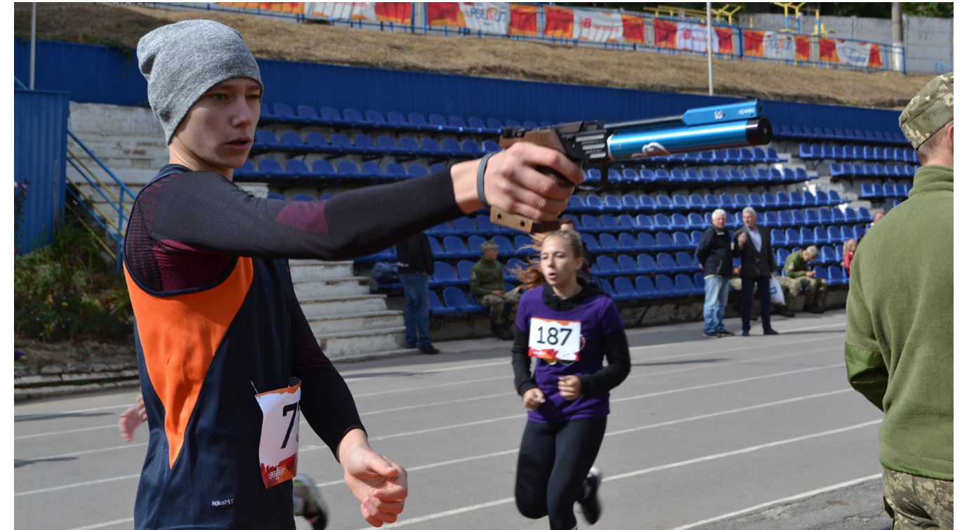
Action from the shooting range and the running track in Kharkiv (UKR)

Racing took place at the military campus of the Kharkiv National Air