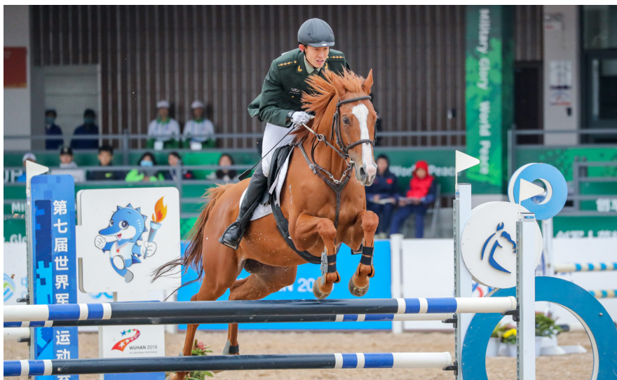
Action from the Men's Riding and Laser Run as an intense competition draws to a close