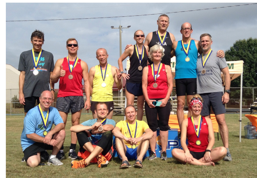
Masters athletes savour their participation in Marietta (USA)

comes in the wake of the recent ECMP Masters European Open Championships in Gyomro (HUN) and demonstrates the global scope of the movement.