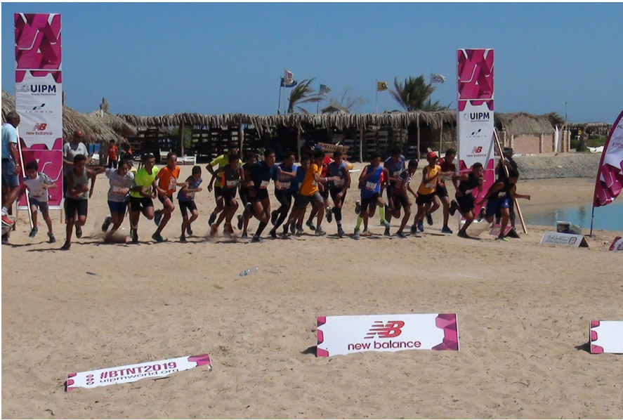
Action from the beach in Hurghada (EGY) where Laser Run met Biathle and Triathle

“Egypt is a true pillar of our Union with