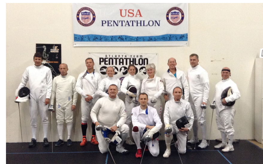
The NORCECA Masters pose after the Fencing discipline