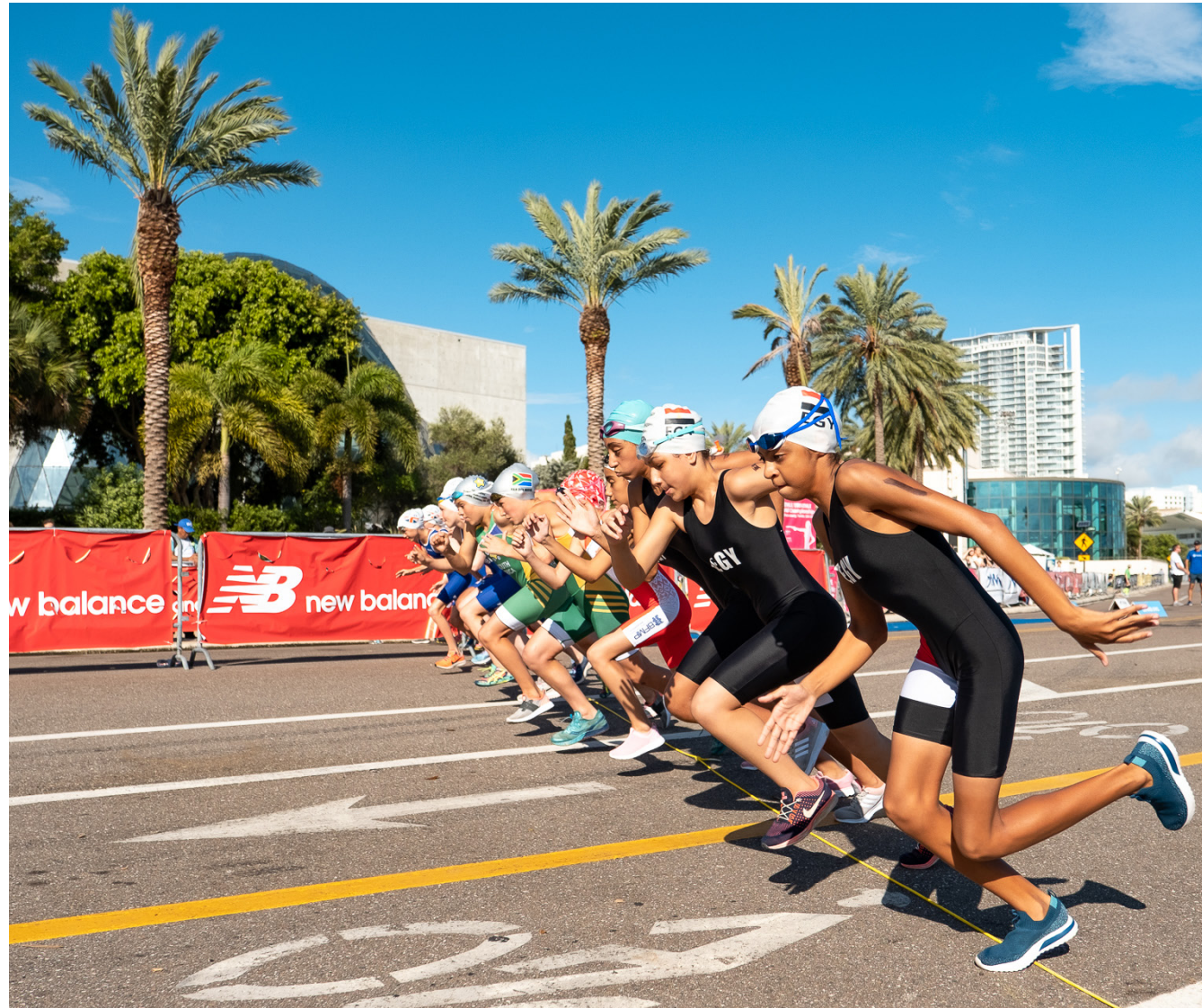
Action from the start line in Saint Petersburg (USA) as youth athletes prepare to test their skills