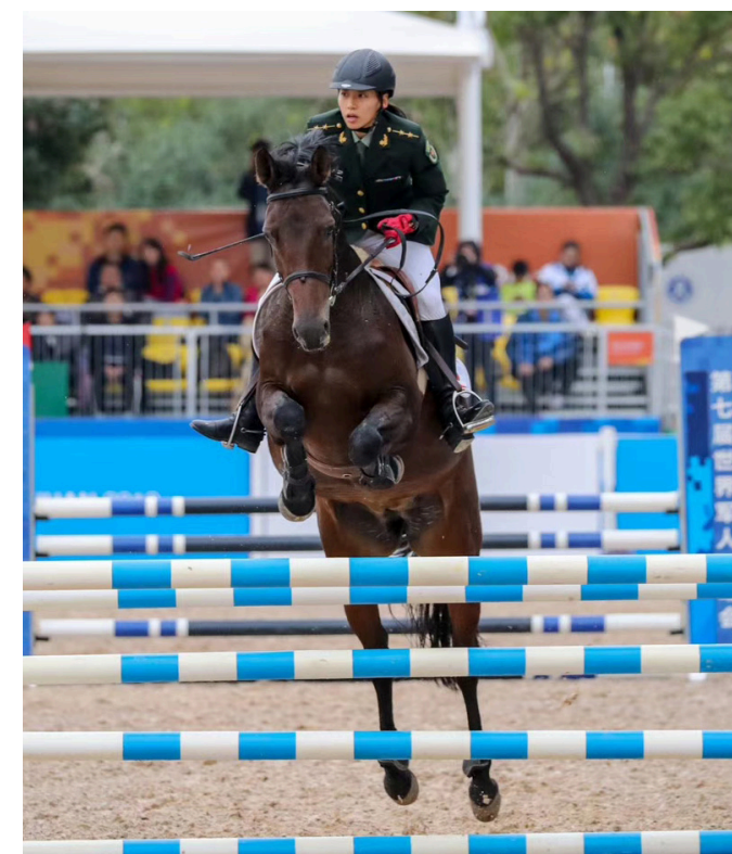
Action from the Riding and Laser Run disciplines of the Mixed Relay on the final day of competition in Wuhan (CHN)