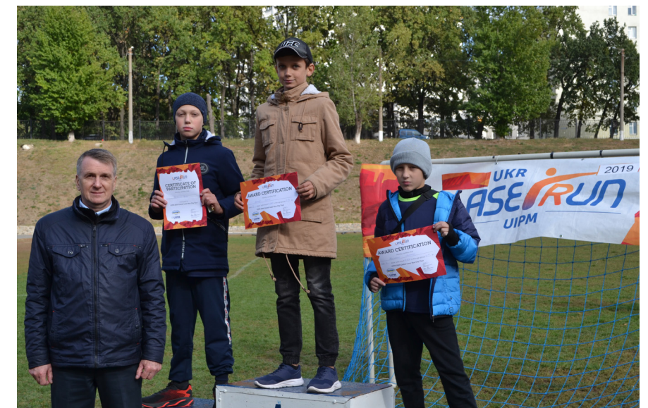
Successful youth athletes pose with their certificates on the podium

"Now the number of young pentathletes in Kharkiv is very big because of the