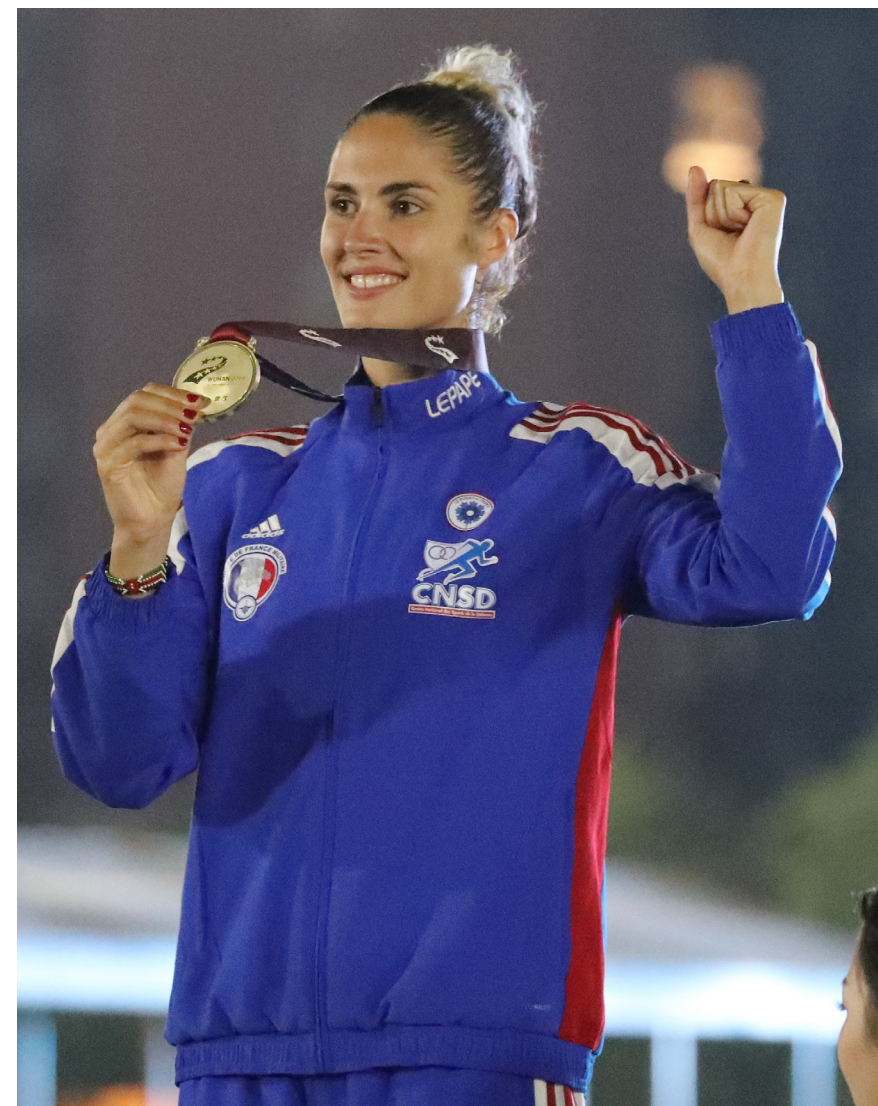
Rio 2016 Olympic silver medallist Elodie Clouvel (FRA) was the Women's Individual gold medallist

2016 Olympic silver medallist almost came unstuck in Riding, conceding 52 penalty points to allow her rivals to catch up in the overall standings.