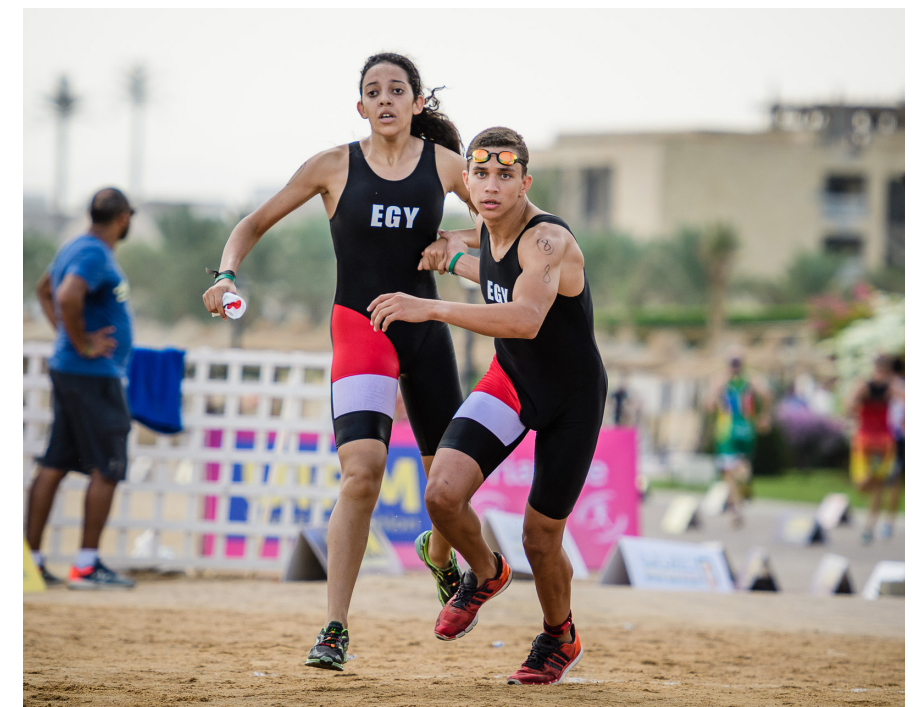
Handover time for Egypt during the Biathlon Mixed Relay