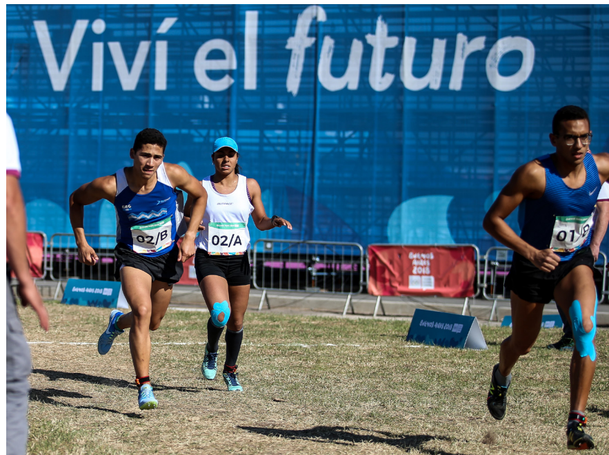
It's handover time in the Mixed International Teams relay

A high-class performance by Elgendy (EGY) & Gu (CHN) put them in the driving seat in the battle for gold. They scored 33V/11D and went on to add two points in the Bonus Round to secure a significant lead in the Laser Run. The next-best performers were