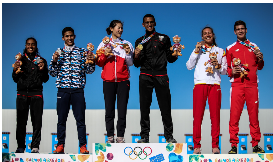
Mixed International Teams podium