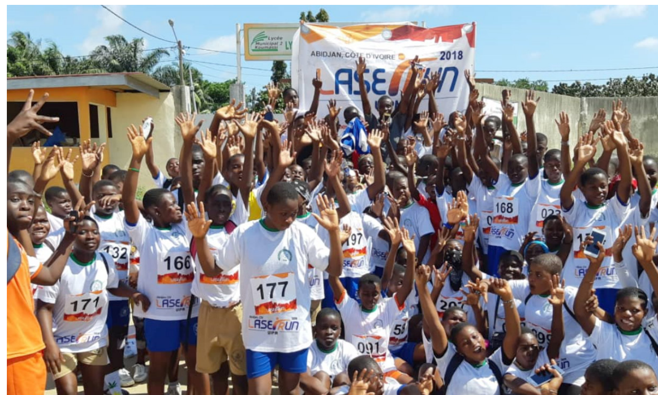
A happy scene in Abidjan (CIV) as young athletes show their excitement at taking part in the Global Laser Run City Tour

The Ivorian Federation of Modern Pentathlon will arrange one more City Tour in Abidjan at the very end of the year, on December 29.