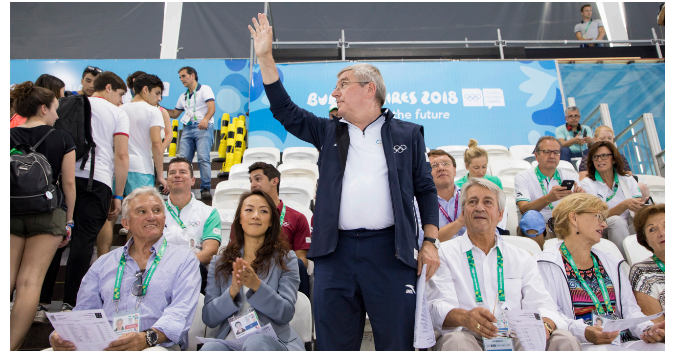
IOC President Dr Thomas Bach salutes the crowd during his visit to the Modern Pentathlon and (below) greets Athlete Role Model Yane Marques (BRA)

and understanding between different cultures.