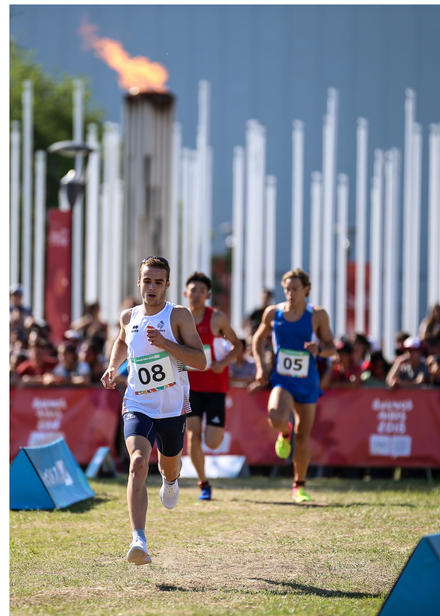
Runners stretch out as the Youth Olympic Games flame burns behind them

Elgendy (EGY) and Gromadskii (RUS) put a marker down as the men to beat with their strong performances in the Fencing Ranking Round, where both