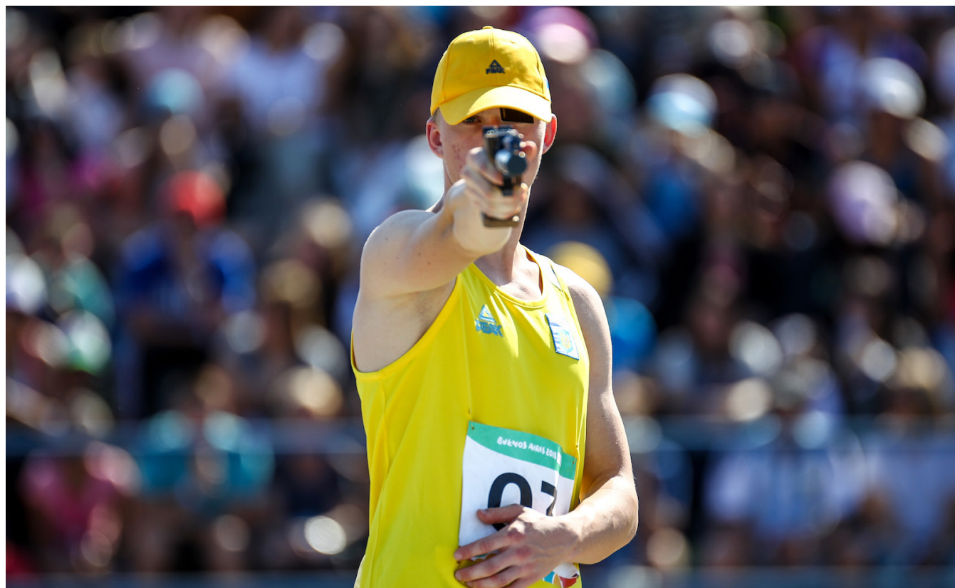
A dramatic shot from the Laser Run during the Men's Individual event at Buenos Aires 2018