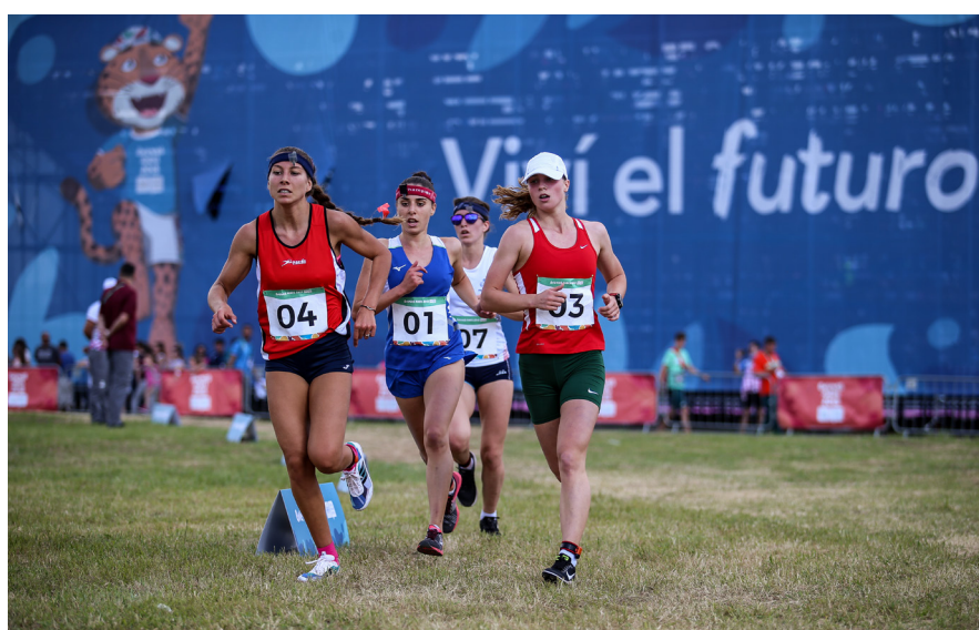
Some of the leading runners jostle for position in Buenos Aires (ARG)