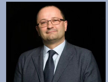
Patrick Baumann 1967-2018

"It's no secret than organising a Pent for 36 people requires a miracle of skill, planning, coordination, and administration. The nature of the mental condition . . . and the military service of those participating, means that it's often difficult to explain who our vets are, how they got to be injured, and how they are recovering."