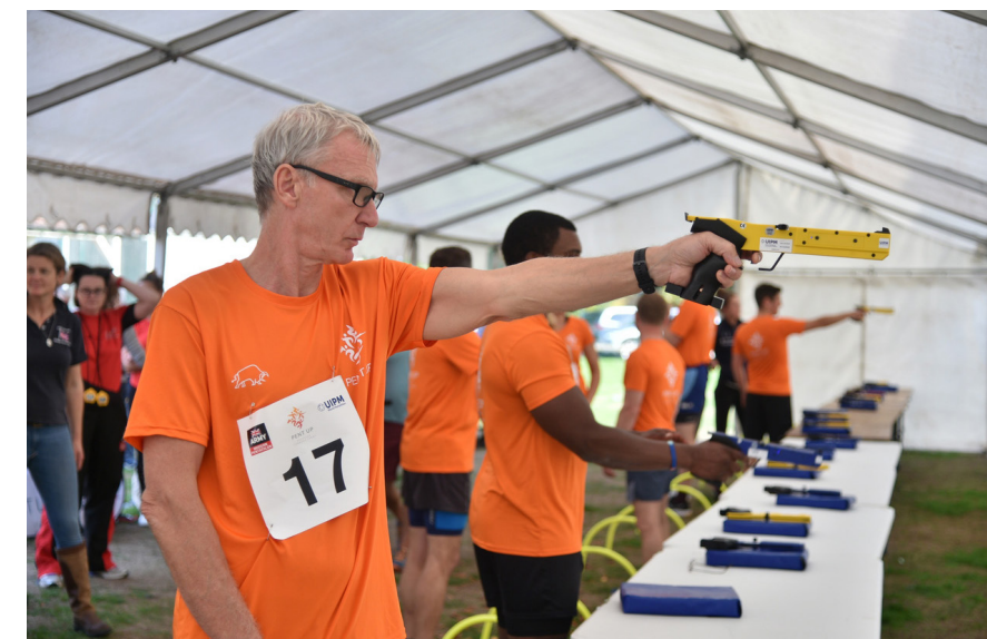
PentUp competitors take aim during the Laser Run discipline