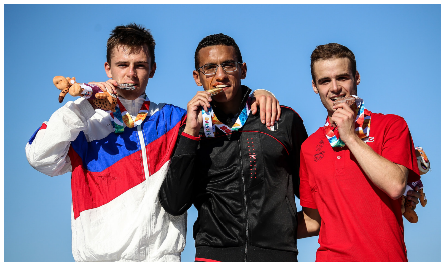
Men's Individual podium