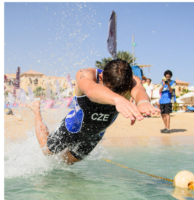
A Czech competitor hits the water and an Egyptian athlete demonstrates a smooth running technique in Sahl Hasheesh (EGY)