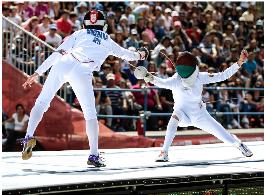
A capacity crowd at Youth Olympic Park enjoys the Fencing Bonus Round