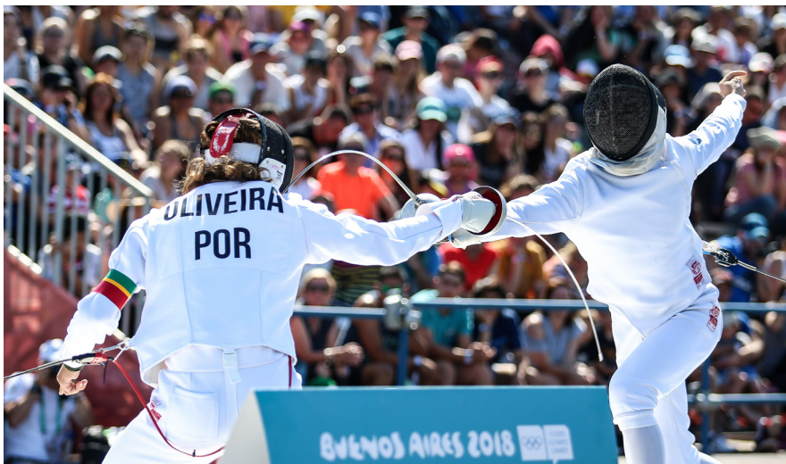
More action from the Fencing Bonus Round