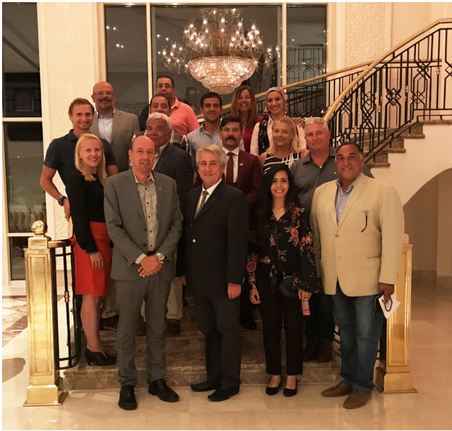
The UIPM President with officials in Sahl Hasheesh (EGY) and event staff