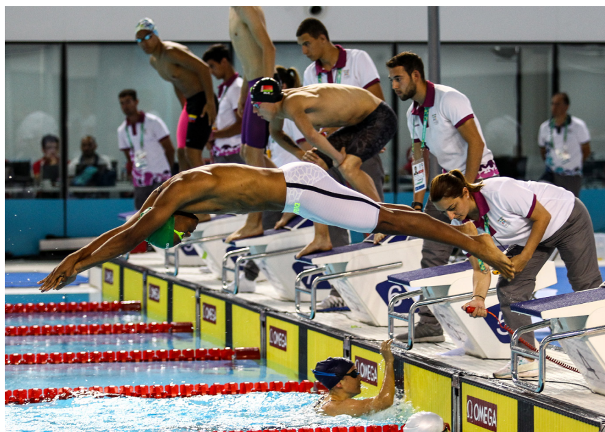
Action from the Swimming discipline of the Mixed International Teams event

The unique format, enjoyed by IOC President Dr Thomas Bach among thousands of spectators in Buenos Aires, allows athletes from different