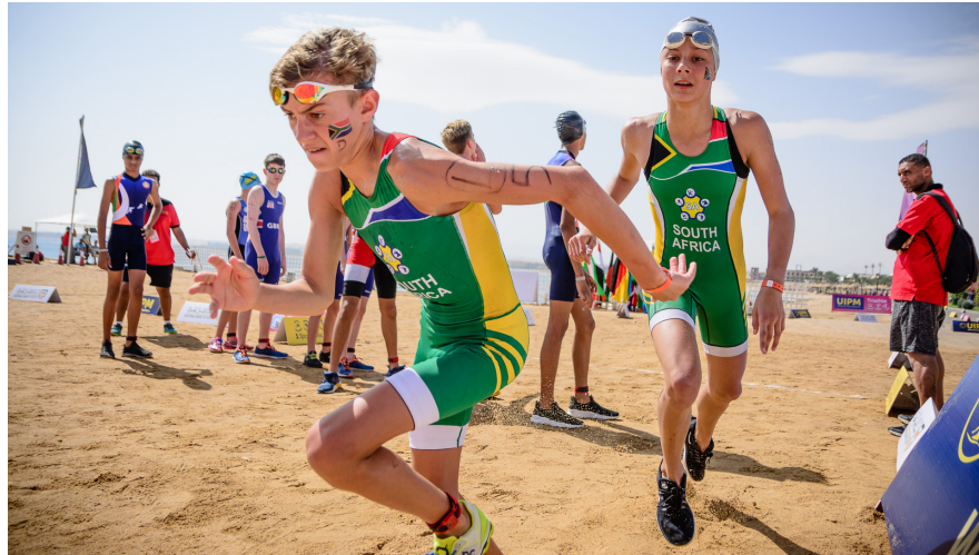
Determination from a South African duo and a victory celebration for Great Britain (below)

A two-time Olympian made the podium on day one of the