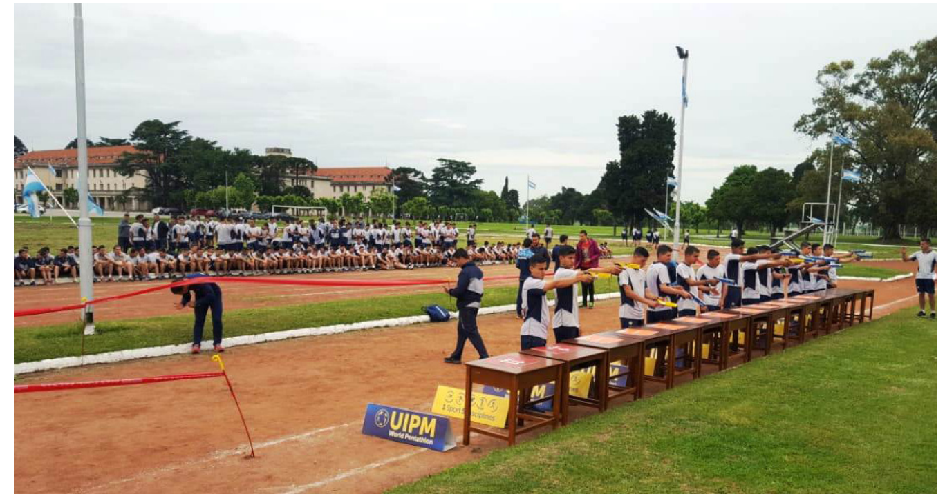
Athletes take aim in the shooting range as others wait for their turn at the National Military College in El Palomar (ARG)