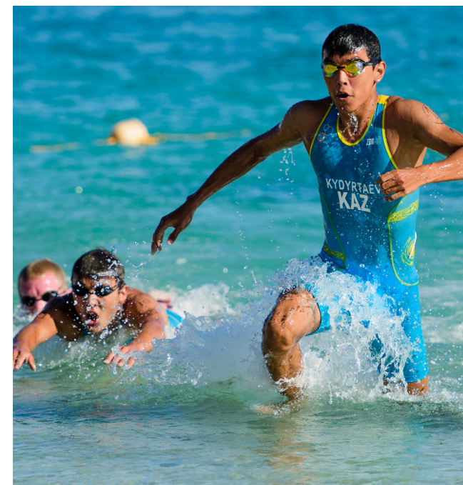
A competitor from Kazakhstan leaves the water as an Egyptian athlete runs with his goggles and cap in Sahl Hasheesh (EGY)