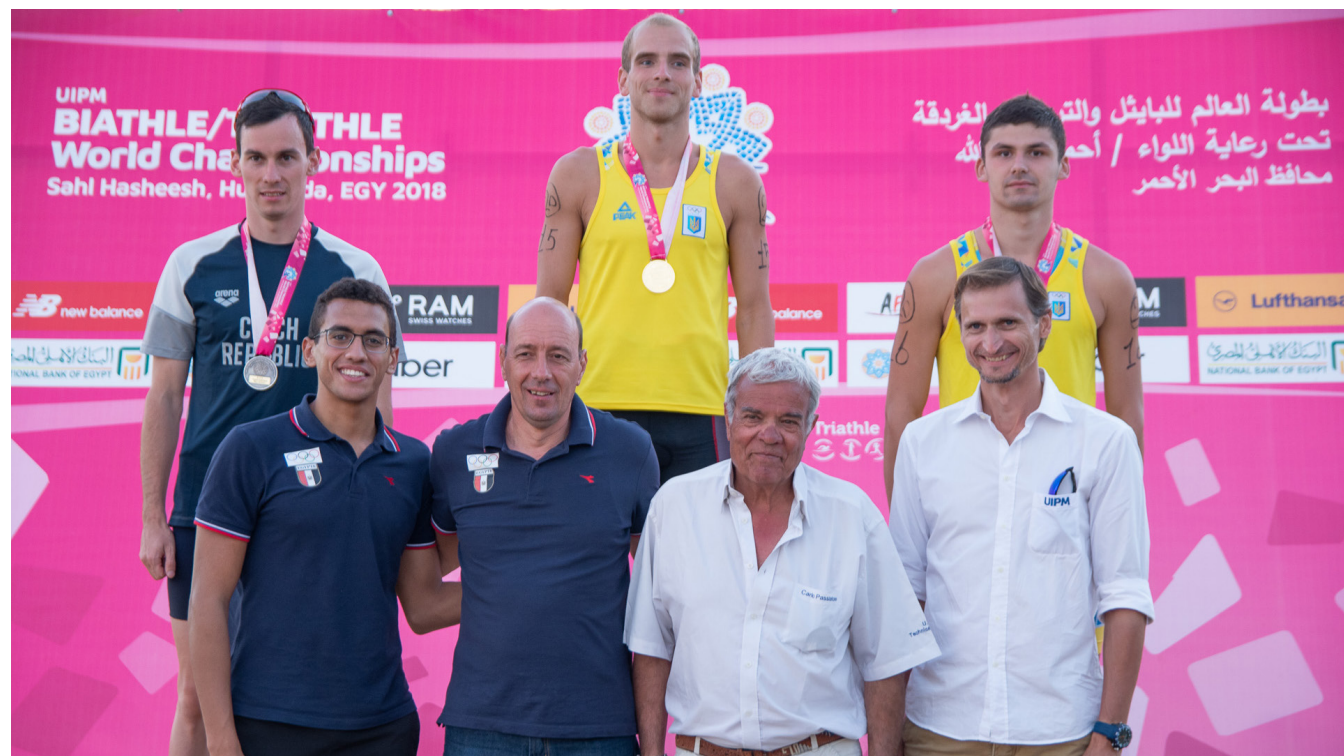
Men's Individual Triathlon podium