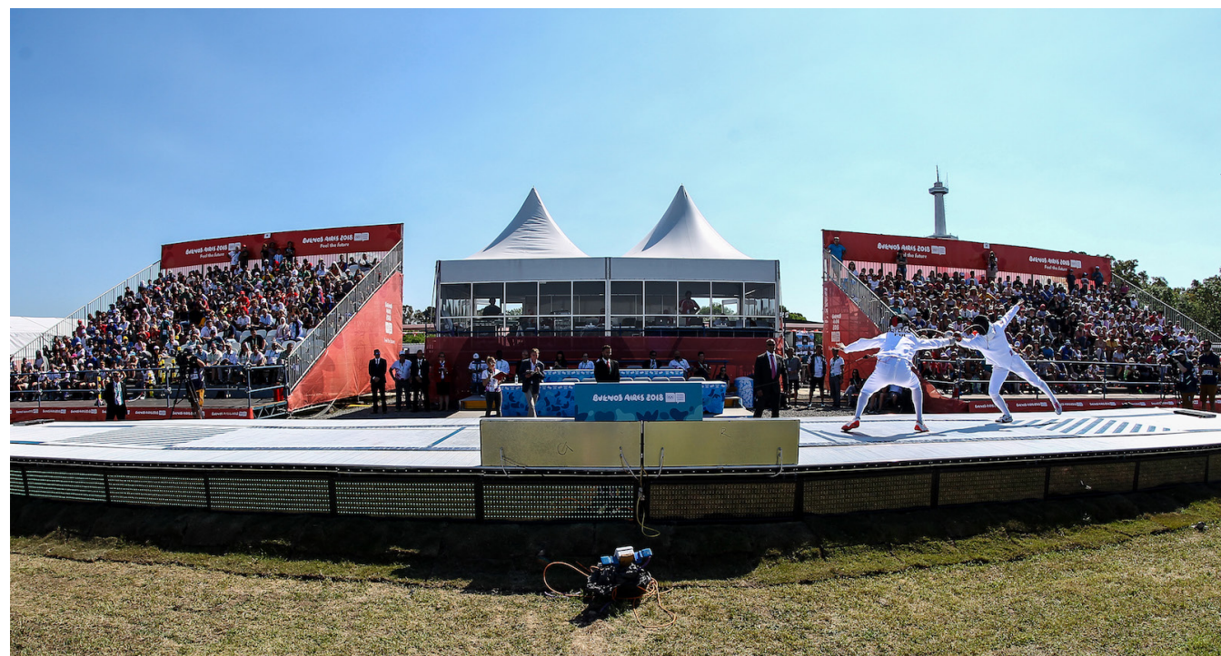
Perfect weather and full tribunes make the perfect backdrop for the Fencing Bonus Round in Buenos Aires (ARG)

I was supported by my coach, my parents and my friends – especially my parents. My idol in pentathlon is Alexander Lesun but I also like Valentin Belaud."