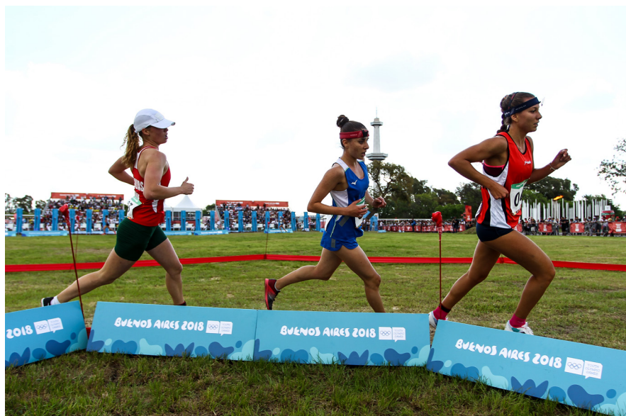
Competition is fierce during the Women's Individual Laser Run