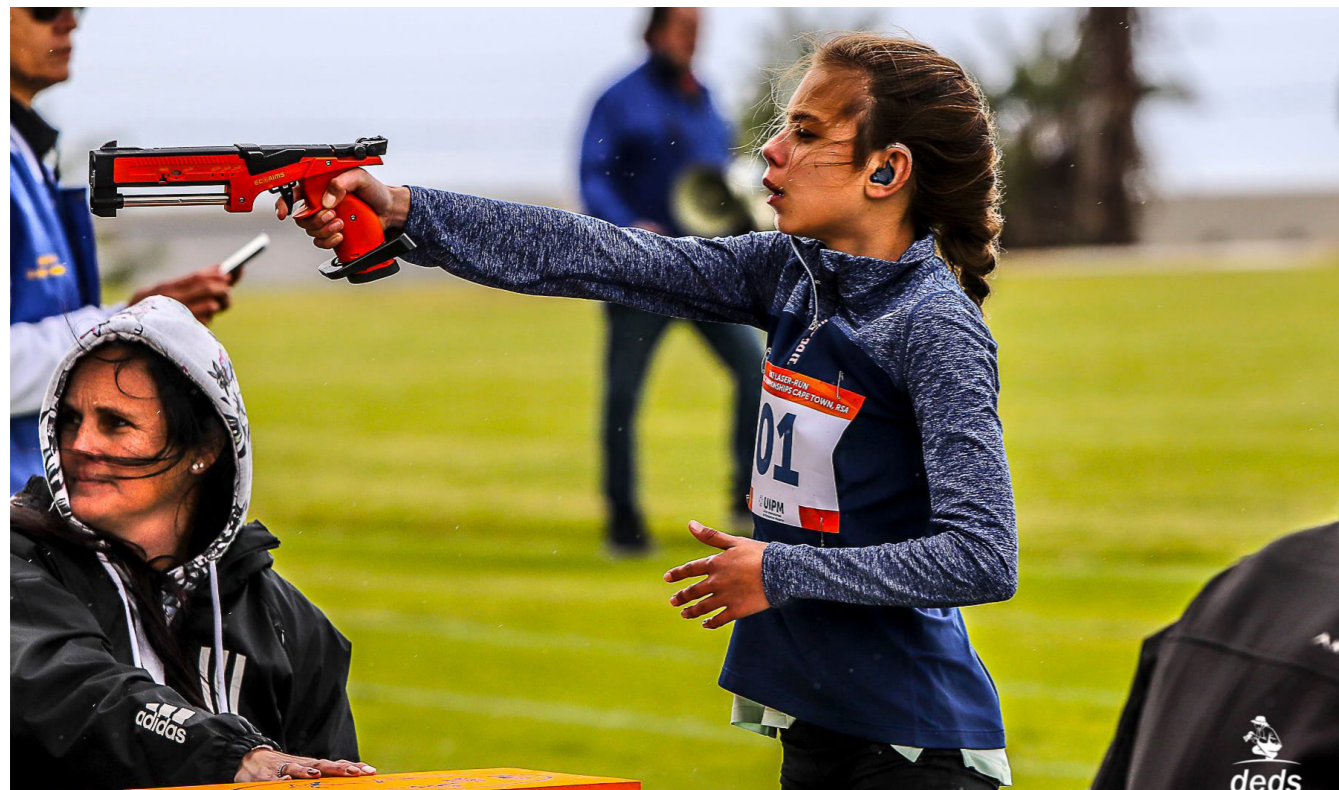
A youth athlete overcomes bad weather conditions to enjoy her Laser Run experience in Mossel Bay (RSA)

Final quarter shows there's no stopping global Laser Run