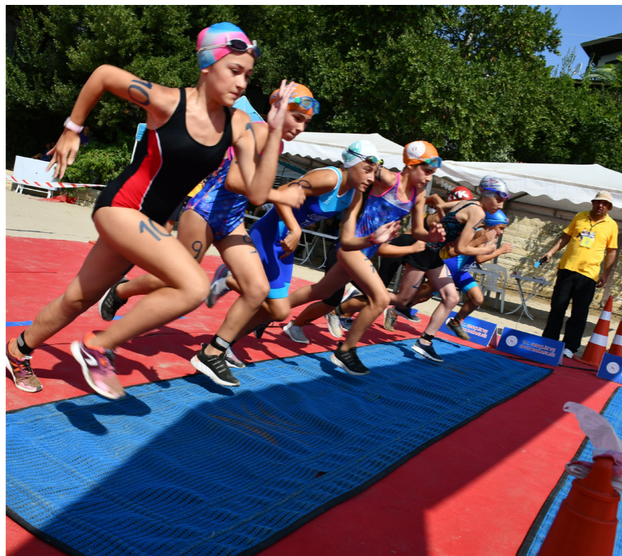
Youth athletes set off at the start of their Biathle-Triathle National Tour in Kerpe (TUR)

As one of the countries at the forefront of UIPM Sports' growth