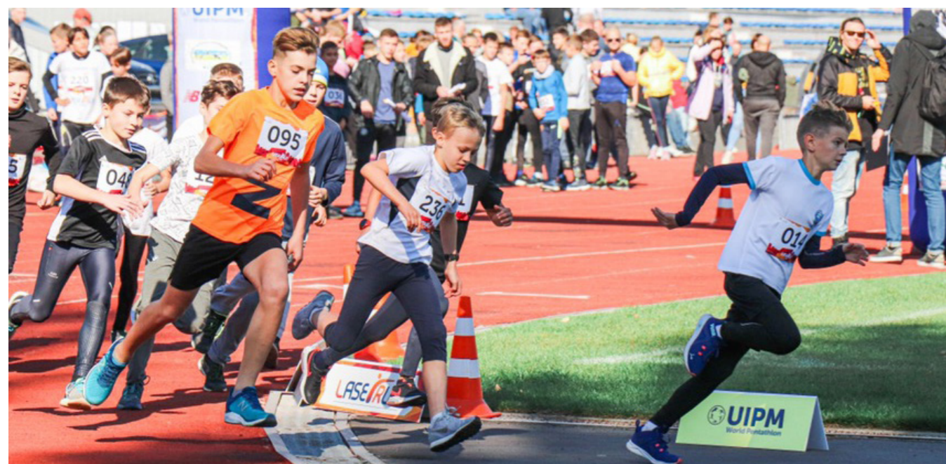
Youth athletes jostle for position and one participant (below) gets an autograph from Rio 2016 Olympic silver medalist Pavlo Tymoshchenko in Kiev (UKR)