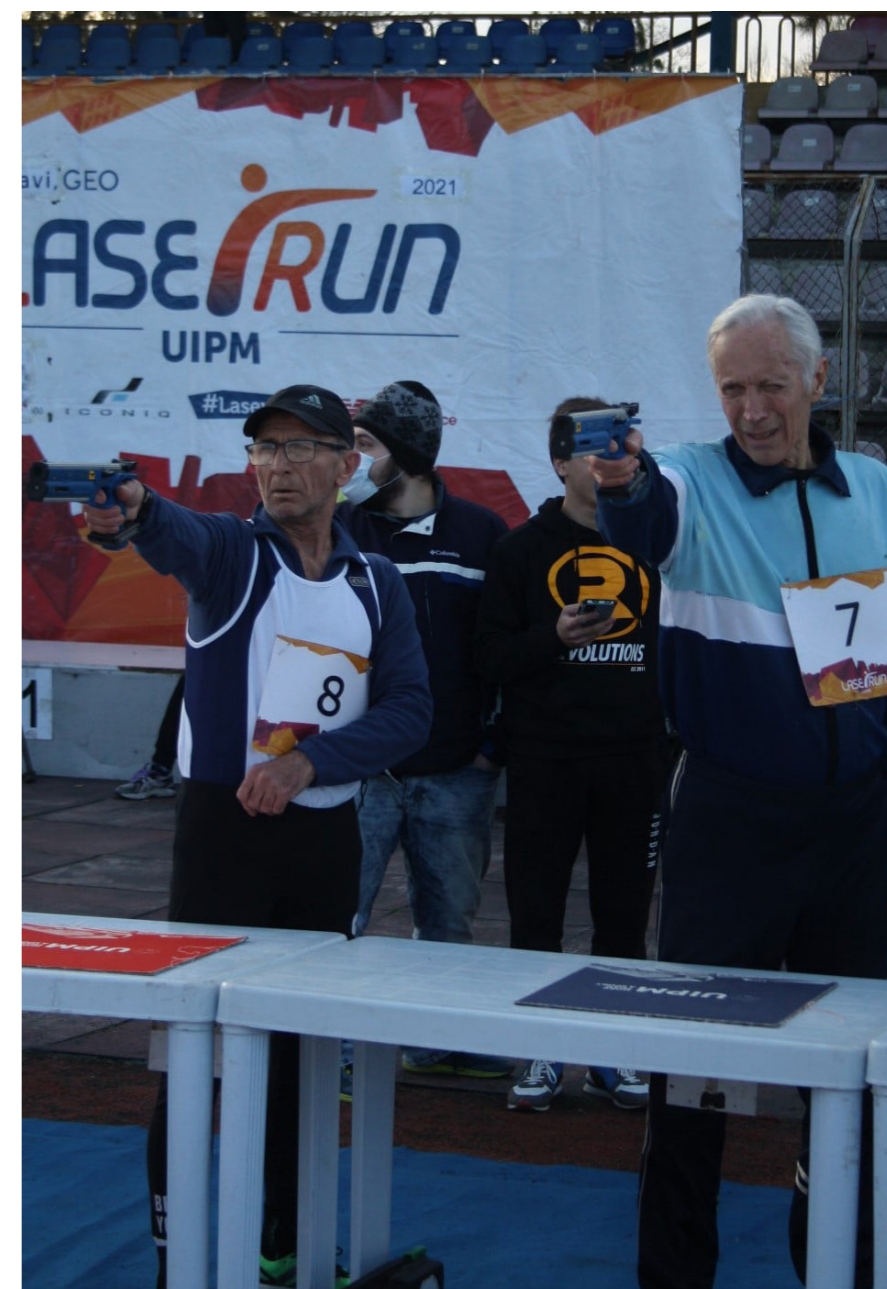
Masters competitors take aim at the shooting range in Rustavi (GEO)

Rustavi, a city in the southeast 25km from the capital, was next on the schedule with a GLRCT competition