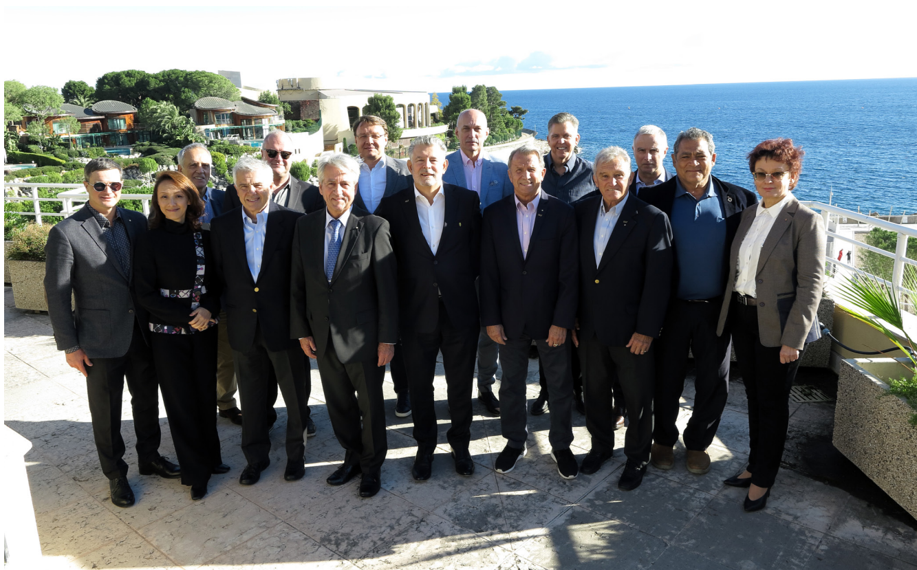
Members of the UIPM Executive Board gather in Monaco after their election / re-election during the 71st UIPM Congress