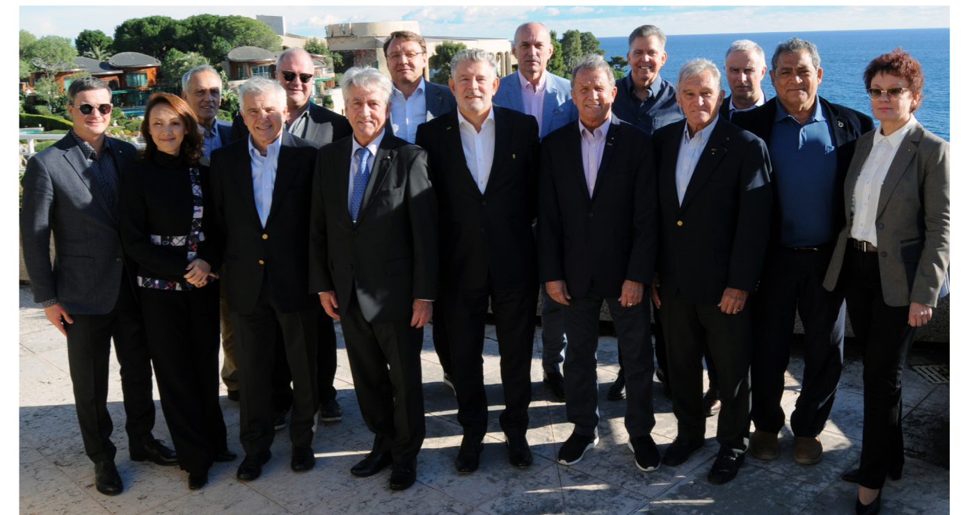
Elected and re-elected members of the UIPM Executive Board together in Monaco (MON)

On November 25/26 the UIPM Executive Board took place for the