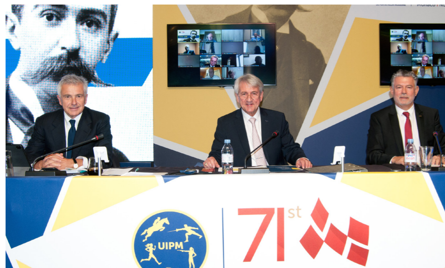
Above: Members of the UIPM Executive Board