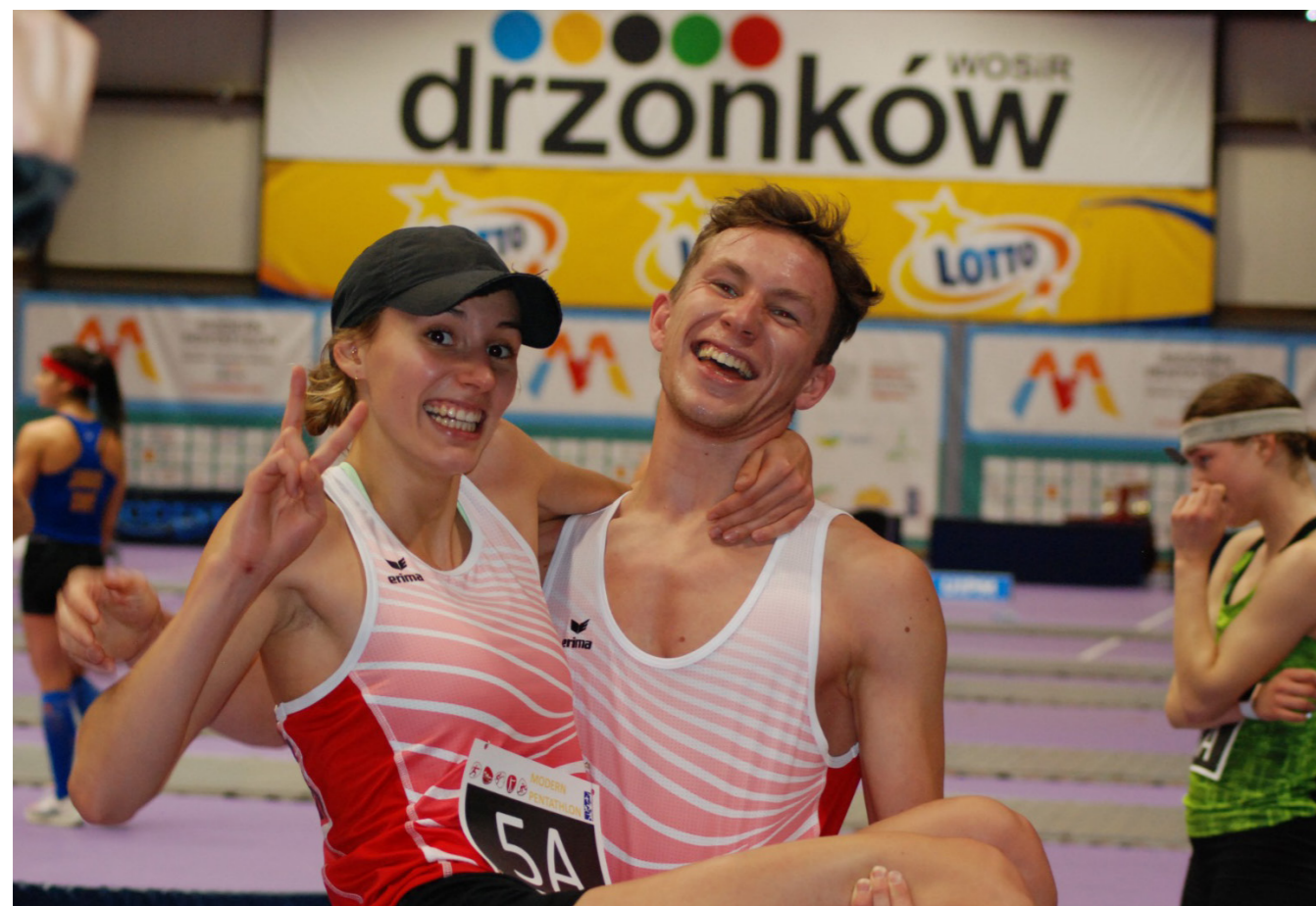
Celebrations at the end of the Mixed Relay in Drzonkow (POL)

While three competitors recorded perfect runs in the Riding round,