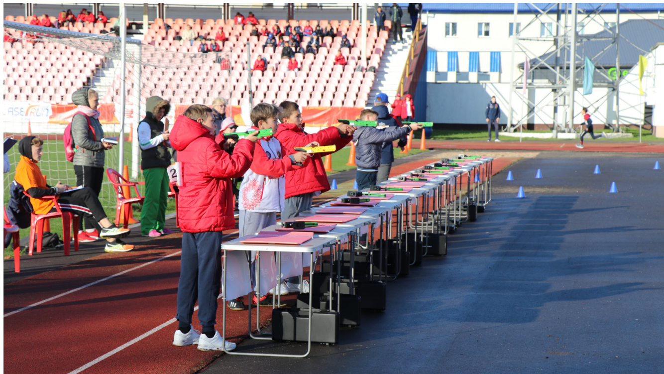
Young athletes wrap up to maintain their performance in cold winter conditions in Molodechno (BLR)

success of the opening event three months earlier.