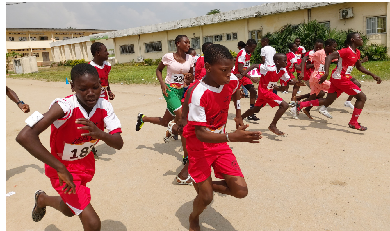
Teenage athletes show their determination after starting the race in Yamoussoukro (CIV)

Not once but twice in the week before Christmas 2019, the people of the Ivory Coast sampled the joys