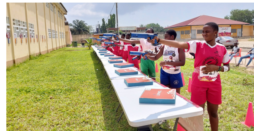
Action from the shooting range and a group photograph in Abidjan (CIV)

"We are satisfied to have been able to organize these two Global Laser Run City Tour competitions at the end of 2019. On both days we saw a beautiful gathering of sports youth with young people mastering the practice of Modern Pentathlon disciplines much better."