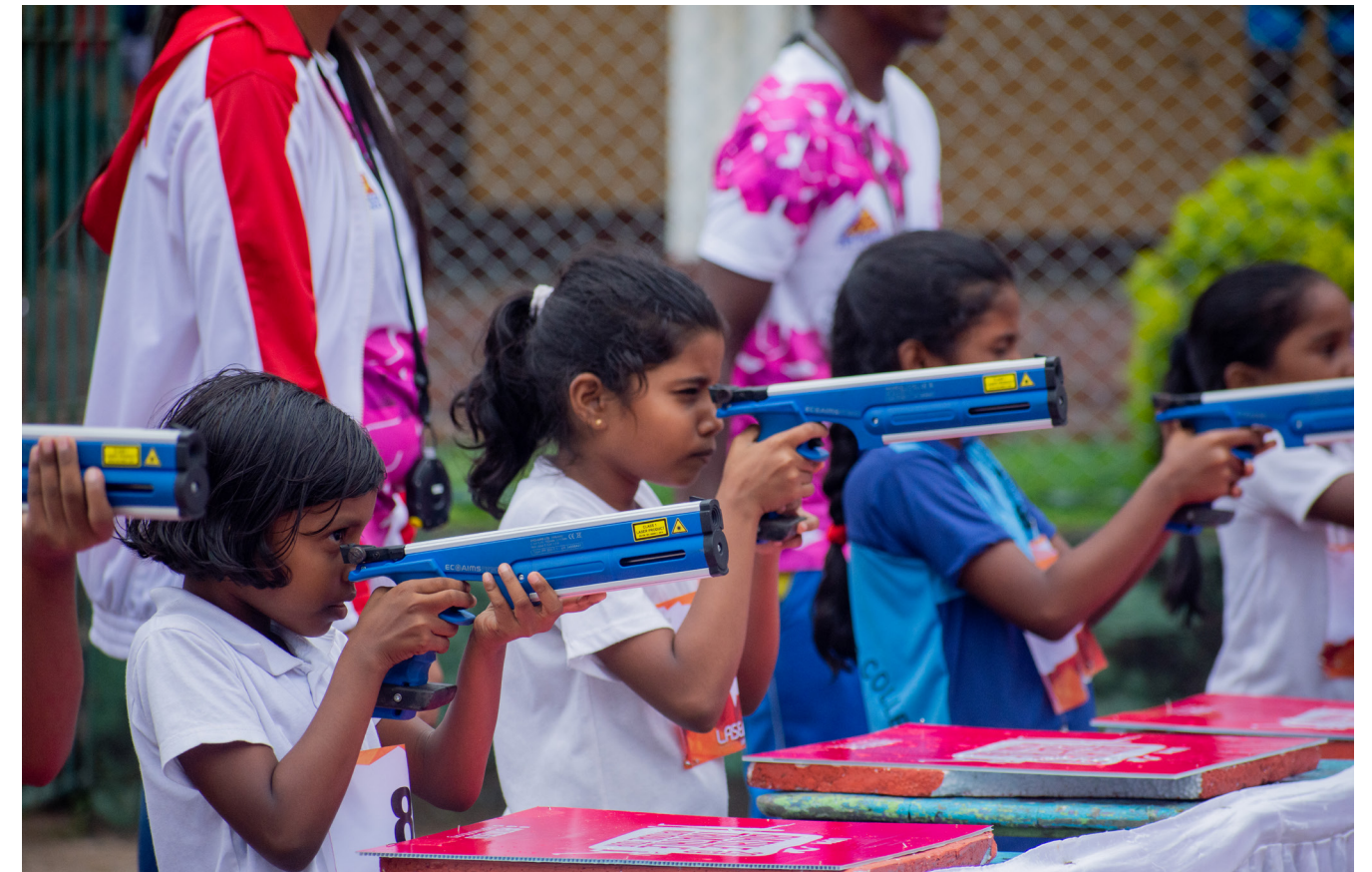
Female youth athletes demonstrate their focus at the laser shooting range during a successful UIPM 2019 Biathlon-Triathlon National Tour event in Piliyandala, Colombo (SRI) in September 2019

Our global community is rapidly growing, and we are planning to reach 150 member nations by the time of UIPM 2020 Congress, which will be the biggest democratic exercise in the history of UIPM with all nations' attendance supported.