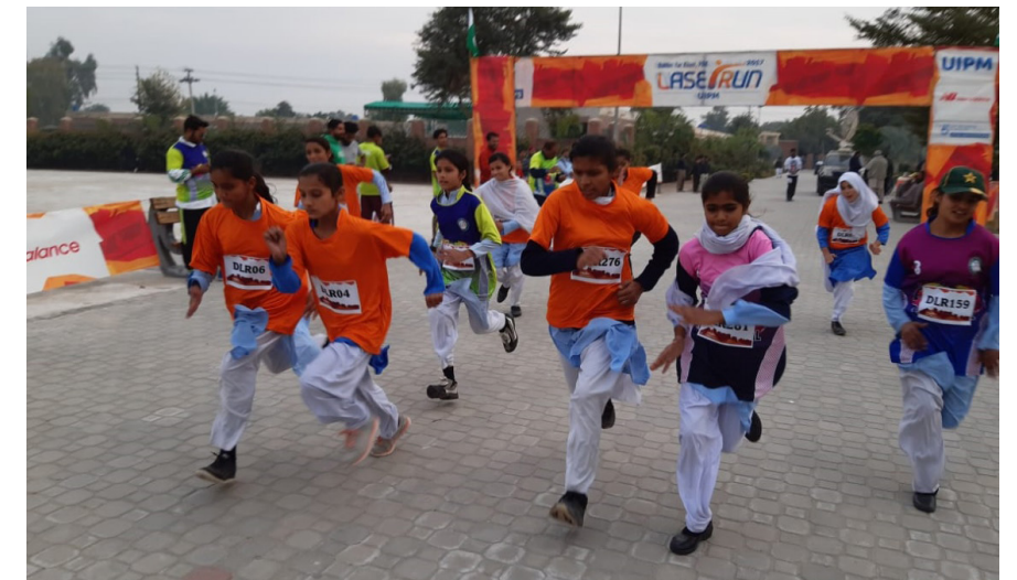
Competitive action from the start line (above) and shooting range (below) in Rahim Yar Khan (PAK)

Togo held its second Global Laser Run City Tour in Lome on December 21, 2019, building on the