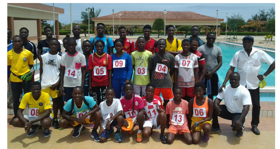
Happy Laser Runners gather for a group photograph in Lome (TOG)