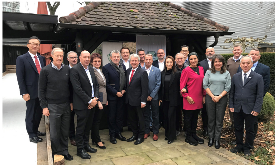
Members of UIPM Committees and ad-hoc Working Groups gather in Frankfurt (GER)

"I'm very happy that what was proposed in Frankfurt by the various UIPM