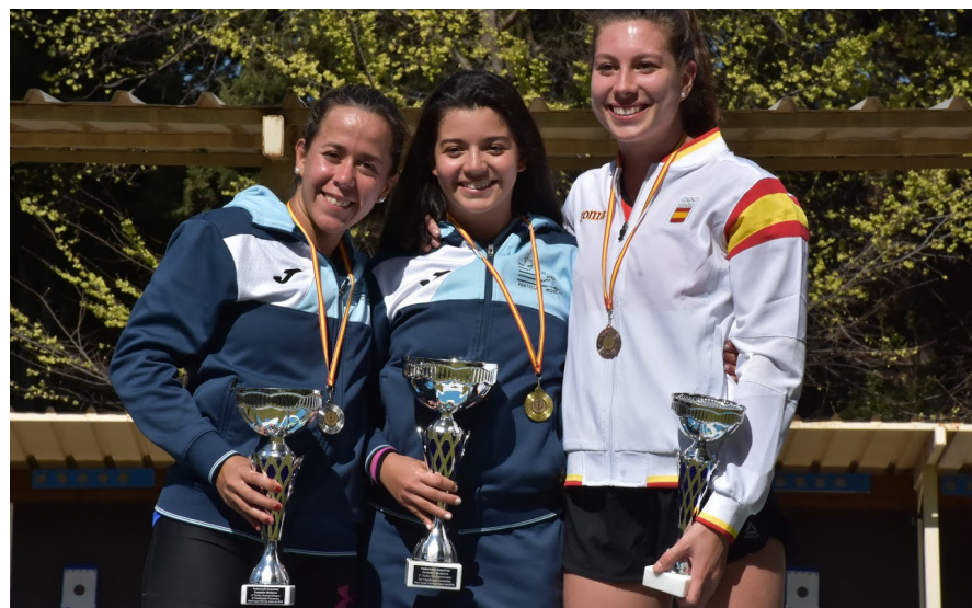
All smiles on the women's podium in Barcelona (ESP) after the Trophy Iberoamericano