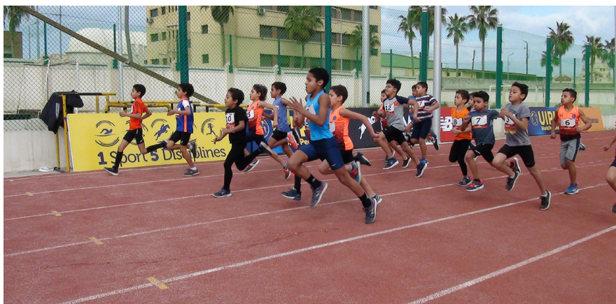
Junior boys set a fast pace from the start line in Alexandria (EGY) ...

The event on March 9 was hosted by the Western Province Modern Pentathlon Association in the Durbanville region,