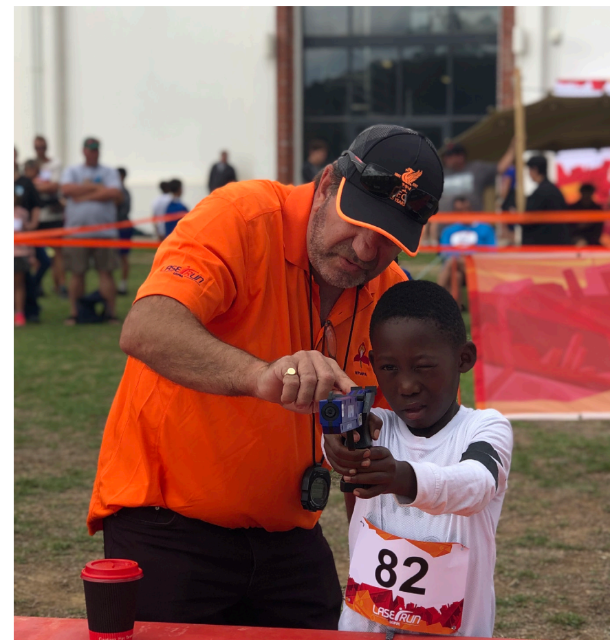
A laser shooting lesson for one of the youth athletes in Cape Town (RSA)

Using the facilities created for the 2018 Mediterranean Games, Tarragona (ESP) created excellent conditions for Laser Run with more than 150 participants