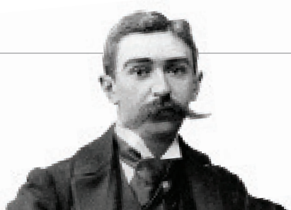
Baron Pierre de Coubertin

"The Modern Pentathlon event would test a man's moral qualities as much as his physical resources and skills, producing thereby the ideal, complete athlete."