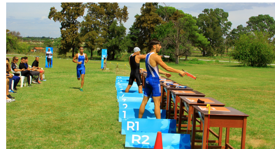
The 'New Tetrathlon' format includes a Triathlon, consisting of Shooting, Swimming and Running

passed its first test. New Tetrathlon, which adds Fencing to the established development sport of Triathlon (Shooting/Swimming/Running), was tested by pentathletes in Buenos Aires, Argentina on March 16.