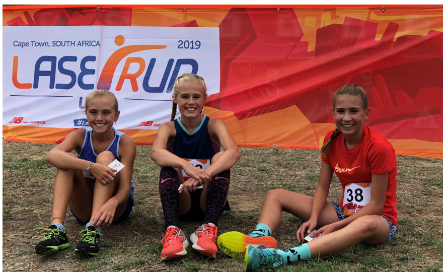
Young Laser Run enthusiasts take a break in Cape Town (RSA)