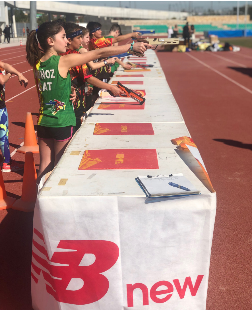
Laser Runners of all ages take part (above) as the youth girls competitors look composed on the Shooting range in Tarragona (ESP)

competing, many of them experiencing the UIPM's fastest-growing sport for the first time. The event on March 10 was organized by the Catalan Federation of Modern Pentathlon and the Tarragona Pentathlon Club, with support from the Spanish Modern Pentathlon Federation and a number of sporting bodies from the Catalan region.