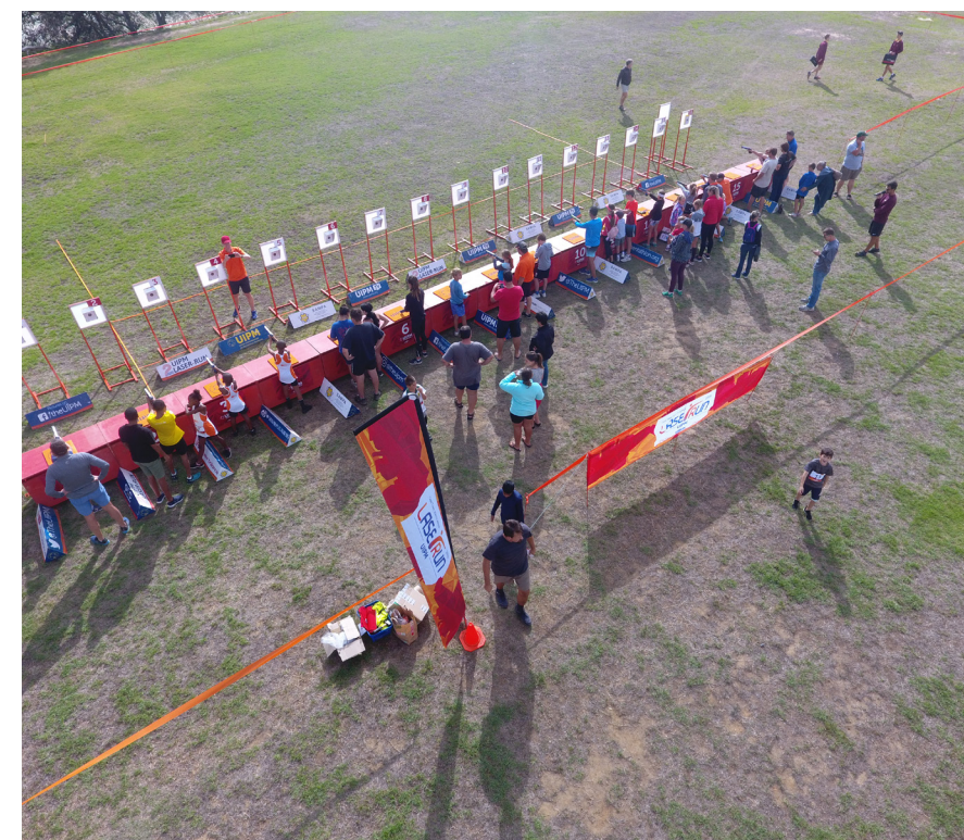
An aerial view of the Shooting range in Cape Town (RSA)