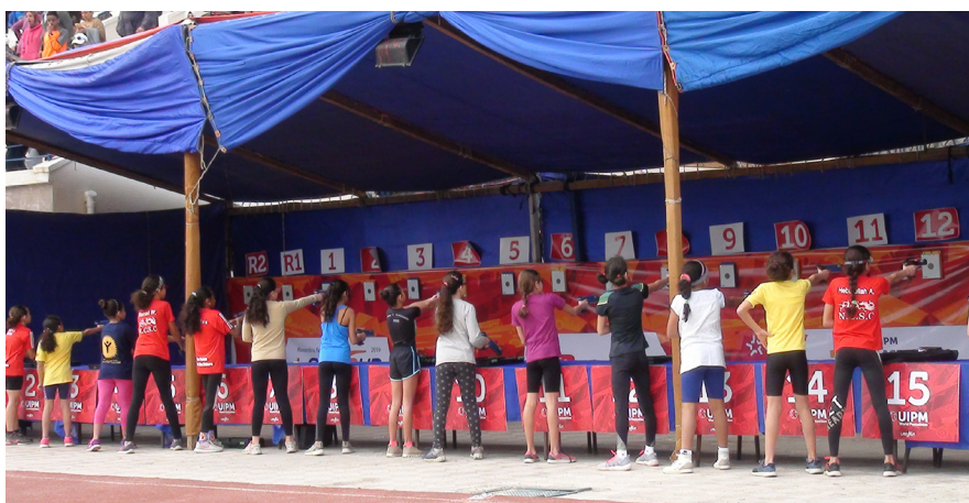
... as the junior girls take aim at the Shooting range