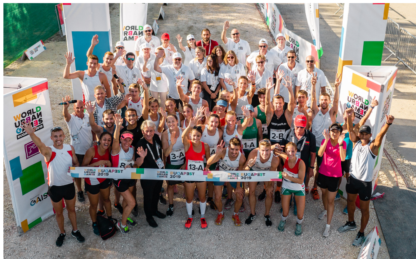
Laser Run competitors in the 1st World Urban Games in Budapest (HUN)