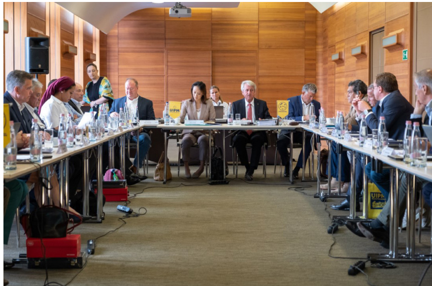
The UIPM Executive Board meets in the New York Palace Hotel in Budapest (HUN)