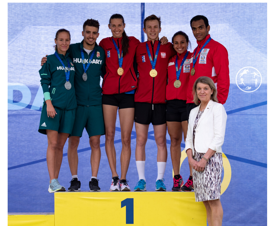
Senior Mixed Relay podium

"The combination of Laser Run and Pentathlon has been a great success and we are already looking forward to the UIPM 2020 Pentathlon and Laser Run World Championships in Xiamen, China.