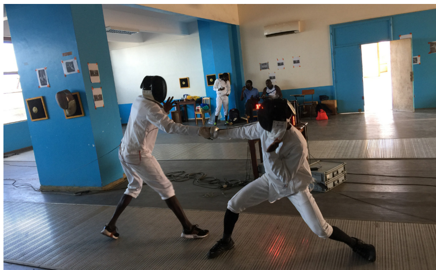
Fencing action from Dakar (SEN)

qualification round, and when the final came on September 15 it was similar to the women's event as one athlete stood out.