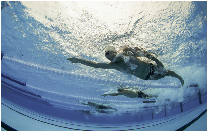
Action from the Swimming pool