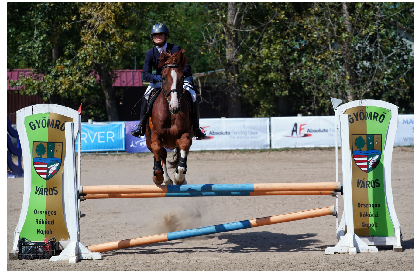
Action from the Riding stage of the European Masters Championships

"The horses were of the finest quality, as were the 40 stands at the laser shooting range and the Fencing venue was state of the art. My thanks therefore