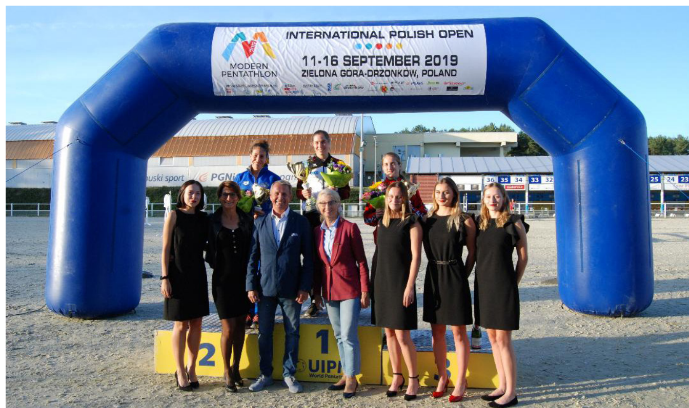
The Women's Individual podium at the International Polish Open in Drzonkow (POL)