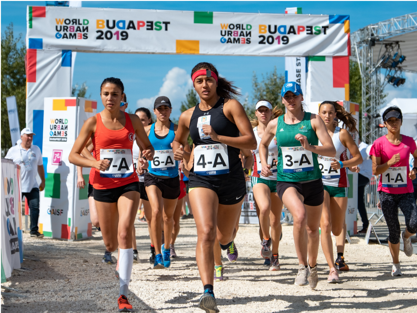
Competition is fierce between women athletes from the start line

gence of Laser Run as a “great foundation of our sport” during the competition.