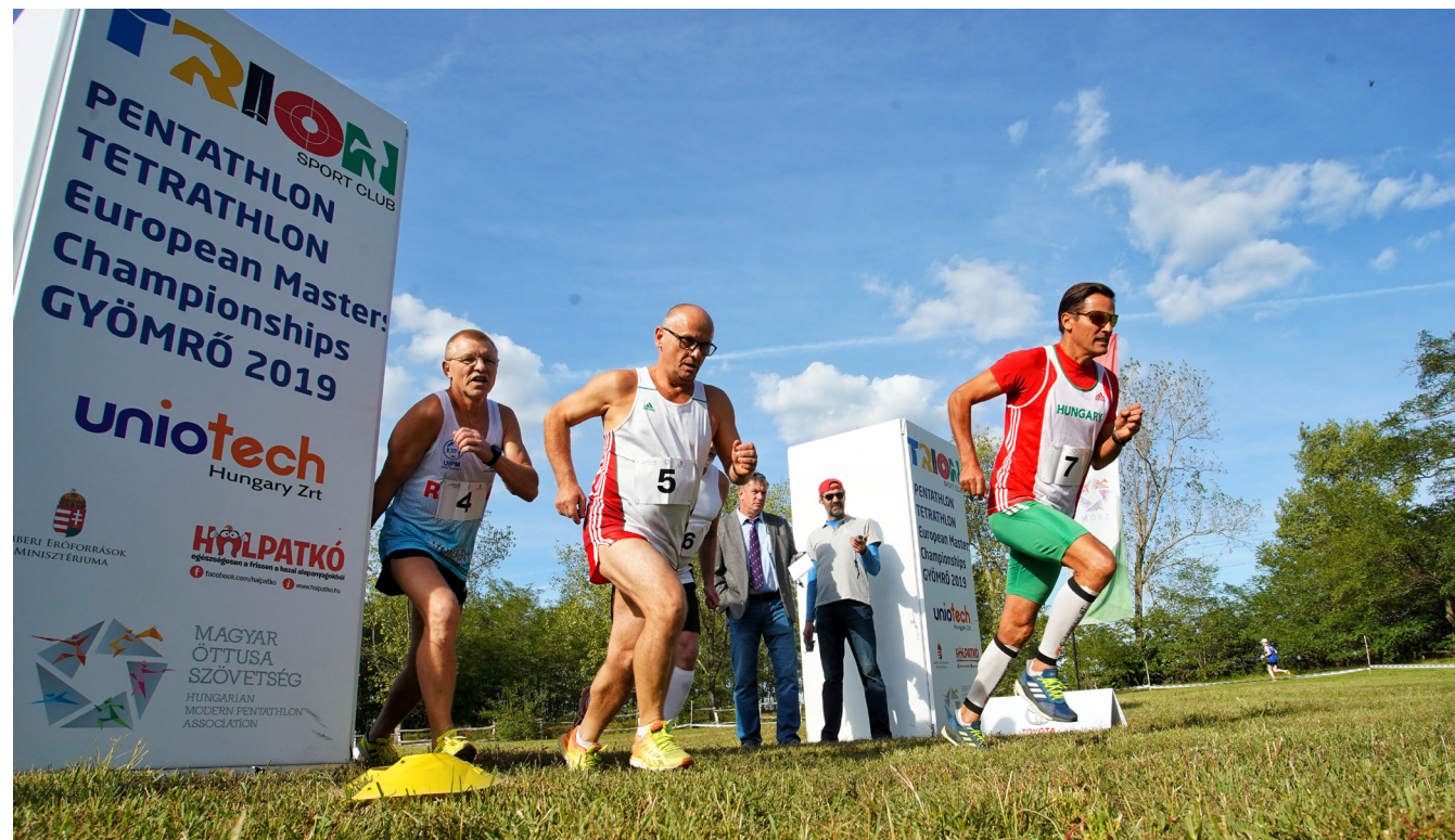
Male and (below) female competitors demonstrate their commitment in the European Masters Championships in Gyomrő (HUN)