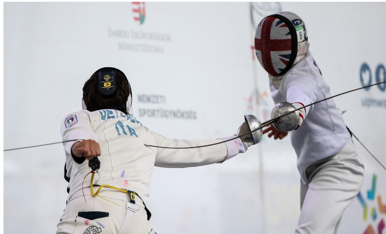
A British fencer strikes his Italian rival on the back during the Fencing Bonus Round