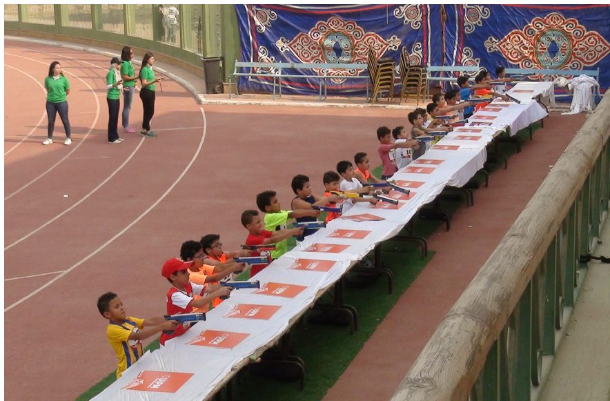
Target practice in Banha (EGY)

age categories from Under 9 to Senior, with a large quota of 72 participants at both Under 13 and Under 15 level.