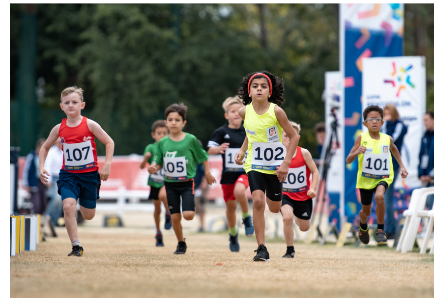
Some of the youngest male athletes display their running and shooting technique

"A lot of countries are winning medals, which is difficult to do in Pentathlon, and they can win medals in individual and team categories. It underlines that Laser Run is a very good tool for development."