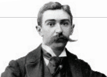
Baron Pierre de Coubertin

UIPM BIATHLE/TRIATHLE World Championships Saint Petersburg, Florida, USA 2019 24-27.10.19