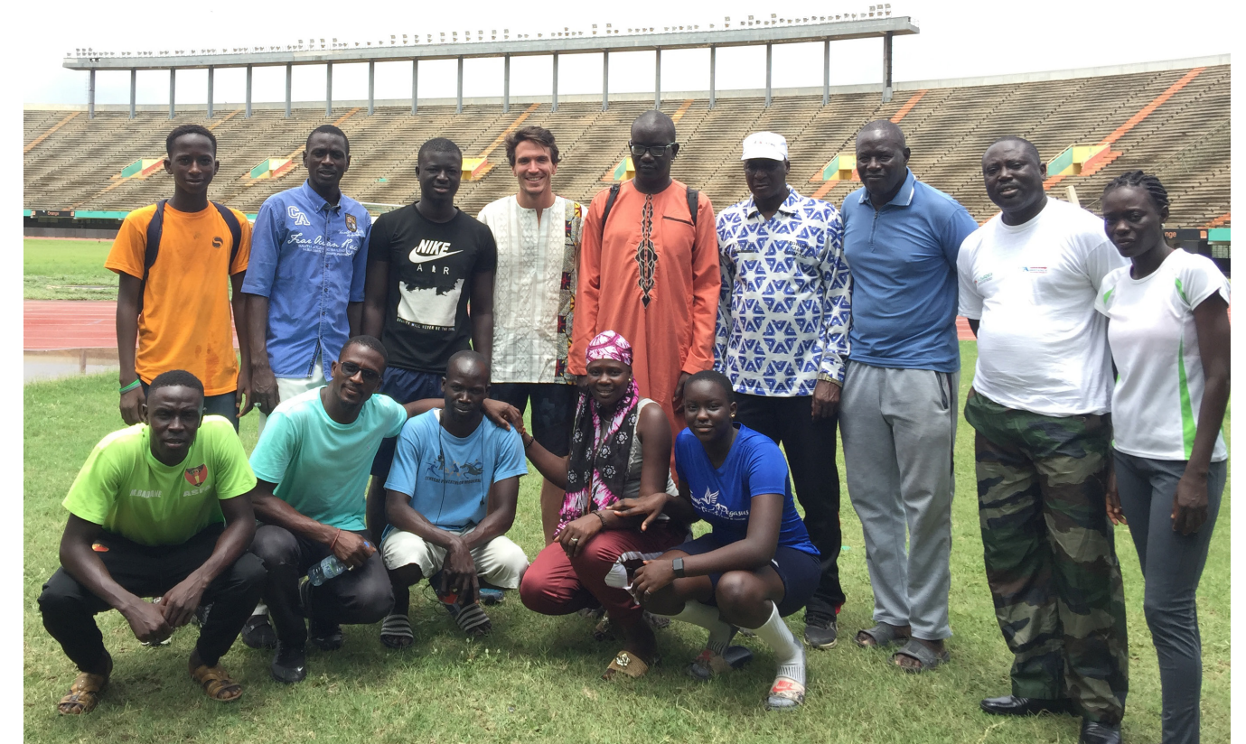
Graduates from the UIPM coaching clinic in Dakar (SEN)