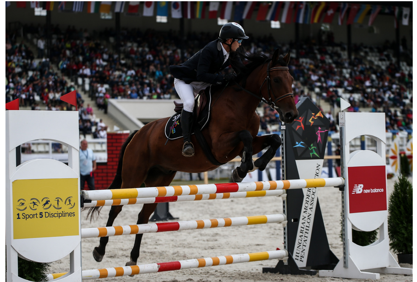
A capacity crowd in Budapest (HUN) watches the drama of the Riding stage

I wouldn't have believed you. I can't believe I've finished top five in every competition and won medals at the World Cup Final, the European and World Championships.