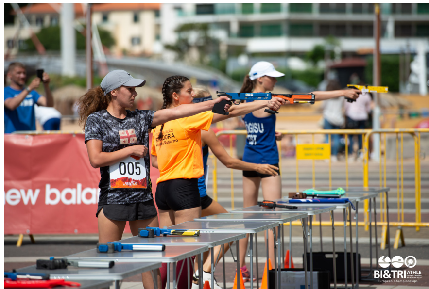
Female athletes test their shooting and running skills in Machico, Madeira (POR)