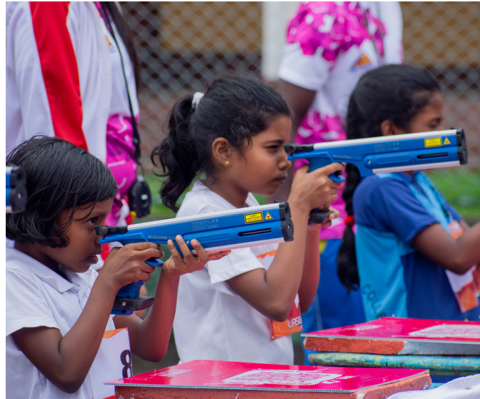
Young girls hone their skills in laser shooting and running during the Biathlon-Triathlon National Tour in Piliyandala (SRI)