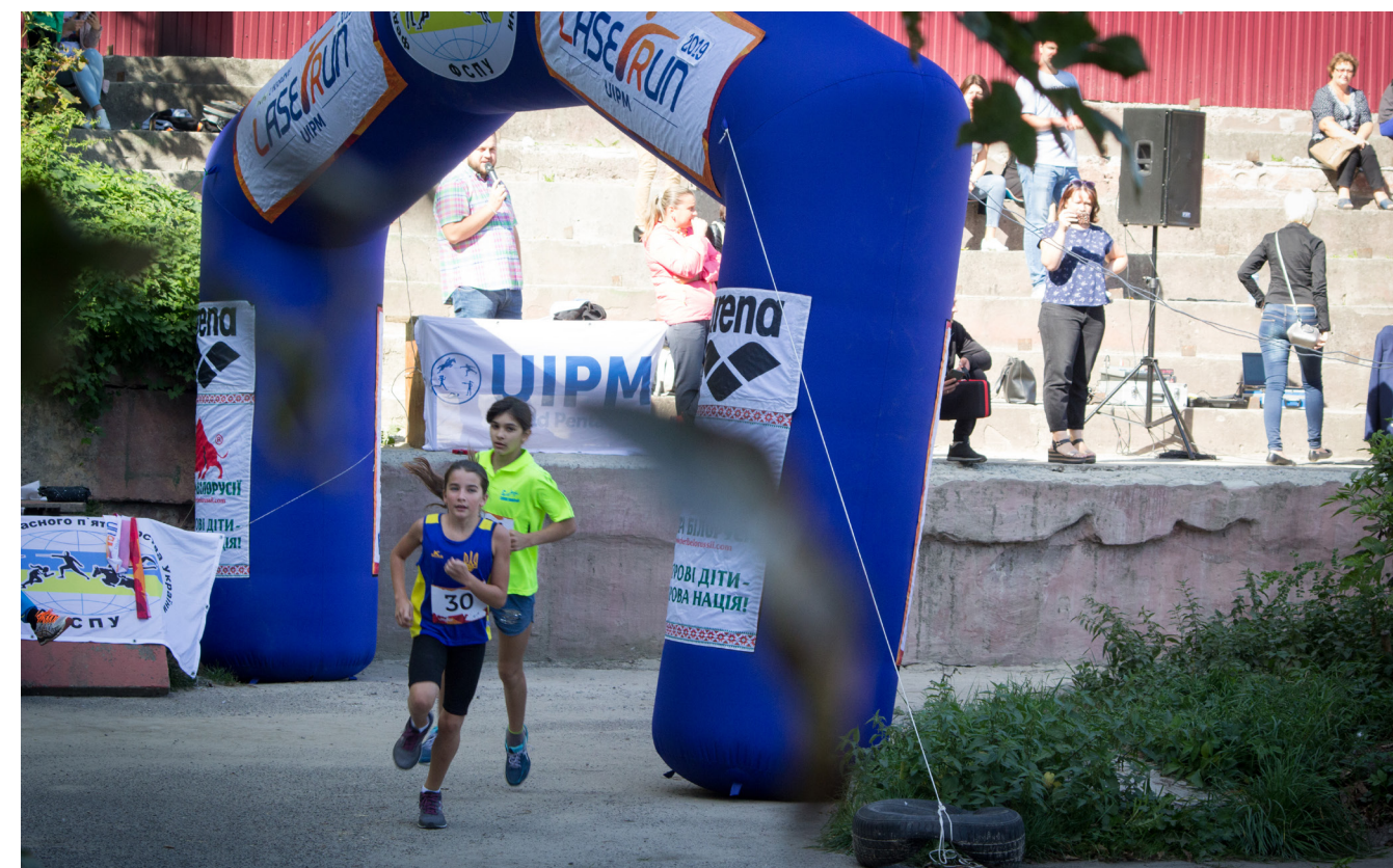
Young athletes enjoy the running course and keep their eyes on the prize (right) in Lviv (UKR)

Nearly 300 athletes from seven regions flocked to Lviv in the west of Ukraine on September 15 to join one