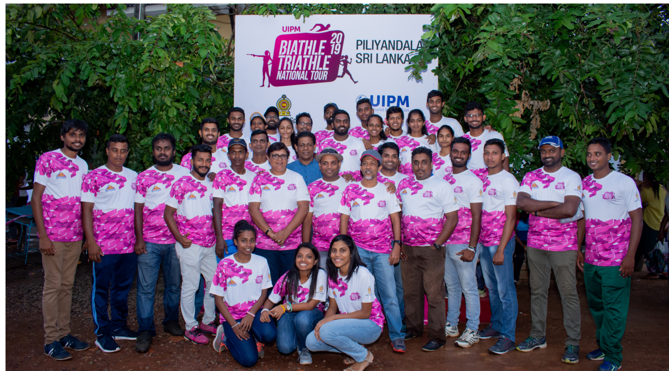
A group photograph shows the enjoyment and engagement of athletes in the Biathlon-Triathlon National Tour in Piliyandala (SRI)