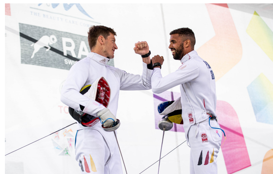
... and it's a fist bump for Germany during the Fencing before Riding takes centre stage (below)