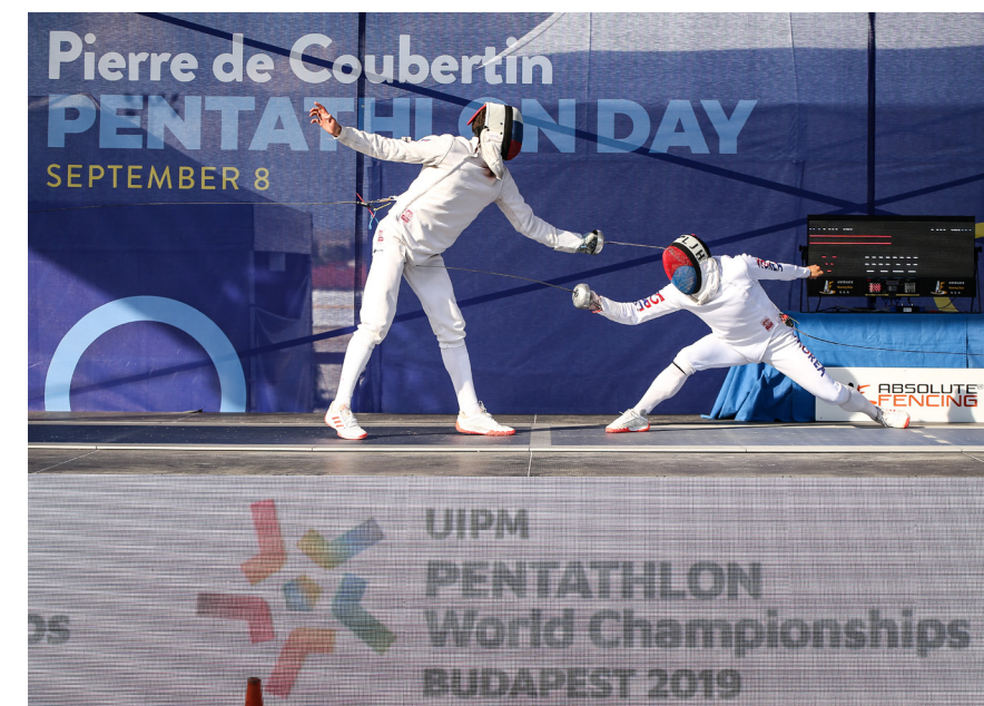
Action from the showpiece Fencing piste on Pierre de Coubertin Pentathlon Day

Expectations were high in the home crowd after two medal-free days for