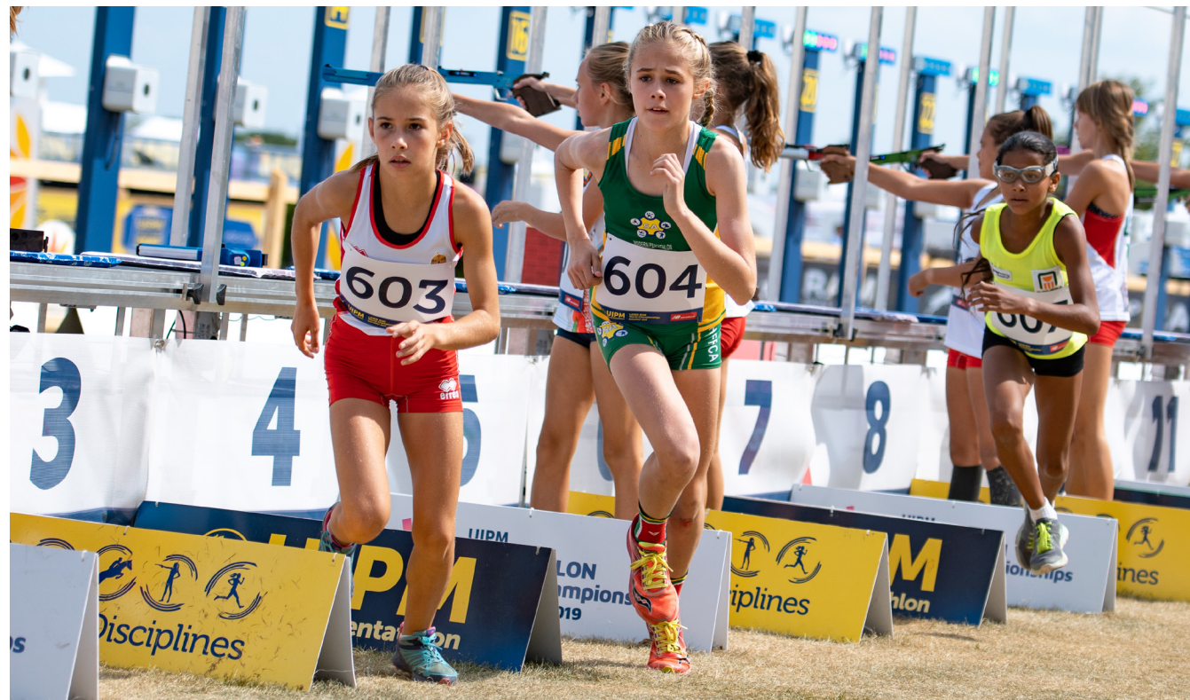
It's time to embark on the second lap for these highly focused young athletes