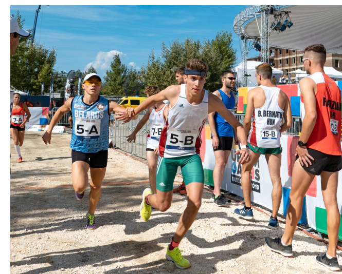
The Mixed Relay format takes centre stage during the World Urban Games Laser Run

"As a pentathlete and double world champion, it is really important to