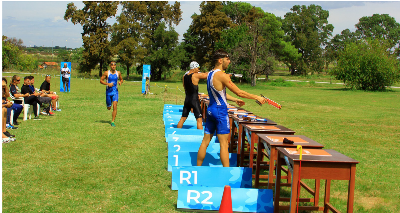
The New Tetrathlon format combines the UIPM development sport of Triathlon with Fencing