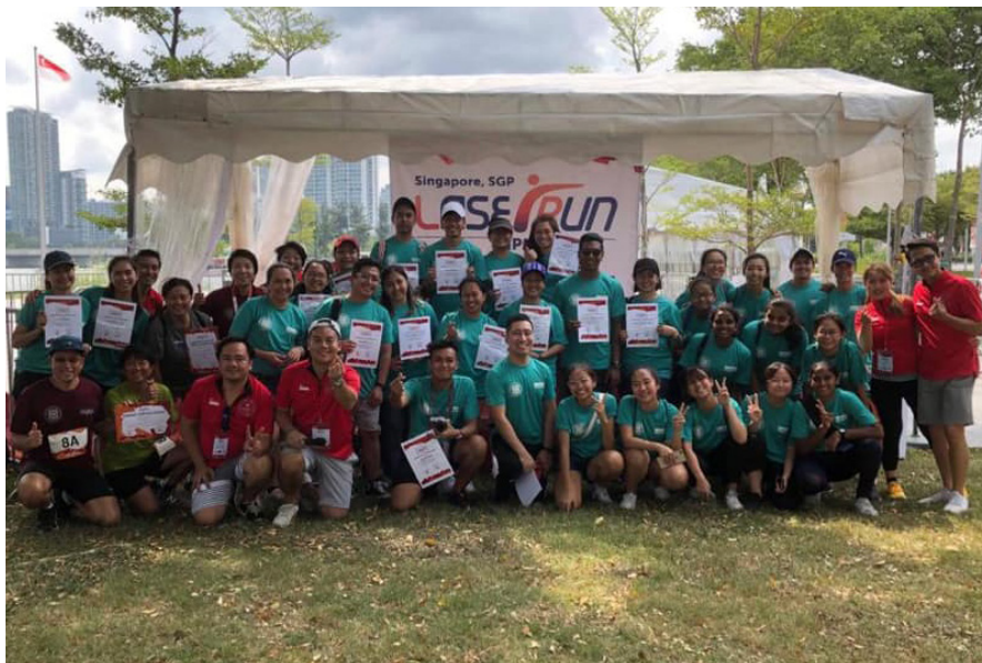
A cross section of competitors in Singapore (SGP)

A total of 315 athletes competed in eight