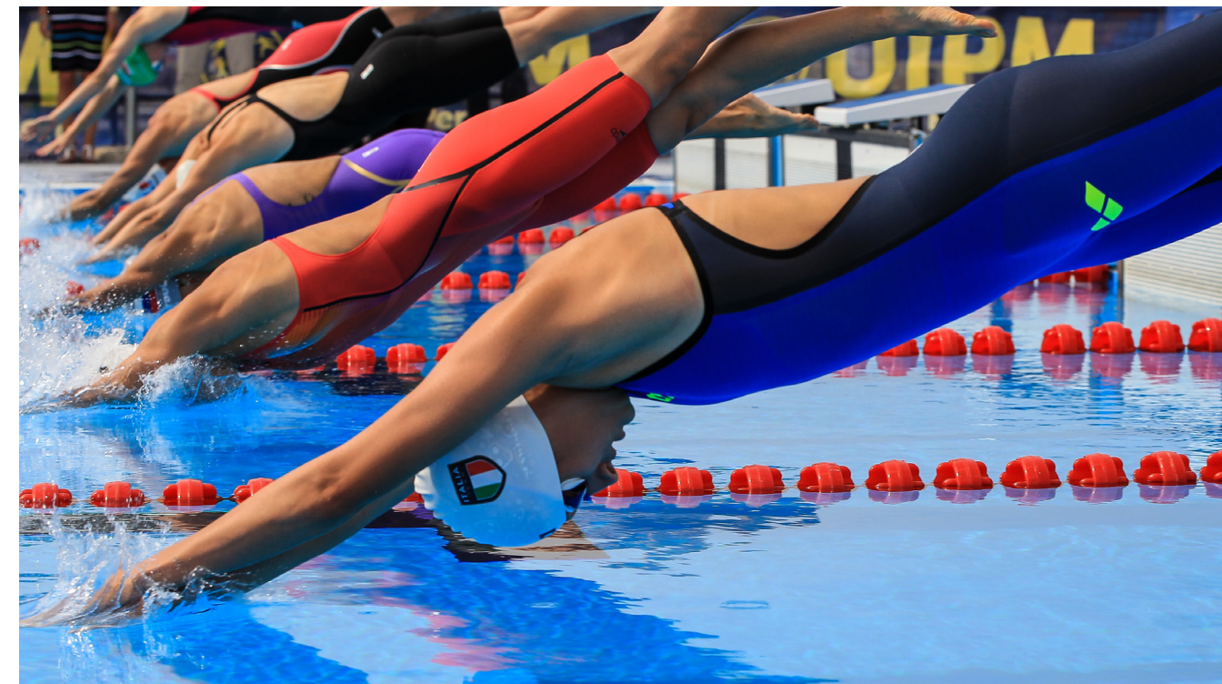
It's synchronised diving as the Swimming gets under way in the Women's Final

shoot, but Germany (Nobis/Dogue) and Lesun (RUS) held their positions without undue difficulty.