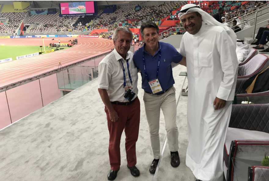
The UIPM President in Doha (QAT) with IAAF President Lord Sebastian Coe and Olympic Council of Asia President Sheikh Ahmad Al-Fahad Al-Sabah