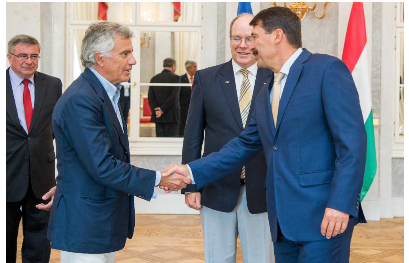
IOC and UIPM Vice-President Juan Antonio Samaranch meets the Hungarian President in the presence of HSH Prince Albert II of Monaco