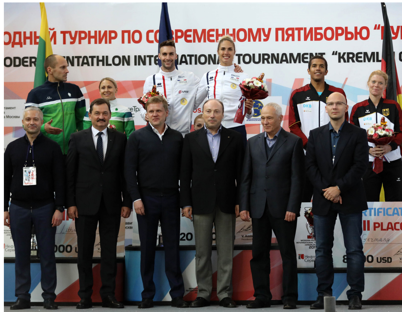
All smiles on the podium at the end of the 2019 Kremlin Cup in Moscow (RUS)

an opportunity to receive high-performance education on a daily basis at the Academy, which is fully equipped with a swimming pool, fencing hall, shooting range, track-and-field stadium and riding field equipped with obstacles.