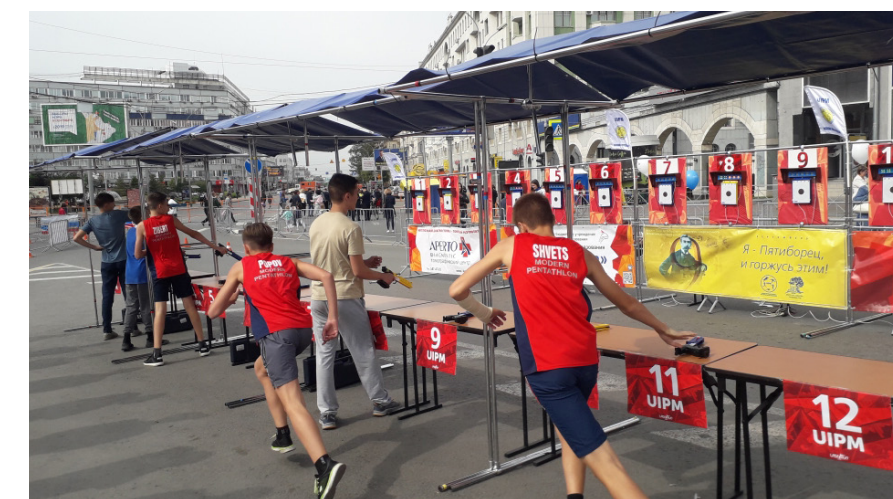
Athletes leave the shooting range and embark on their next lap in Novosibirsk (RUS)