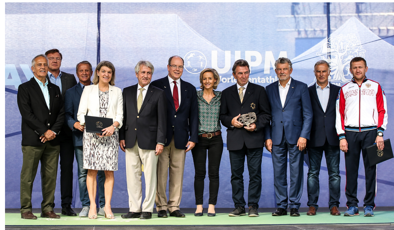
The attendant dignitaries gather on the stage after the presentation of three Pierre de Coubertin Medals in Budapest (HUN)