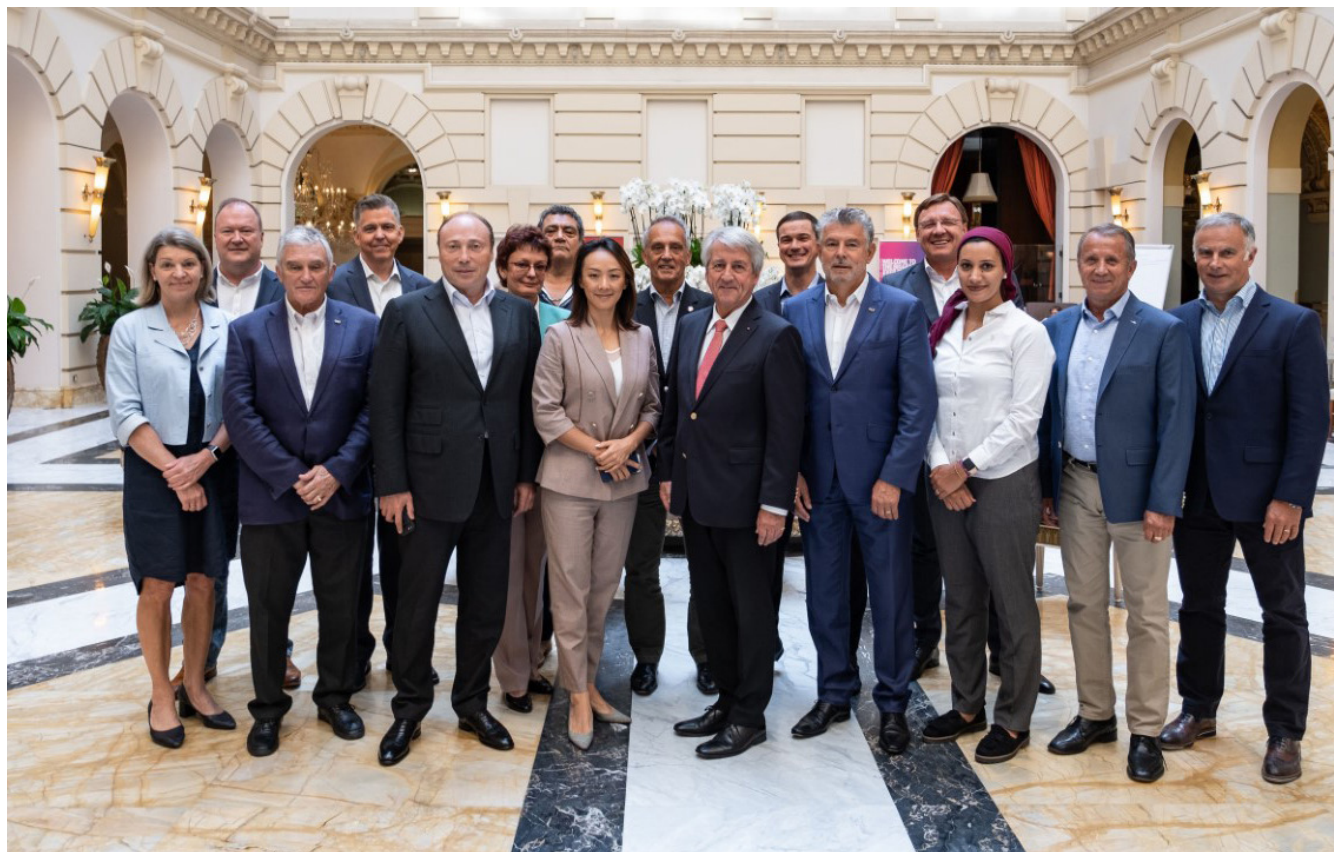
Members of the UIPM Executive Board gather for a photograph during their two-day meeting

The Executive Board approved a new tetrathlon concept proposed for introduction at the Youth Olympic Games Dakar 2022 and awarded a number of UIPM competitions and events. Xiamen (CHN) was chosen to host the UIPM 2020 Congress while