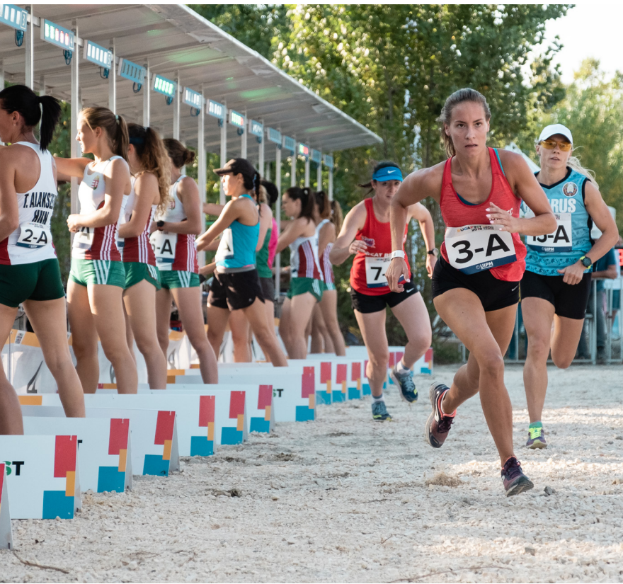
It’s time to break away as female athletes embark on another running circuit

The other showcase sport on the programme was indoor rowing, while the six competition sports were BMX freestyle, roller freestyle, parkour, breaking, 3x3 basketball and flying disc freestyle.