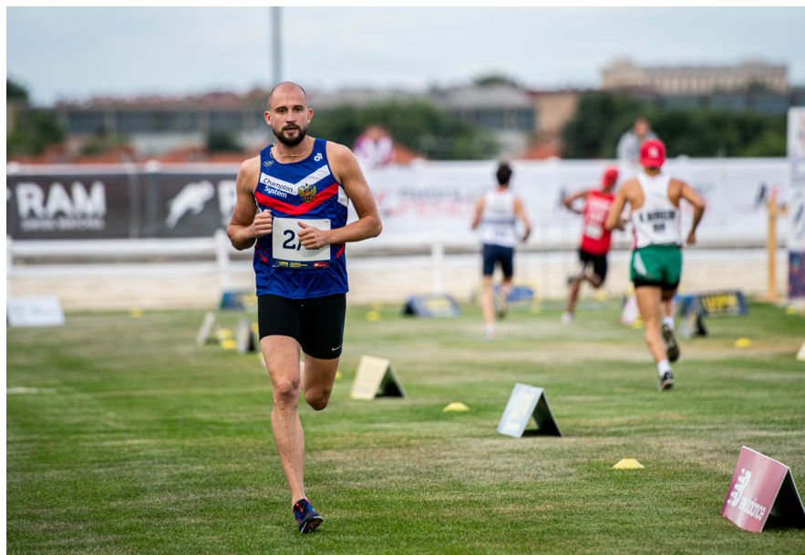
Rio 2016 Olympic champion Alexander Lesun (RUS) makes his way around the Laser Run course

The overall race opened up a little as a number of contenders suffered damage to their prospects. China (Zhang/Luo) and Poland (Gutkowski/Lawrynowicz) conceded 53 and 61 penalties respectively, while USA