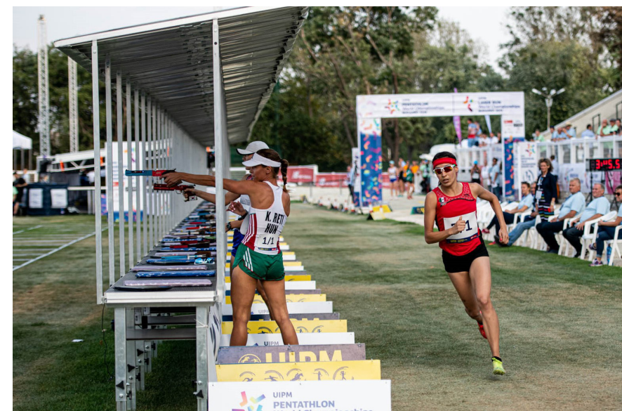
Action from the Laser Run as the Women's Relay reaches a climax