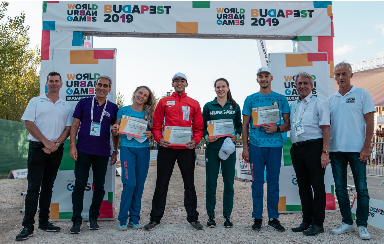
The leading performers are presented with their certificates