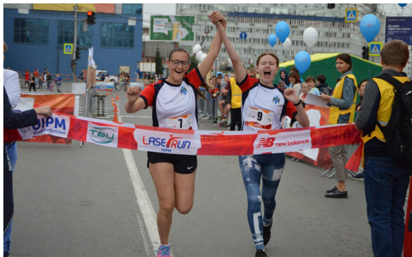
A moment of triumph and teamwork in Novosibirsk (RUS)

taking place in Novosibirsk at the same time, there were more than 12,000 spectators watching UIPM's fastest-growing development sport in the city's central square.