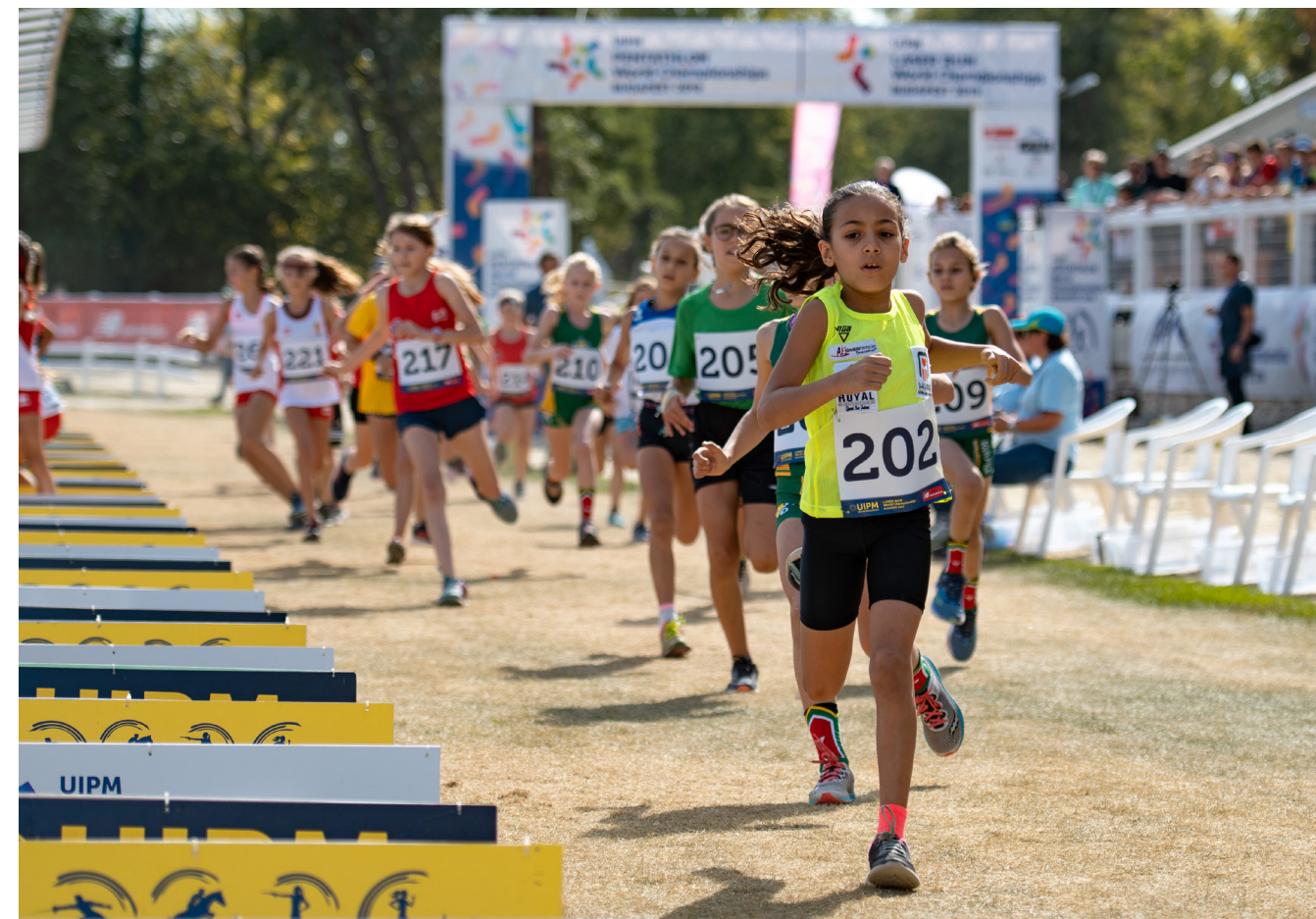
Competition is intense as a batch of Laser Run youth athletes arrive at the shooting range

Eleven nations in total won medals across the 10 age categories, with Great Britain securing eight medals and South Africa and Germany picking up two golds each. The other nations to enjoy podium time were Belarus,