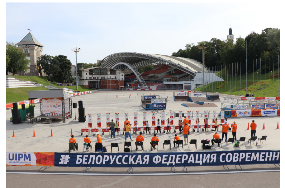
Action from the Global Laser Run City Tour in Vitebsk (BLR)

A spokesperson for the local organising committee said: "Many veterans of physical education and sports took an active part in the Global Laser Run City Tour in Vitebsk. Their successes and love for a healthy lifestyle were noted during the awards ceremony."