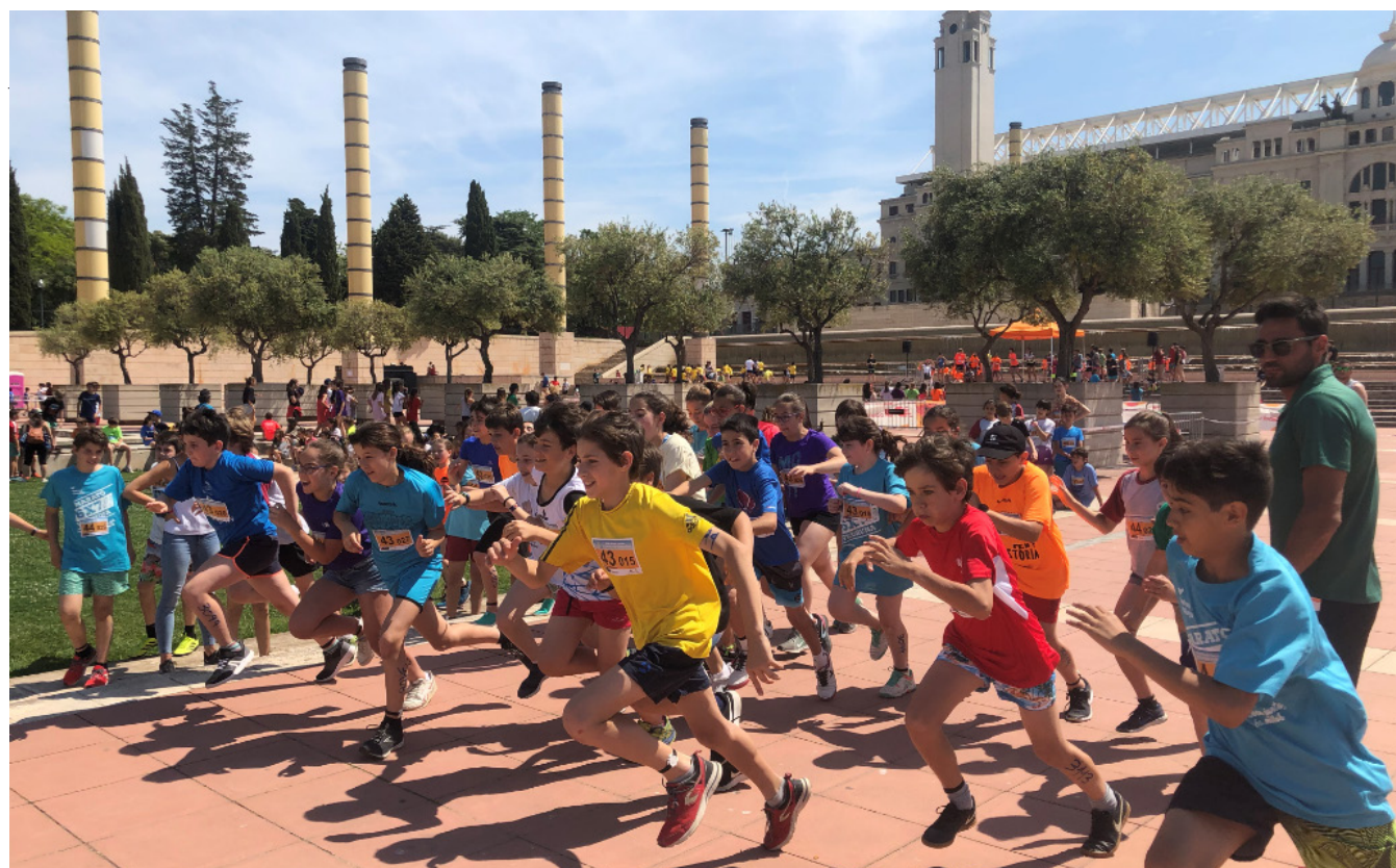
Youth athletes embark on their Laser Run in the shadow of the Olympic Stadium at Montjuïc in Barcelona (ESP)