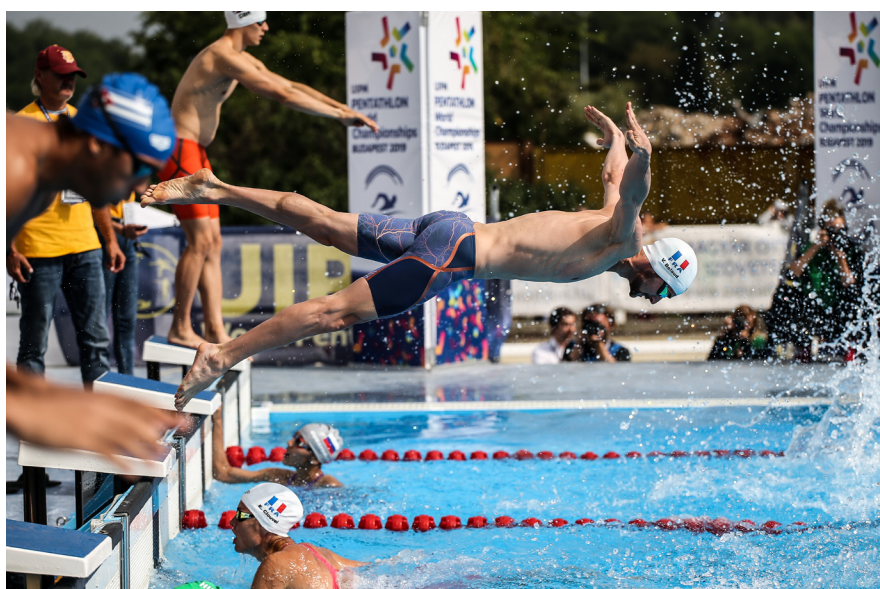
Male swimmers create a splash at the start of the Mixed Relay

victory that was all the more impressive for the identity of the athletes who joined them on the podium.