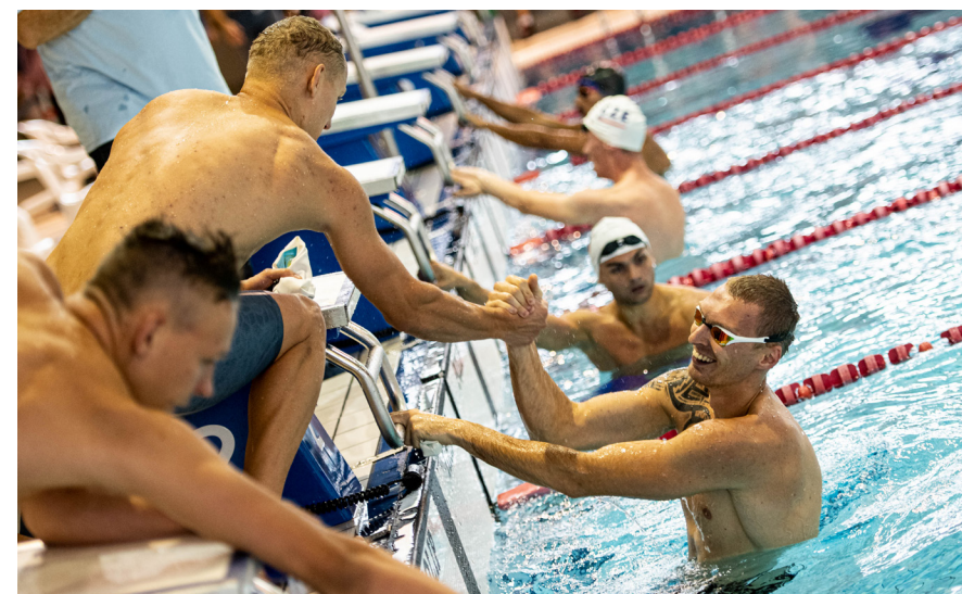
Two team-mates share a handshake during the Swimming discipline of the Men's Relay ...