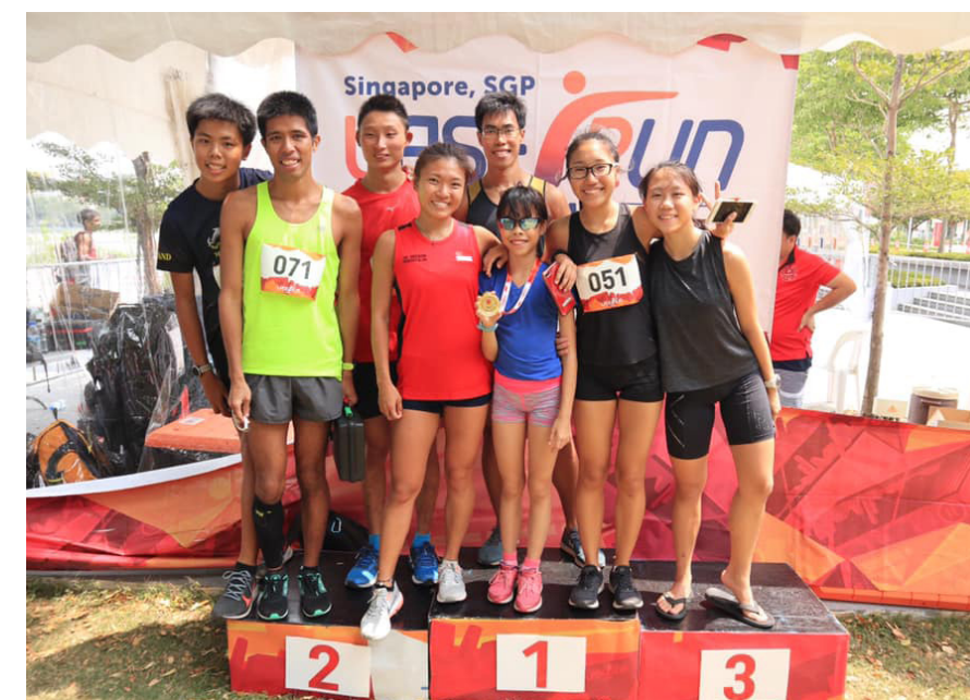
Podium time for some of the younger competitors in Singapore (SGP)

The 2019 Southeast Asian (SEA) Games in the Philippines are approaching and athletes from five nations used Singapore's third UIPM Global Laser Run City Tour on August