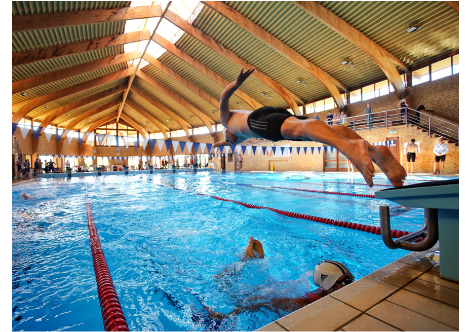
Action from the Swimming pool in Gyomro (HUN)