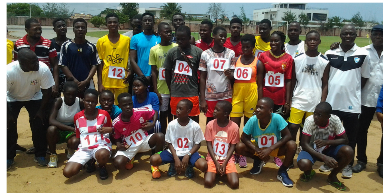
A group photograph in Lome (TOG)

Portugal's latest GLRCT in Machico came in the wake of events on the mainland in Portimao, Abrantes and Alenquer, with Amadora and Braga still to come.