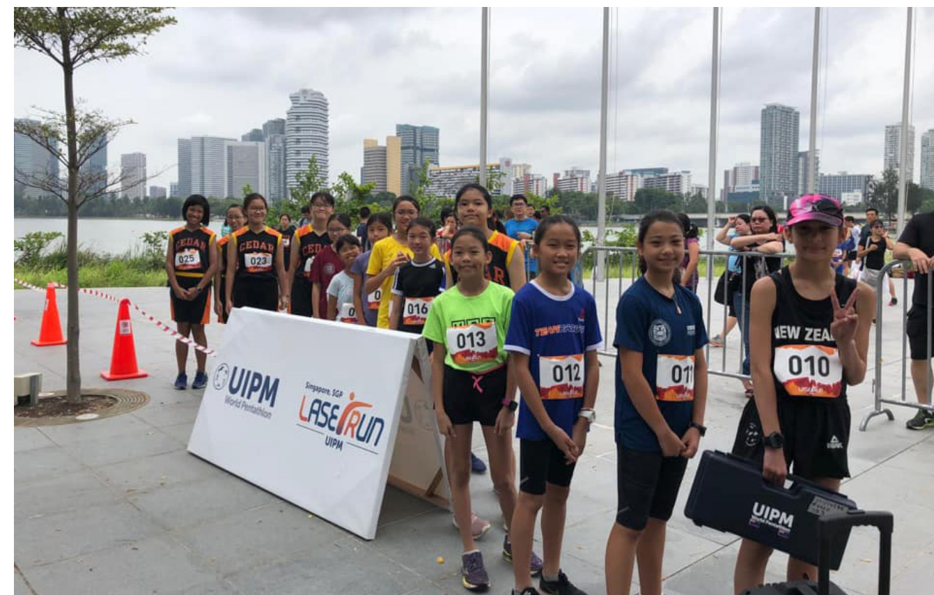
Young athletes prepare to demonstrate their running and laser shooting skills in Singapore (SGP)

A spokesperson for the local organising committee said: "As a relatively small sports federation, Laser Run gives us the opportunity to organize competitions