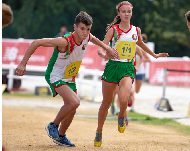
The Mixed Relay is all about teamwork and nowhere is this more important than at the handover