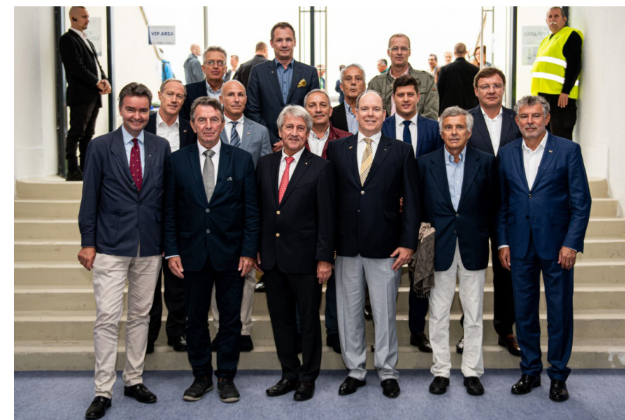
A VIP group photograph at Kincsem Park in Budapest (HUN) during the UIPM World Championships