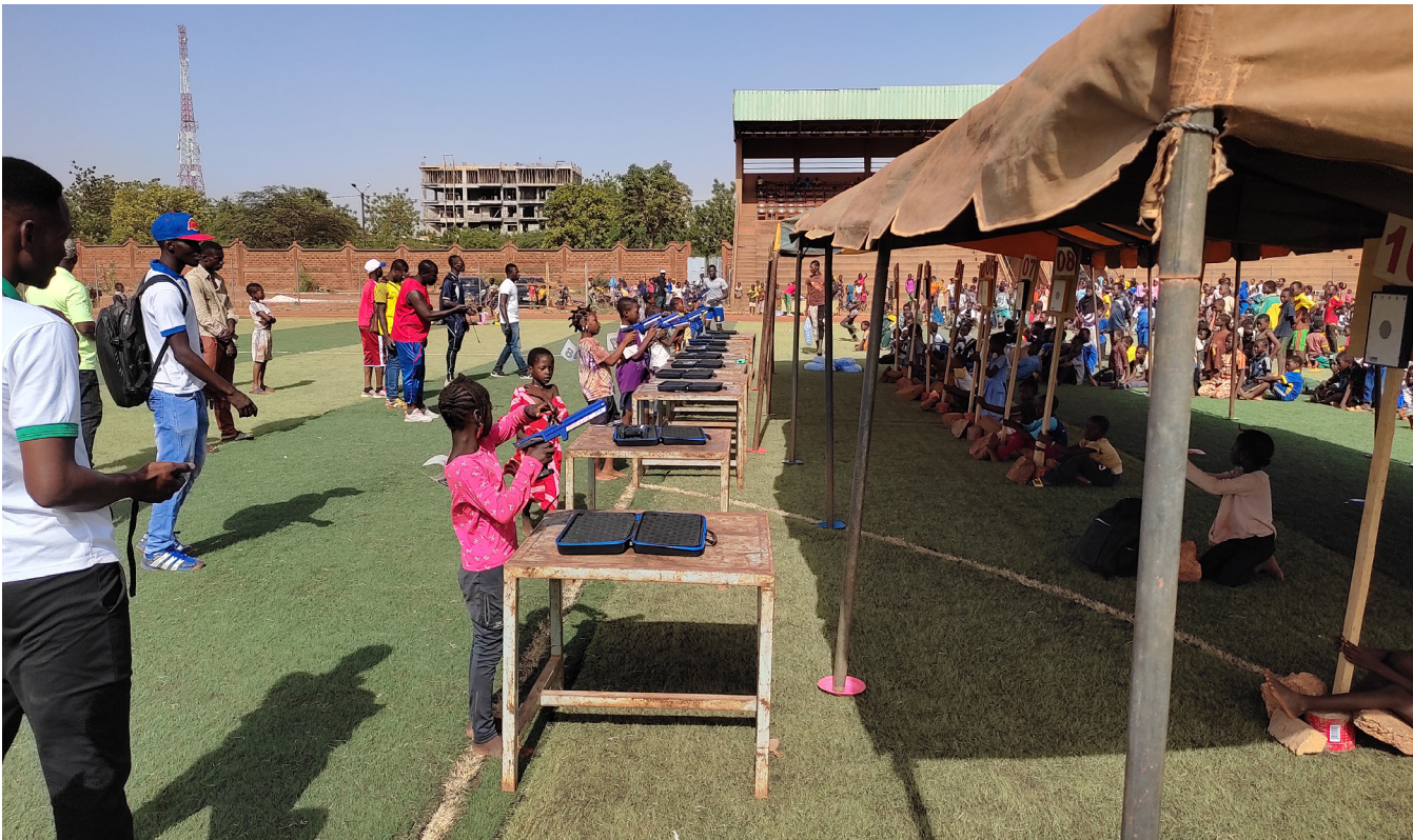
Ouhigouya (BFA) is a city in the north of Burkina Faso and around 370 participants came out to enjoy the Global Laser Run City Tour event there in May

teachers and coaches, without whom would have been impossible to carry out this great day.