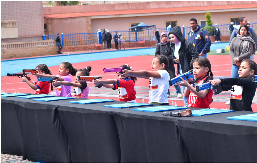
Alexandria (EGY) played host to one of the year’s early Global Laser Run City Tours in March