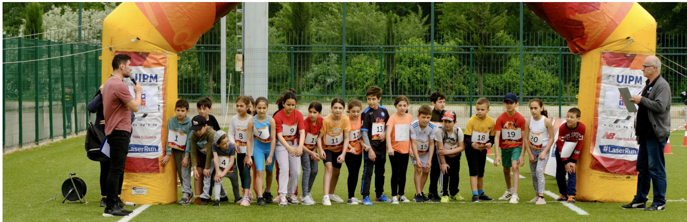
Athletes came from across Georgia to be put through their paces at the Global Laser Run City Tour in Gori (GEO) where around 100 participants joined in

“Our thanks to the collaboration of the physical education and classroom