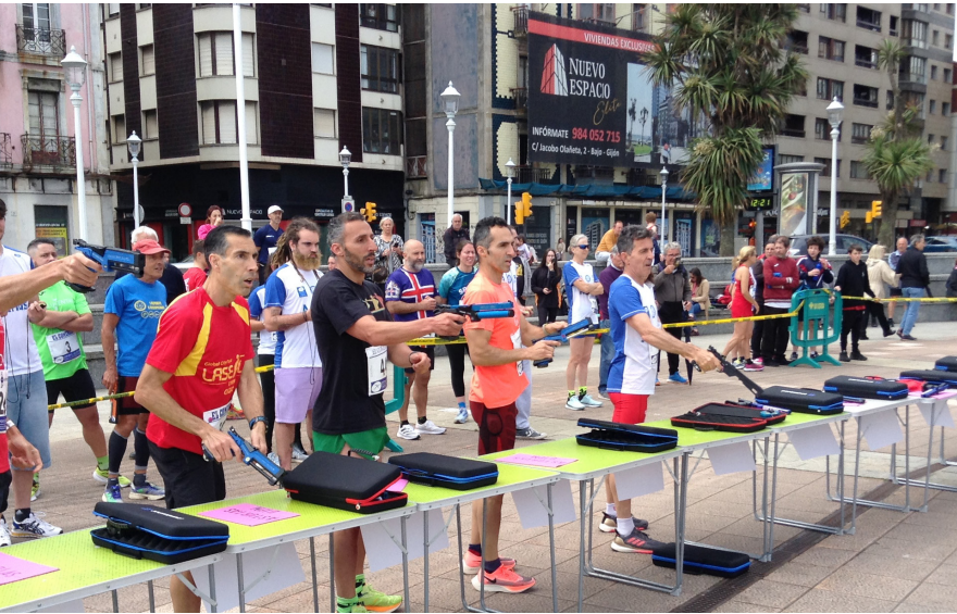
Competitors look to hit the target during comeptition at Global Laser Run City Tour Gijon (ESP)

“We are proud to have hosted a very successful event and thankful for the opportunity to do so., “I strongly believe the event has promoted Laser Run in our province and created awareness, which helped us gain many new athletes.”