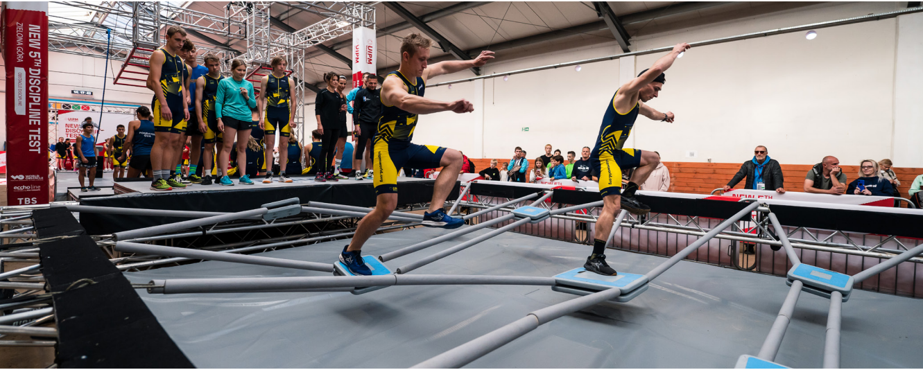
A new Obstacle discipline is currently being integrated into Modern Pentathlon at junior and youth levels with seniors to follow after Paris 2024.

You can also read the UIPM brochure, A Perfect Match: The New Modern Pentathlon and LA28 on the UIPM website or contact uipm@pentathlon.org to request a copy.