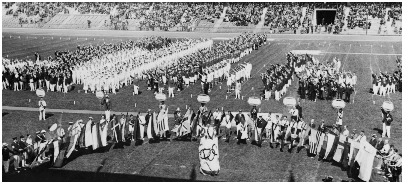
The opening ceremony of the 1924 Olympic Games at the Stade de Colombes in Paris where a tribute was paid to Pierre de Coubertin.