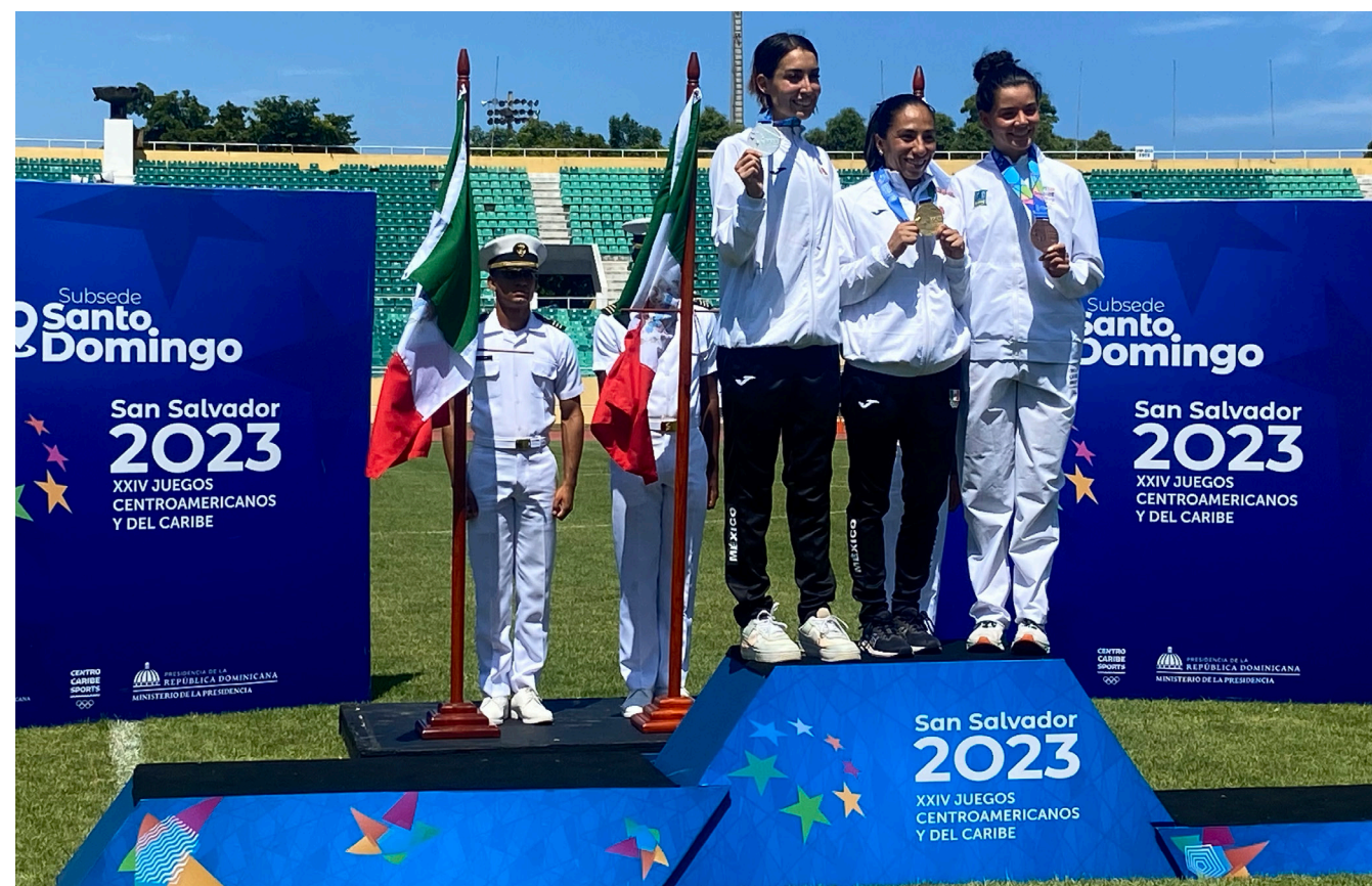
It was all smiles for Mexico as they dominated the Women's Individual Final, above, the Men's Team Relay, right, and every other event at the 2023 Central American and Caribbean Games in Santo Domingo (DOM)