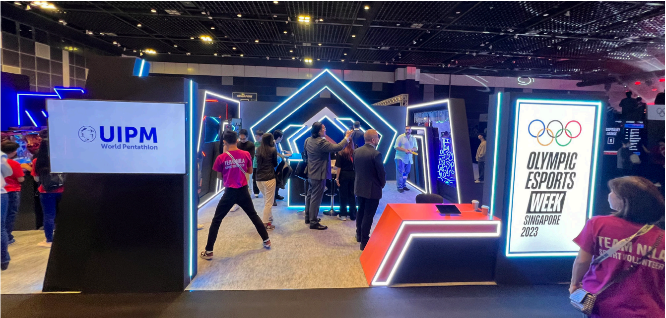
The first ever IOC Olympic Esports Week took place in Singapore with UIPM's E-Laser Run Game having a significant presence at the event