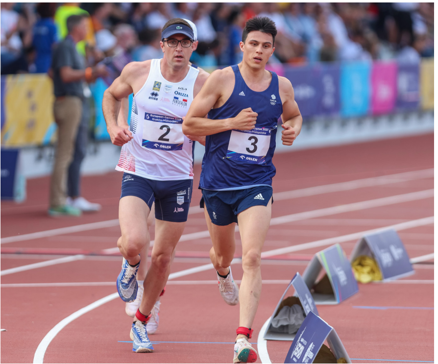
Reigning Olympic champion Joseph Choong (GBR) moves ahead of experienced rival Valentin Prades (FRA) to secure a quota qualification place for next summer's games in Paris with silver.

"We are so united in our movement, and that makes me very proud, and I am thankful to all the referees and volunteers who made it happen. Congratulations to