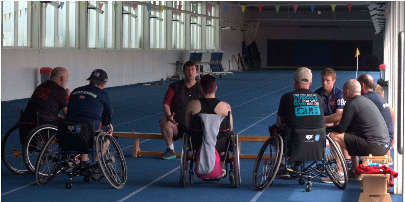
Training consisted of a 4-hour workshop followed by a full day of athlete classification ahead of the UIPM 2023 World Para Laser Run World Championships