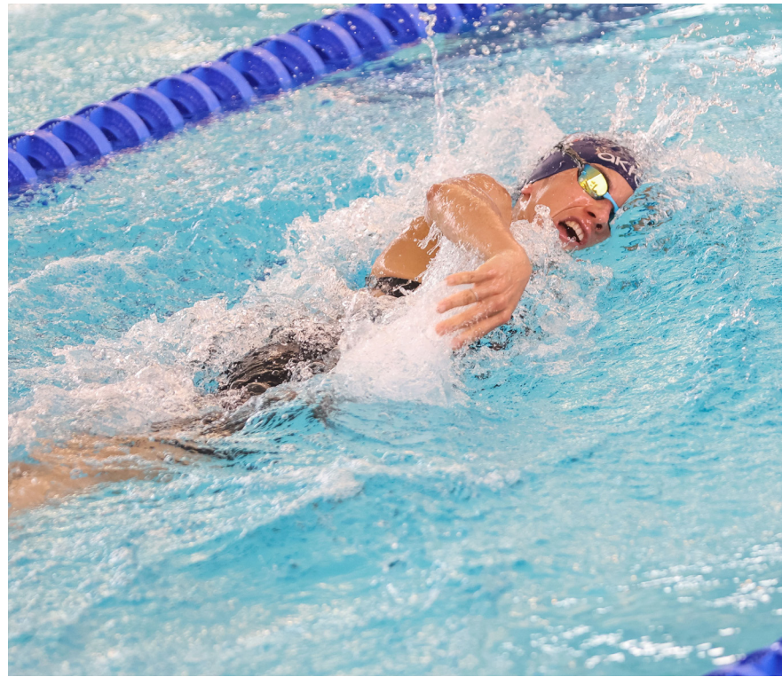
Action from the Swimming discipline in the Women's Final in Krakow (POL).

try my best there. I hope something will happen different to Tokyo."