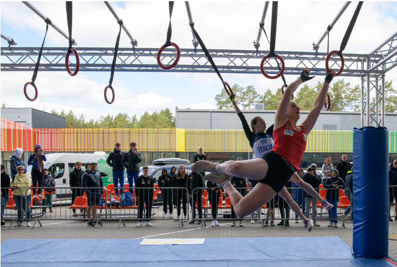
In September the host city Druskininkai (LTU) will stage the UIPM 2023 Pentathlon Junior World Championships, where more history will be made

AD: Indeed it was my first official competition with Obstacle and on my personal side, everything was almost perfect, very good quality of the course and also everything fine in terms of