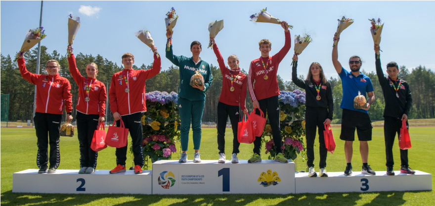
There was widespread positive feedback among athletes to the competition in Lithuania

AD: In my personal opinion, the Obstacle competition was really exciting. During the Men’s Individual Final I felt like I was in a stadium with the cheering of the audience, and I hope this is only the first step in making our beloved sport known to the whole world.