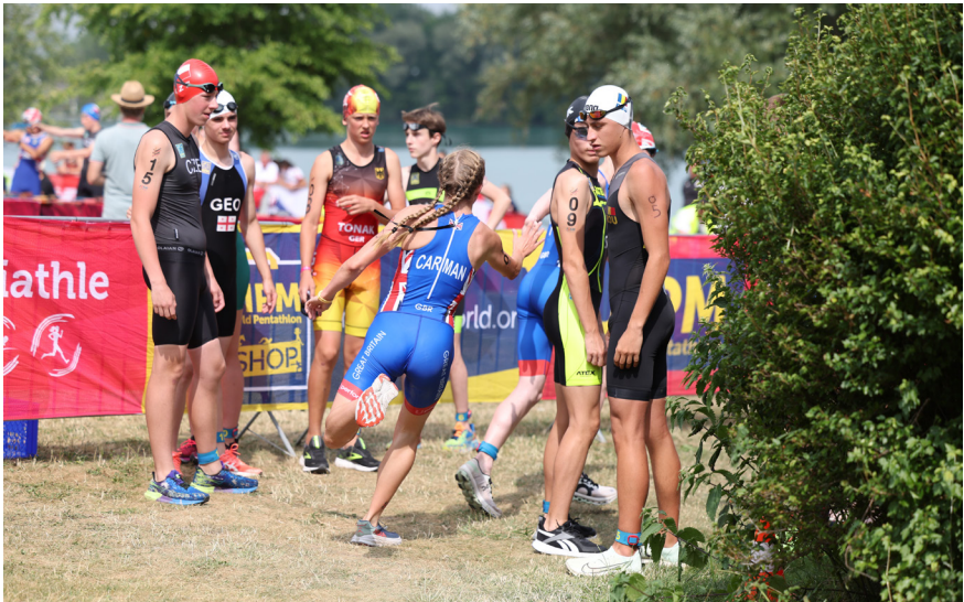
Twenty-five countries were represented during the 2023 European Biathle/Triathle Championships