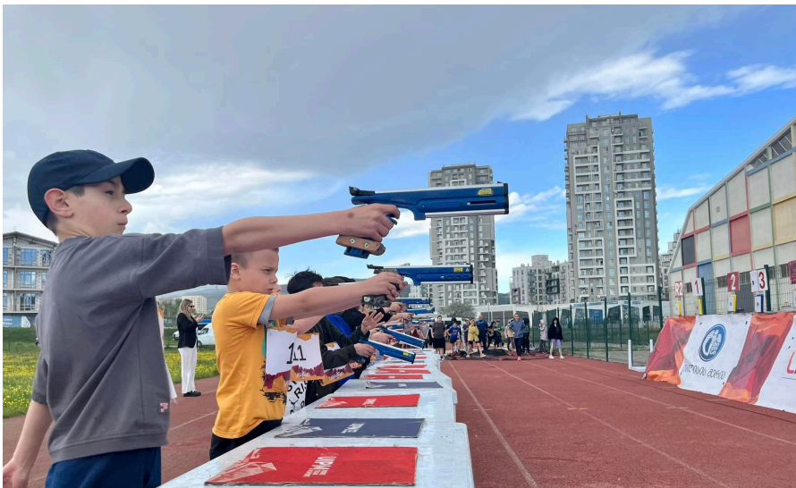
The Global Laser Run City Tour in the Georgian capital city of Tbilisi in April