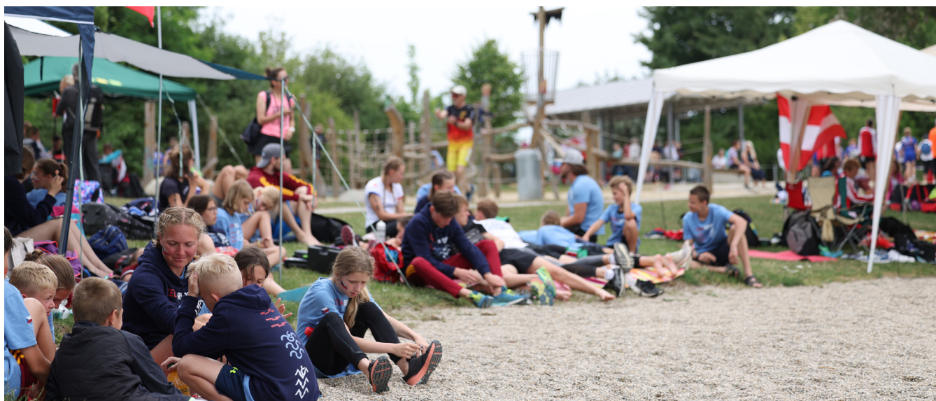
The atmosphere around the Kronthaler Weiher in Erding (GER) was family-friendly and community-focused throughout four days of competition

Nations had registered — the largest group (188) coming from Great Britain. Germany entered the race with 130 athletes, followed by Hungary with 70 athletes.