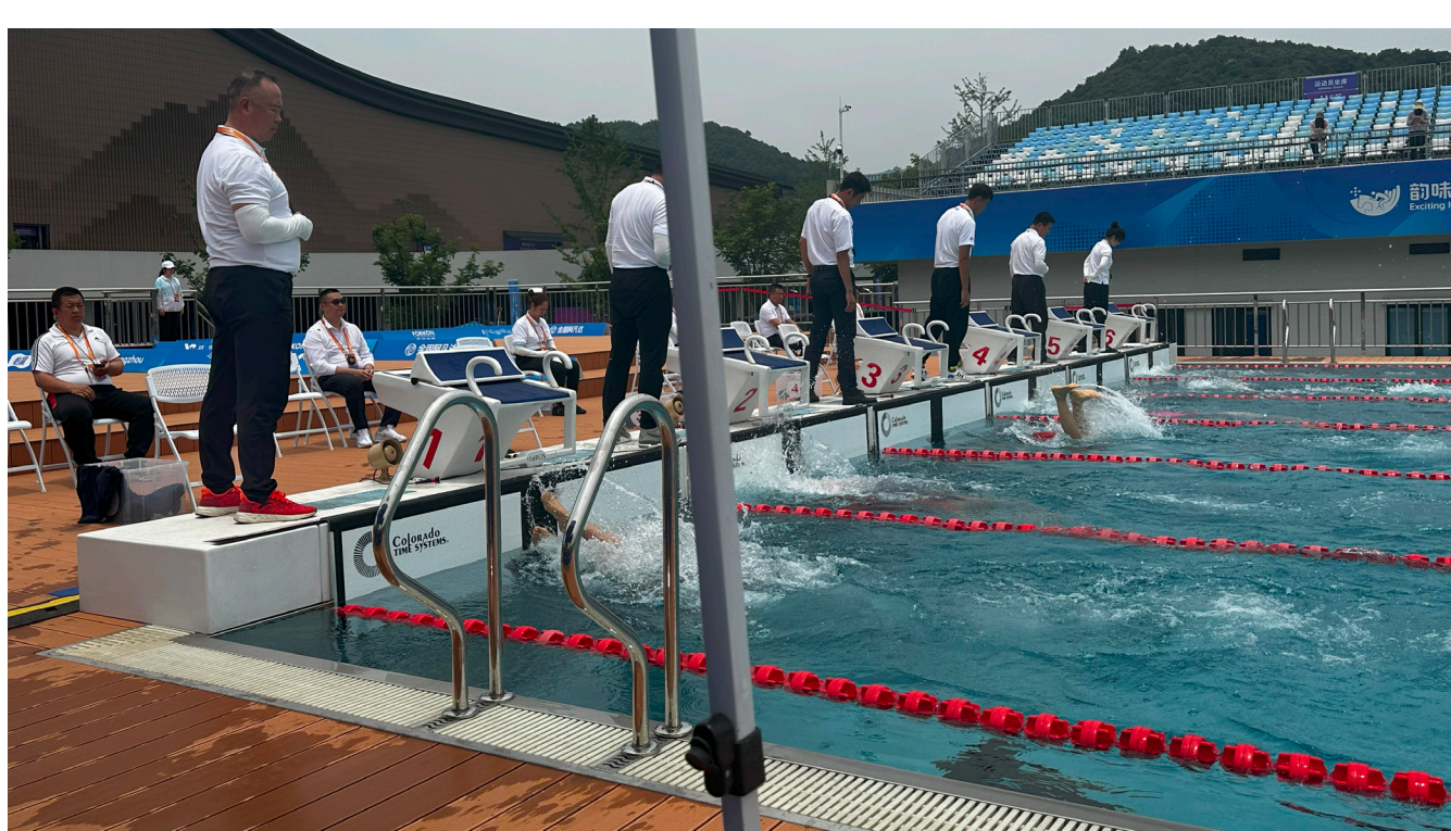
Attendees are put through their paces at the pool during the week-long course in Hangzhou (CHN).

Modern Pentathlon playing its part, is another positive sign of innovation in our movement.