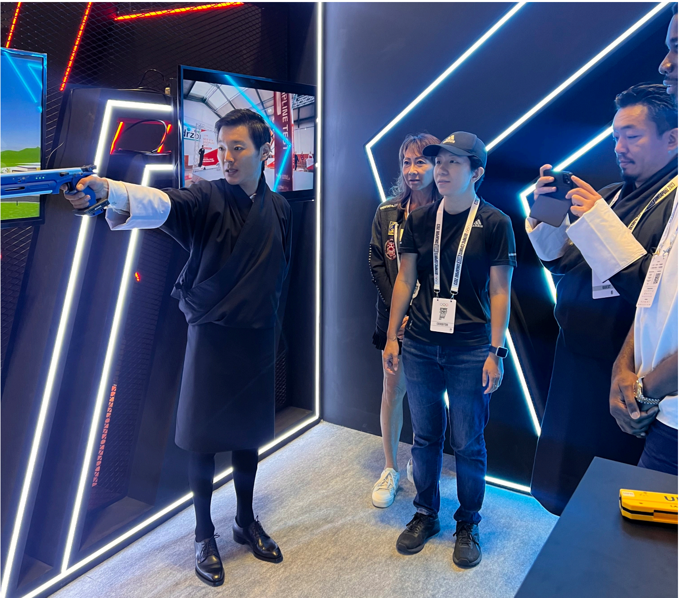
E-Laser Run proved to be a popular attraction among the thousands of attendees at the IOC's first Esports Week in Singapore