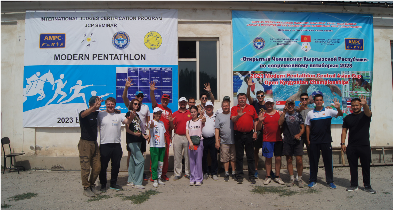
Central Asia has been the scene of much development lately and that continued with a recent UIPM Judges Certification Programme course in Bishkek (KGZ)

that took place here in May really helped to prepare for a smooth and successful event. Now we will begin to turn our thoughts and look forward to the Pan Am Games in Chile later this year.”