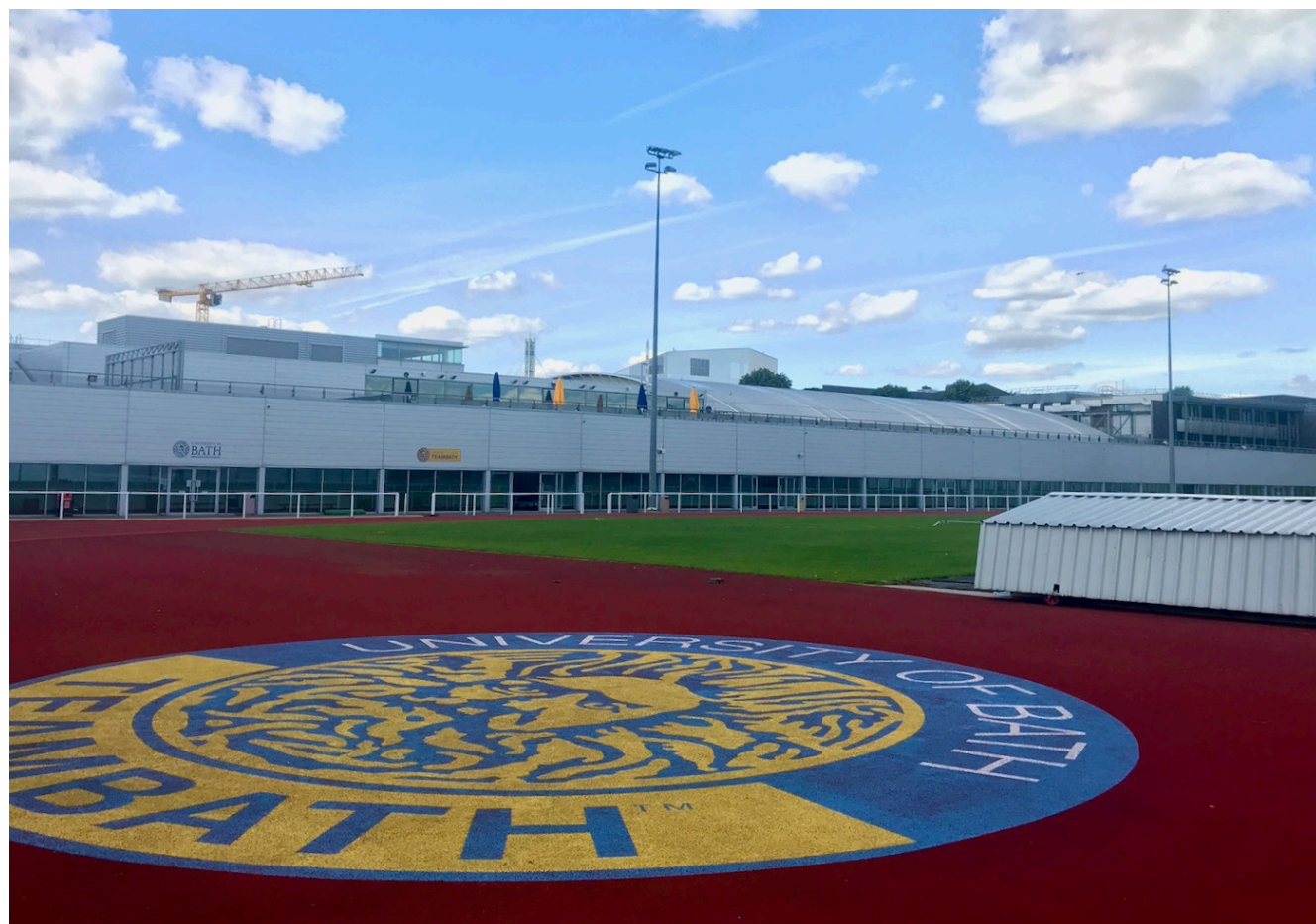
The University of Bath will be the venue for the UIPM 2023 Pentathlon and Laser Run World Championships from August 19-28