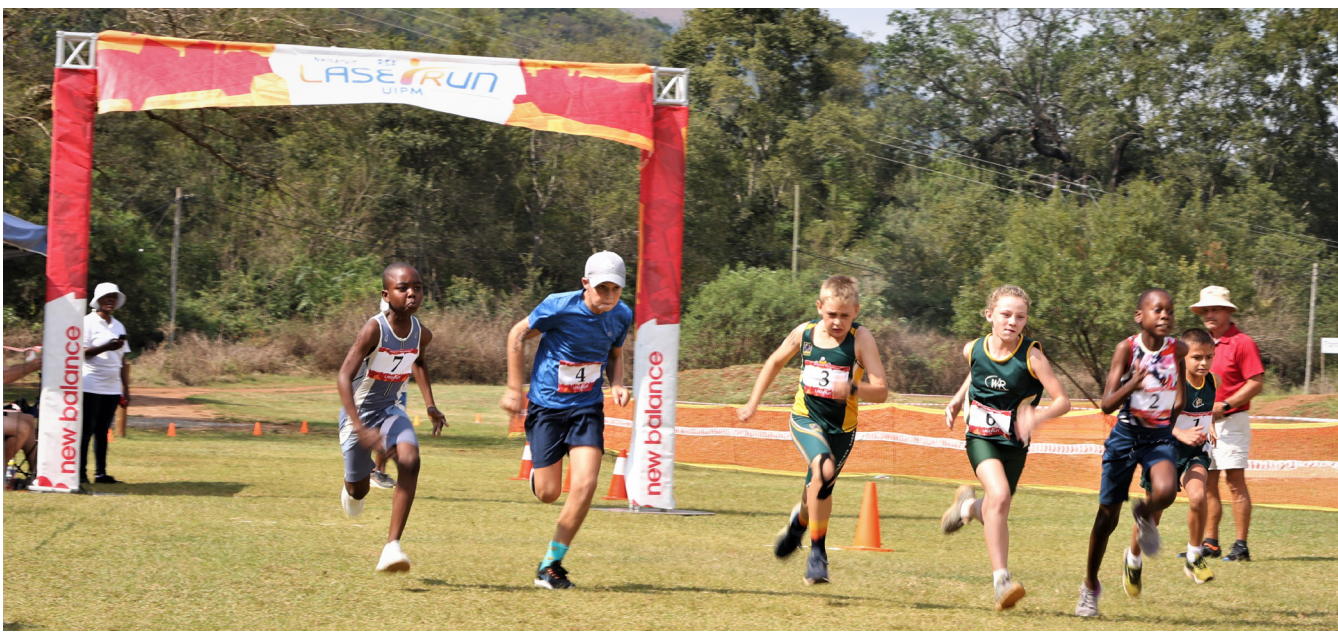
Amid beautiful surroundings in Nelspruit (RSA) over 80 competitors from U9 to Masters took part in the Global Laser Run City Tour competition