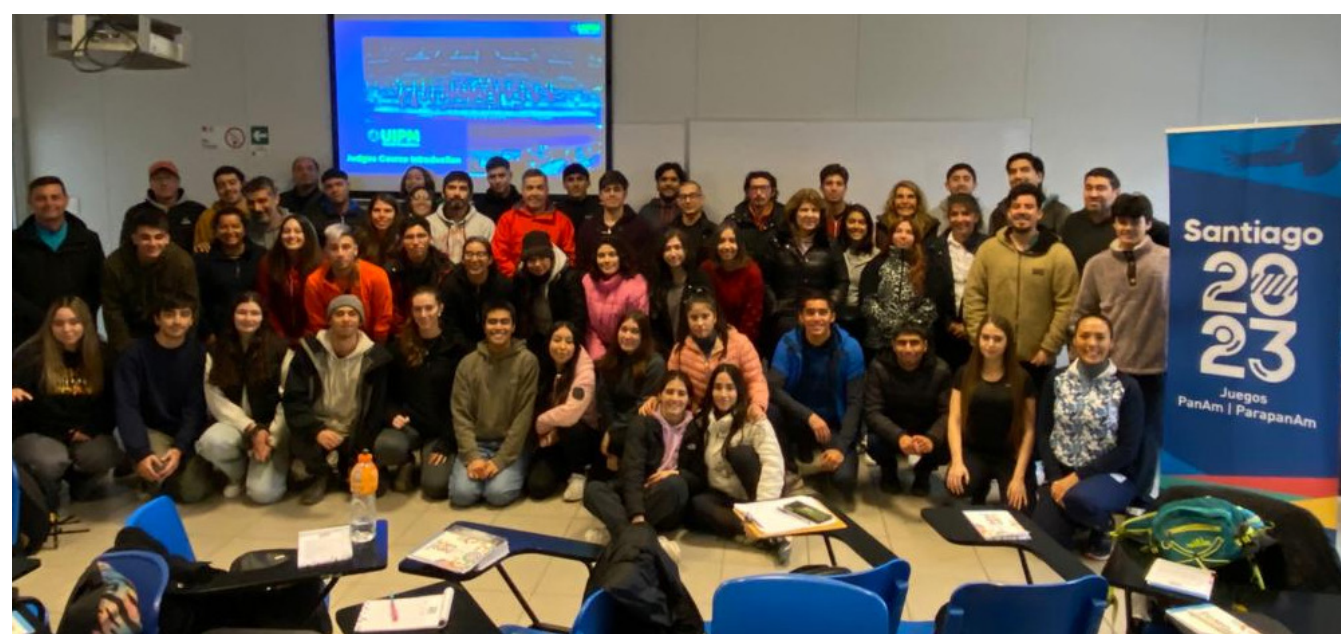
Santiago (CHI) will host the Pan Am Games for the first time in its history later this year and saw 57 participants in the recent UIPM JCP course there.

The campaign will also work towards increasing access to pentathlon training and education for marginalized groups and will focus on several initiatives,