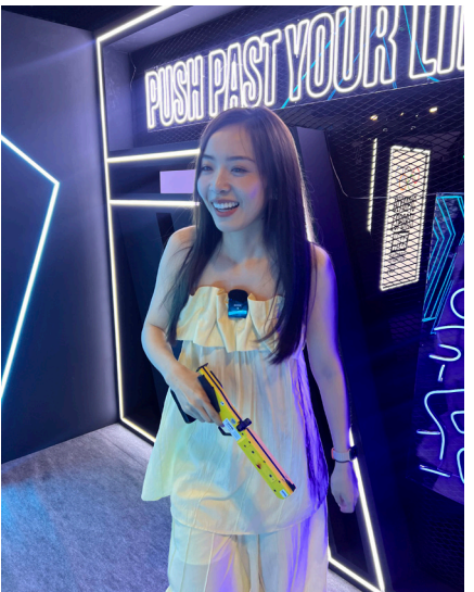
Attendees praised the UIPM E-Laser Run Game

a historic milestone which marked "the next step in the promotion of virtual sport within the Olympic Movement, further connecting with the gaming community" was all too clear from the three days where competitors were cheered on by a sold-out crowd of fans and all events streamed online.