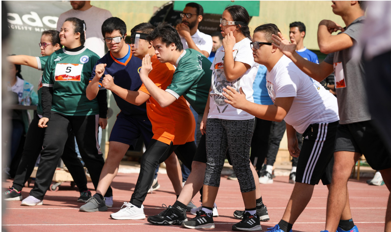
Over 320 participants joined in the action at the Global Laser Run City Tour event in Banha City (EGY) in late April