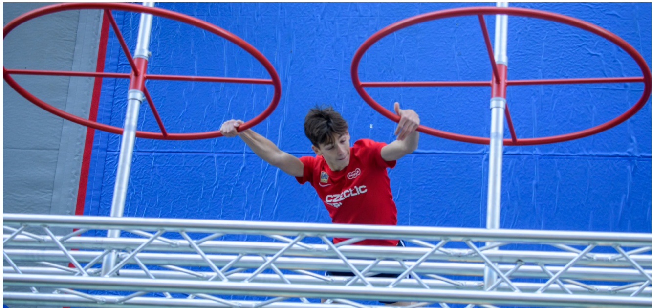
Lithuania became the first organiser to deliver a continental competition with the new Modern Pentathlon discipline of Obstacle included.

In a season of historic firsts, Lithuania is playing a lead role.