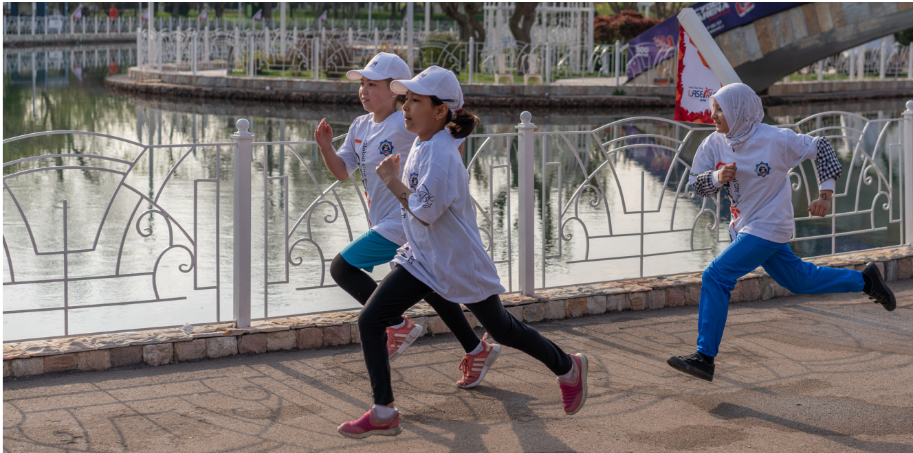
Athletes of all ages had the chance to sample Laser Run during the GLRCT in Eco Park in Tashkent (UZB)

A hectic three months at the elite level of Modern Pentathlon has been mirrored all the way down the development pipeline, with the Global Laser Run City Tour continuing to expand into new territories and communities across the world.