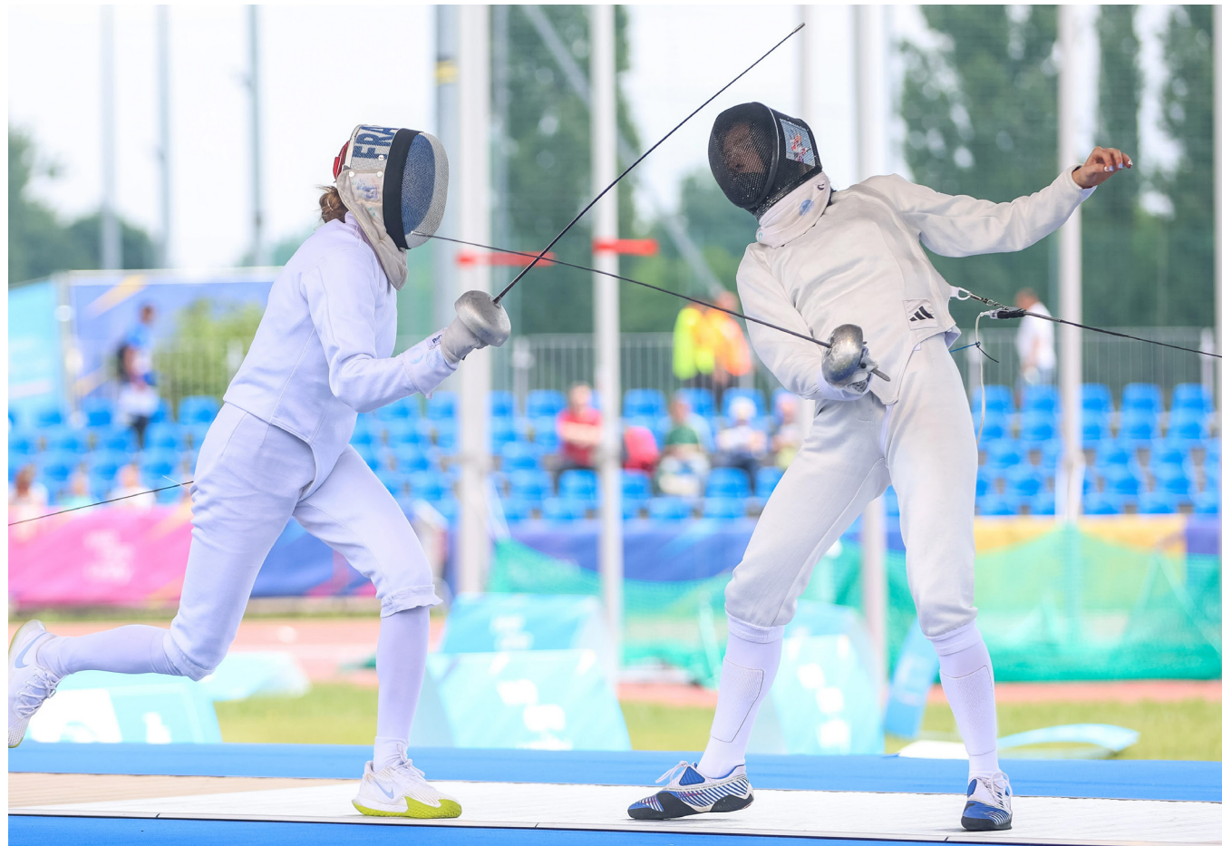
The competition was unsurprisingly fast and fierce on the piste in the Fencing Bonus Round of the Women's Final at the European Games.