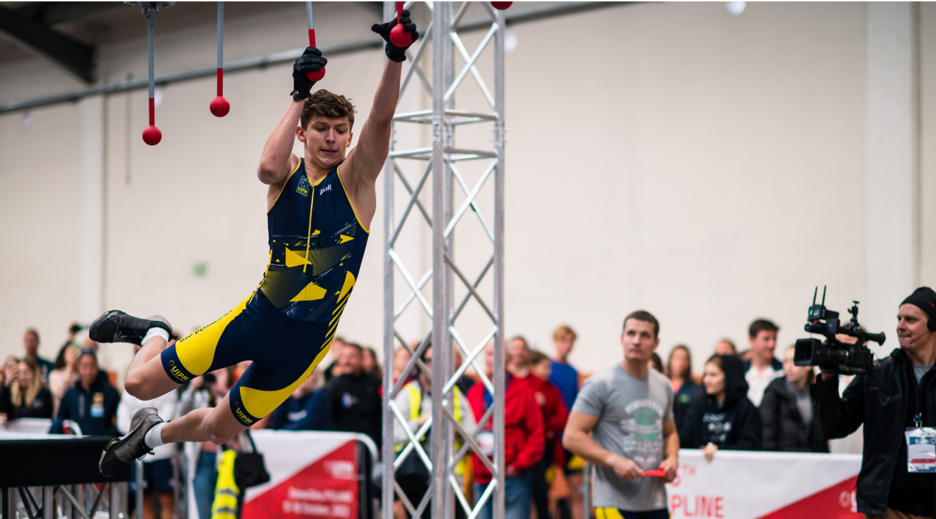
The poll of 1,500 US citizens found that nearly half of young people are more likely to watch the Olympics with Obstacle introduced to Modern Pentathlon

Nearly half of young people in the United States are more likely to watch and follow the Olympic Games once Modern Pentathlon has introduced Obstacle to the programme, a new survey has found.