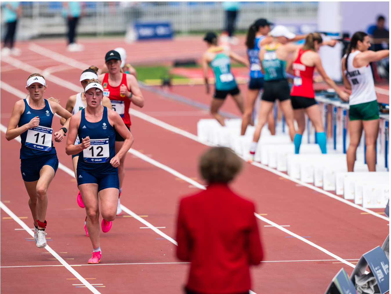
The Women's Final was an energy-sapping affair in Krakow (POL)