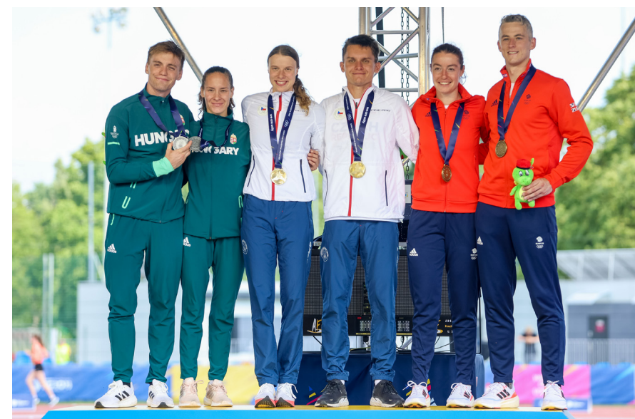
Mixed Relay honours went to Czech Republic with Hungary second and Great Britain taking bronze.