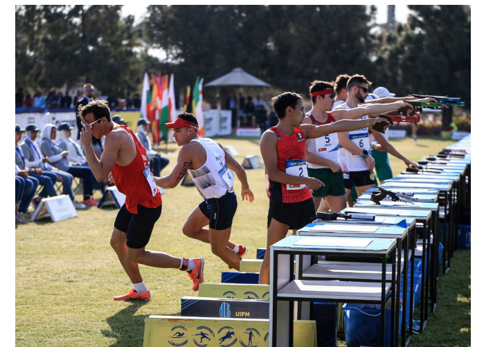
On a warm day in Cairo, the pool didn't offer much relief to competitors in a red-hot Men's final (above left) before an exciting Laser Run finale (above).