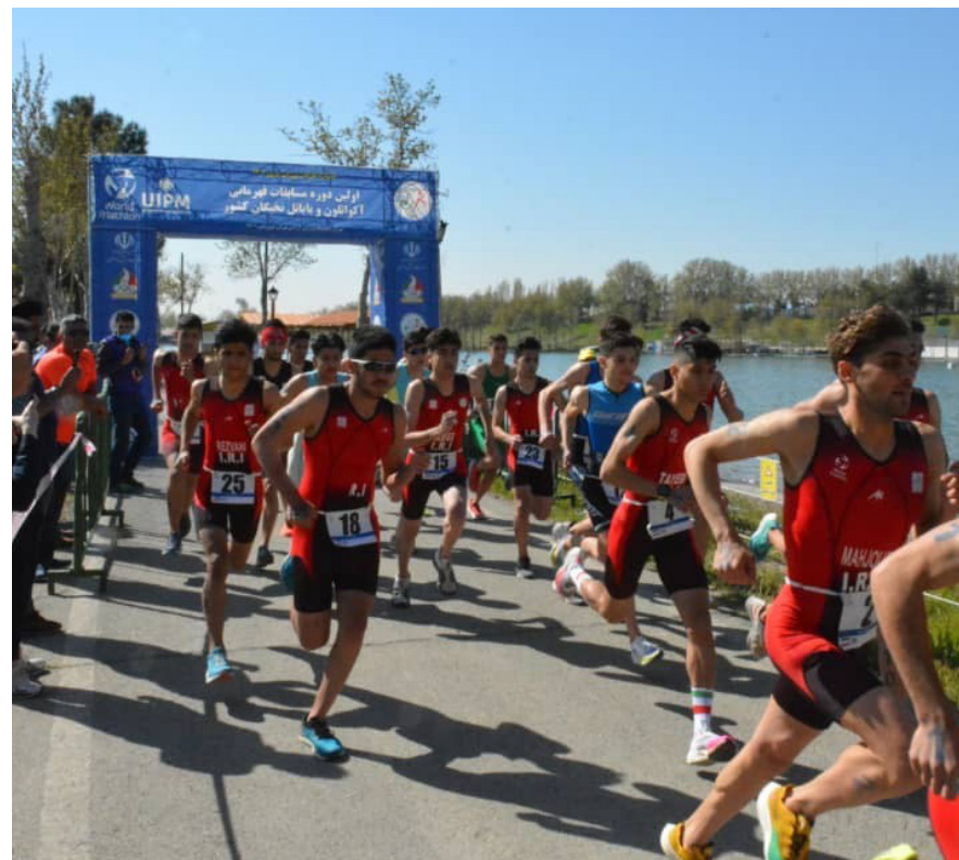
Laser Run action in Tbilisi (GEO) and, below, Banha (EGY)