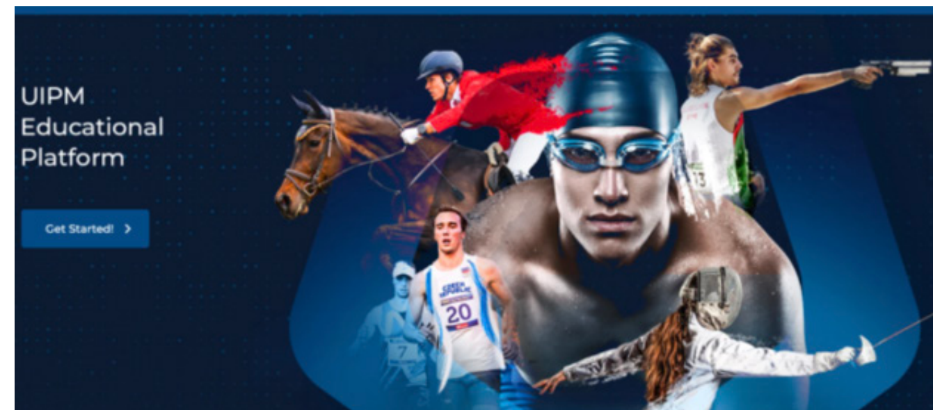
The new UIPM Educational Platform for athletes, judges and coaches has undergone a complete redesign and boasts fresh, new content.

security, to find a quiet time to think about a better world, never giving up the hope of humanitarian life in present time and future. Happy Easter to all of you and your families!"