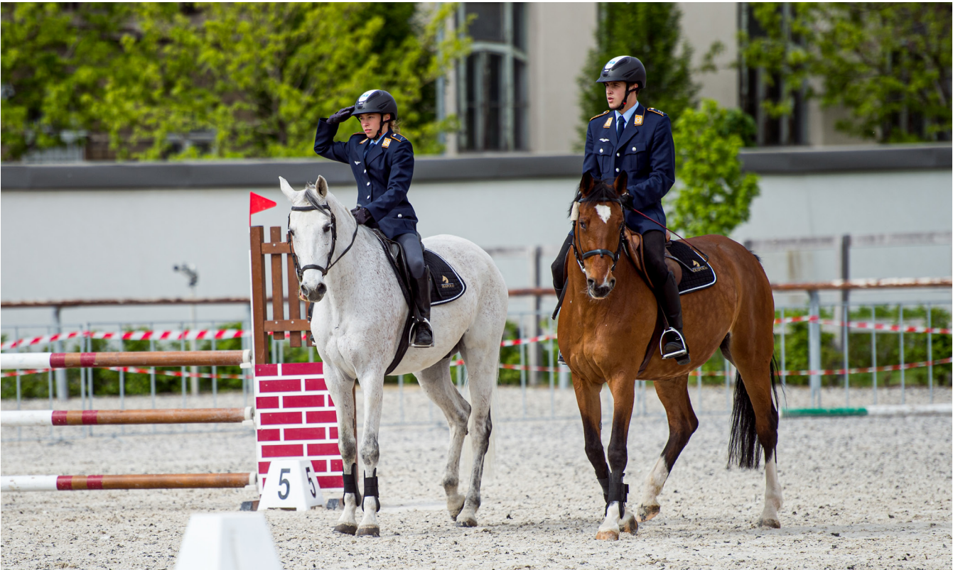
The Mixed Relay Final in Budapest proved to be a day of low scoring in the Riding discipline (above) but teams looked to make up ground in Fencing (below).

Three continents were represented on the podium, but once again there was no doubt about the country on the top step.