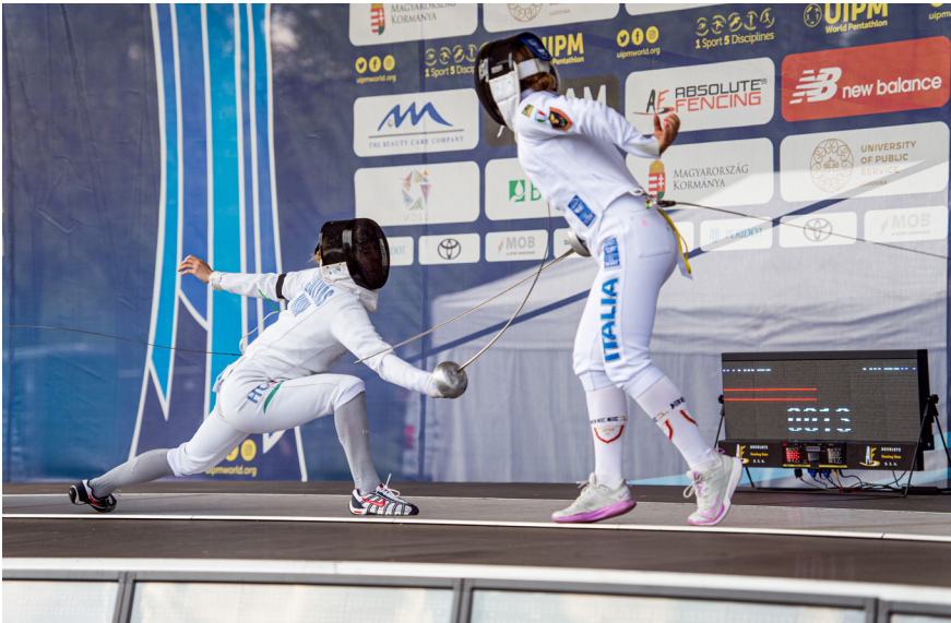
Athletes from Egypt and France enjoyed the best of the action in the Fencing Bonus Round.