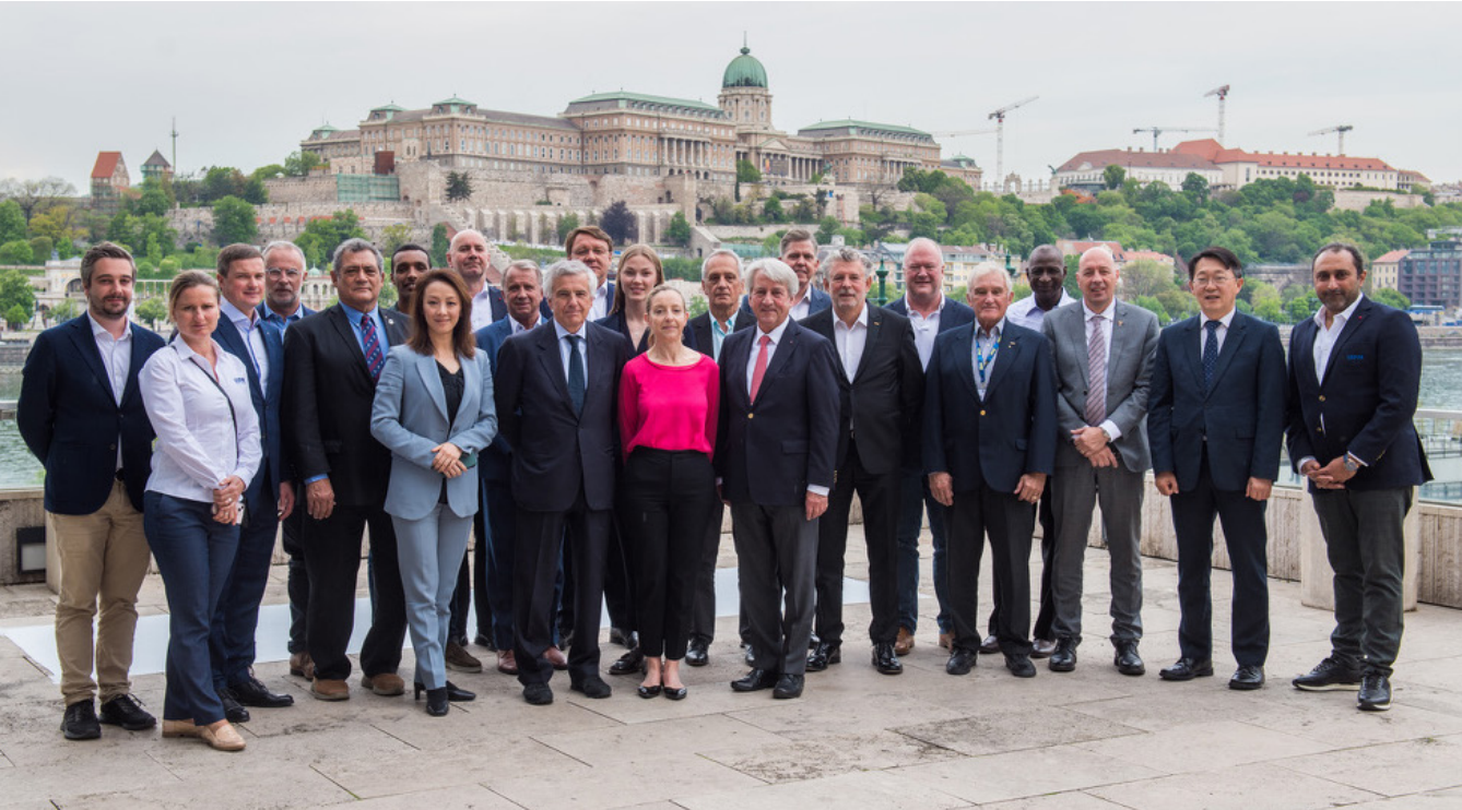
A group picture of UIPM Executive Board Members and supporting UIPM staff in Budapest (HUN)

June immediately after the UIPM 2022 Pentathlon World Cup Final. The mission to prepare Modern Pentathlon for a new era starting with the Los Angeles 2028 Olympic Games is now entering a new phase. The EB furthermore discussed the war in