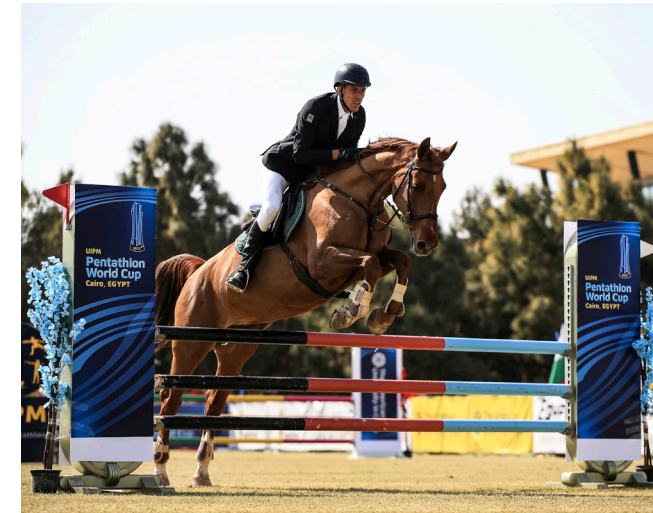
Four of the Men's finalists in Cairo managed a perfect Riding score (above) while the action on the piste was dominated by the Hungarians (above).