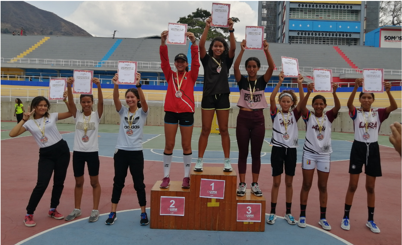
Youth athletes pose with their certificates and medals in Caracas (VEN)

The global phenomenon of Laser Run is well and truly back!