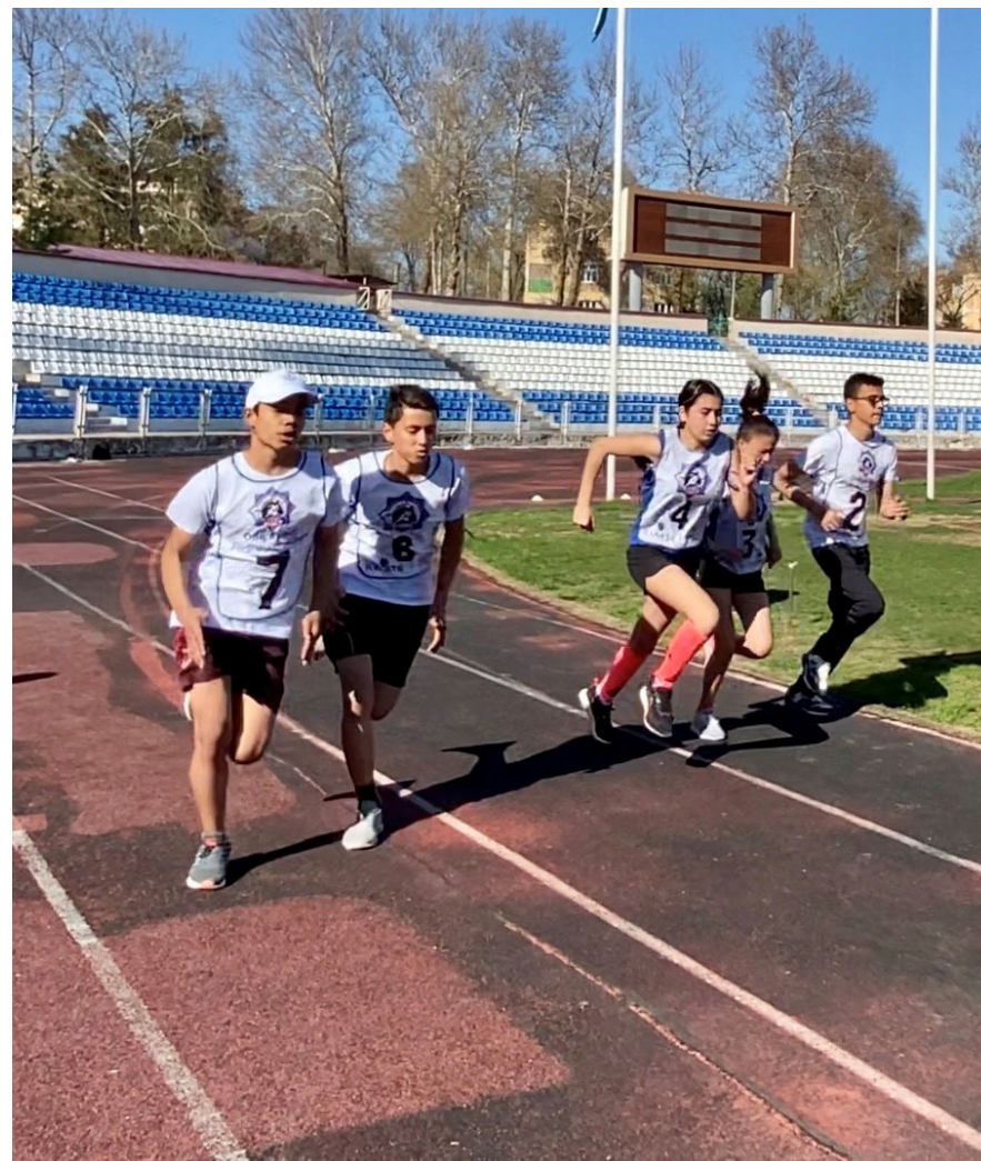
Hard running in Chirchiq (UZB) and, below, smooth shooting in Gori (GEO)