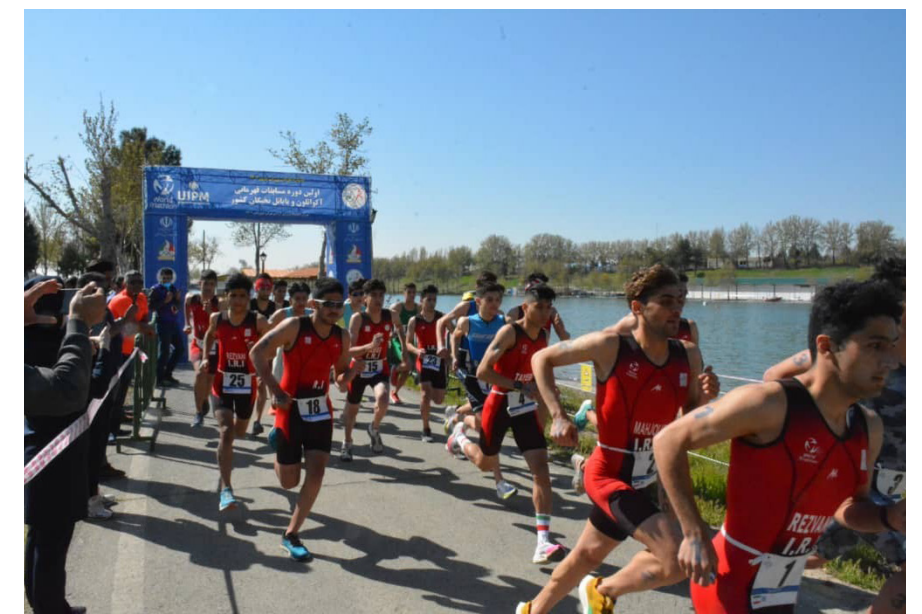
Iran's first National Biathlon Championships is a big hit with these senior male athletes

"We got through so much important work together and the growth I saw even in those five days makes me very excited for this group. UIPM's new Education Platform also offers great support to judges in Turkey and around the world as they continue their development so I thank UIPM staff for their work on this important endeavour and I wish all of the participants in Ankara continued success."