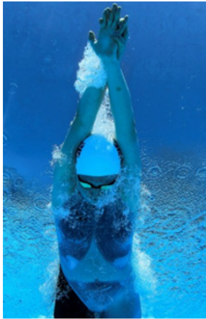
Five of the competitors in the Women's Final went sub-2.20 in the Swimming discipline