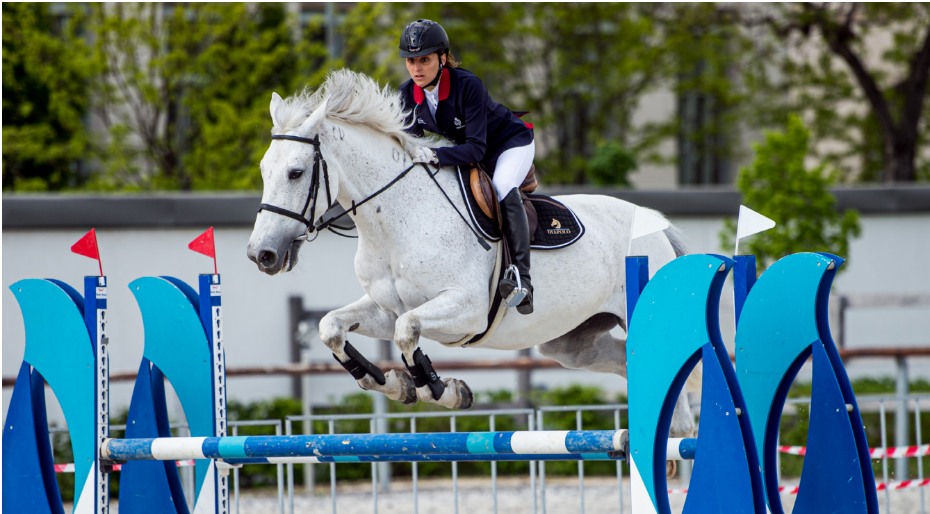
Four riders recorded perfect scores of 300 in the Riding discipline of the Women's final in Budapest —just as the men had done earlier in the day.