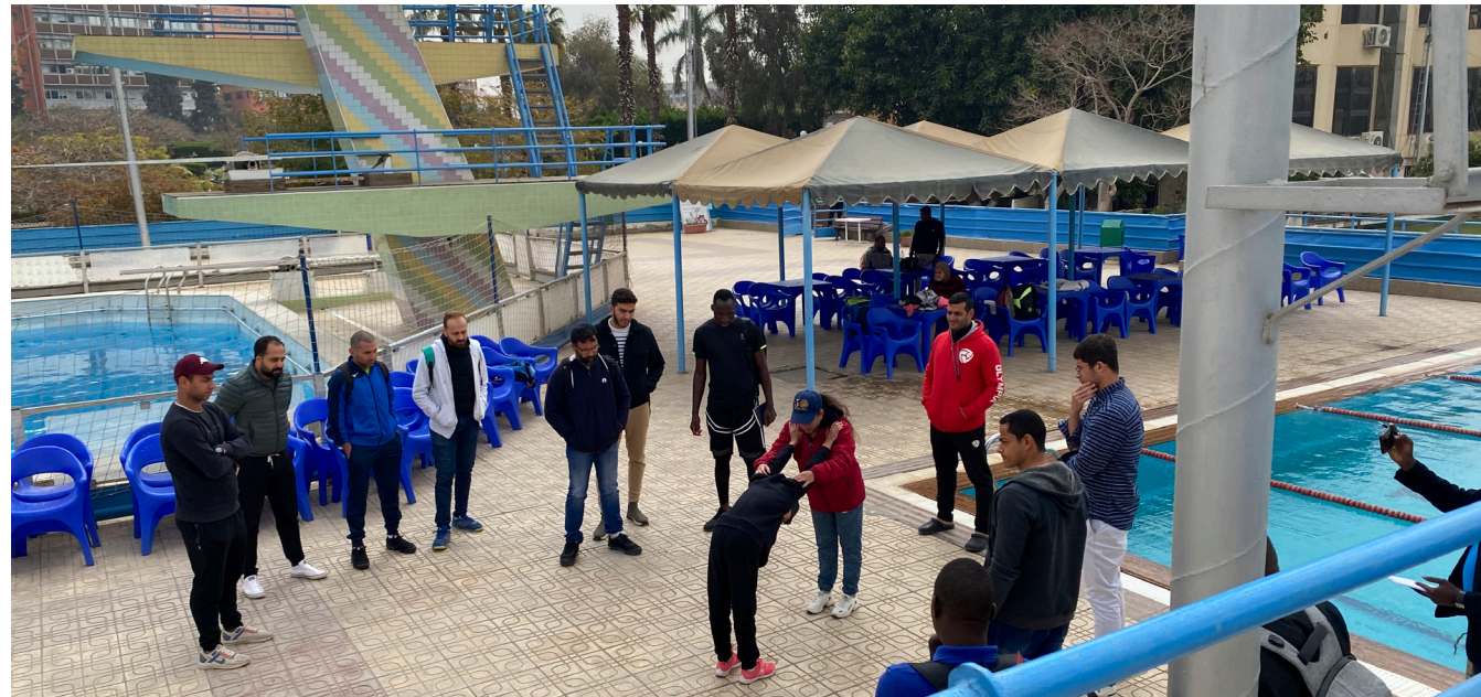
A week-long CCP course took place in Cairo (EGY) during the first leg of this year's UIPM Pentathlon World Cup circuit