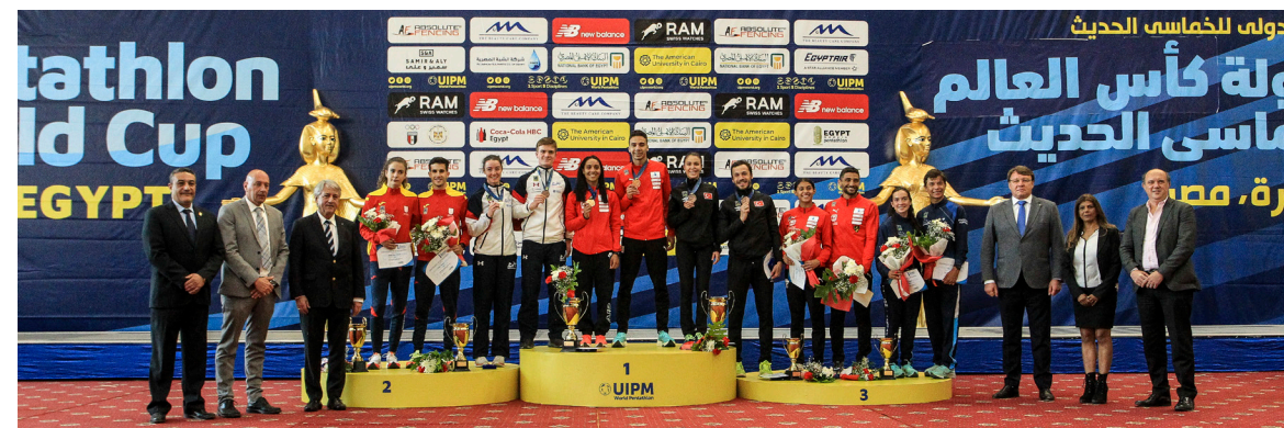
Mixed Relay medalists and best-placed teams atop the podium with UIPM and Egyptian officials in Cairo (EGY)

"We know that we will change Riding after 2024 and make our multisport more accessible around the world. These young athletes compete in the traditional way but they are also the generation for Los Angeles 2028 and that motivates us to do more for them."