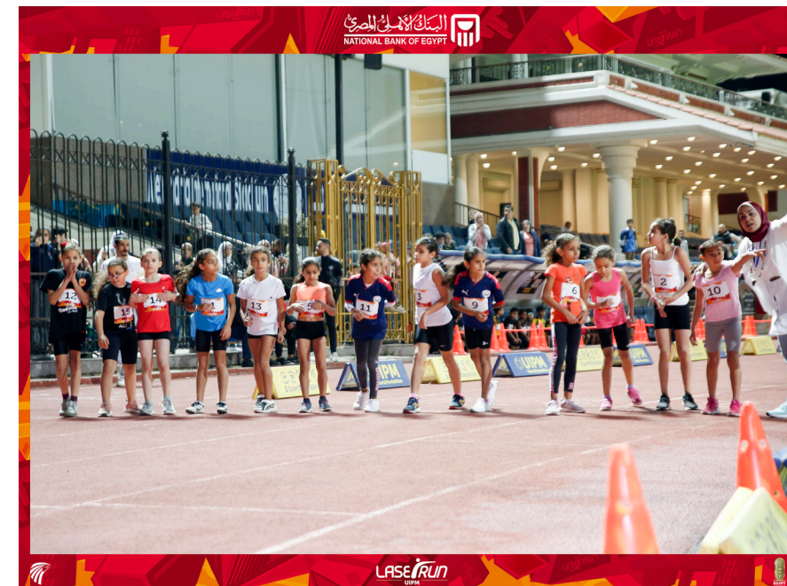
Anticipation on the start line in Alexandria (EGY) and, below, dynamic action in Caracas (VEN)

"From Venezuela we are super happy with this project, directed by UIPM at an international level with the aim of