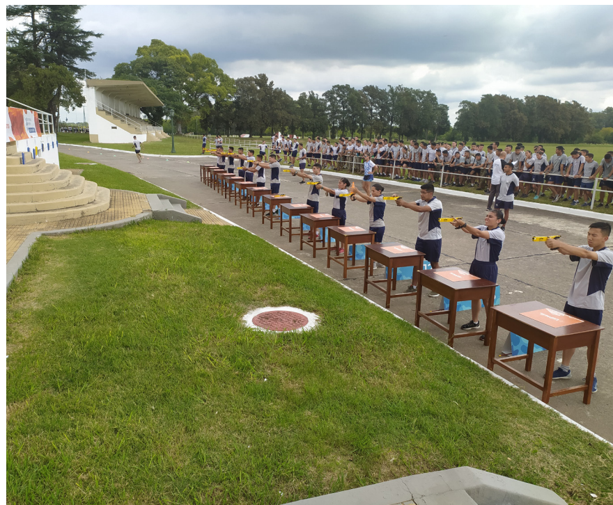
Action at the shooting range in San Martin (ARG) and, below, youths on the podium in Lahore (PAK)