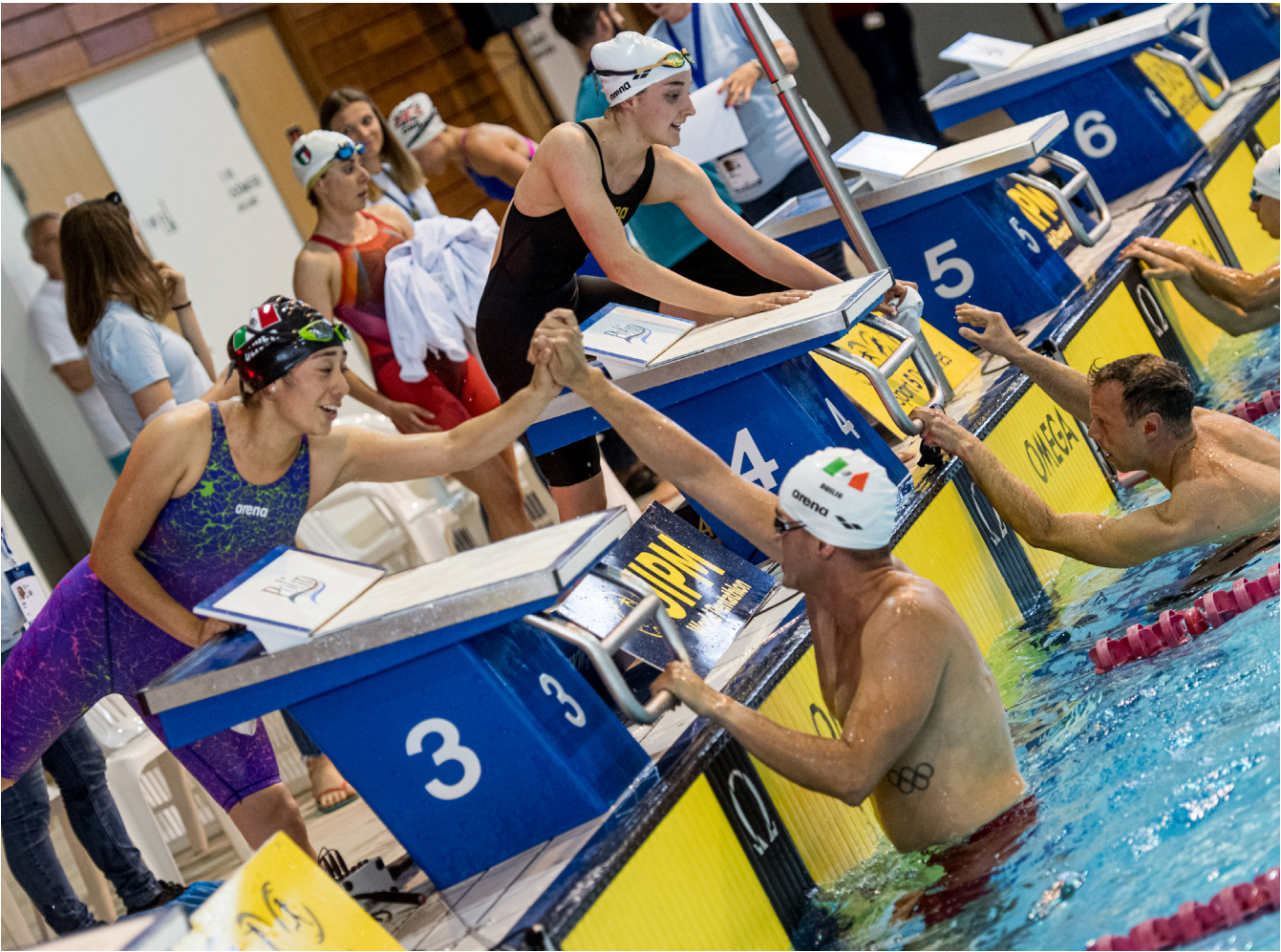
Two teams ducked under the magical two-minute mark in a scorching Swimming discipline in the Hungarian capital.