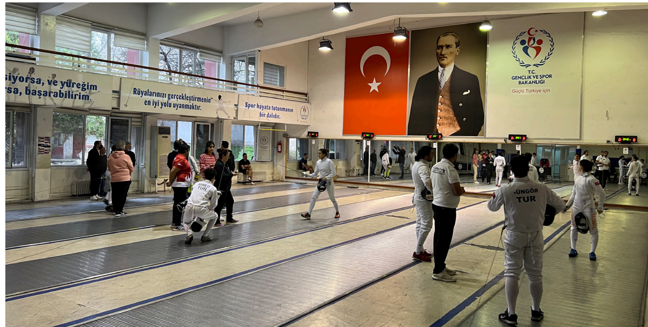
The JCP course that ran in Ankara (TUR) in early April was attended by an impressive 67 judges from across Turkey (above and right)