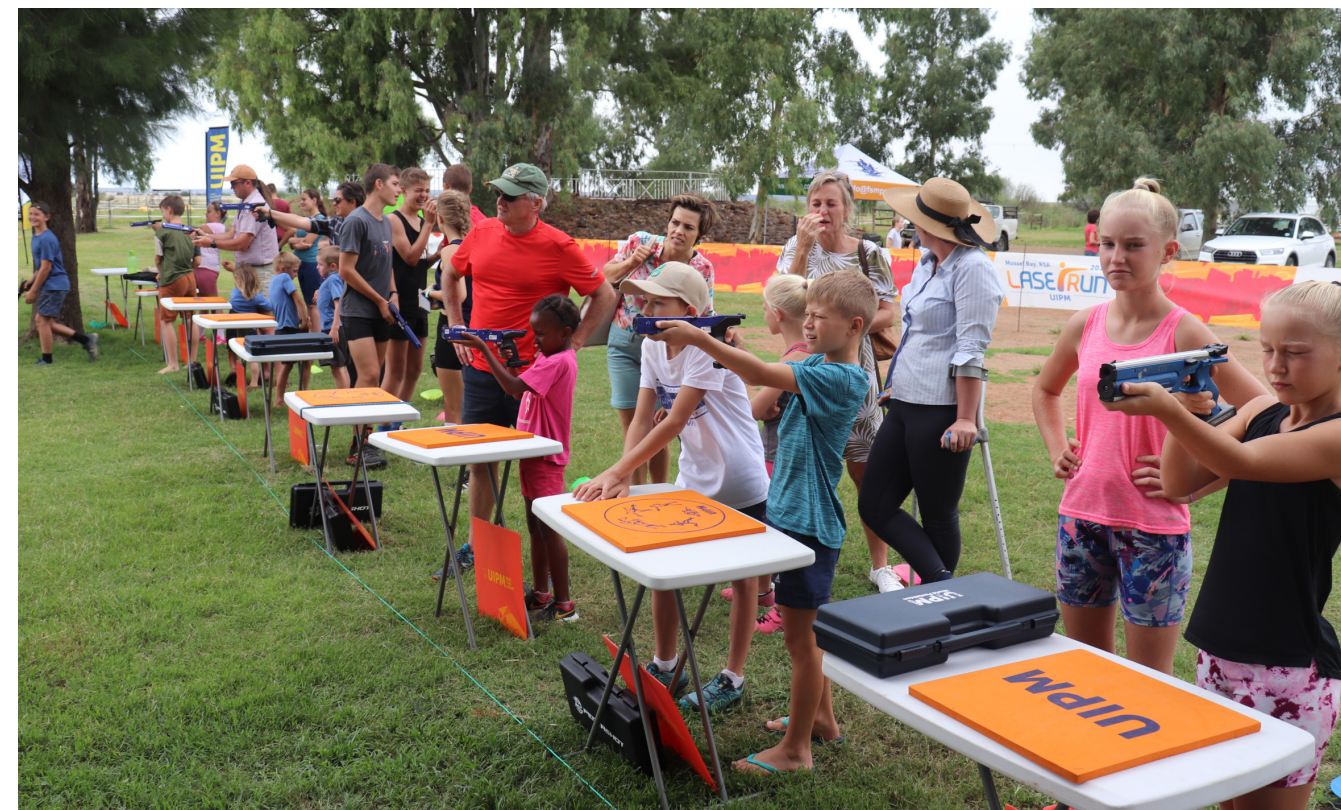
Young athletes on the shooting range in Kimberley (RSA) and, below, Gujranwala (PAK)

A spokesperson for the local organising committee said: "This was the first international Laser Run competition held in Estonia and we were delighted with the high standard of racing and the fun had by everybody. We are looking forward to hosting another Global Laser Run City Tour in Tallinn on May 22."