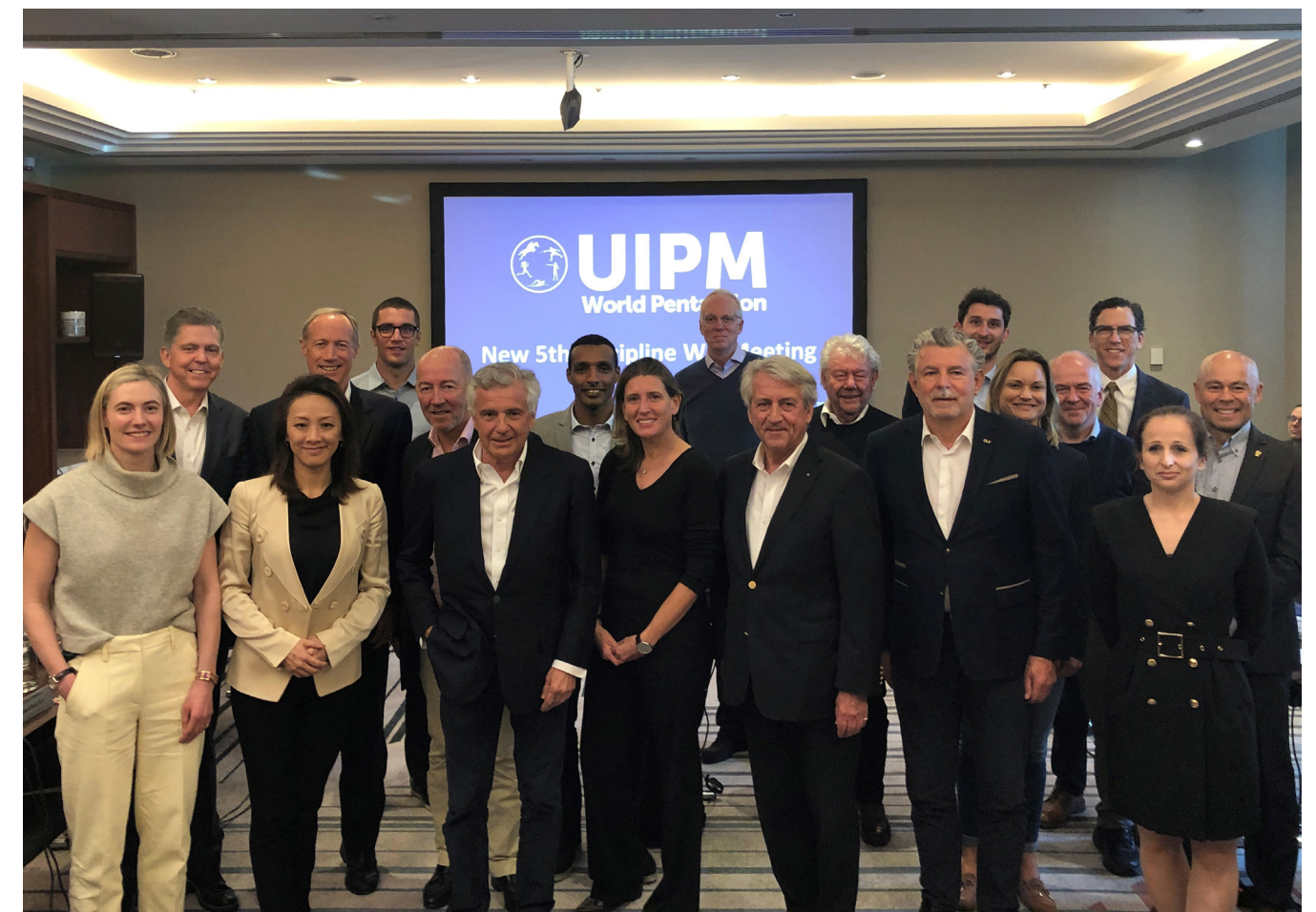
Members of the UIPM's New 5th Discipline Working Group meet in Budapest (HUN) to discuss progress and next steps as the historic process moves towards the testing phase

The introduction of the new discipline to Modern Pentathlon after Paris 2024, along with the complete reassessment of the sport, is designed to ensure the future of a sport that has been a core part of the Olympic Games for over 100 years.