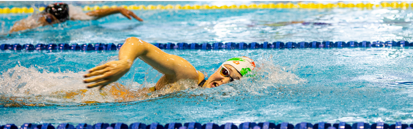
In a Women's Final packed with talented competitors, the Swimming discipline was another great opportunity to move up the standings in Budapest.