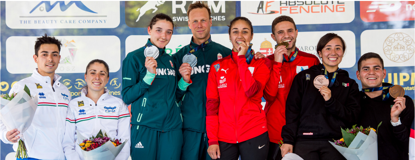
Egypt's position atop the podium was further evidence that the African nation is fast becoming a powerhouse in the event.