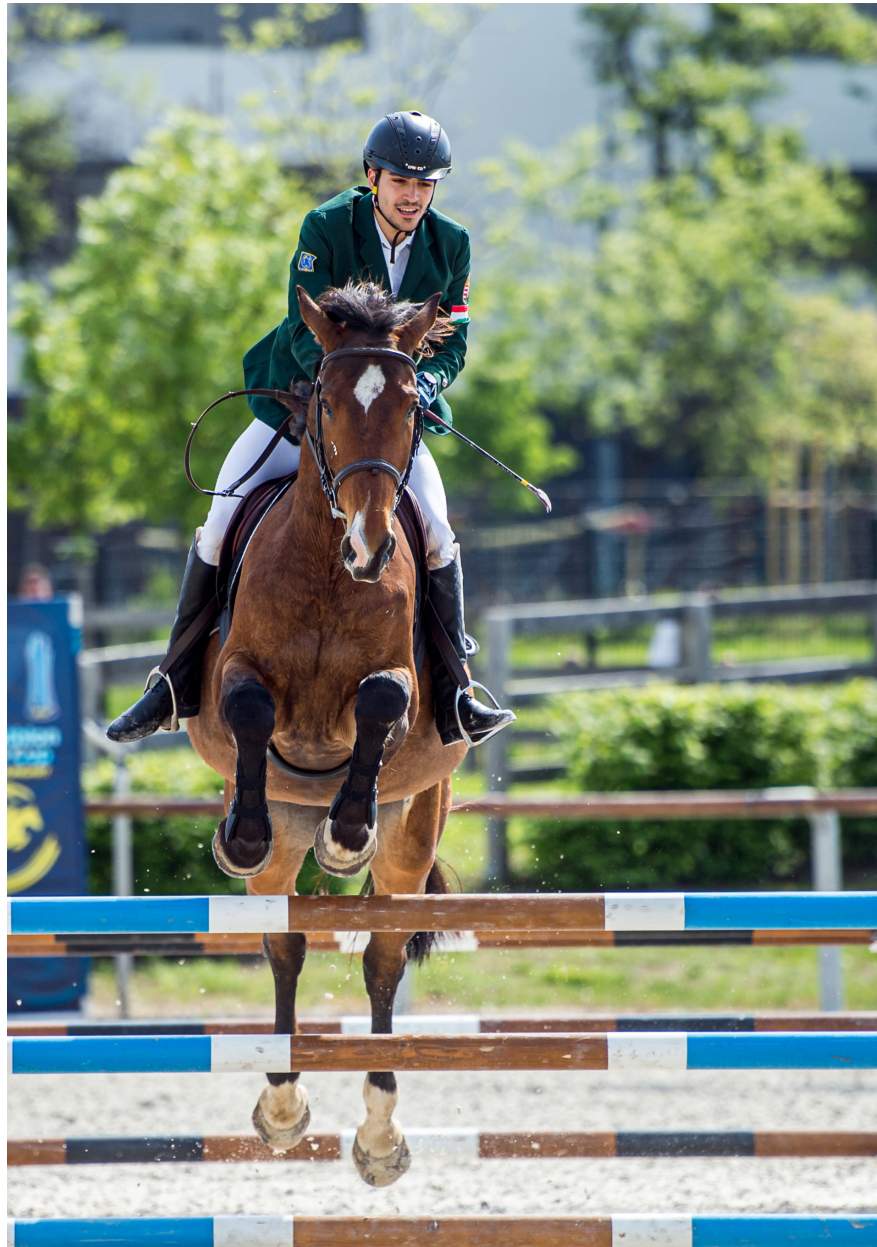
Four riders recorded perfect scores of 300 in the Riding discipline of the Men's final in Budapest.

Bronze medallist Abdelmaksoud (EGY) added: "My Fencing at this World Cup