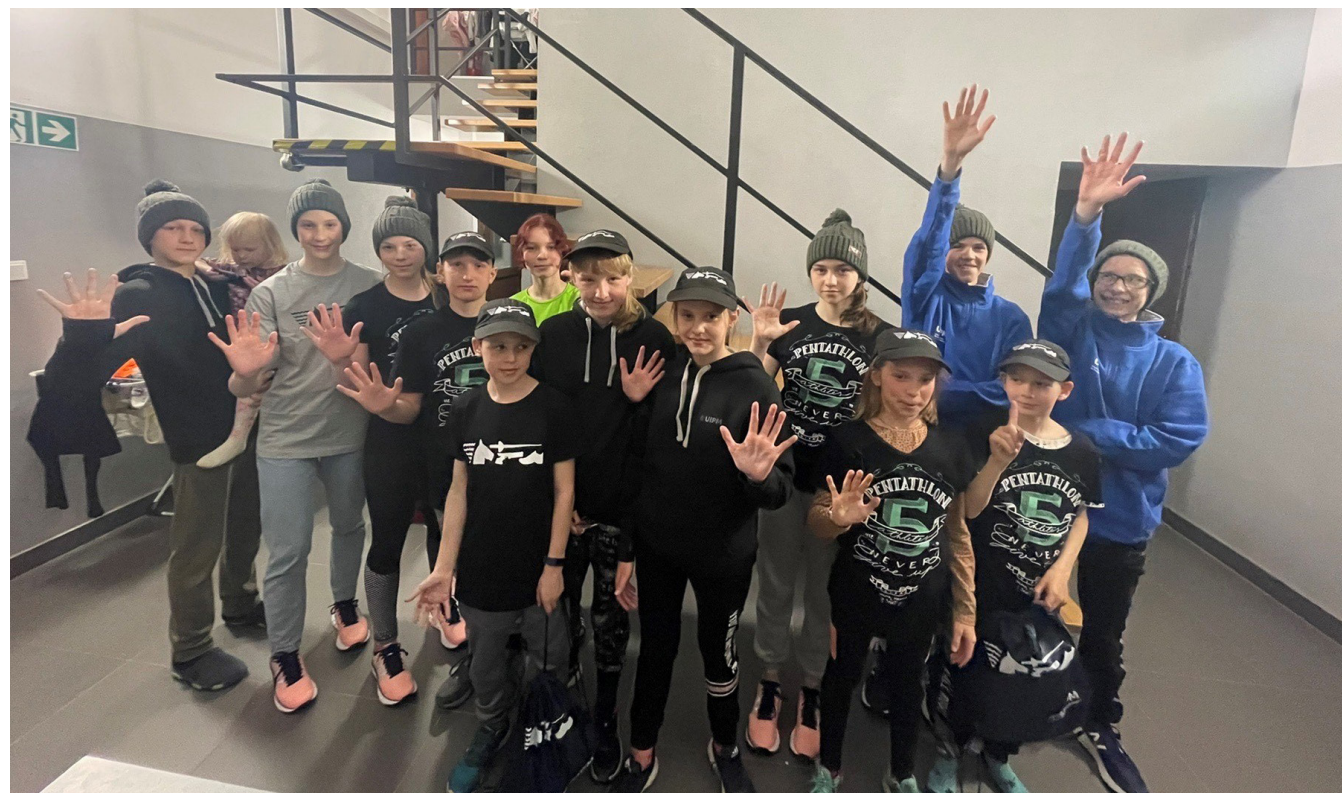
UIPM has distributed T-shirts, jackets, bags, shoes and sets of fencing uniform and sets of shooting equipment to displaced Ukrainians (above and below).

Pentathlon Federation have donated €20,000 in relief funds while the Asian Confederation pledged €10,000. The UIPM's online fundraiser, meanwhile, continues to collect funds to help all of those affected.