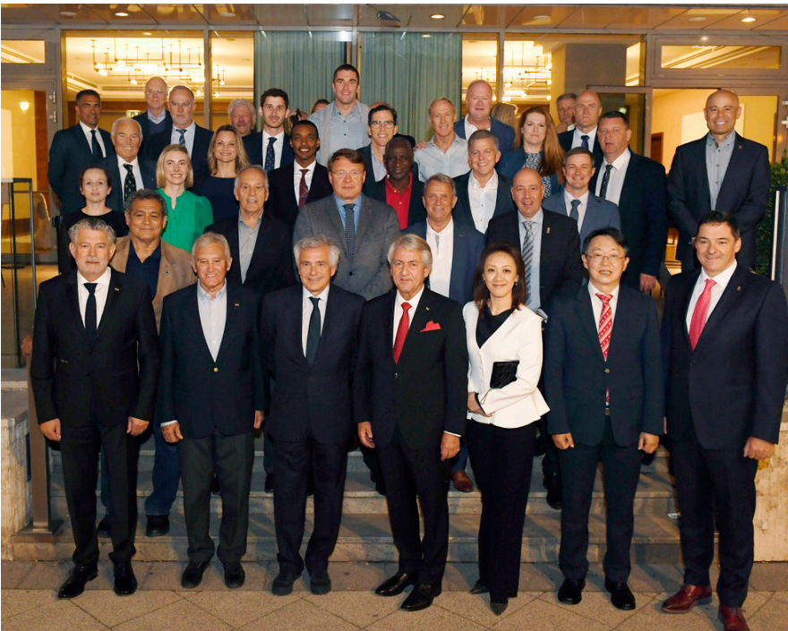
A joint dinner brings together members of the UIPM Executive Board, the New 5th Discipline Working Group and Hungarian officials and VIPs