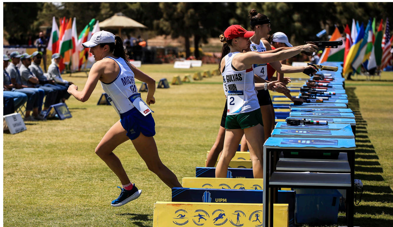
On a blissfully sunny Sunday in Cairo, the crowds watching the Mixed Relay were treated to a Laser Run that saw some breathtakingly accurate shooting

Remarkably, she was even more unerring next time round as she recorded a clean shoot in less than 7sec to open up a yawning gap with the rest. Behind her, meanwhile, Varley (GBR) had scythed through the field to move from 6th to 2nd.