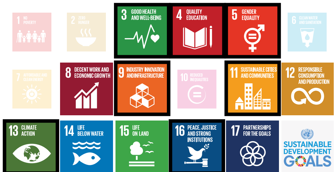
Figure 2: Key SDGs to which the IOC aims to contribute