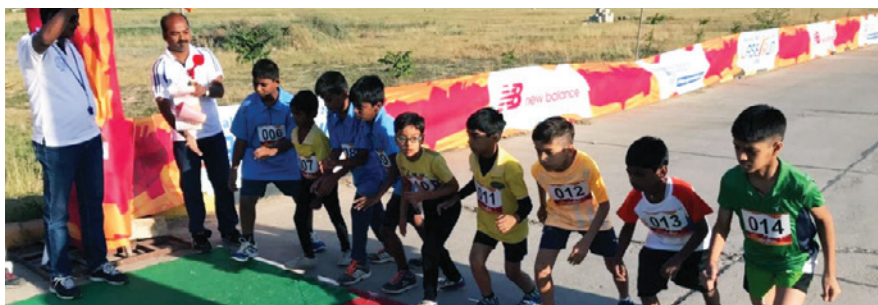
Young male participants gather at the start line in Karnal