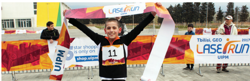
One of the junior winners holds the tape aloft in Tbilisi

Competition was hot in the cold weather as the best young Georgian pentathletes