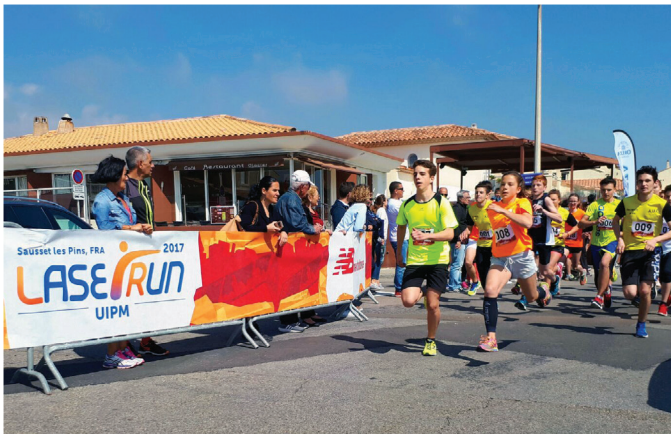
Junior athletes race for the finish line during the 2017 Laser-Run City Tour in Sausset-les-Pins (FRA)