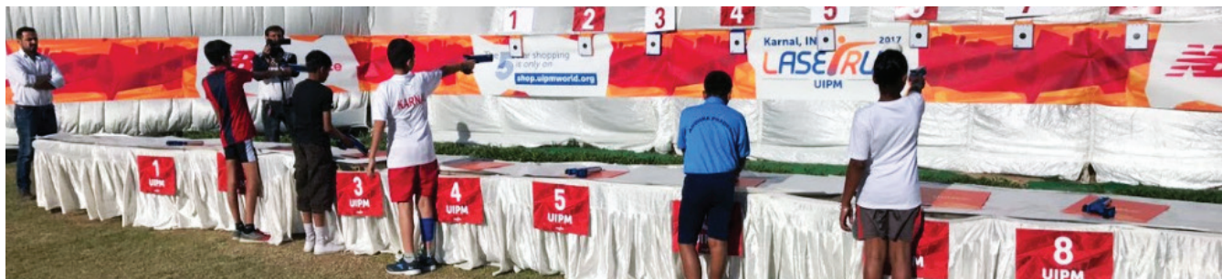
Competitors line up their shots at the range in Karnal