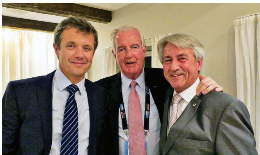
Crown Prince Frederik of Denmark, WADA President Craig Reedie and UIPM President

During Sport Accord the UIPM President met with 1st Vice President Juan Antonio Samaranch (also IOC