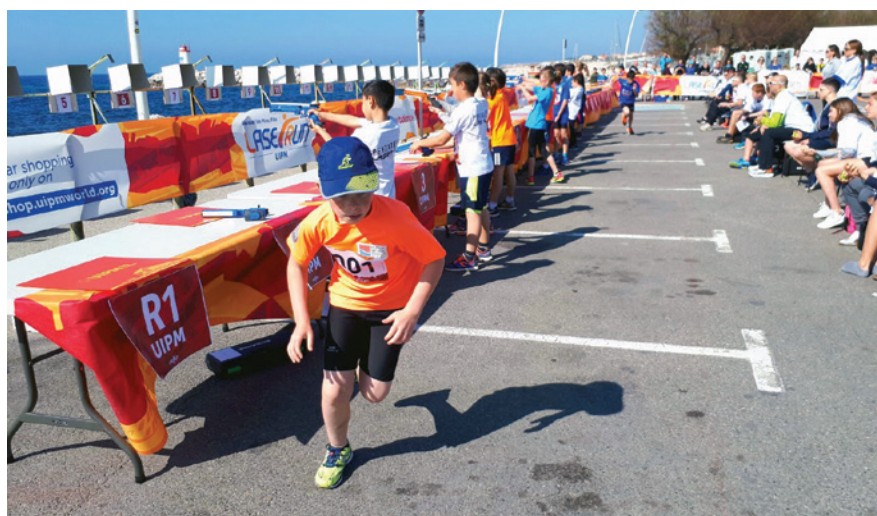
One of the junior males sets off from the shooting range in Sausset-les-Pins

"We had a massive attendance of spectators from the community of Sausset les Pins and surroundings who have organized an amazing event in such an iconic place. In addition, we are aiming to enlarge the base of our athletes pyramid in France and the competition was perfect for our recruiting system."