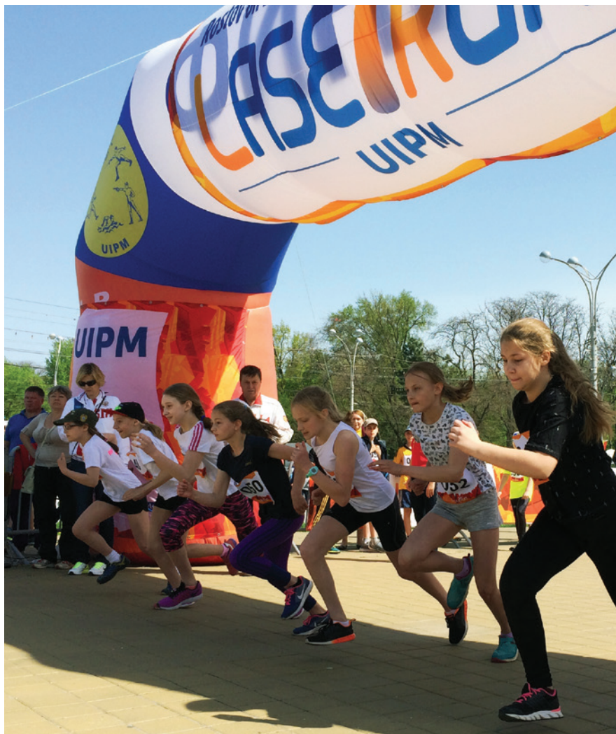
An electric pace is set at the start line in Rostov

All the regional authorities were present at this LRCT event, which created a real stir in the city and generated interest from many spectators and media outlets.