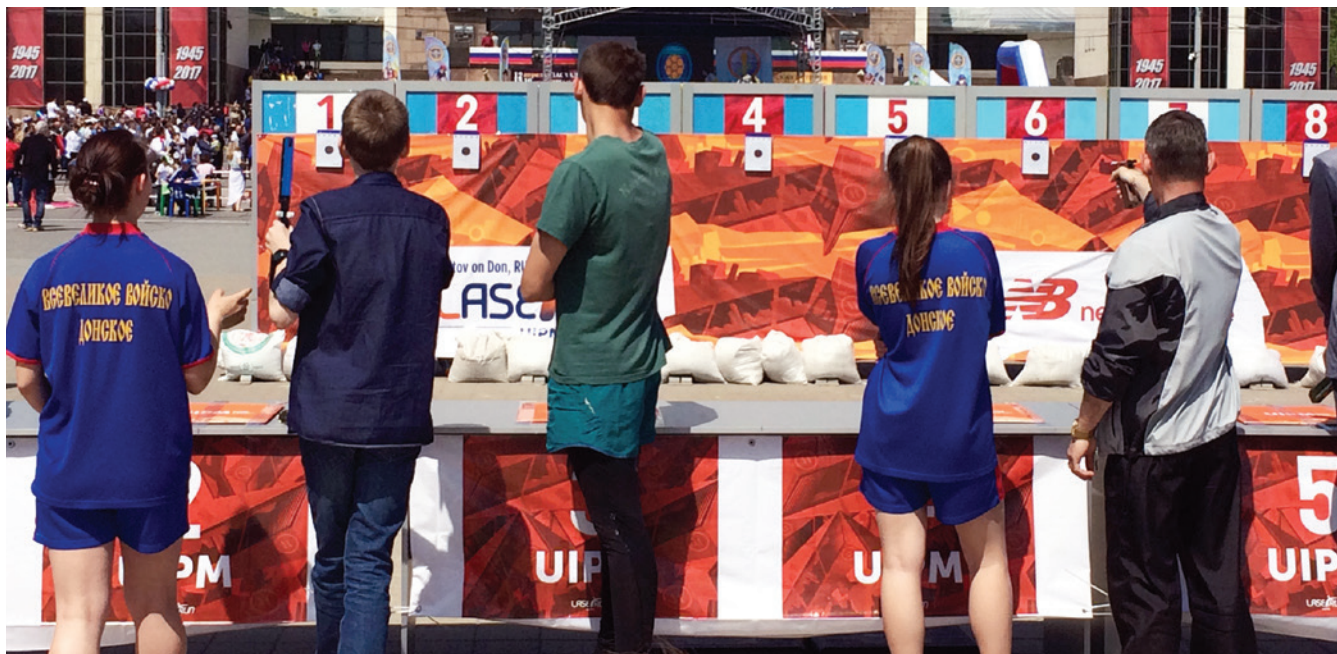
Club entrants line up their shots during a mixed event in Rostov