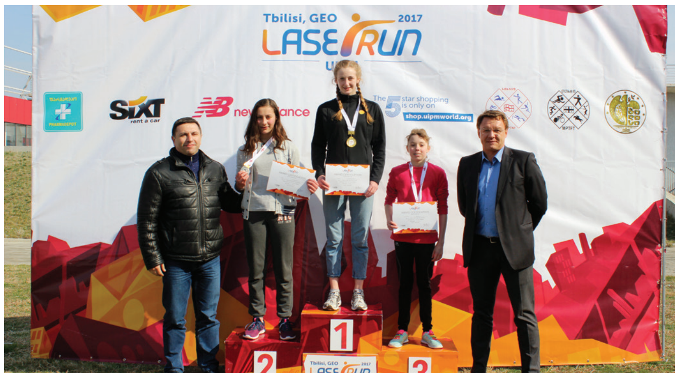
The podium of one of the junior events in Tbilisi

"This competition, which combines running with laser pistol shooting, is aimed to attract mass participation and widen audience of our sport. This is a great tool for further modern pentathlon development worldwide."