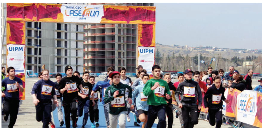
Junior participants enjoy a mass sprint against the urban backdrop of Tbilisi

"The Organizing Committee of the LRCT in Tbilisi successfully coped with all tasks they were responsible for and held the competition at a high level. This is a good example for all future UIPM LRCT editions."