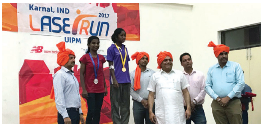
One of the junior female podiums in Karnal

In 2018, UIPM is targeting more than 100 participating cities all over the world.