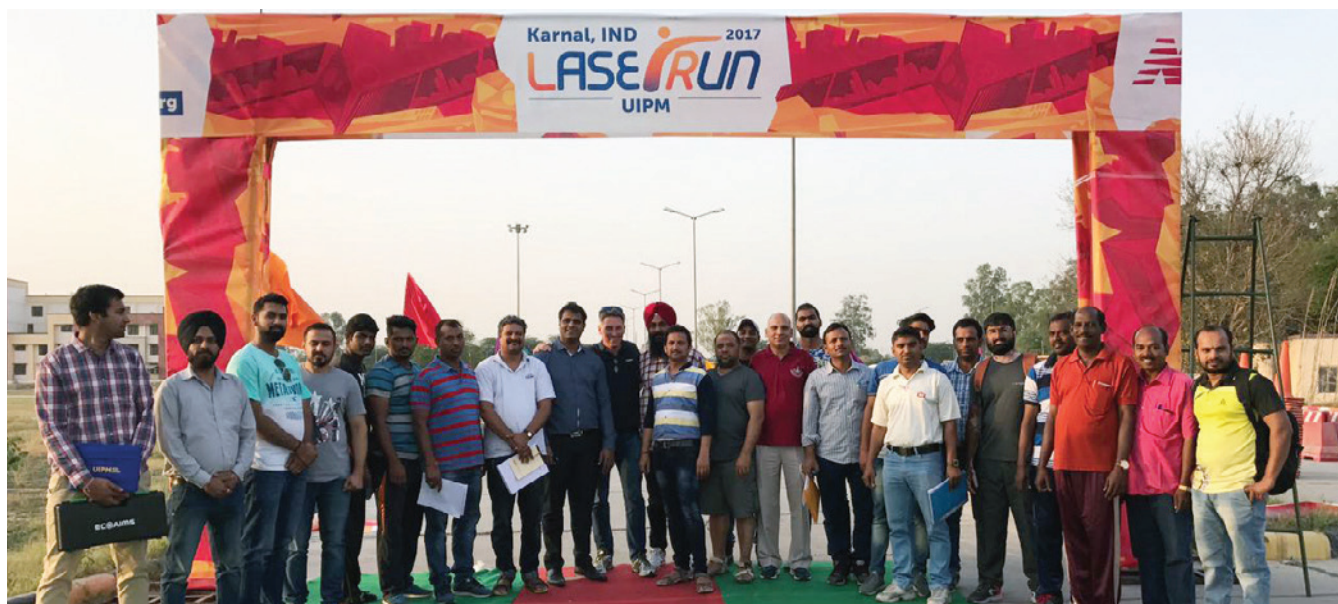
The organisers and volunteers of 2017 Laser-Run City Tour in Karnal