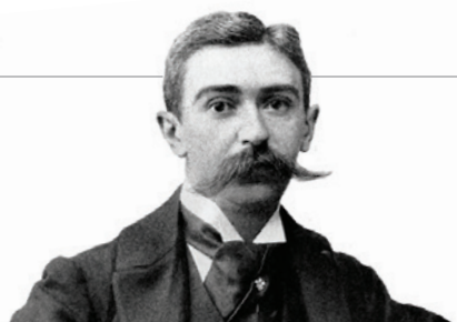
Baron Pierre de Coubertin

"The Modern Pentathlon event would test a man's moral qualities as much as his physical resources and skills, producing thereby the ideal, complete athlete."