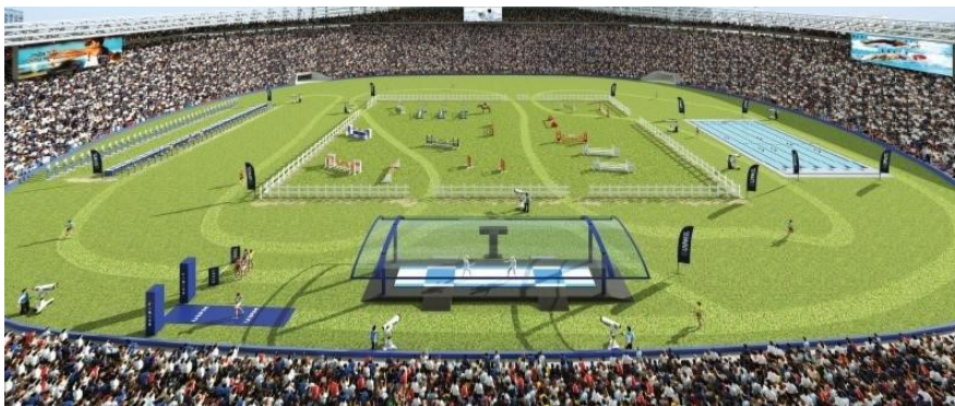
A 3D rendering of the Tokyo Stadium, where all five Modern Pentathlon disciplines will take place during the 2020 Olympic Games