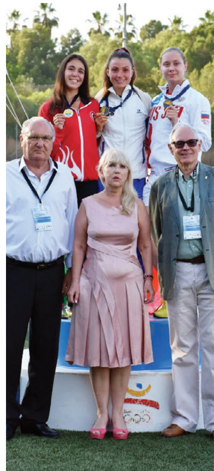
European Junior Championships women's individual podium

Samaranch (ESP) was present at the Men's Final and commended the standard of the competition.