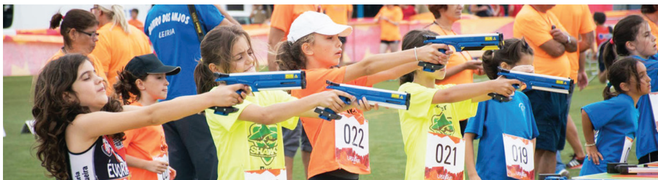
Laser-Run City Tour 2017, Carregado (POR), 25/06/17