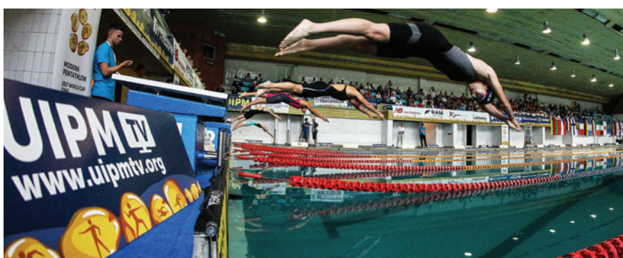
Swimmers take to the pool