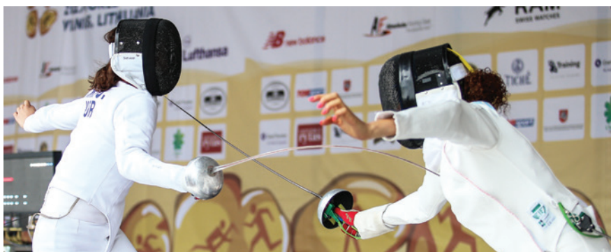
Action from the Fencing Bonus Round