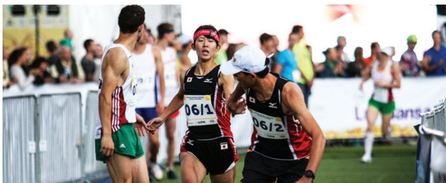
Handover time for Japan during the Laser-Run