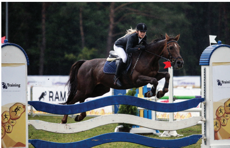
Horses were high-quality in Vilnius