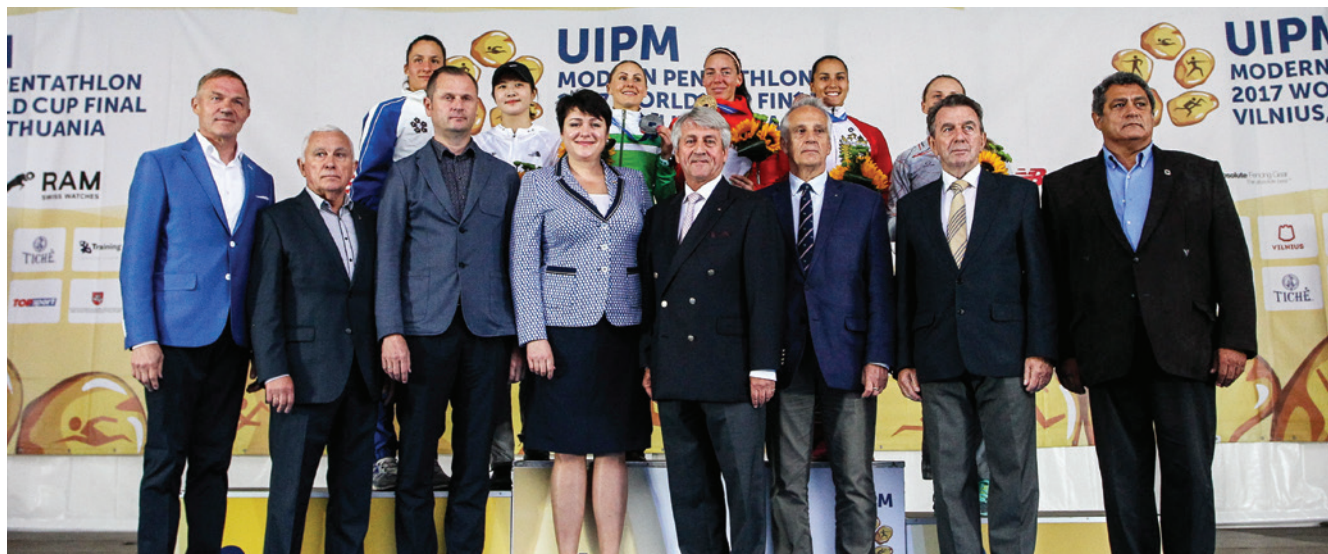
Women's Individual Podium

Prokopenko (BLR) to secure the medal. Prokopenko (BLR) timed 11:41 in the Laser-Run, almost as quick as Asadauskaite (LTU, 11:35).