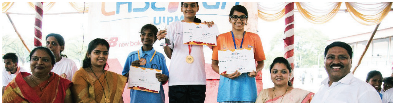
Laser-Run City Tour 2017, Pune (IND), 18/06/17