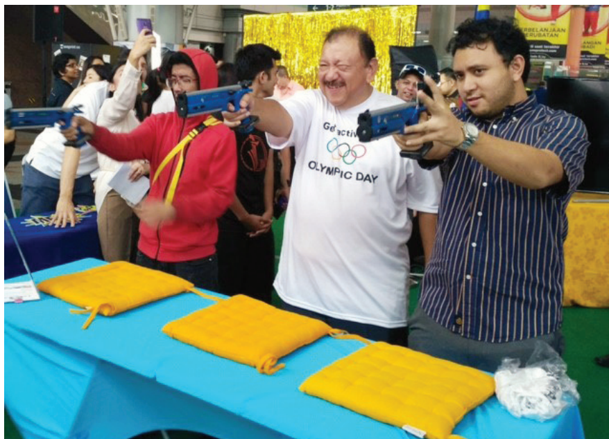
Olympic Day celebrations in Malaysia (HRH Prince Tunku Imran IOC Member)

Hundreds of young boys and girls as well as their parents attended the Modern Pentathlon activities in Minsk. Anyone gaining more than 36 "likes" on their social media won a prize of a UIPM Triathlon T-shirt, while every participant in the Olympic day received a souvenir from the Belarus NOC.