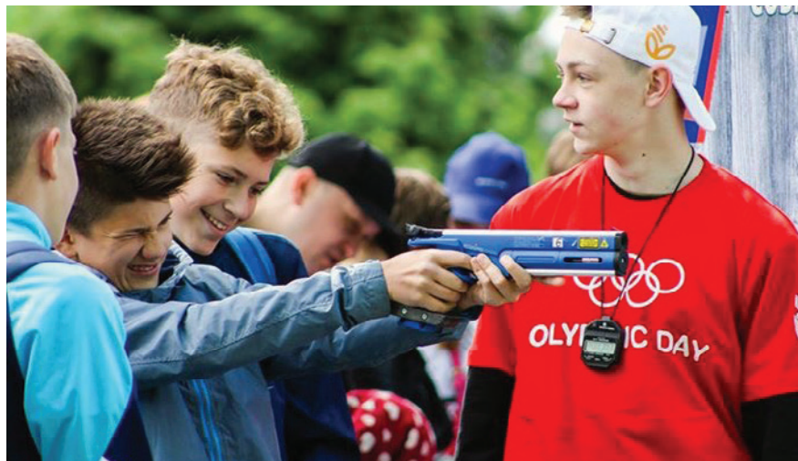
Olympic Day celebrations in Minsk, Belarus