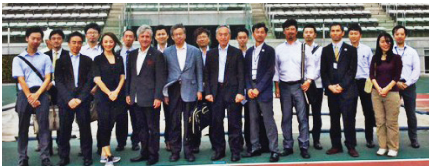
The UIPM delegation with the Tokyo 2020 team