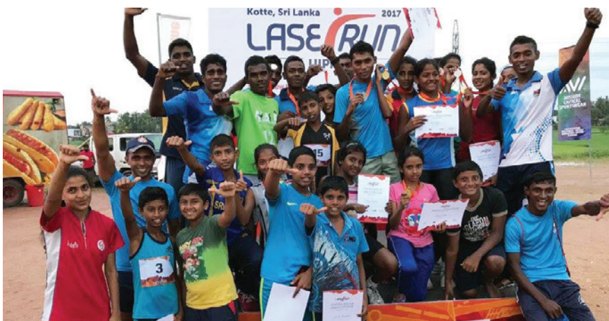
Laser-Run City Tour 2017, Sri Jayawardenapura Kotte (SRI), 25/06/17