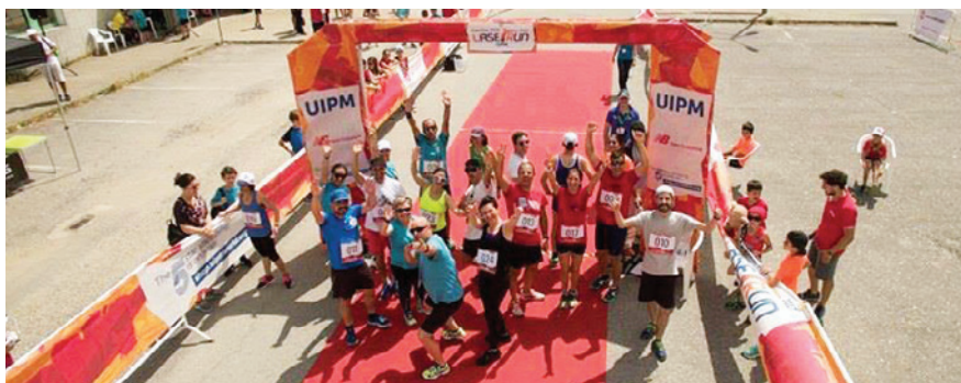
Laser-Run City Tour 2017, Covilha (POR), 03/06/17