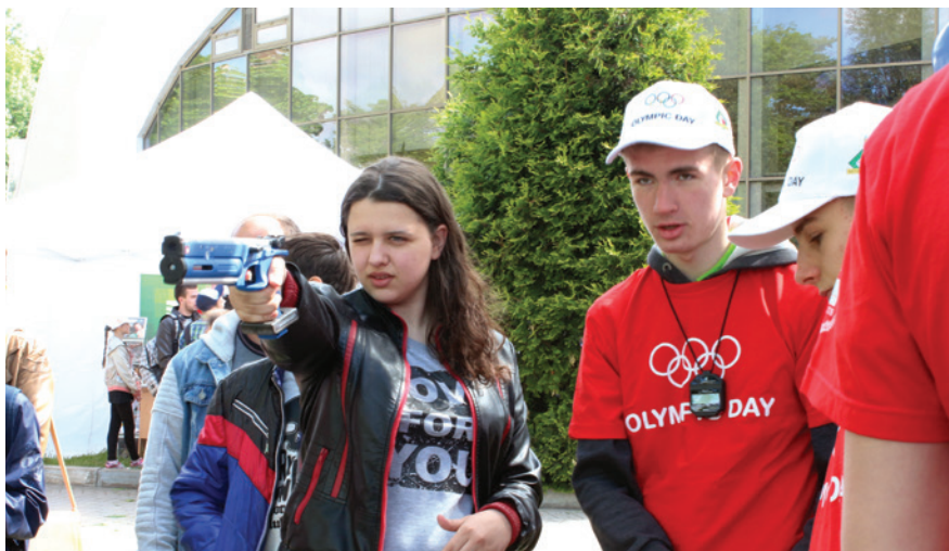
Olympic Day celebrations in Minsk, Belarus

On June 3, Modern Pentathlon, Laser-Run and Triathlon were among more than 20 sports presented during the Belarus Olympic Committee's own International Olympic Day.