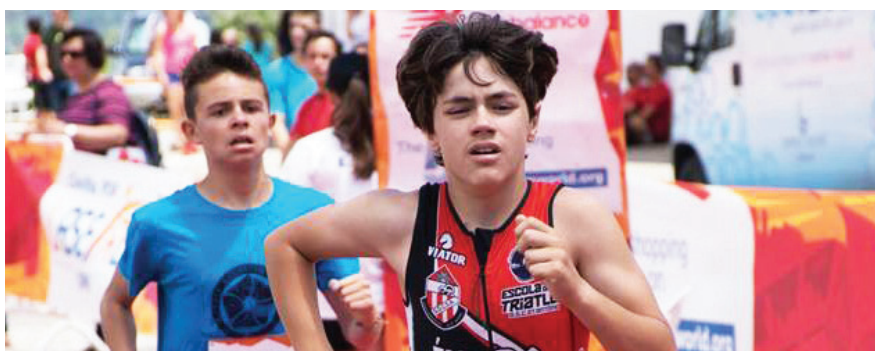
Laser-Run City Tour 2017, Covilha (POR), 03/06/17