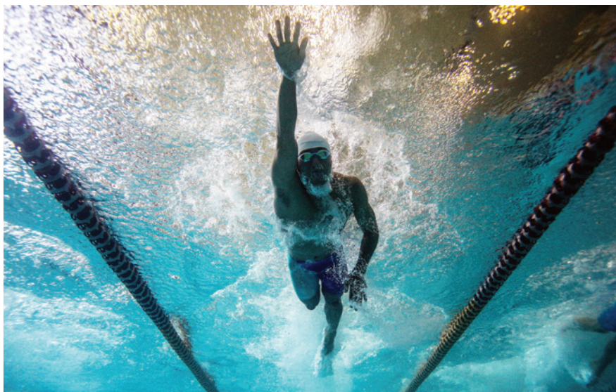
Swimming was held at the Sports Ministry pool

Asadauskaite (LTU) is renowned for her exceptional Laser-Run and the crowd knew they were in for a treat as she started advancing through the field. When she left the range for the final