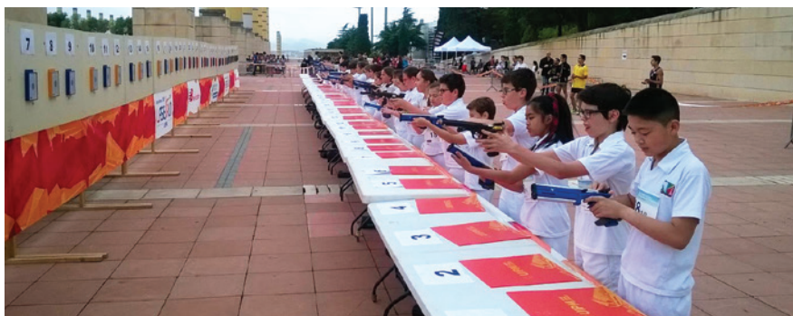
Laser-Run City Tour 2017, Barcelona (ESP), 07/06/17

Competitors came from clubs all over Portugal - from north to south and from the continental territory to the Madeira Islands.