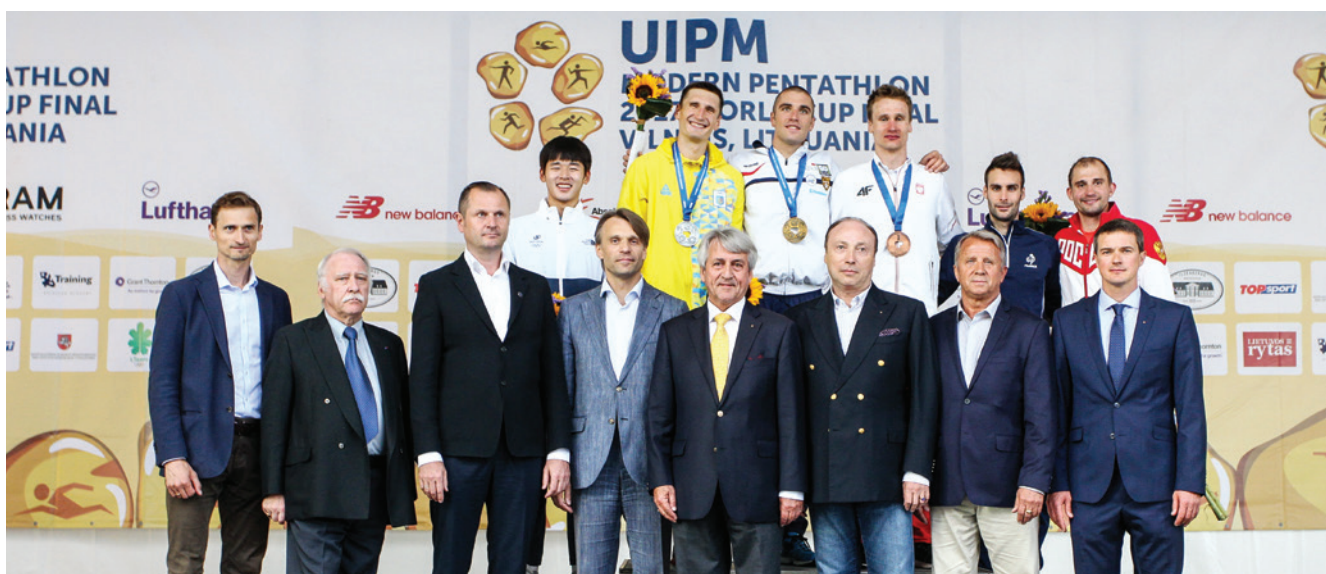
Men's Individual Podium

CCTV, M4 Sports, OSN Sports and Fox were among the TV networks who also transmitted the live coverage of the Men's, Women's and Mixed Relay Finals while several others broadcast the highlights. The action went out across the continents of Europe, Asia and Africa as well as Australia and New Zealand.