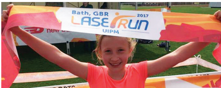
Laser-Run City Tour 2017, Bath (GBR), 18/06/17