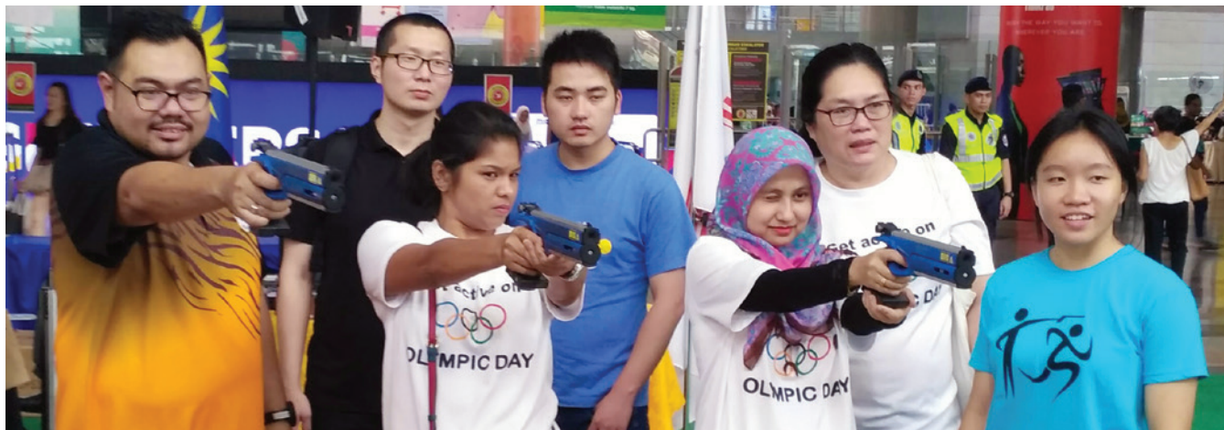
Olympic Day celebrations in Malaysia