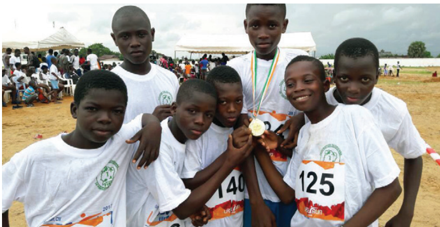
Laser-Run City Tour 2017, Grand Bassam (CIV), 20/06/17

Sri Lanka will host two more Laser-Run City Tours in 2017, in Colombo (July 30) and Galle (November 25).