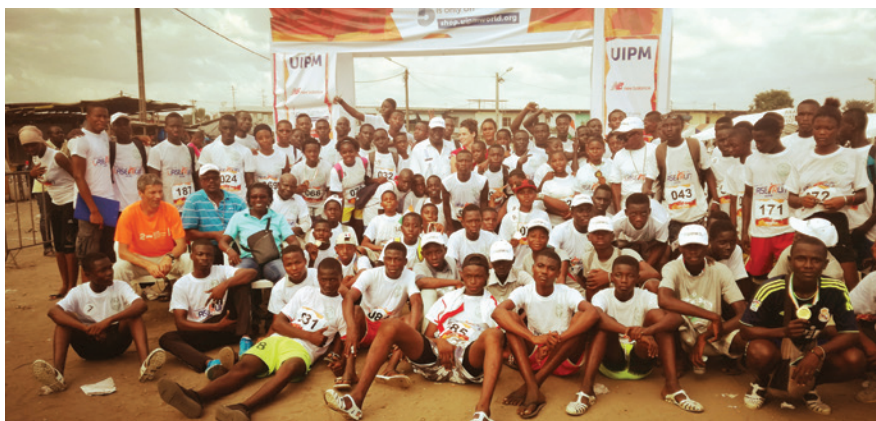
A group picture of Laser-Run athletes in Abidjan

A UIPM observer reported: "More than a simple discovery of an unknown sport in Africa, this Laser-Run event gave a veritable new breath and joy in this poor area where life is difficult."