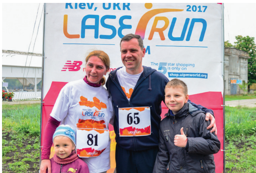
It's a family affair in Kiev