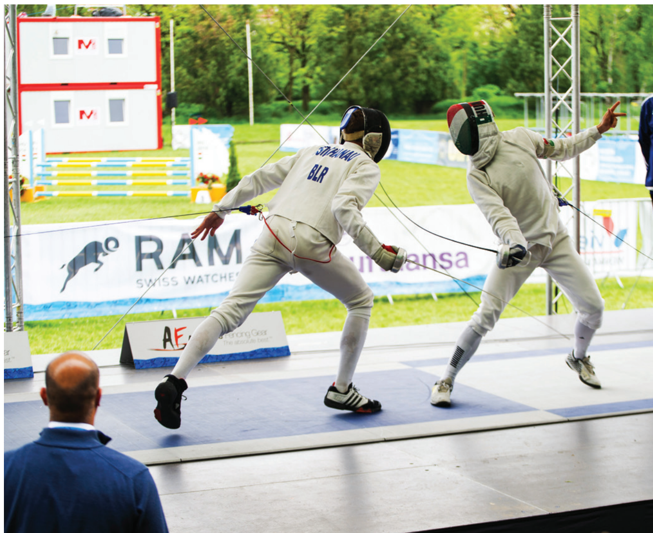
Fencers from Belarus and Egypt do battle during the Bonus Round

"Like yesterday in the Women's Final, our men have shown very high performances in this great Olympic sport."