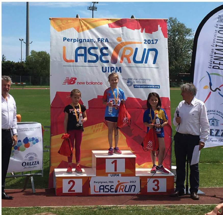
Junior girls on the podium in Perpignan

This enabled young people from Perpignan schools to come and