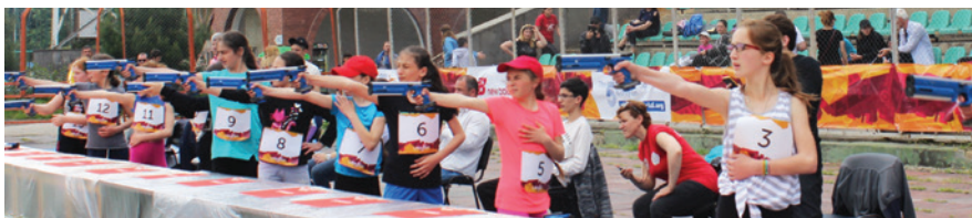
Young female participants take aim in Rustavi