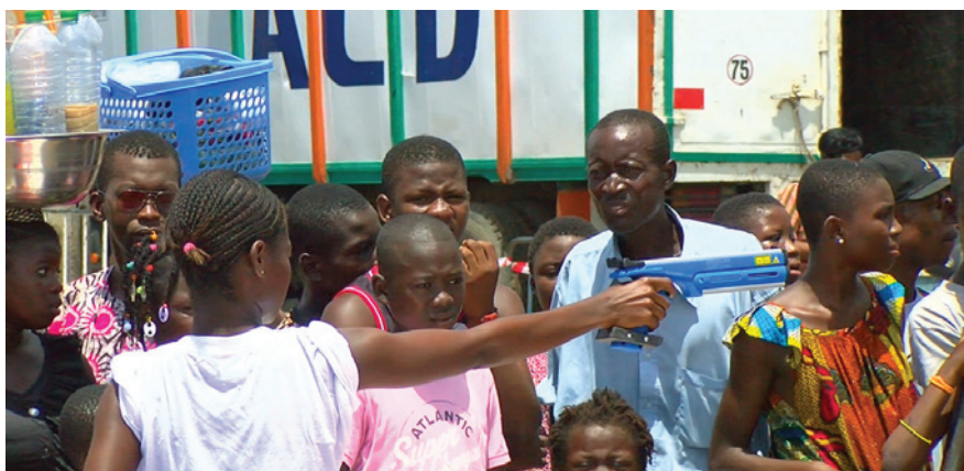
Spectators and passers-by pay attention to the competition in Abidjan