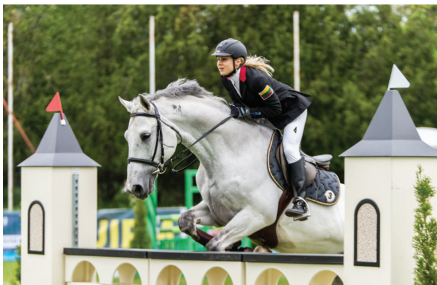
Laura Asadauskaite (LTU) clears an obstacle during the Riding in Kecskemét

With exceptional shooting Gubaydullina (RUS) moved into the lead, but within