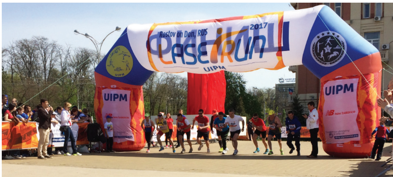
Male athletes at the start line in Rostov on Don

All the regional authorities were present at this LRCT event, which created a real stir in the city and generated interest from many spectators and media outlets.