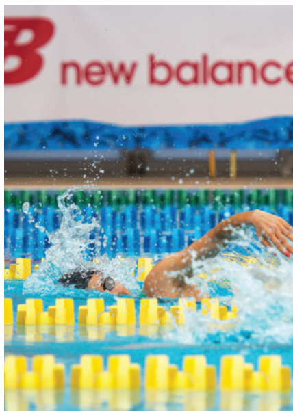
Action from the Swimming pool