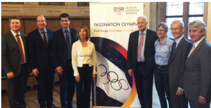
The DOA Executive Board meets in the historical "Römersaal" in Frankfurt City Hall