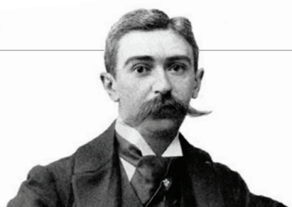
Baron Pierre de Coubertin

"The Modern Pentathlon event would test a man's moral qualities as much as his physical resources and skills, producing thereby the ideal, complete athlete."