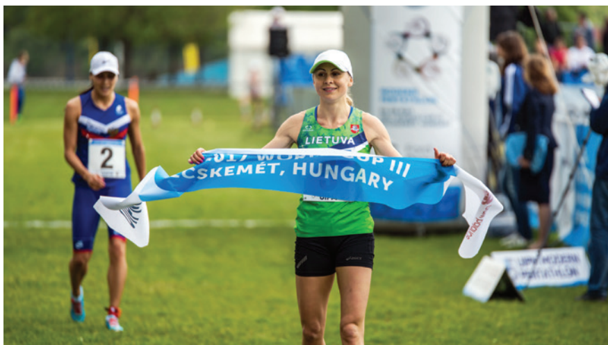
Laura Asadauskaite (LTU) poses for the cameras after winning her first 9th individual World Cup gold

"It was a very good day, a very lucky day," said Asadauskaite (LTU). "Everything went well and I am very happy."