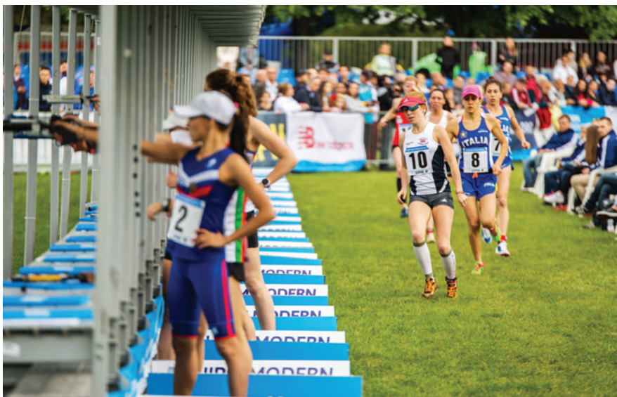
The Women's Individual competitors arrive at the Laser-Run shooting range