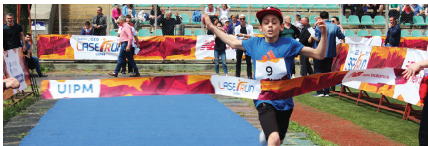
A junior male athlete takes the tape in Rustavi