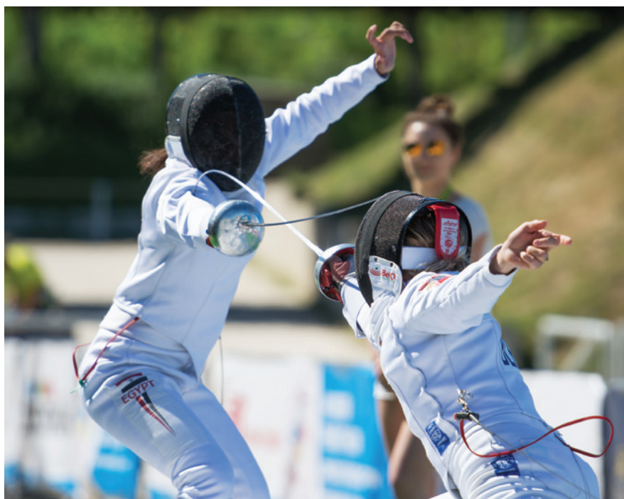
Action during the Women's Fencing Bonus Round in Drzonkow

Summers (GBR) collected an impressive haul of 28V/7D and her