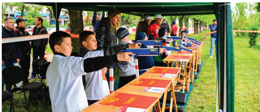
Young athletes take aim in Kiev