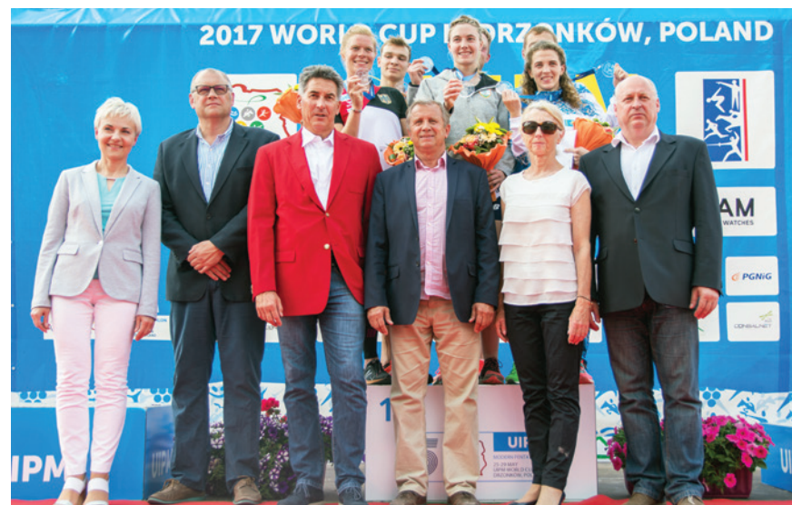
The Mixed Relay podium