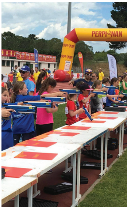
A shot from the Laser-Run in Perpignan