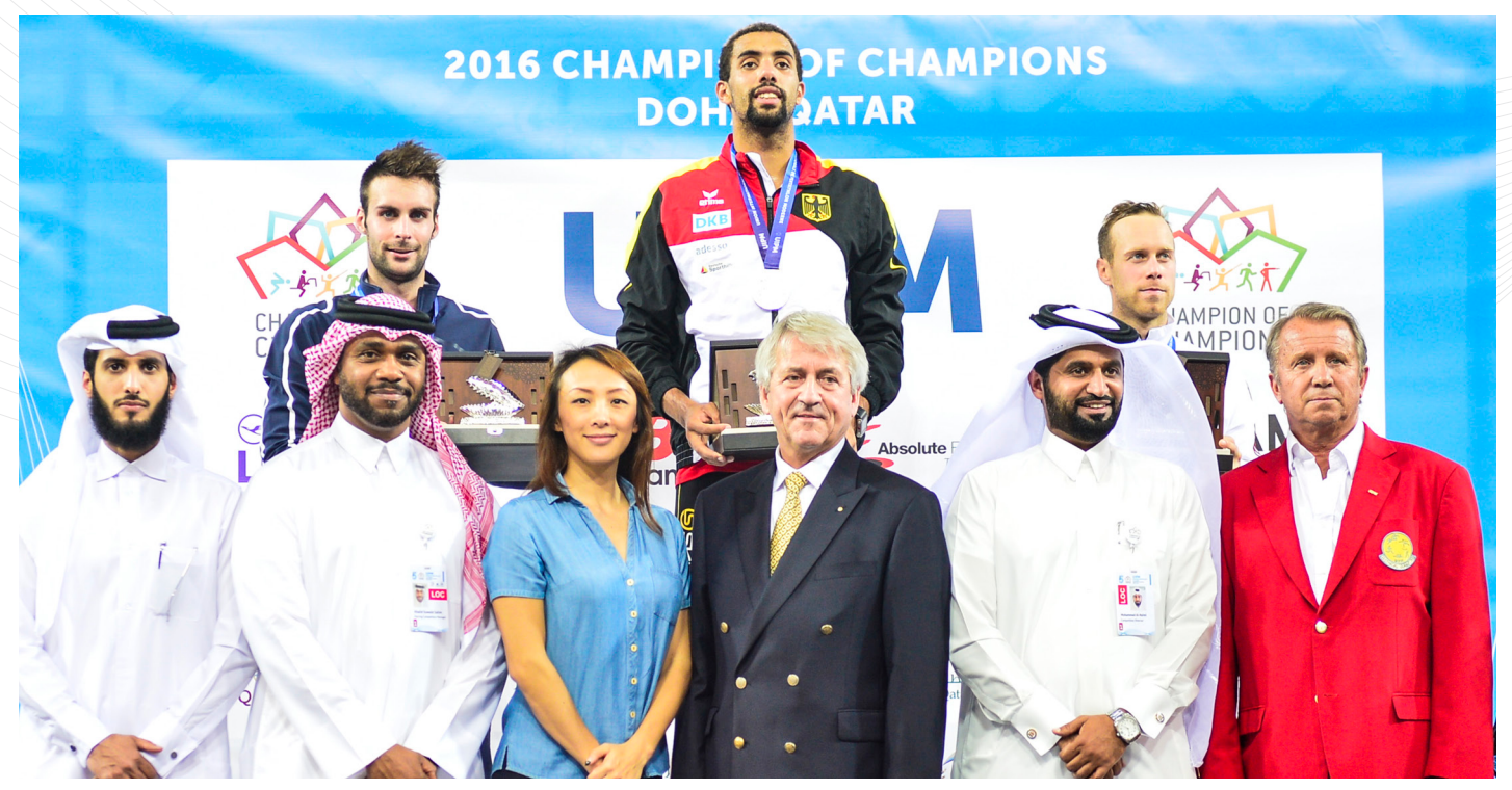
THE MEN'S INDIVIDUAL PODIUM

in the fantastic Al Shaqab Arena gave this Champions of Champions the hallmarks of a real event.