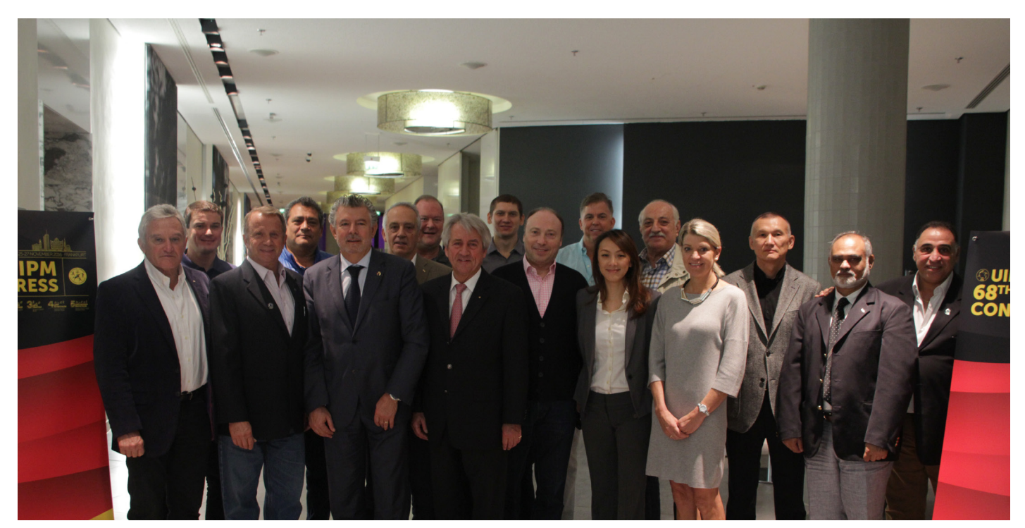
ON NOVEMBER 27, THE UIPM EXECUTIVE BOARD AND NEWLY ELECTED MEMBERS MET TO DISCUSS SEVERAL MATTERS ON THE AGENDA OF THE UIPM IN 2017