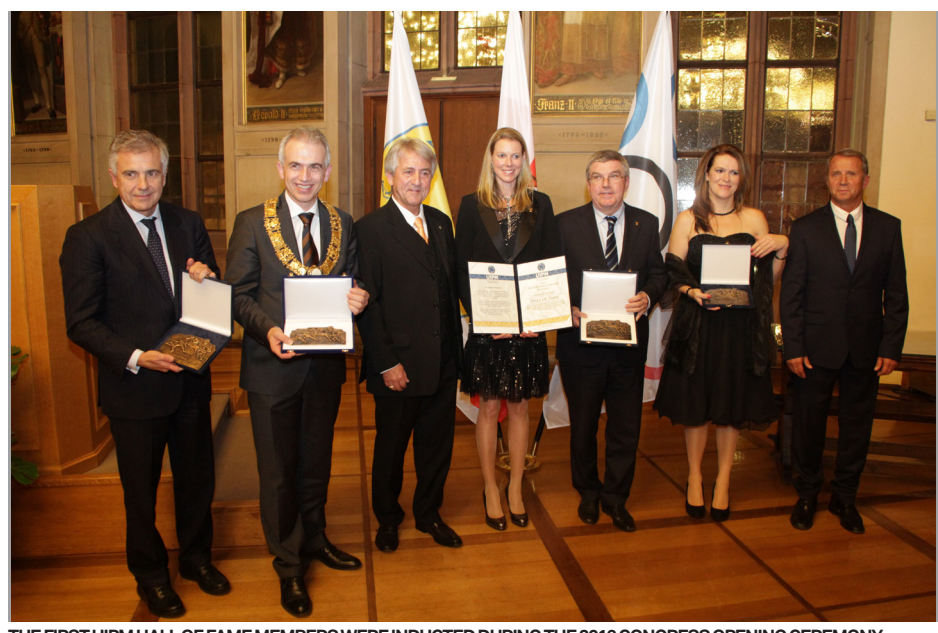
THE FIRST UIPM HALL OF FAME MEMBERS WERE INDUCTED DURING THE 2016 CONGRESS OPENING CEREMONY

Honorary Life Membership of UIPM was awarded to outgoing