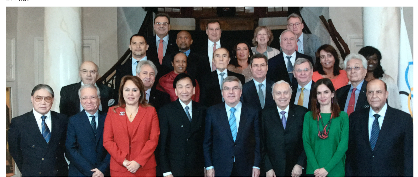
THE ANNUAL MEETING OF THE IOC COMMISSION FOR CULTURE AND OLYMPIC HERITAGE TOOK PLACE IN LAUSANNE