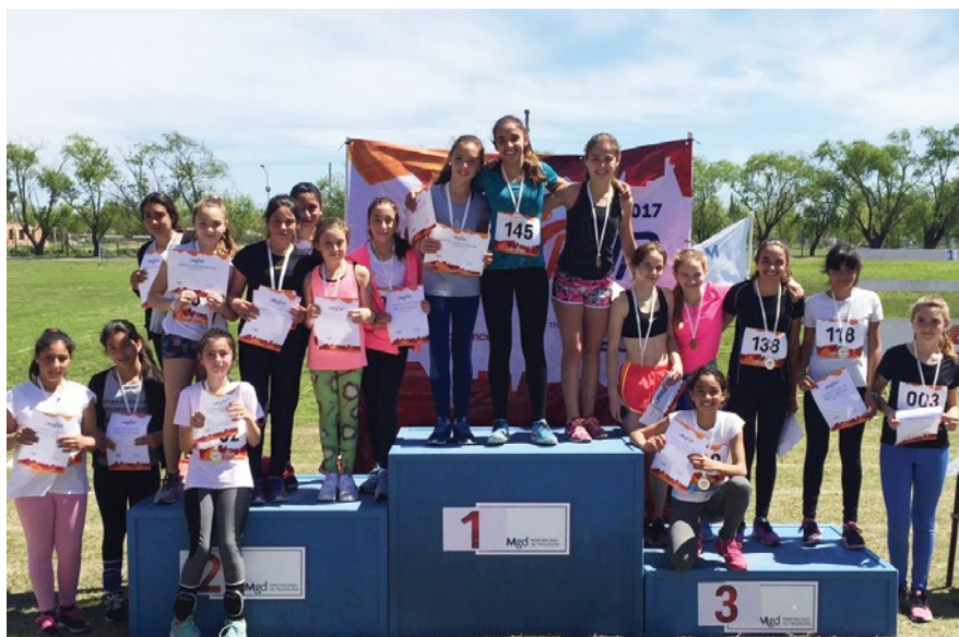
Young female competitors occupy the podium with their medals and certificates

The Argentina federation has embraced Laser-Run and is scheduled to hold another LRCT in the Province of Santiago del Estero on November 3, 2017.