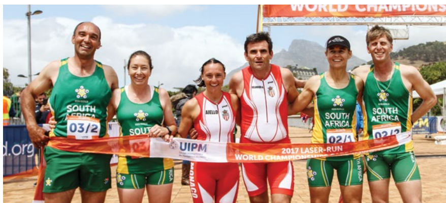
The feeling of accomplishment at the finish line