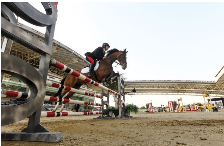
Another obstacle is cleared at the world-class Al-Shaqab facility