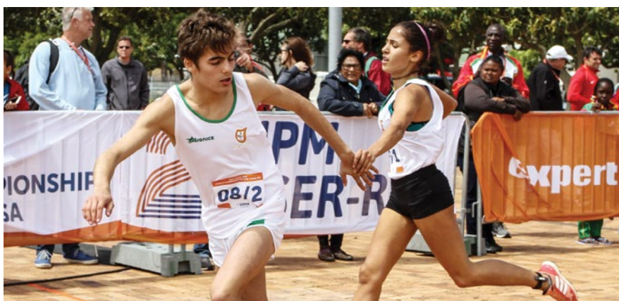
Action from the Mixed Relay