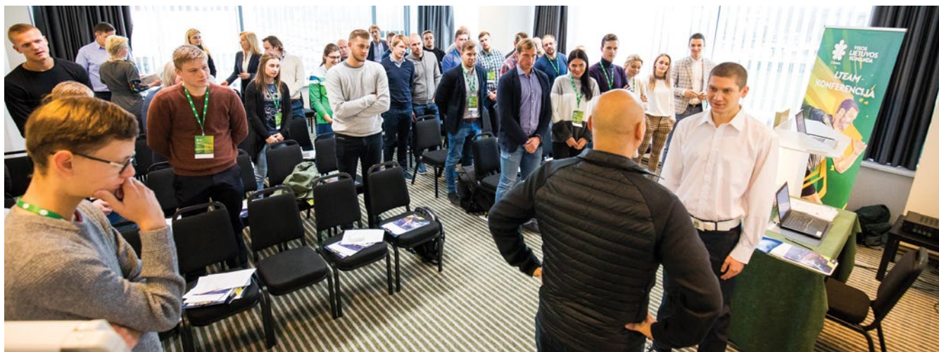
Delegates take part in a workshop in Vilnius (LTU)

The seminar helped the athletes to understand more about the character traits they possess and how their skills can be transferred into business and work life. The IOC Athlete Career Programme was created and delivered by the IOC Athletes' Commission, the International Olympic Committee and the Adecco Group.