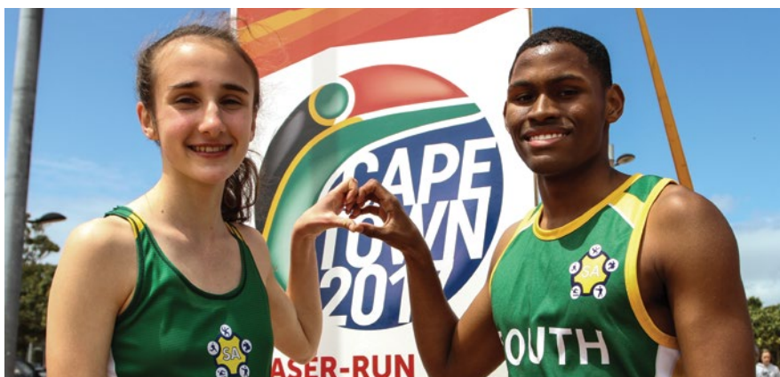
Two of the many South African gold medallists who dominated their home event in Cape Town

"I'm very happy and I say thank you to all the athletes and the coaches who have prepared them so well. What is also very important is that we have athletes from different countries on the podium."