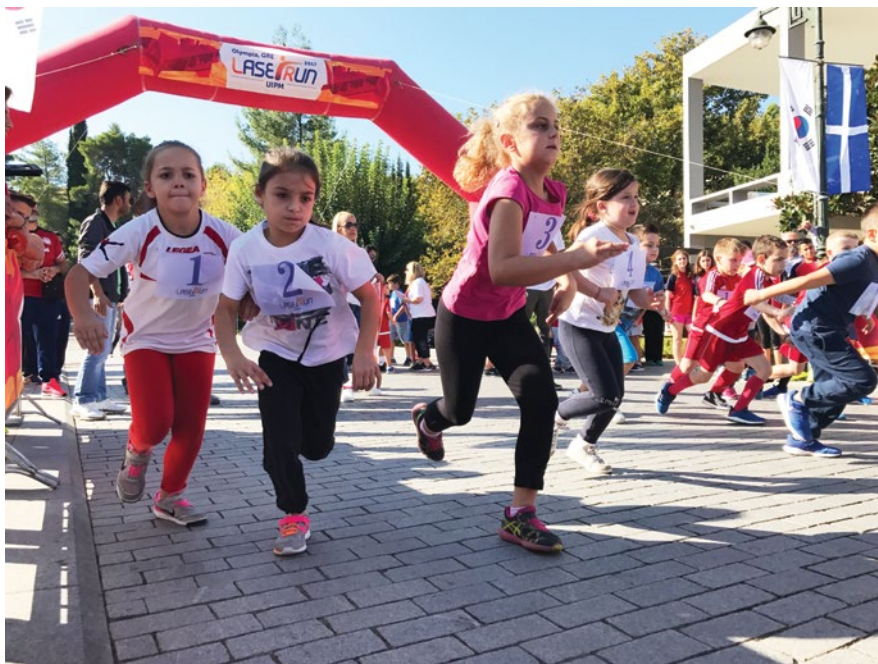
Determination on the start line in Olympia (GRE)

Olympia is, along with Lausanne (SUI), the last resting place of Modern Pentathlon's creator. Baron Pierre de