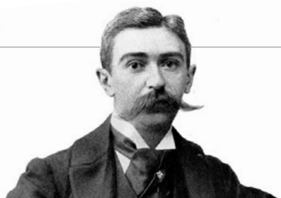
Baron Pierre de Coubertin

"The Modern Pentathlon event would test a man's moral qualities as much as his physical resources and skills, producing thereby the ideal, complete athlete."