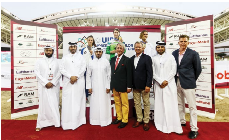
The women's podium at Al-Shaqab Arena