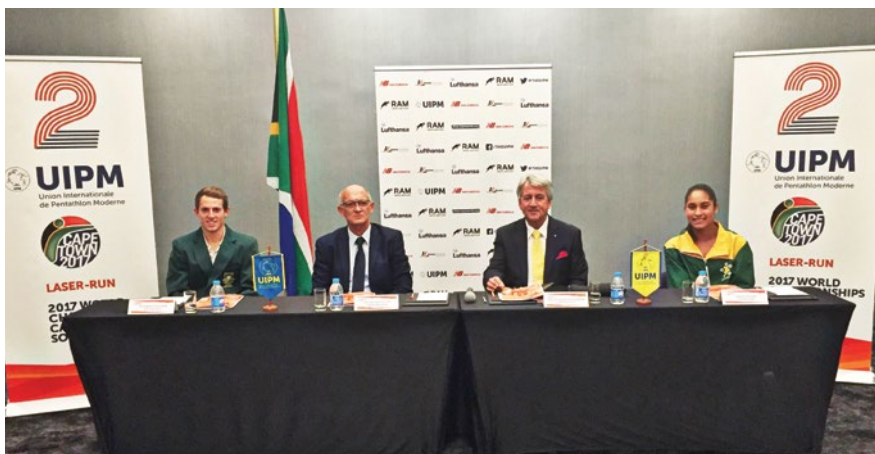
The UIPM 2017 Laser-Run World Championships press conference

During a meeting with Ms Anroux Marais, the Minister for Cultural Affairs and Sport, the UIPM President discussed the development of Modern Pentathlon and non-Olympic UIPM Sports such as Biathlon, Triathlon and Laser-Run, which are already quite well developed in South Africa. They spoke about the importance of sport as a powerful driver of educational development, better health and integration of society between different religious, cultural and socio-economic groups.