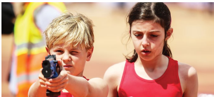
A young athlete takes aim while his partner waits for her turn