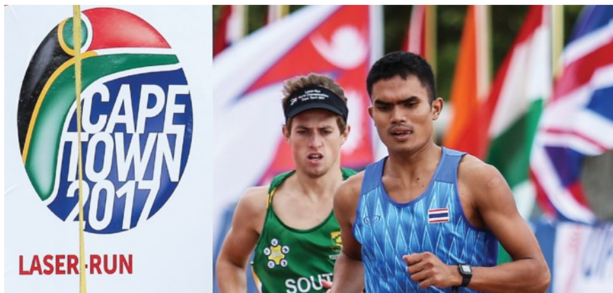
Competition was fierce across all age categories

"I'm very happy that the South African Modern Pentathlon Association (SAMPA) has organised this excellent event, and I congratulate the organising committee and all the athletes who achieved good results."