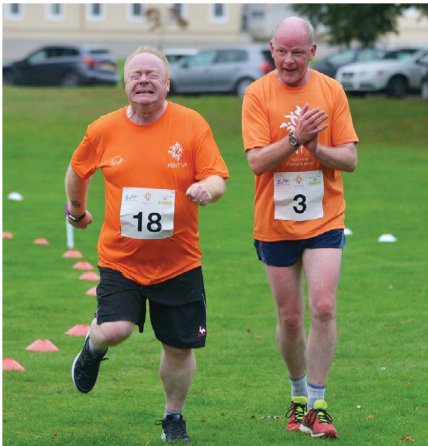
War veterans show grit and determination in Sandhurst (GBR)

"The stories that I heard from the veterans were humbling and grounding,