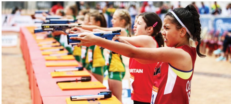
Young female athletes take aim at the laser shooting range