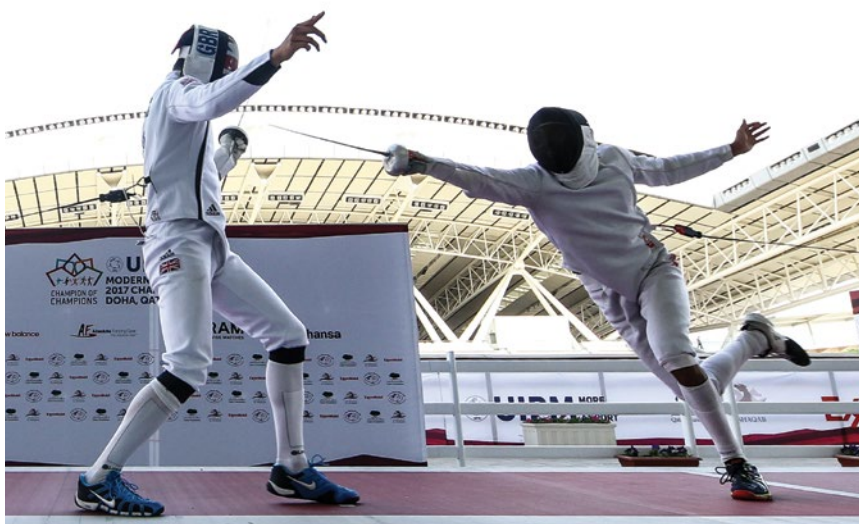
The Fencing Bonus Round was a highlight of the men's event