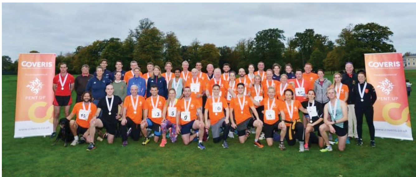
A group photograph of all the competitors and organisers