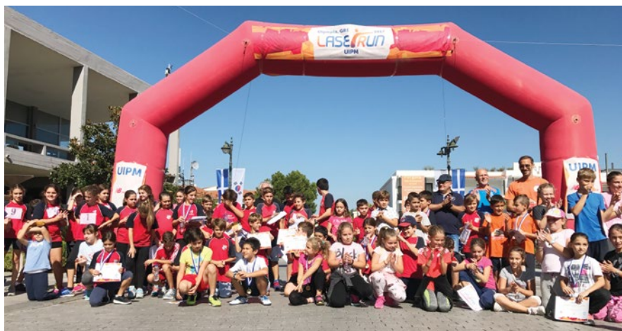
A group photograph in the historic Olympic Games venue

If you would you like to host or participate in a Laser-Run City Tour, check out the Events calendar on the UIPM website or email development@pentathlon.org .