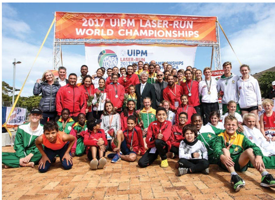
A group photograph of competitors and officials in Cape Town

Athletes from countries as diverse as Ivory Coast, Thailand and Monaco