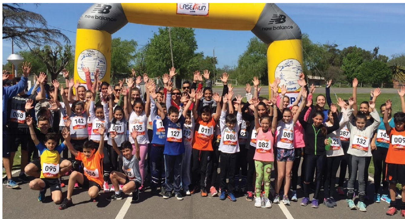
A happy hello from the Laser-Run City Tour in Magdalena (ARG)

This LRCT was also marked by a great response to the organizers' call for athletes and volunteers, who came from various sectors of society.