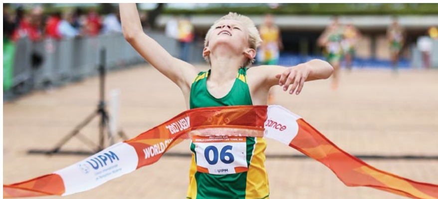
A young South African competitor takes the tape