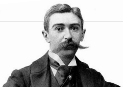
Baron Pierre de Coubertin

"The Modern Pentathlon event would test a man's moral qualities as much as his physical resources and skills, producing thereby the ideal, complete athlete."