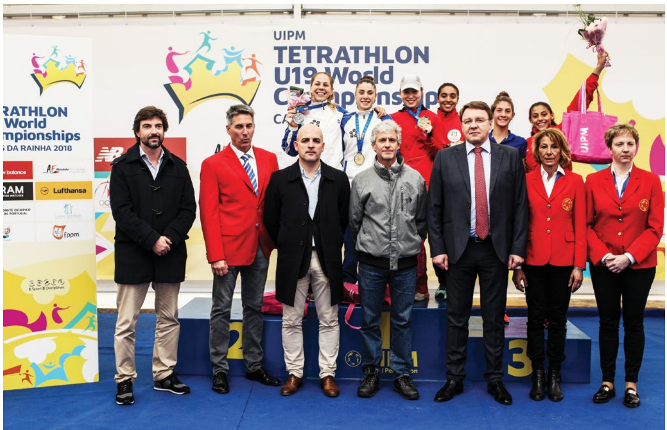
The Women's Individual podium in Caldas da Rainha (POR)

"The message is clear: Modern Pentathlon is a global sport around the world, both genders are represented very strongly and I cannot recall when there were more girls than boys at a competition. It's a great step in Modern Pentathlon development and a great message to the Olympic society."