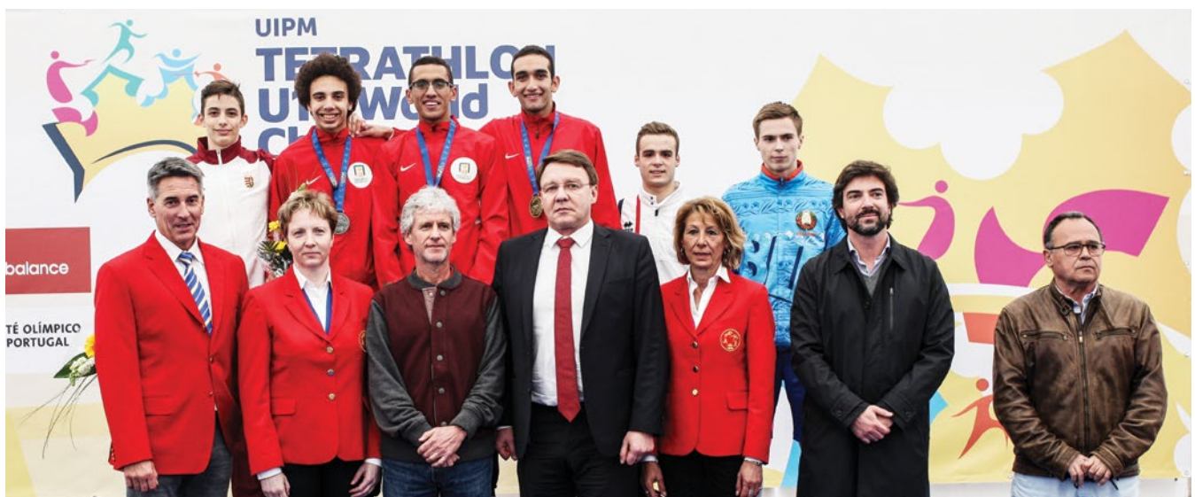
The Men's Individual podium with the three medallists from Egypt on top