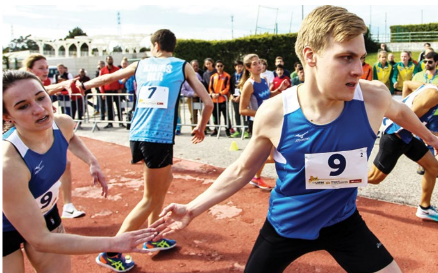
It's handover time in the Mixed Relay Laser-Run