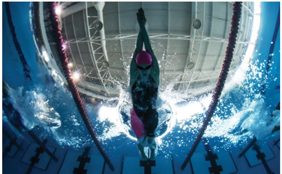
A swimmer cuts a dramatic pose from underwater during the Women's Individual Final