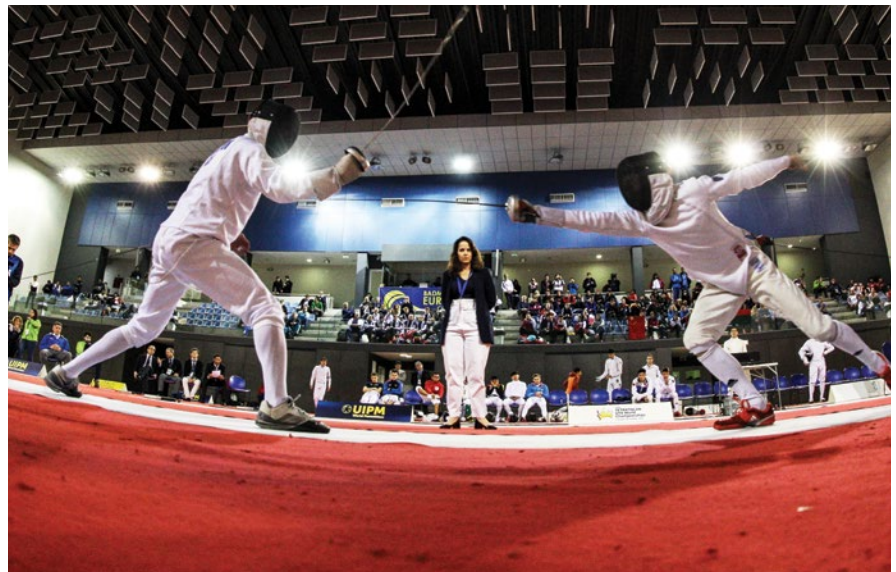
Two fencers compete in the Ranking Round as the judge and crowd look on

8sec from Gromadskii (RUS) with Kang (KOR) and Tamas (HUN) very close behind. Tamas (HUN) moved up to 2nd with Price (GBR) joining him in the medal hunt, and they were soon joined by Gromadskii (RUS).