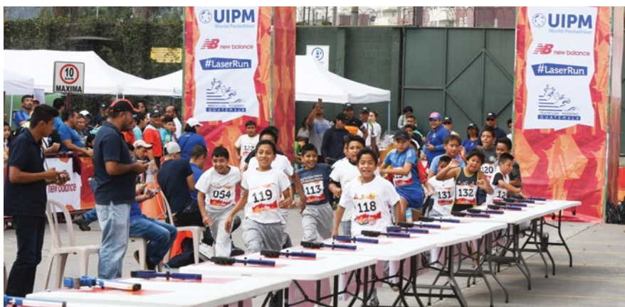
Junior athletes rush to get to the Laser-Run shooting range

very well received by the hundreds of young athletes who took part and also the general public.