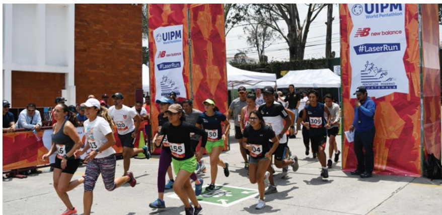
Female athletes lead their male counterparts from the start line