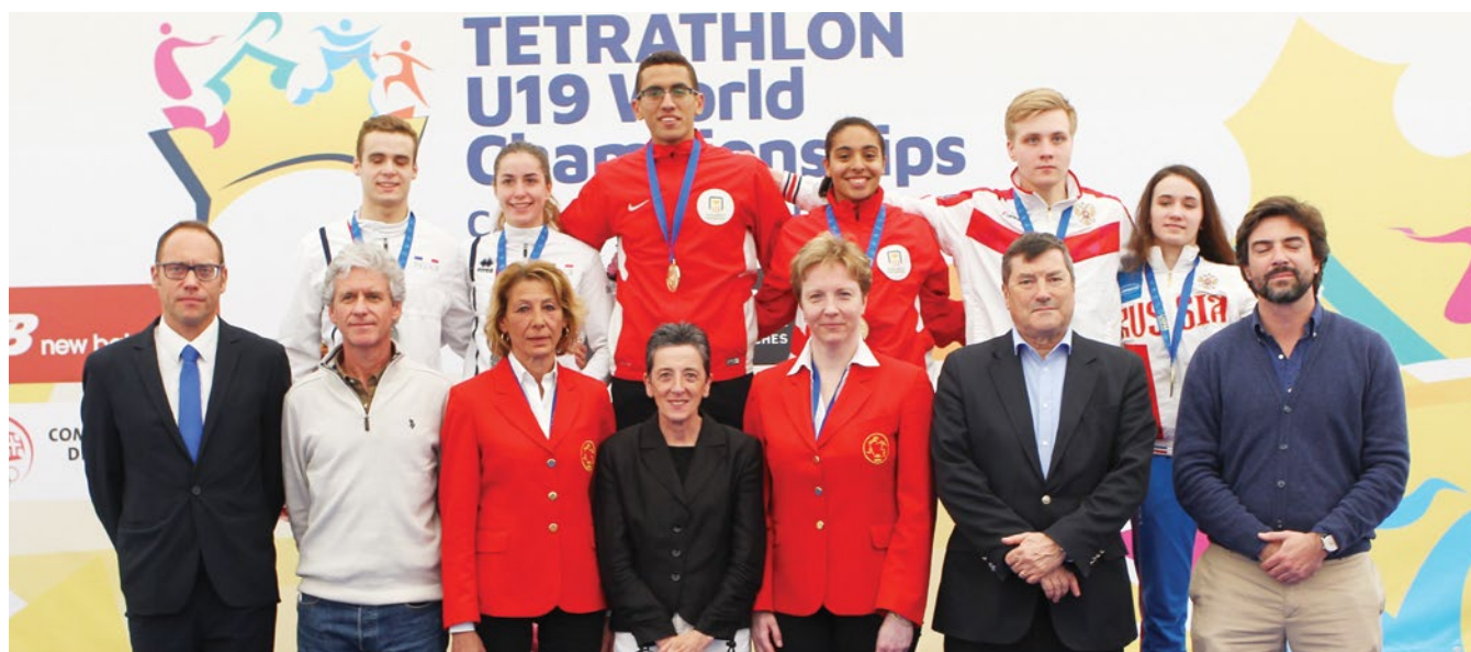
The Mixed Relay podium after the final event of the championships

The next competition on the calendar is UIPM Pentathlon World Cup Kecskemet in Hungary from May 3-7.