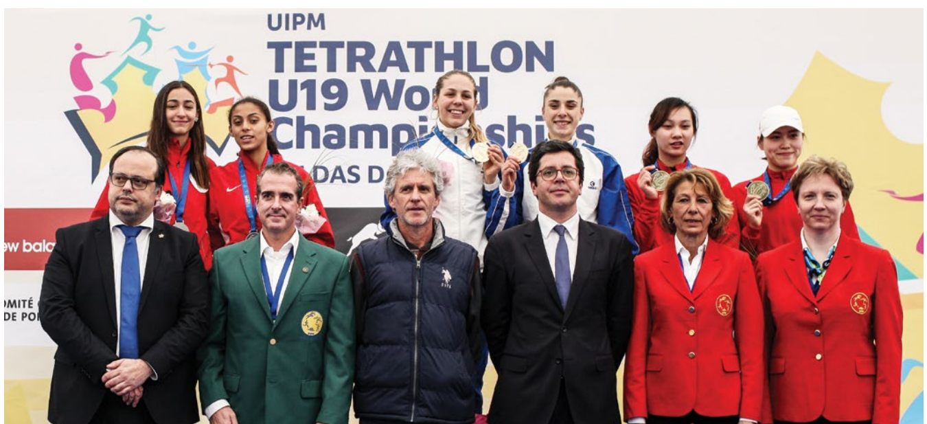
The Women's Relay podium in Caldas da Rainha (POR)