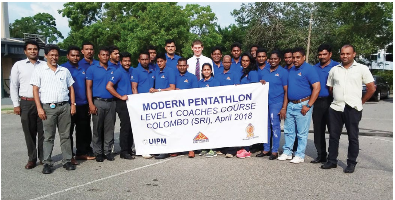
It's celebration time for the full cohort of Level 1 coaches in Colombo (SRI)