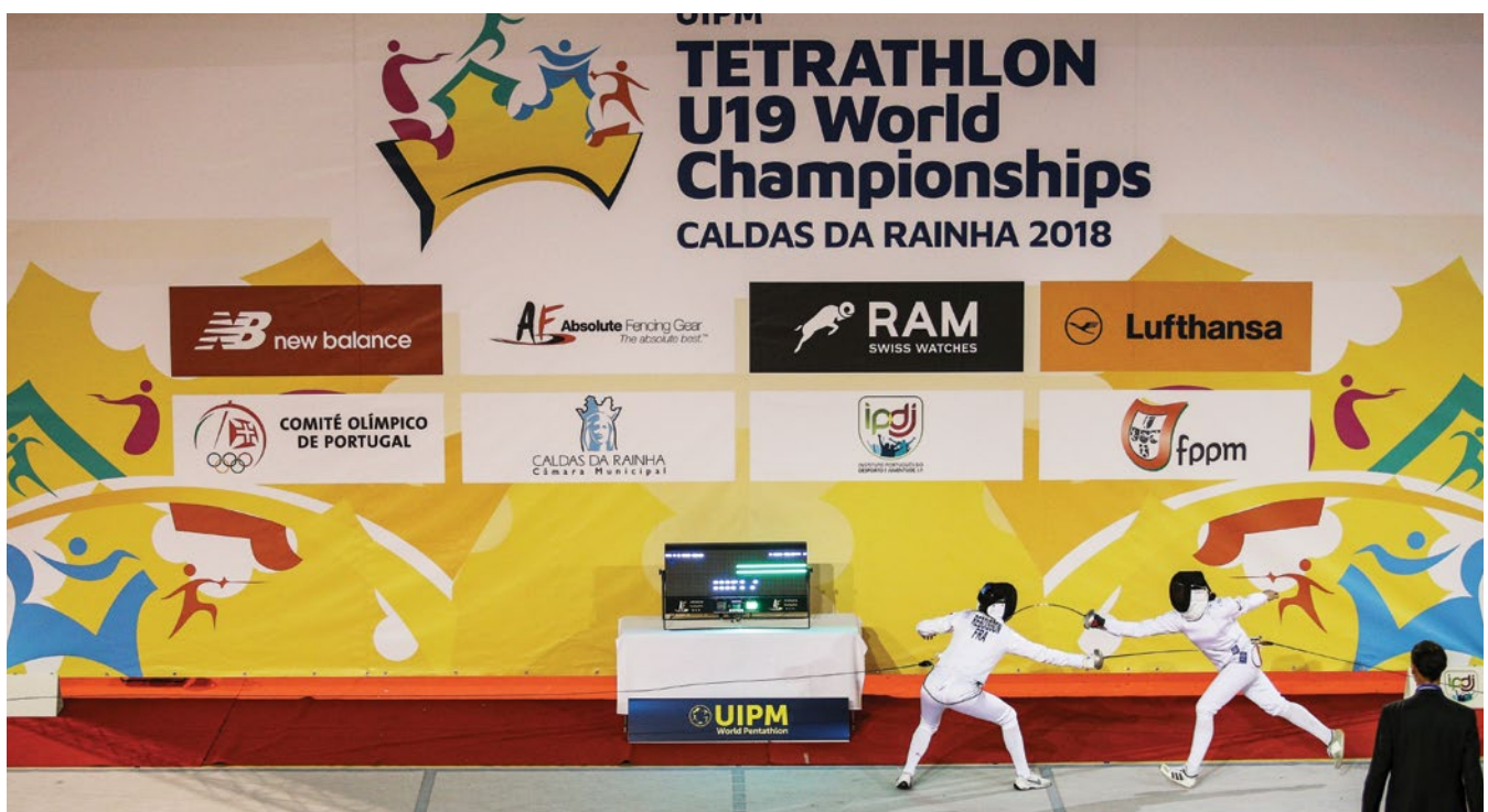
Two female fencers are dwarfed by the huge Bonus Round stage set up in Caldas da Rainha (POR)

Rinaudo (ITA) dominated the Women's Individual Final after an incredible