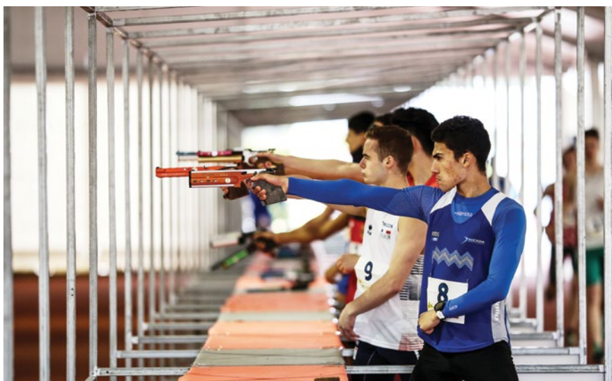
A line of Laser-Run competitors take aim at the shooting range