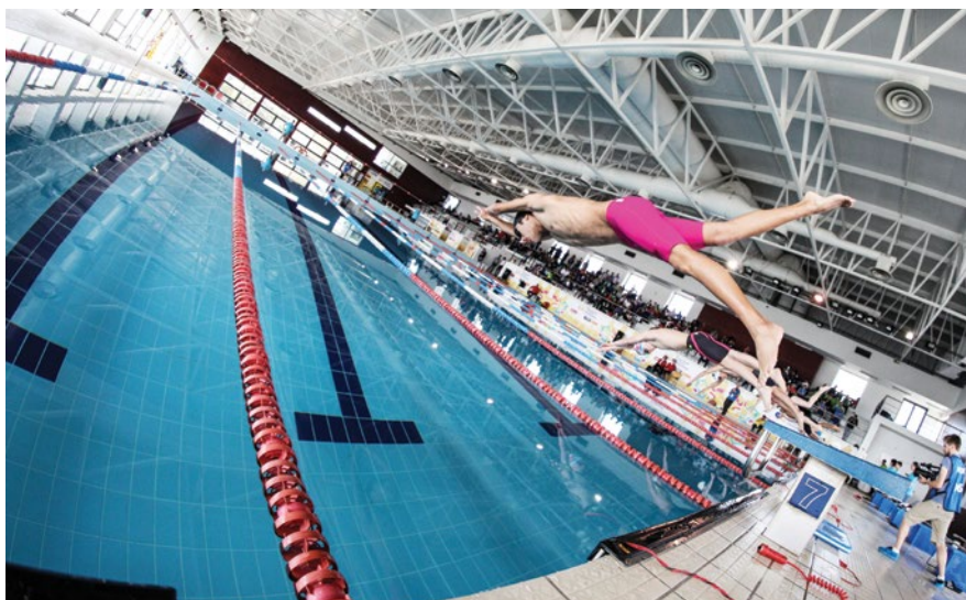
Swimmers dive into the pool during the Men's Individual Final