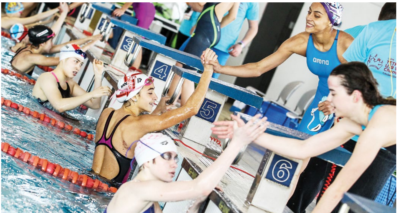
High fives in the Swimming pool for the Tetrathlon team-mates