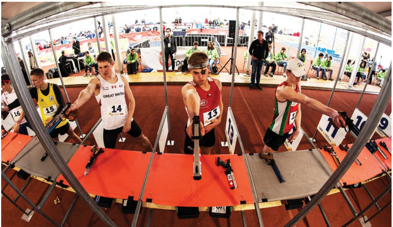
Men's Relay competitors look to make up some places in the Laser-Run