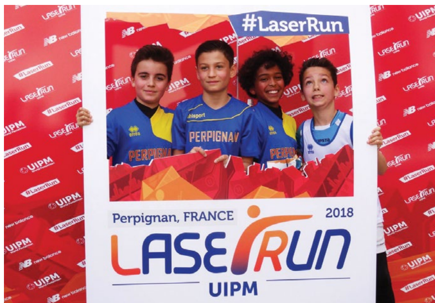
Four junior male athletes pose for a special Laser-Run City Tour photograph