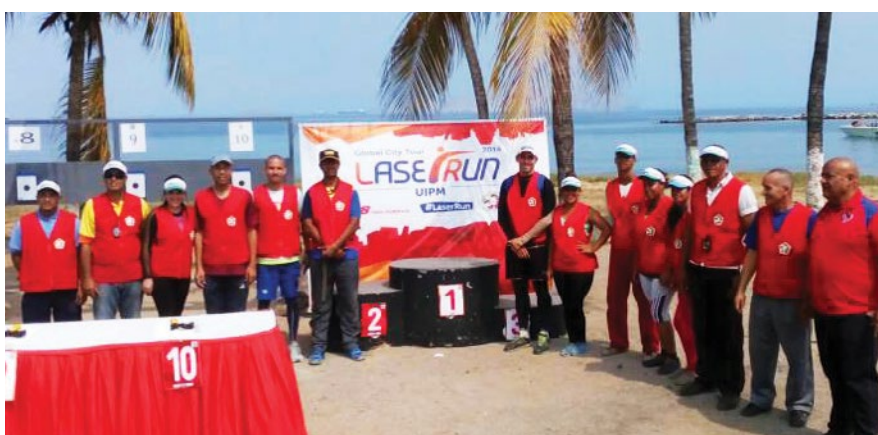
Volunteers come together for a photograph by the water in Guatemala City (GUA)