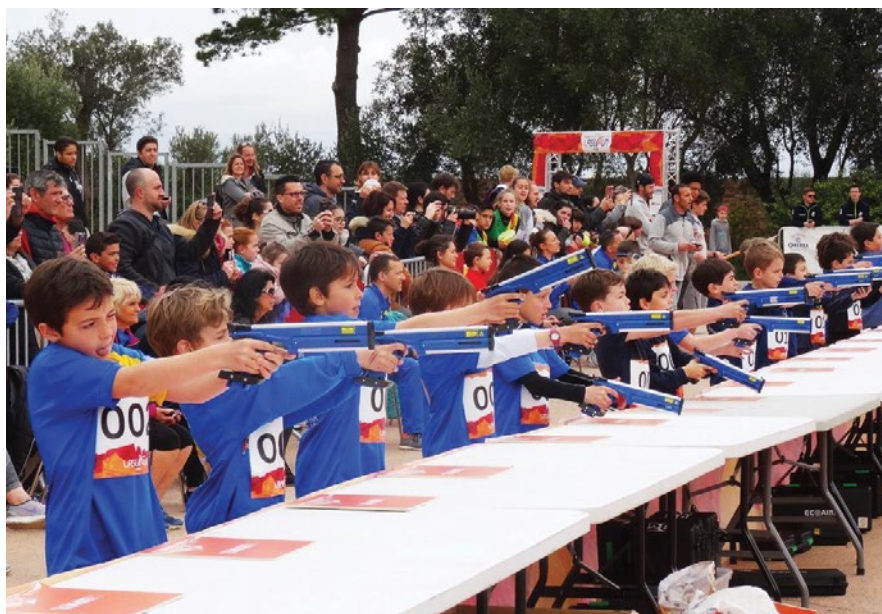
The young athletes try their hand at laser shooting in Perpignan (FRA)

friendly and efficient management enabled a remarkable competition to take place."