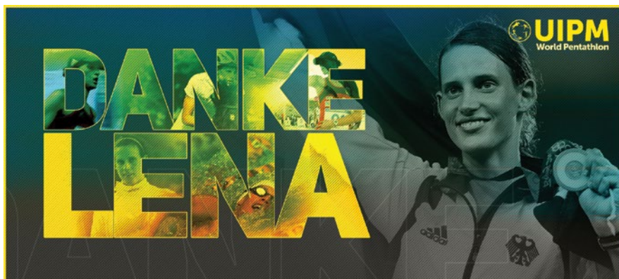
Lena Schoeneborn, Olympic champion in 2008, was one of the best pentathletes of the 21st century so far