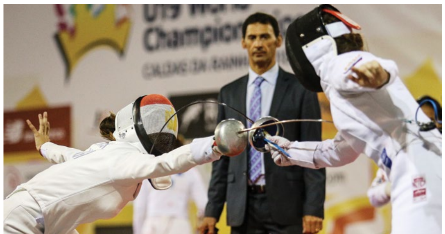
Fierce competition on the Fencing Bonus Round piste during the Women's Relay