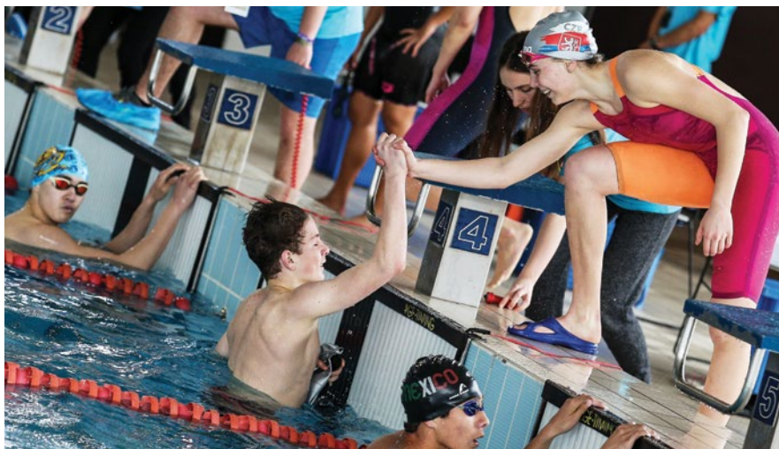
A high five in the Swimming pool for Czech Republic in Caldas da Rainha (POR)