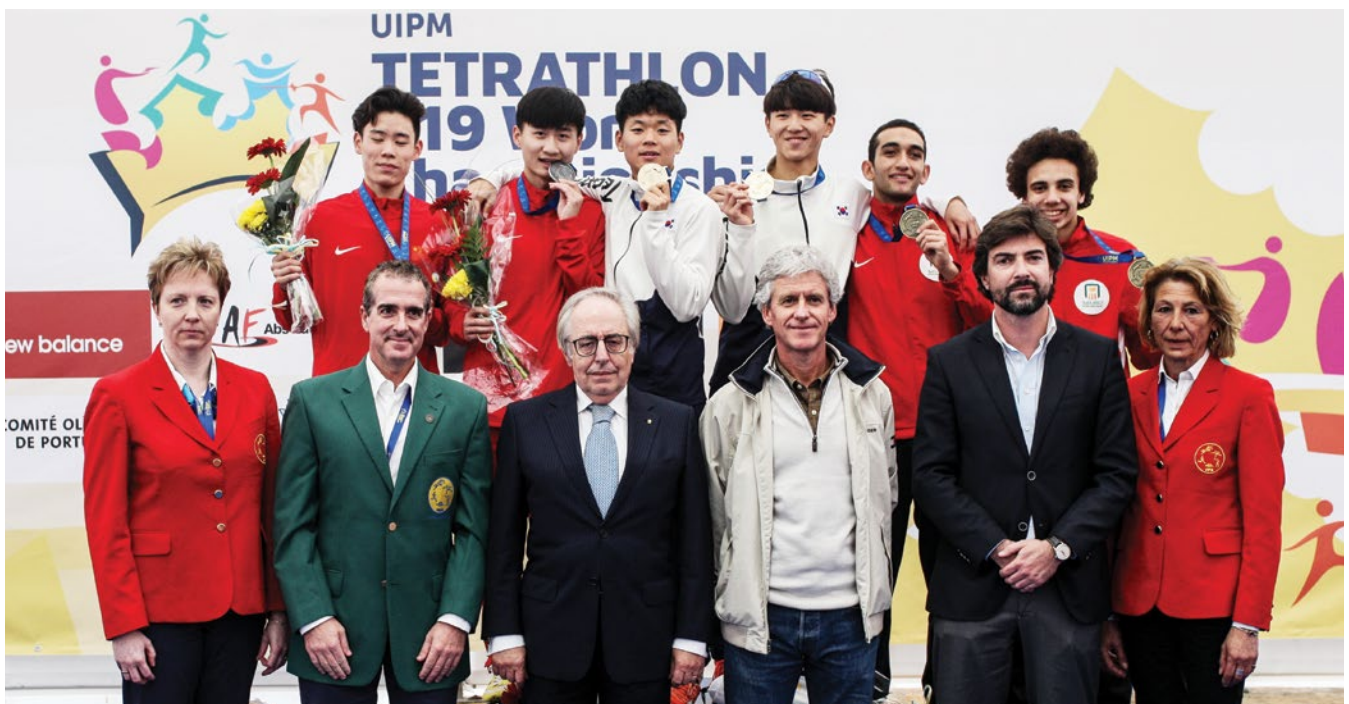
Korea, China and Egypt ensured there was no European nation on the Men's Relay podium