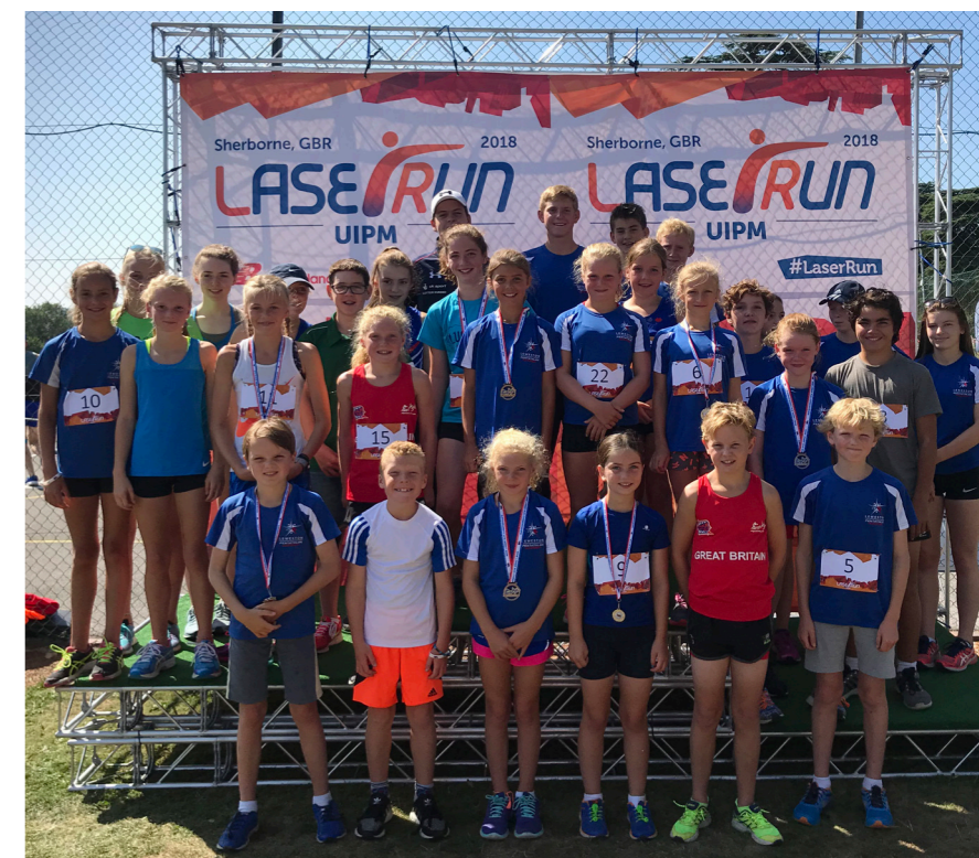
Medallists join fellow participants for a group photo in Sherborne (GBR)

Eleven sports were on the programme and Laser Run, UIPM's fastest-growing sport, joined the established Olympic