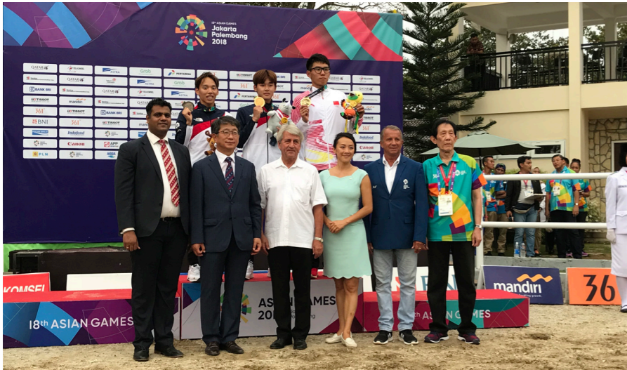
Men's Individual podium