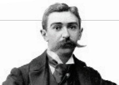
Baron Pierre de Coubertin

"The Modern Pentathlon event would test a man's moral qualities as much as his physical resources and skills, producing thereby the ideal, complete athlete."