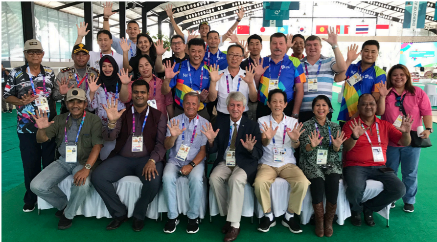
A #High5 at the 2018 Asian Games