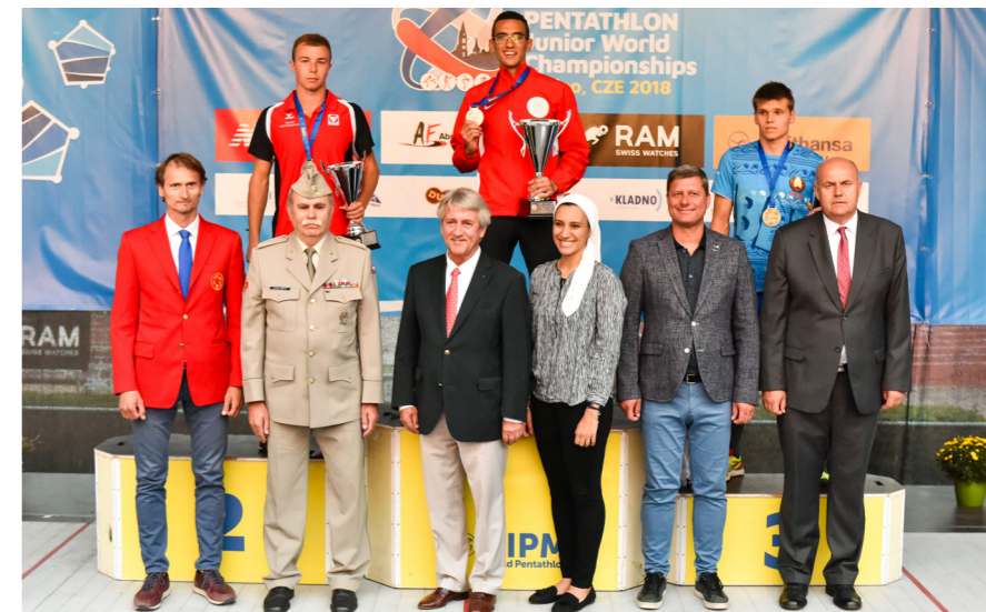
Men's Individual podium