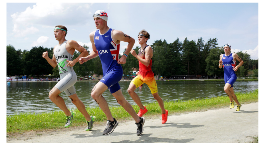
Russian, British and German athletes vie for the lead in Weiden (GER)

The UIPM 2018 Biathlon-Triathlon World Championships taking place in Hurgada (EGY) from October 25-28 and National Federations can see the official invitation and register teams for the Open Division at pentathlon.org.