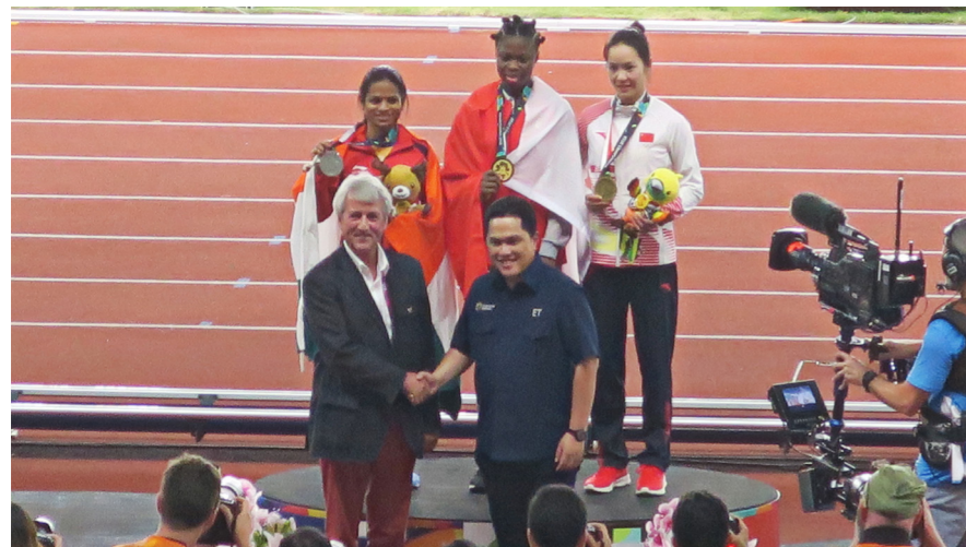
The UIPM President shakes hands with Asian Games 2018 President Erick Thohir after they presented the medals and mascots for the women's 100 metres in athletics