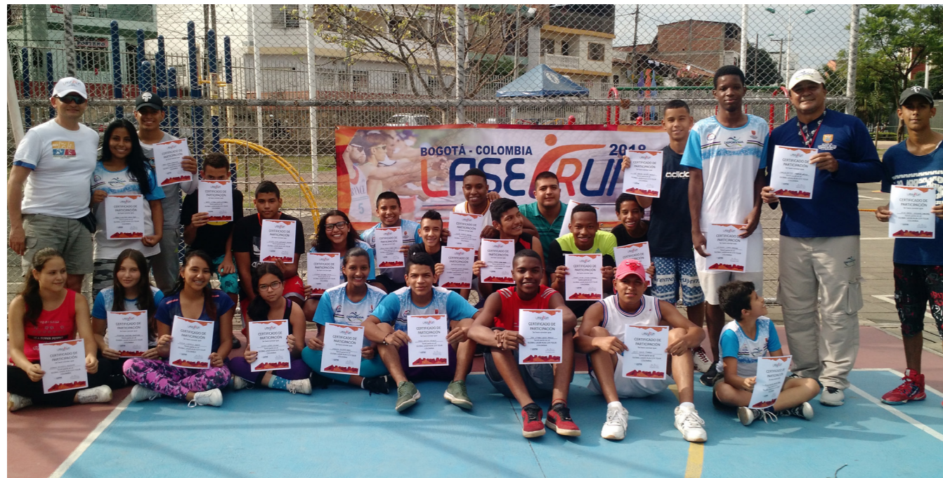
Happy faces in Cali (COL) as the Laser Run beginners receive a certificate marking their participation