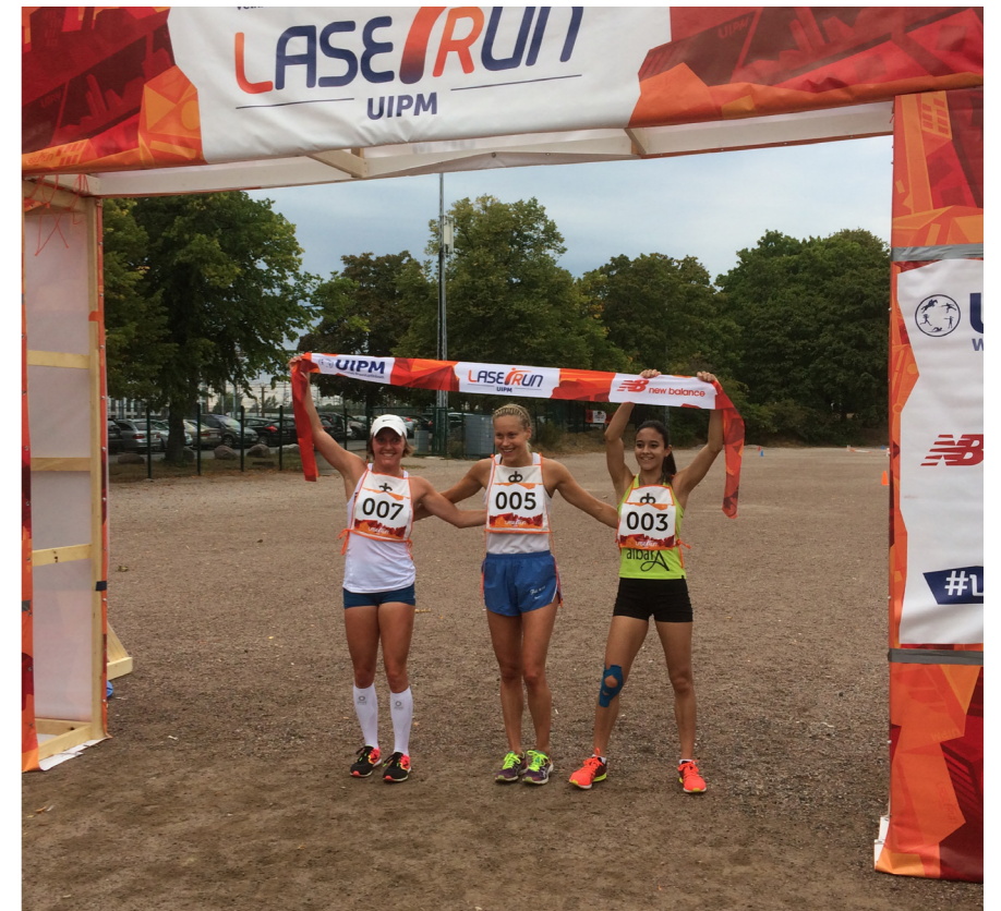
All smiles at the finish line in Finland

The Helsinki event strongly reflected the tradition of Finnish pentathlon, with legends such as 1972 Olympic bronze medallist Veikko Salminen among the audience. The event was organized