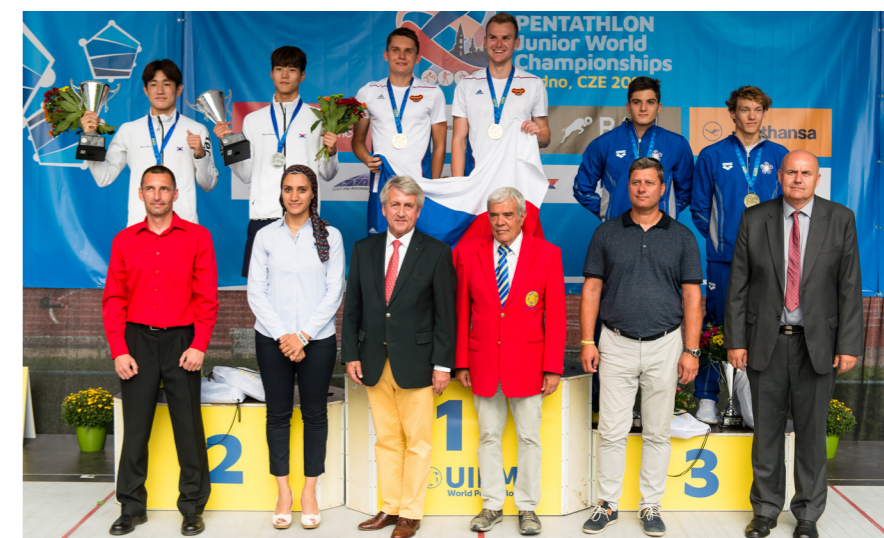
The Men's Relay podium at the UIPM 2018 Pentathlon Junior World Championships