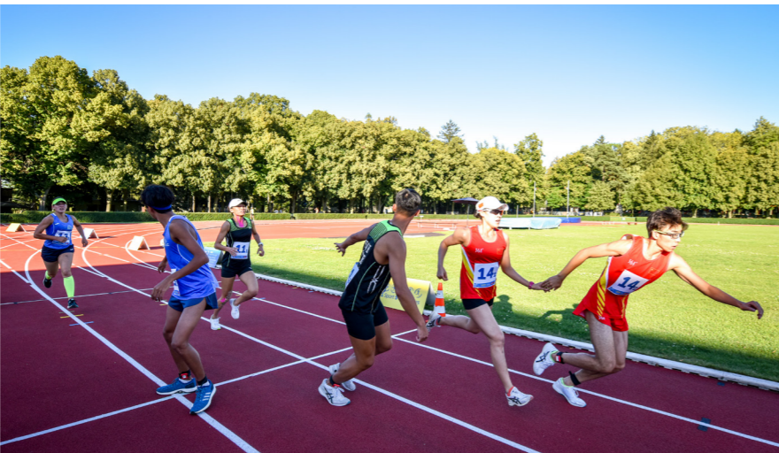
It's handover time on the track during the Mixed Relay