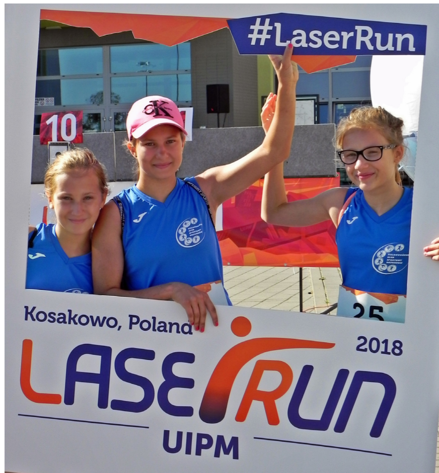
Three female youths have fun in the photo booth in Kosakowo (POL)

committee said: "Even though the temperature was really high, our participants fought so bravely. The fighting spirit was present throughout the event, especially during our youngest participants' round."