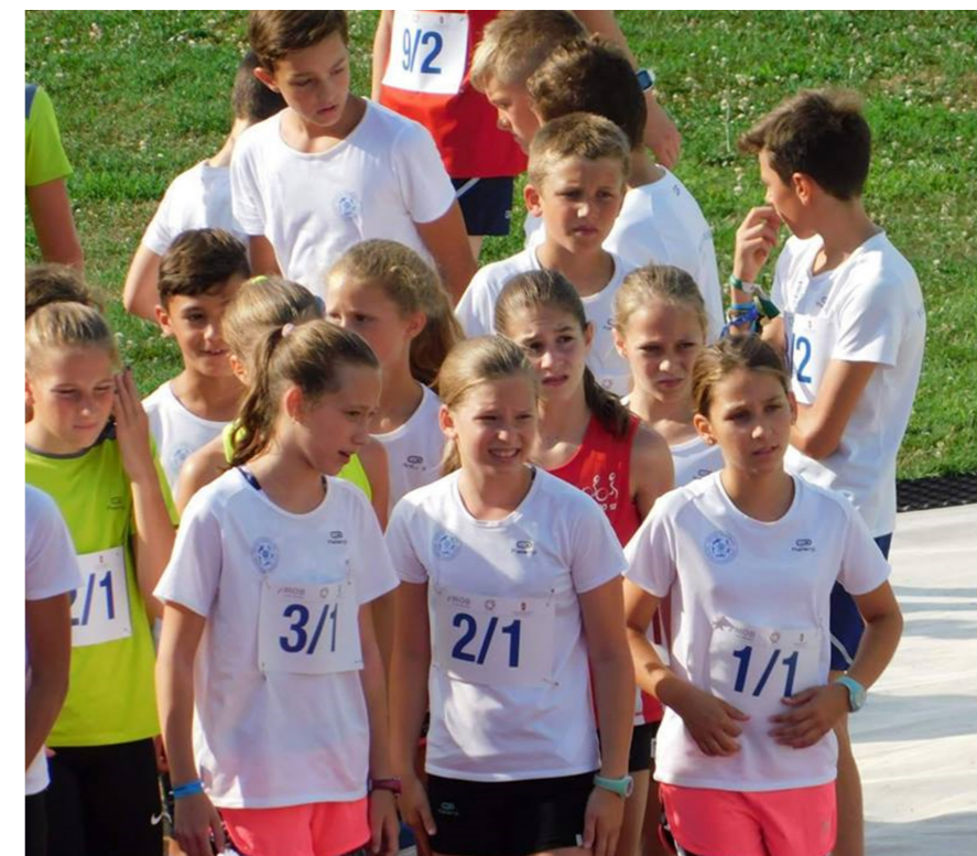
Laser Run competitors wait at the start line in Budapest (HUN)

The growth in popularity of Laser Run was underlined when the sport made its debut at the national finals of the UK School Games in Loughborough (GBR).