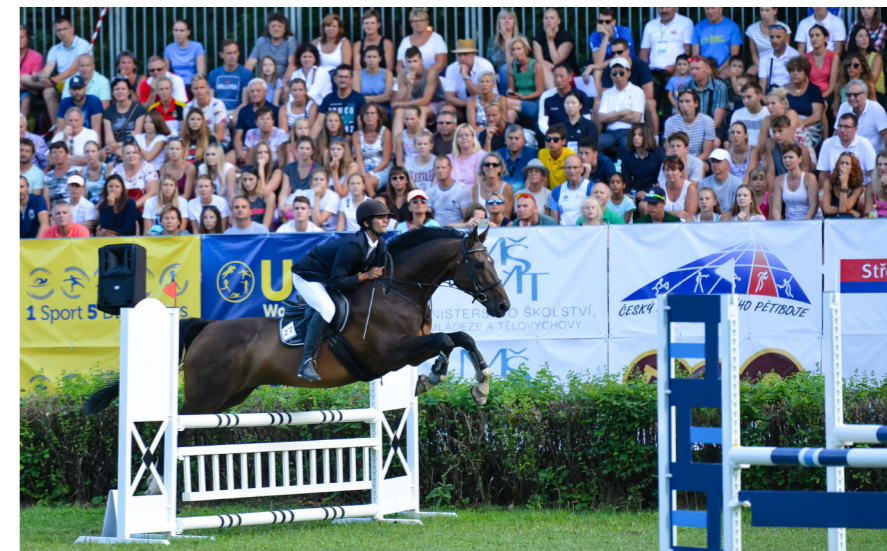
A capacity crowd in Kladno (CZE) enjoys the Riding discipline