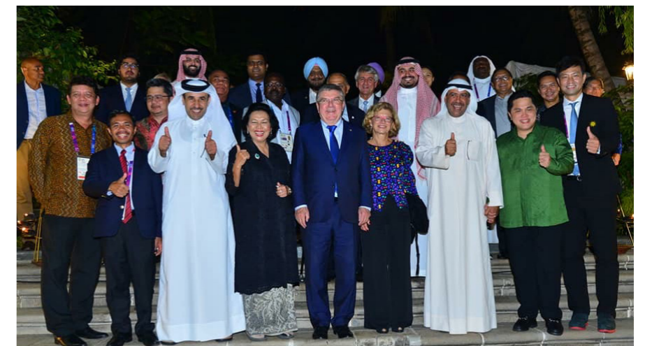
Thumbs-up at a reception held in honour of the IOC President, Dr Thomas Bach, and OCA President, Sheikh Ahmad Al-Fahad Al-Sabah