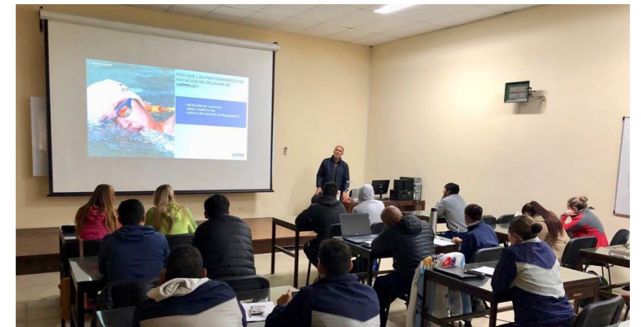
Coaches from four South American countries pay attention during the course in Buenos Aires (ARG)

After the opening ceremony on July 27, the Triathlon was held on July 28 and the Biathlon on July 29, each comprising