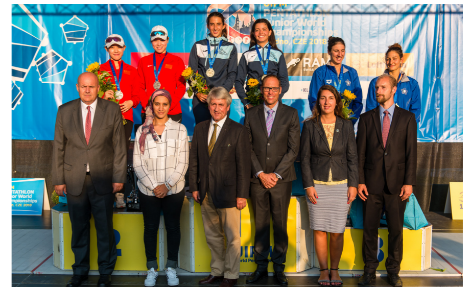
Women's Relay podium