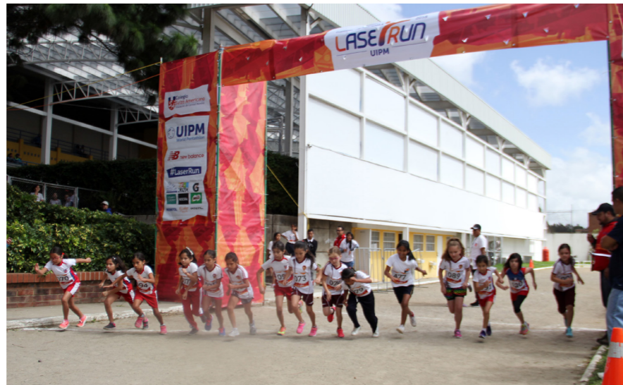
The race is on at the start line in Guatemala City (GUA)