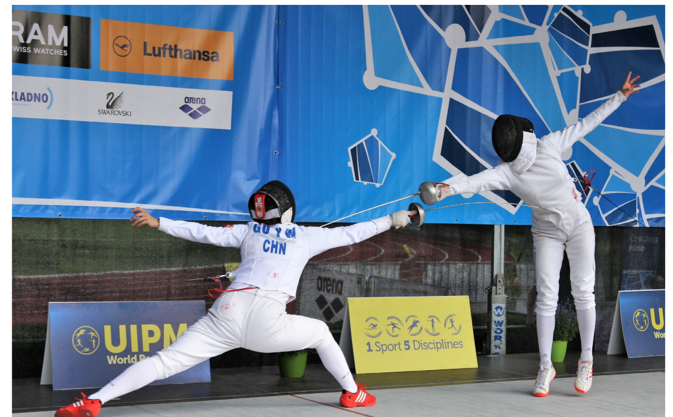
There was fierce competition during the Fencing Bonus Round

The pair had already teamed up to win bronze in the Women's Relay following