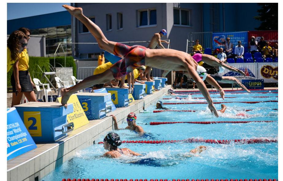
Male athletes follow their female team-mates into the pool during the Mixed Relay