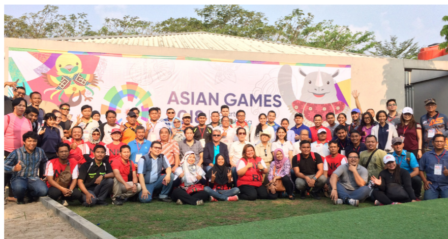
It's a new horizon for certified UIPM judges in Jakarta (INA) ...

"The Asian Games is the biggest multi-sport event in the Eastern Hemisphere and in Jakarta you can feel all the excitement that a multi-sport event generates. There are amazing facilities there and our Indonesian judges have been getting a lot of experience. They are willing to learn and now they will have the chance to deliver a great competition."