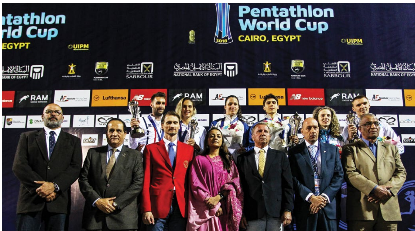
Mixed Relay podium, UIPM 2018 Pentathlon World Cup Cairo