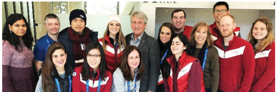
The UIPM President with the George Washington University Student Group