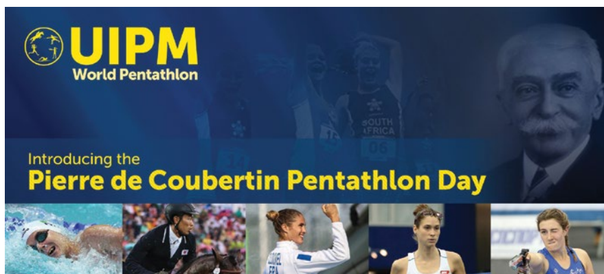
Pierre de Coubertin Pentathlon Day will be celebrated by all National Federations

"The first celebration will take place in September 2018, which will be a very special time as we are hosting our UIPM Senior World Championships in Mexico City (MEX) and also looking forward to