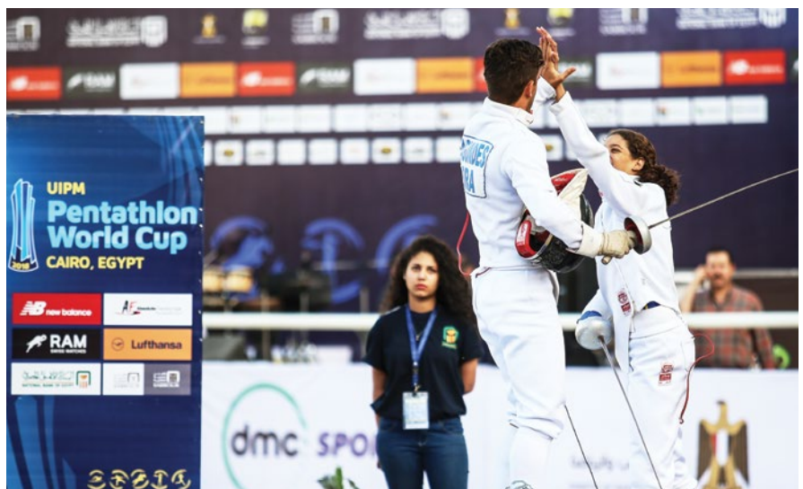
Great teamwork on display during the Mixed Relay Fencing Bonus Round