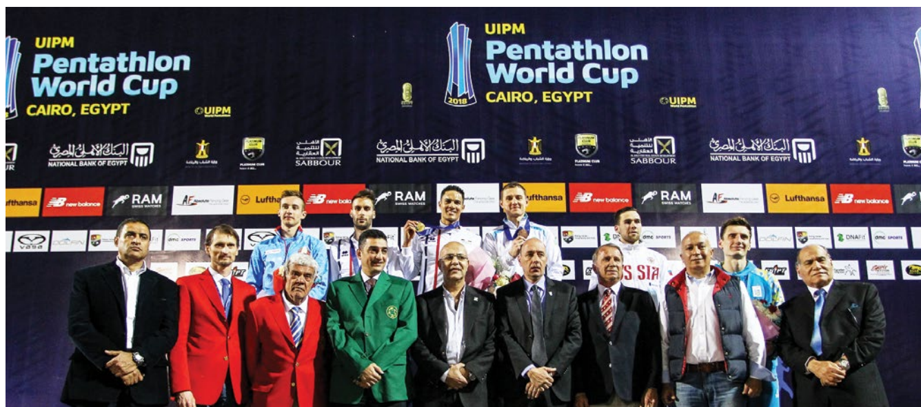
Men's Individual podium, UIPM 2018 Pentathlon World Cup Cairo