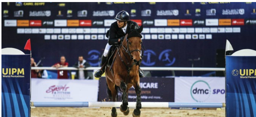
The athletes of host nation Egypt received great support throughout Pentathlon World Cup Cairo