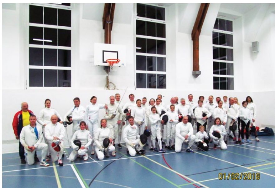
Winterpentathlon competitors in the Fencing hall in Davos

The Winterpentathlon comprises Pentathlon and Tetrathlon competitions combining Fencing, Riding, Cross-Country Skiing, Shooting and Giant Slalom.