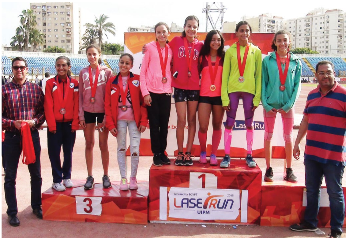
Youth Laser-Run competitors on the podium in Alexandria (EGY)

Find out more about Laser-Run at the UIPM website .