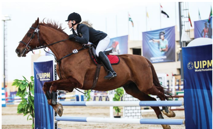
Action from the Riding event during the Women's Individual Final