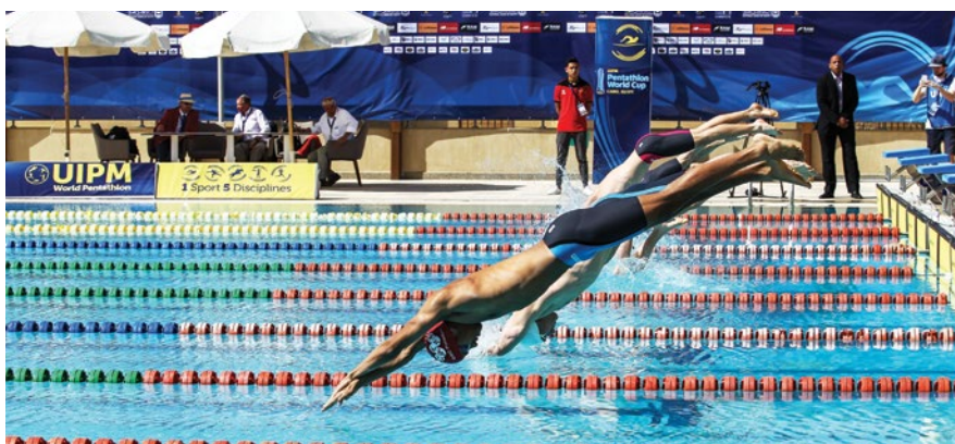
Male competitors take to the water during the Swimming event