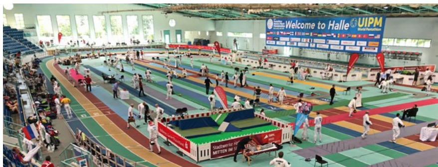
The track & field facility in Budapest where Fencing and Laser-Run can take place in the same venue