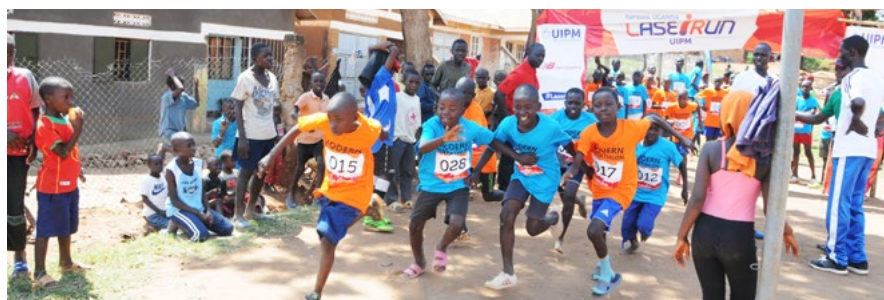
Youth athletes locked in intense competition in Kampala (UGA)

Have you liked the UIPM Laser-Run Facebook page yet?