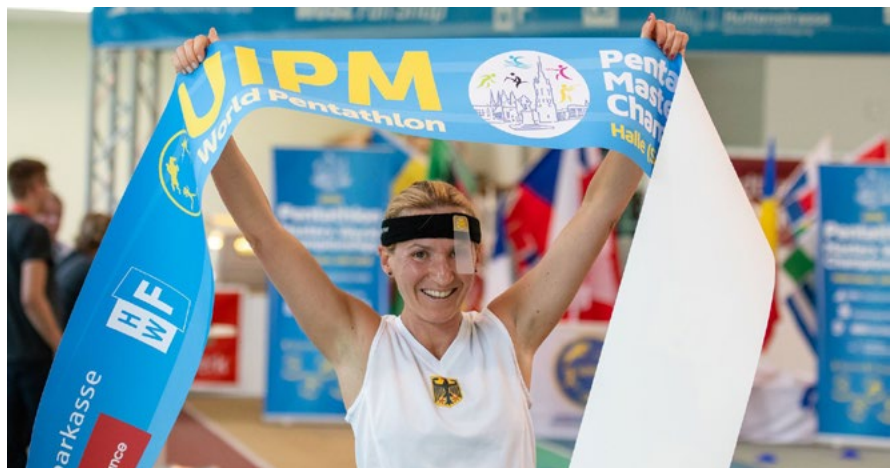
A German female competitor celebrates her success