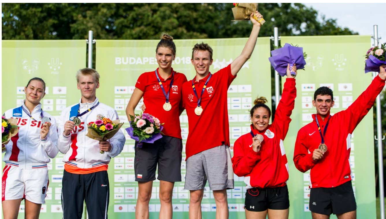
Mixed Relay podium

The 2nd FISU World University Modern Pentathlon Championship will take place in Vila Real (POR) in 2020.