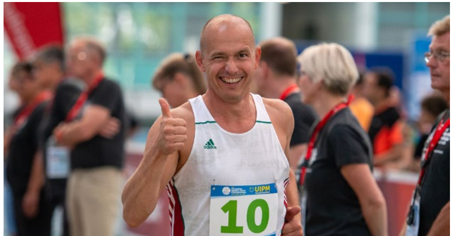
The Masters World Championships gets a thumbs-up from one of the male competitors

"Masters is extremely important to the future image of our sporting movement, including sports such as Biathlon, Triathlon and Laser-Run. We need to get a broad variety of the population involved in all of our sports, not only a small elite."