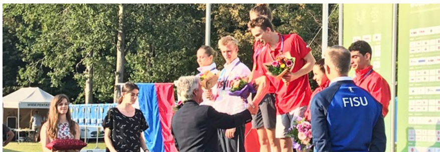
The UIPM President hands out awards to the winners of the Mixed Relay