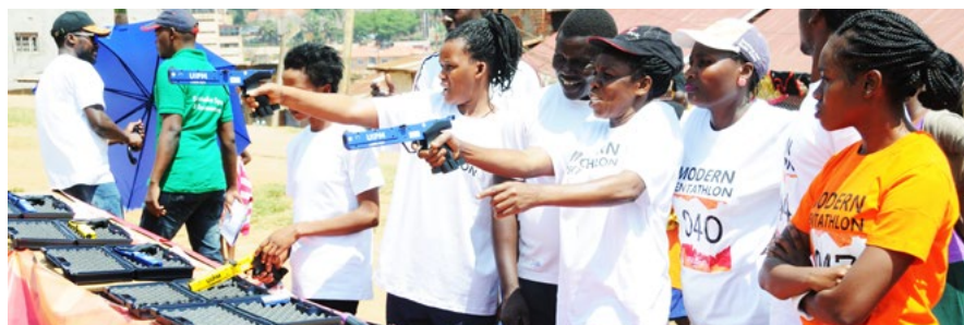
Shooting practice in Lagos (NIG)