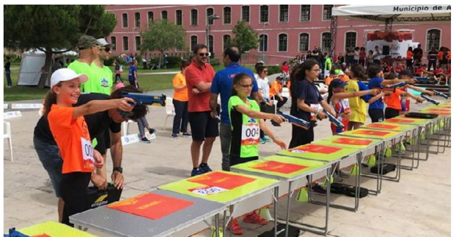
Female youths enjoy their first taste of laser shooting