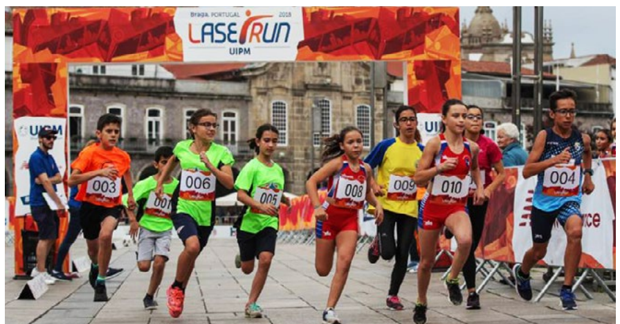
The will to win is etched on the faces of youth competitors in Braga (POR)