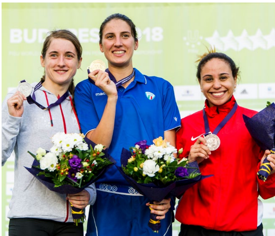
Women's Individual podium

On the final day, July 8, a newly-created Team Pentathlon took place with four athletes (male and female) from each nation taking part in one discipline each.