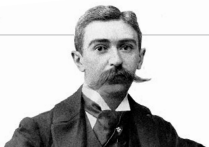
Baron Pierre de Coubertin

"The Modern Pentathlon event would test a man's moral qualities as much as his physical resources and skills, producing thereby the ideal, complete athlete."