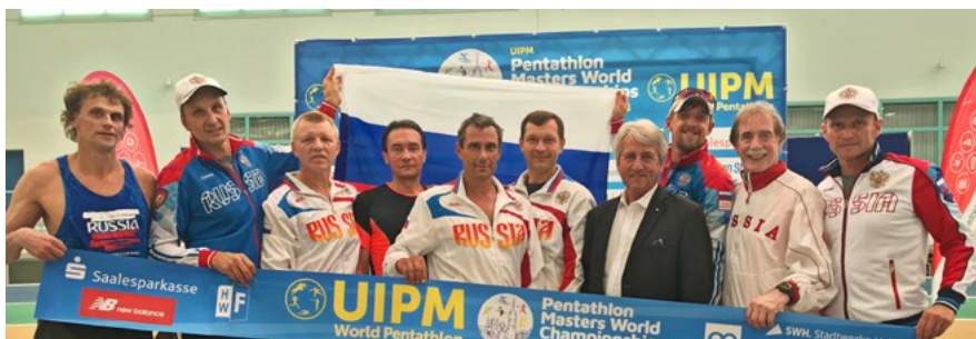
The UIPM President joins the Russian delegation in the UIPM Masters World Championships arena