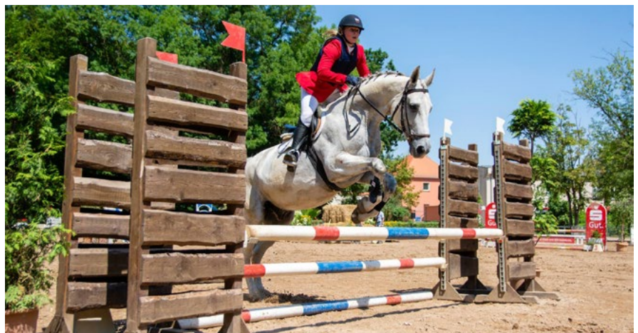
A female competitor clears one of the obstacles on the Riding course in Halle (GER)