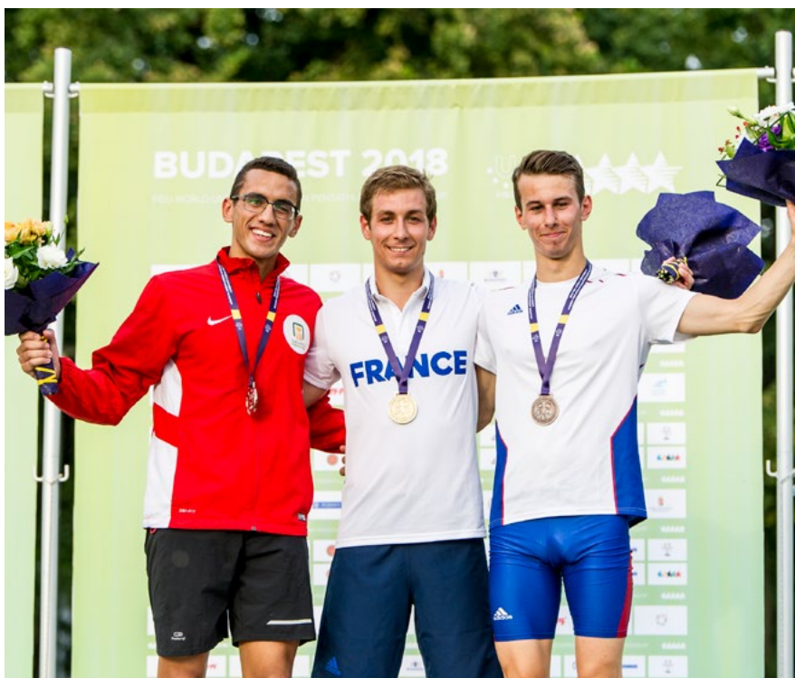
Men's Individual podium