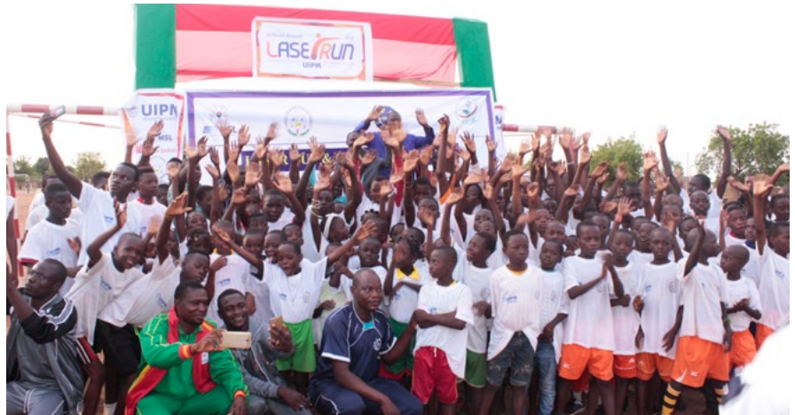
A big wave from the participants in Koupela (BUR)

Portugal's first Global LRCT in 2018 took place in Abrantes in June and there is a fourth event scheduled for Amadora on September 23, enabling the country to build on the momentum of hosting the UIPM Laser-Run World Championships in Lisbon in 2016.