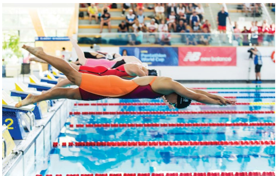
Swimmers enter the pool in Kecskemet (HUN)