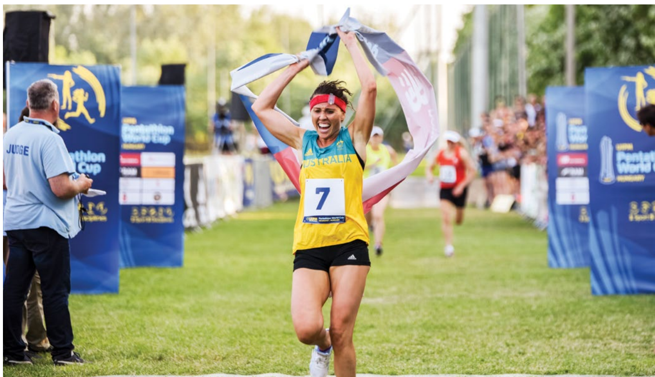
Chloe Esposito (AUS), winner of Olympic gold in Rio in 2016, celebrates crossing the line to secure her first gold medal in a UIPM Pentathlon World Cup, in Kecskemet (HUN)