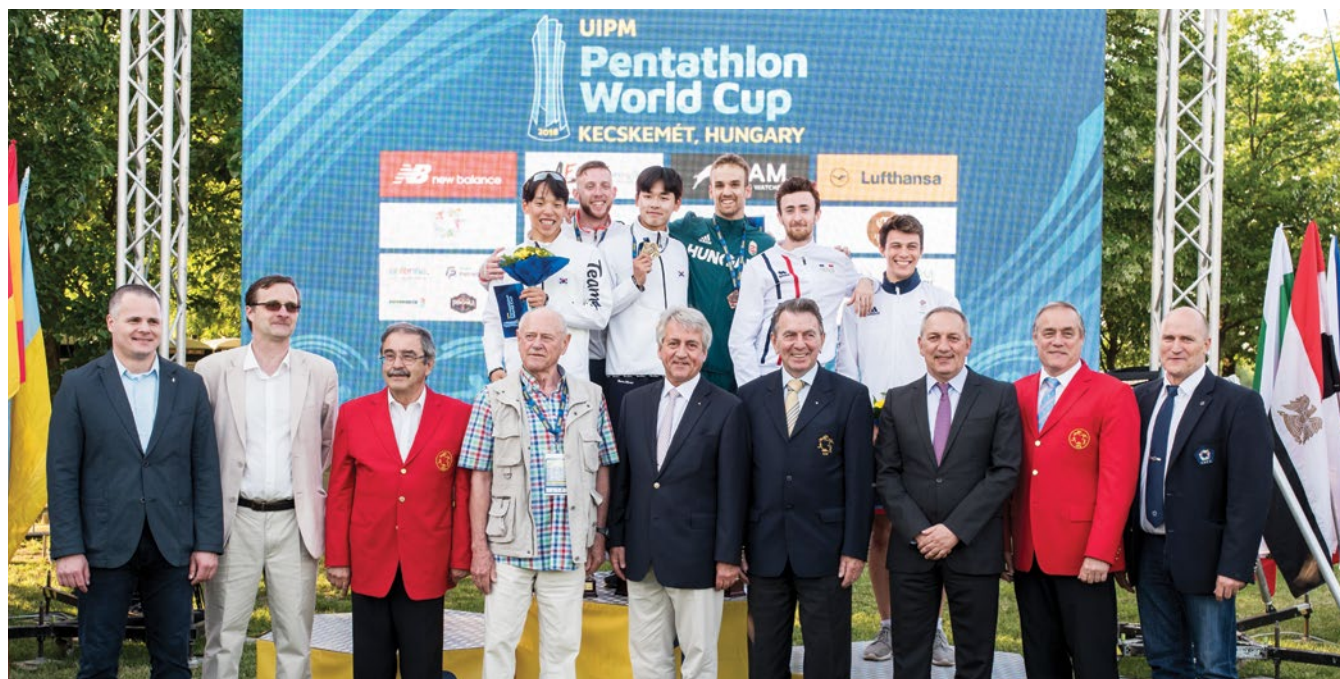
Men's Individual podium