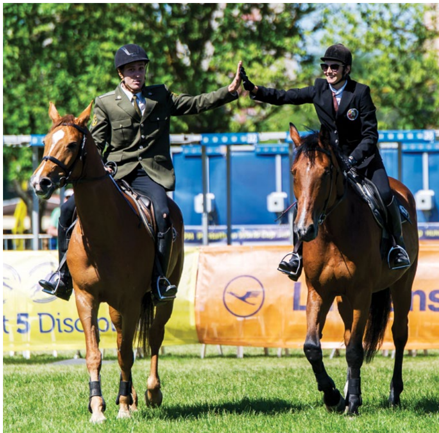
A high five on horseback during the Mixed Relay