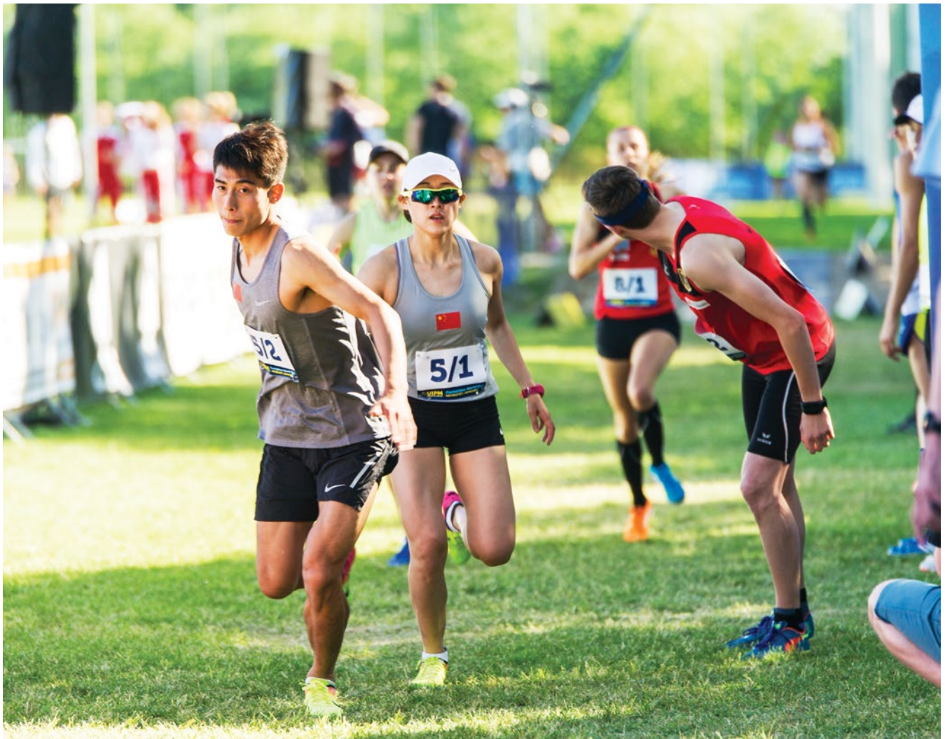
It's handover time for China and Germany