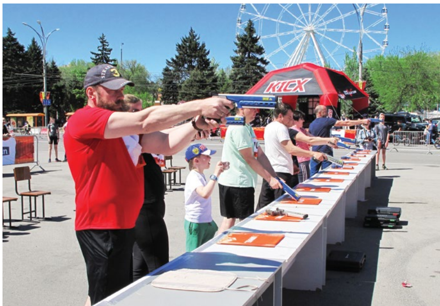
Male participants in Rostov-on-Don (RUS)

Following the success of the UIPM Laser-Run City Tour in Olympia