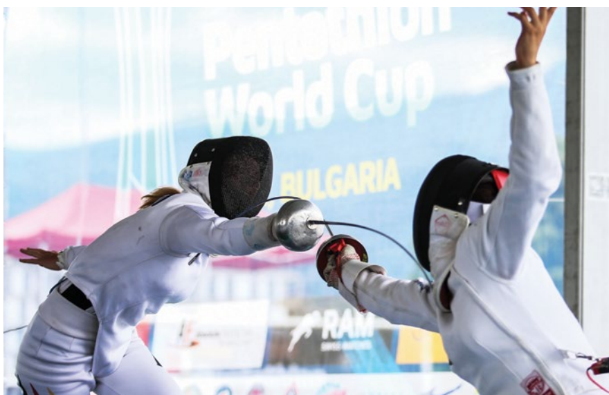
Action from the Fencing Bonus Round in Sofia (BUL)