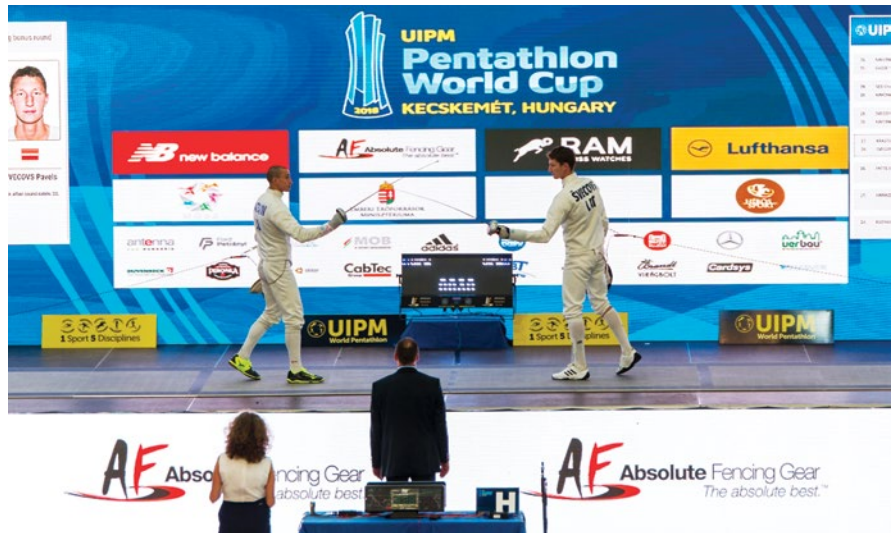
Bonus Fencing time in the Men's Individual Final