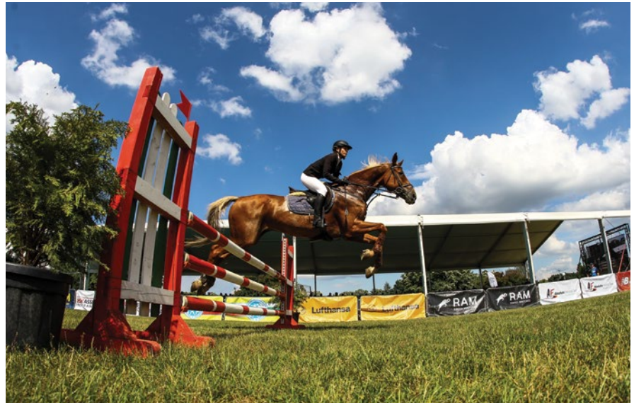
A good clearance under beautiful blue skies in Sofia (BUL)

himself to be one of the very best youth pentathletes in the world this season and Radziuk (BLR) was unable to prevent him from moving Egypt into the silver-medal position, albeit the pair raced each other right to the line.