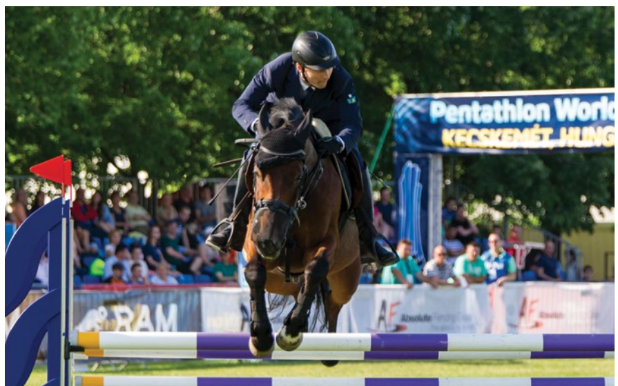
The crowd in Kecskemet (HUN) are enthralled by the Riding event