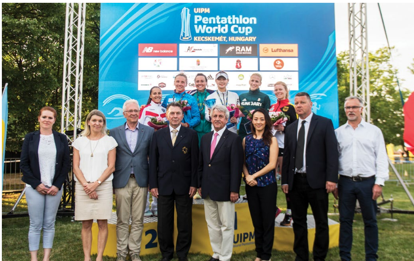
Women's Individual podium

Olympic champion Chloe Esposito of Australia secured another career first as she claimed her first Pentathlon World Cup gold medal after a dramatic Laser-Run comeback.