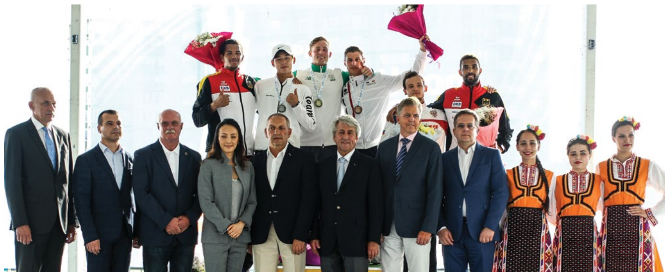
Men's Individual podium