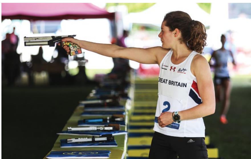
Kate French (GBR) shoots on her way to victory