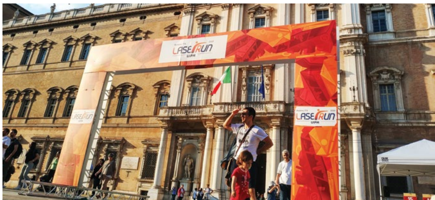
1st picture: The historic city of Modena plays host to Italy's first Global Laser-Run City Tour

The Global Laser-Run City Tour took place in parks, stadiums and iconic urban venues in 60 cities around the world in 2017, with more than 15,000 participants. There are about 100 events scheduled in 2018.