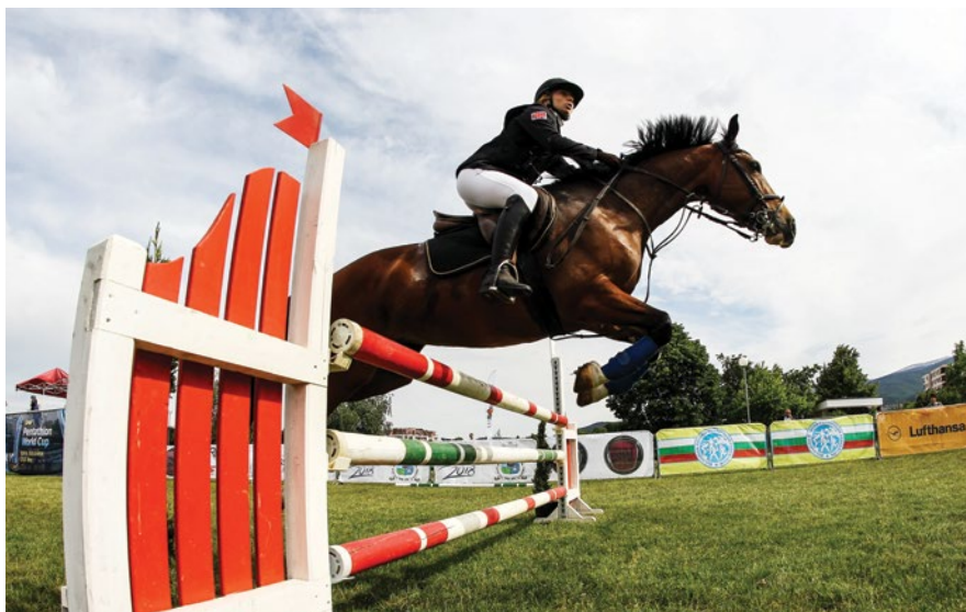
An impressive clearance during the Riding discipline