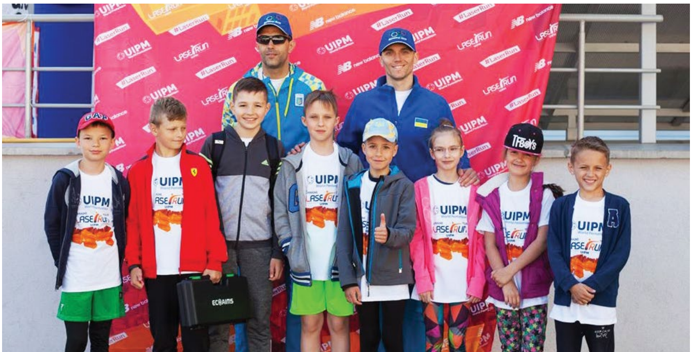
Children enjoy their Laser-Run experience in Kiev (UKR)

"It was a very dynamic and exciting competition and you could see that this sport is open to everybody. I would like to thanks the many participants, coaches, Local Organising Committee and to the UIPM for their great support and positive emotions."