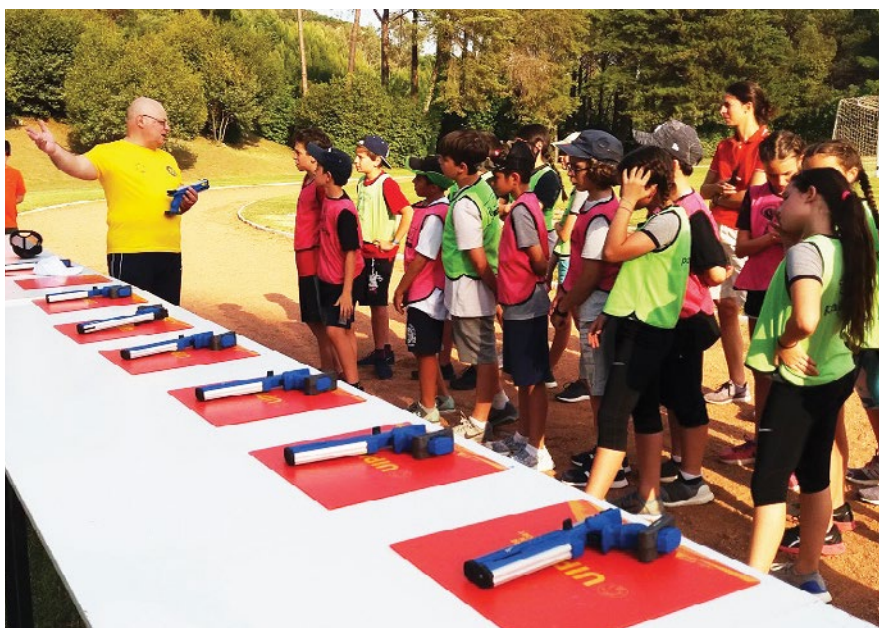
Youth athletes receive instruction in Rostov-on-Don (RUS)