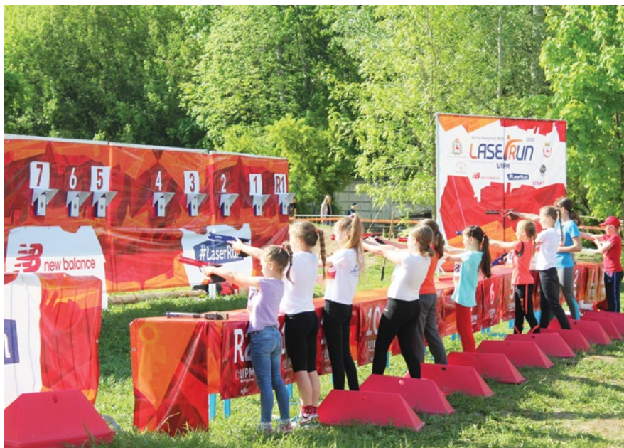
Children of all ages take aim in Nizhny Novgorod (RUS)

"I know that the organizers of this tournament are very professional and I am sure that they demonstrate the highest level of these competitions to the MP community."