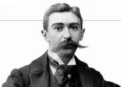
Baron Pierre de Coubertin

"The Modern Pentathlon event would test a man's moral qualities as much as his physical resources and skills, producing thereby the ideal, complete athlete."