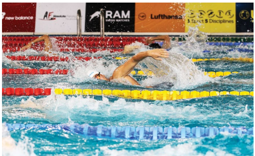
Action from the Swimming in Sofia (BUL)