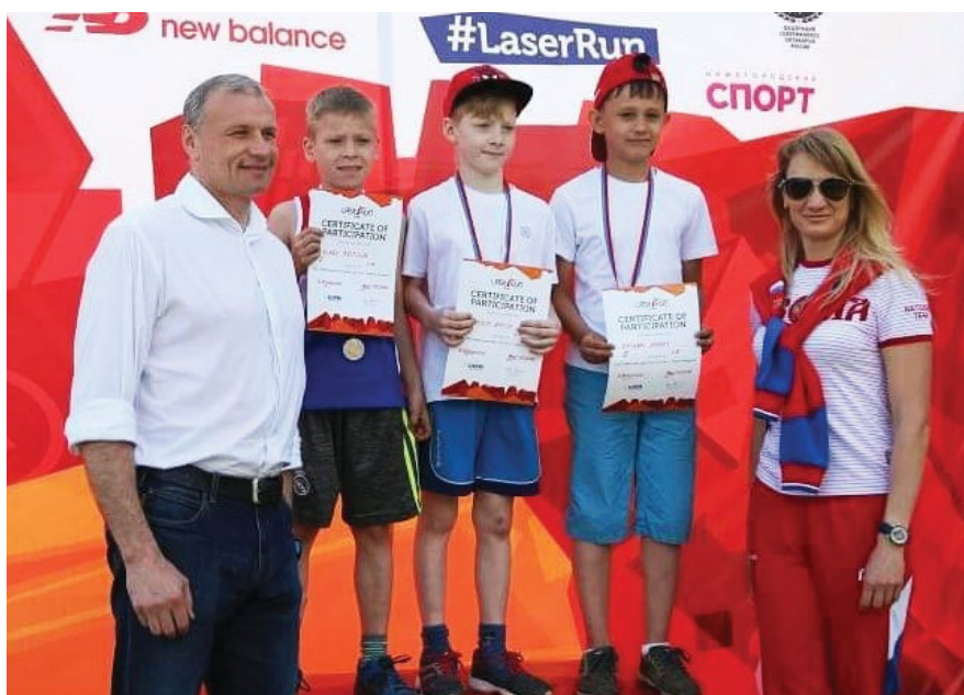
Sydney 2000 Olympic Modern Pentathlon champion Dmitry Svatkovsky (RUS) with youth winners