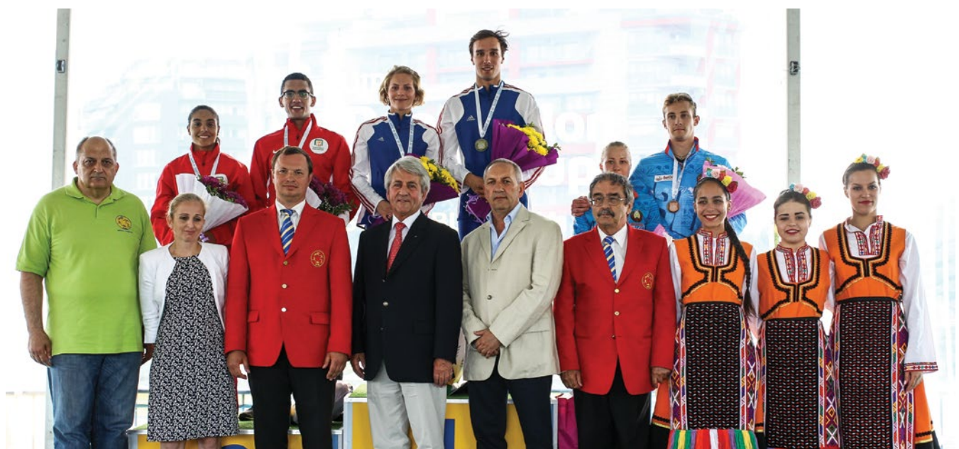
Mixed Relay podium