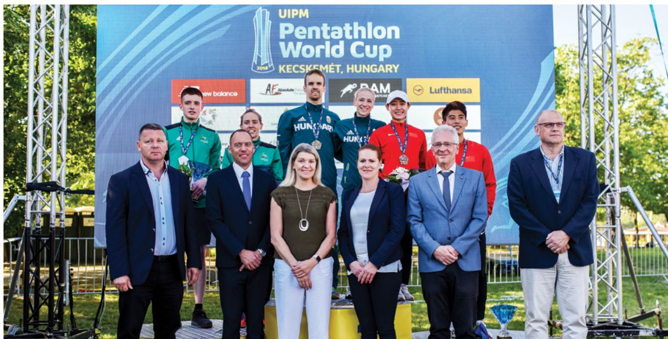
Mixed Relay podium