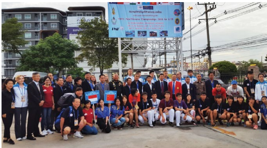
A group photograph of Under 19 participants in Chonburi (THA)

UIPM is fully committed to the fight against doping and the promotion of clean sport and clean athletes.