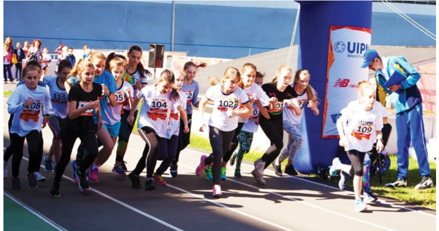
Laser-Runners on the start line in Kiev (UKR)

The surge in popularity of the Global Laser-Run City Tour was underlined in Kiev, Ukraine, on May 12