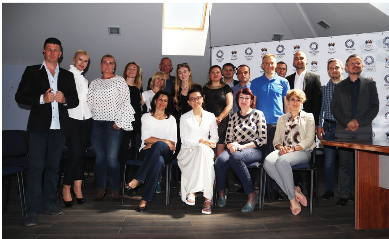
The newly-qualified UIPM Level 1 coaches in Moldova