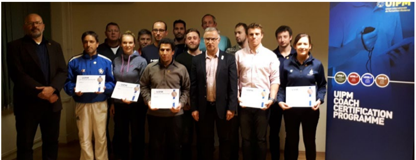
Coaches with their certificates at the first Level 3 coaches course in Hungary

"In addition, the presence of speakers from academia and the Hungarian Anti-Doping Agency brought light to fundamental matters of the coaches' professional lives."