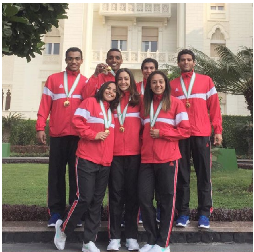
Egyptian athletes show off their medals of honour

The other sports represented at the ceremony were weightlifting, judo, wrestling, fencing, swimming, taekwondo, squash, karate, kung fu and two Paralympic sports, weightlifting and swimming.