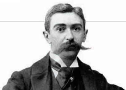
Baron Pierre de Coubertin

"The Modern Pentathlon event would test a man's moral qualities as much as his physical resources and skills, producing thereby the ideal, complete athlete."