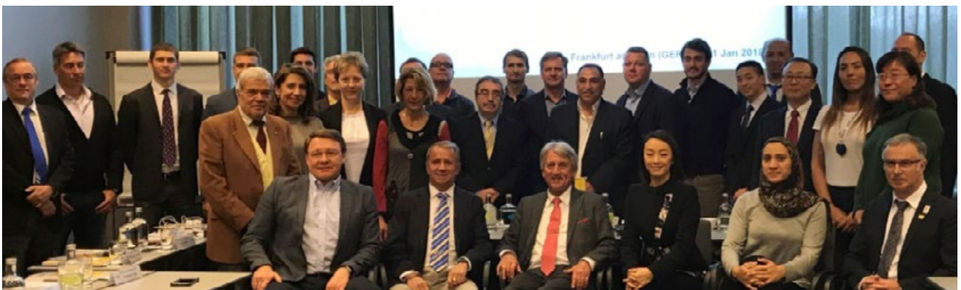
The UIPM Athletes' Committee, Technical Committee and Coaches Committee join forces in Frankfurt (GER)