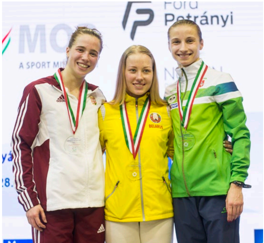
Women's individual podium at the 2018 Peridot Indoor Competition

Riding was held in the renovated National Horse Riding Hall, Swimming in the pool at Gerevich Aladár National Sports Hall and Laser-Run in the BOK Sports Hall.