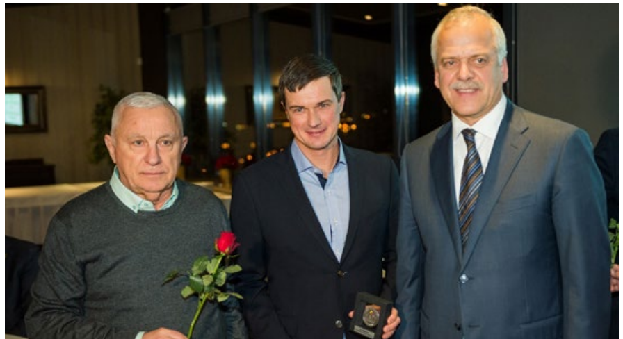
UIPM Executive Board Member Andrejus Zadneprovskis and Viacheslav Kalininas of the Lithuania Modern Pentathlon Federation receive their award

This year's competition was unique in that it was promoted as a preparatory event for the 2018 South American (ODESUR) Games, which will also take place in Cochamba.