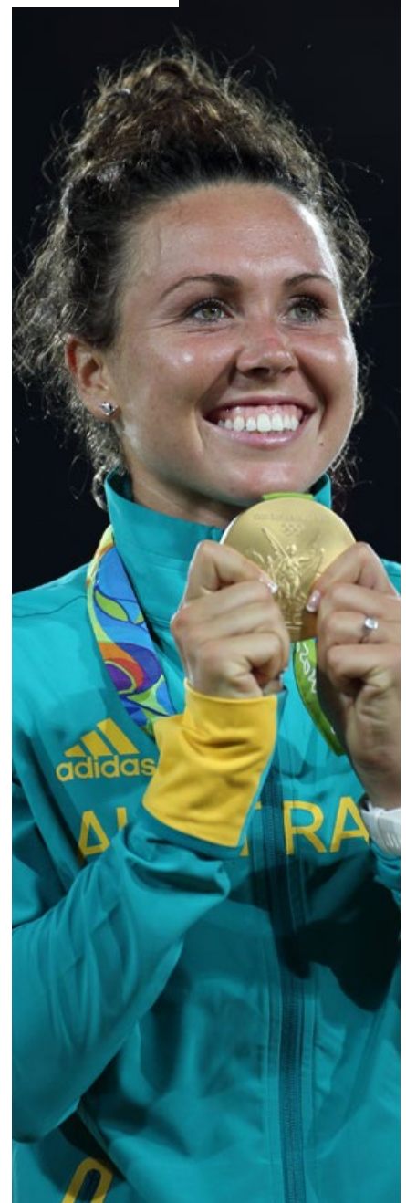
Rio 2016 Olympic gold medallist Chloe Esposito (AUS)