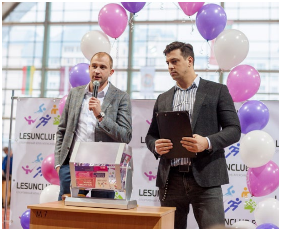
Alexander Lesun speaks at the opening of his new sports club, the Lesun Club, in Minsk (BLR)

Lesun (RUS) added the crowning glory of Olympic gold in 2016 to a glittering pentathlon CV. He was already the holder of two individual World Championship gold medals and four silver medals.