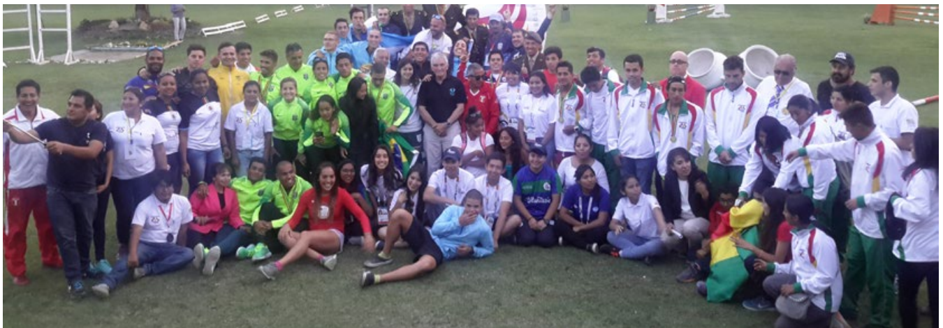
Participants in the South American Championships in Cochamba (BOL)

The 2017 World Cup Final - which stood out for heroic performances by athletes, large crowds and extensive media coverage - was already recognised with the Best Overall Competition prize in the 2017 UIPM Awards.